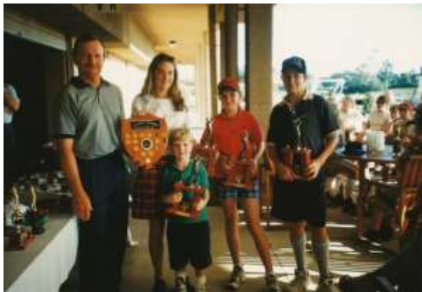
1998 Indooroopilly juniors Xmas break-up: