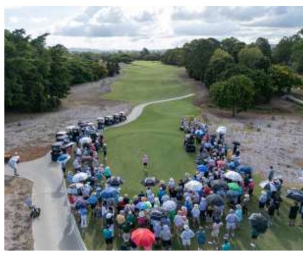
Teeing off on the 6^{th}