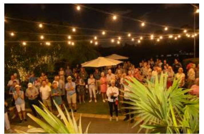
Grand finish to the grand opening!