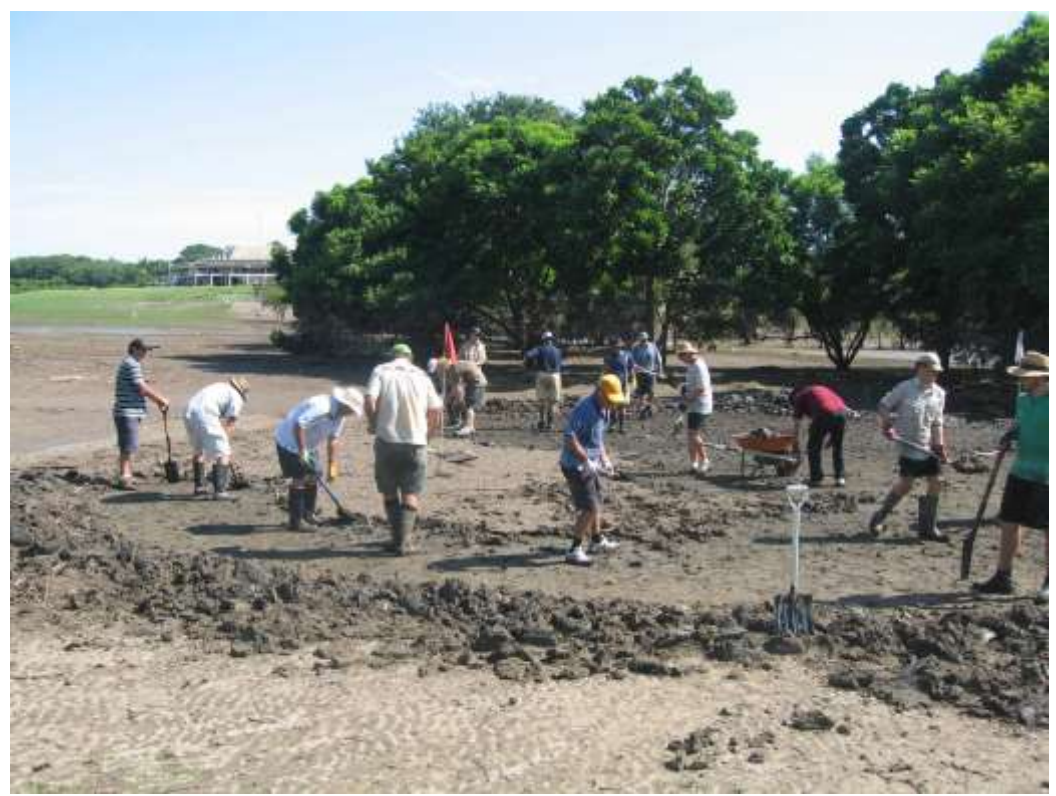
Some of the Mud Army of member volunteers clearing mud from practice green