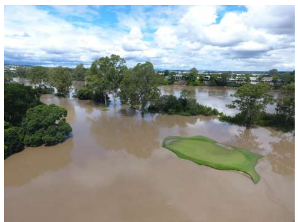
The Brisbane River inundated Gold #3