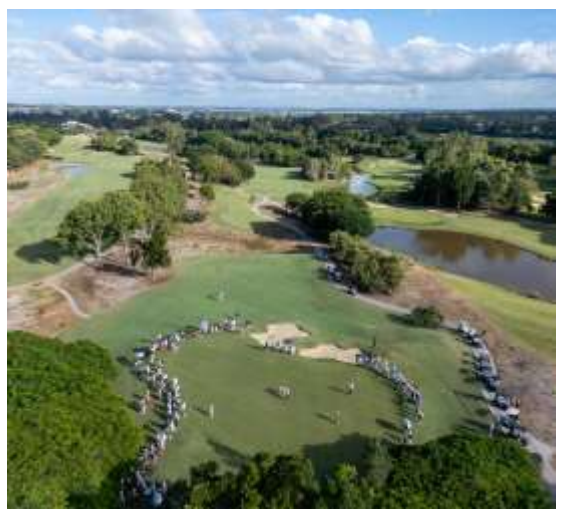
2<sup>nd</sup> hole in foreground