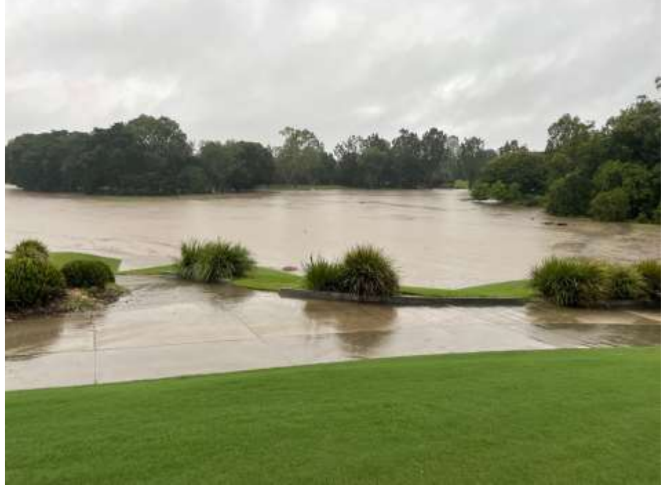
Standing at the top of cart path from Gold #9 looking towards Red #9