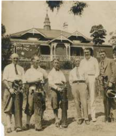
The founding fathers in front of old Morrow home