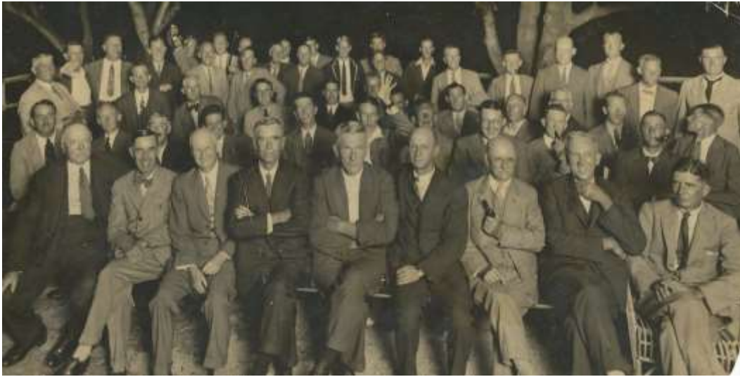
A formidable gathering of members at an early AGM – as viewed from the committee table

New balls were in short supply and expensive. The pro shop had a steel stamp which imprinted members' names on their ball. A "find" by a caddie was worth three pence from the pro who then reconditioned the ball and the owner could buy it back for sixpence.