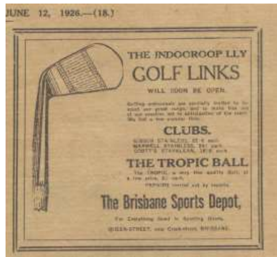
A cutting from early newspaper announcing the opening of the Indooroopilly Golf Links

On Saturday 3 July 1926 the first nine holes were opened by the Premier of Queensland, the Hon. W McCormick. Celebrations continued well into the night, with members bringing their own gas lamps to light up the clubhouse after dark.