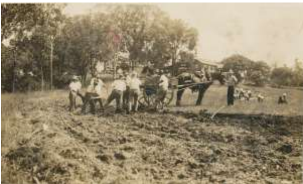
A Club working bee in their Sunday best -1926

An interesting aside is the fact that at the end of the first year the 319 members comprised 175 women and 146 men.