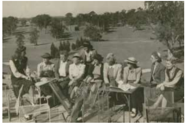
Another meeting of players and delegates at the same tournament