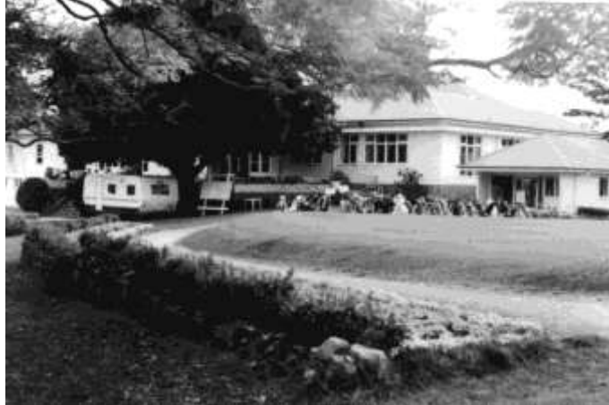
The St Lucia clubhouse and pro shop as it appeared in the 1970's

Fears that the Council was planning to resume part of the St Lucia course for road development led to members agreeing in 1973 to exchange that course and clubhouse for 200 acres of freehold land adjoining the existing Long Pocket layout. St Lucia was to become a public course under Council control and the Club would build another 18 holes at Long Pocket with a new clubhouse. It would be twelve years before the transition was made (Refer Long Pocket – The Move section).