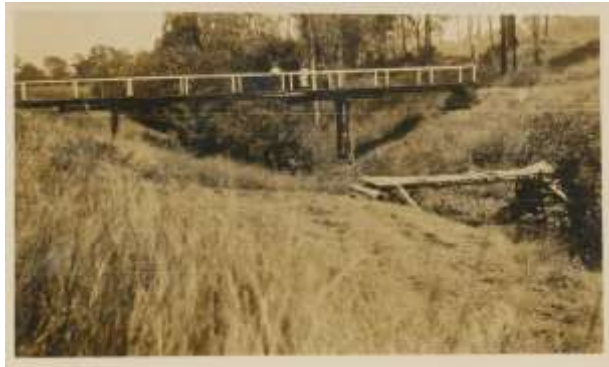
A new bridge over the third was constructed in 1931