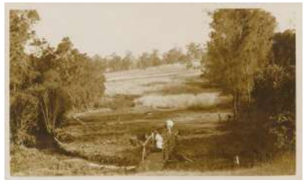
1920's working bee building bridge on the 8 th .