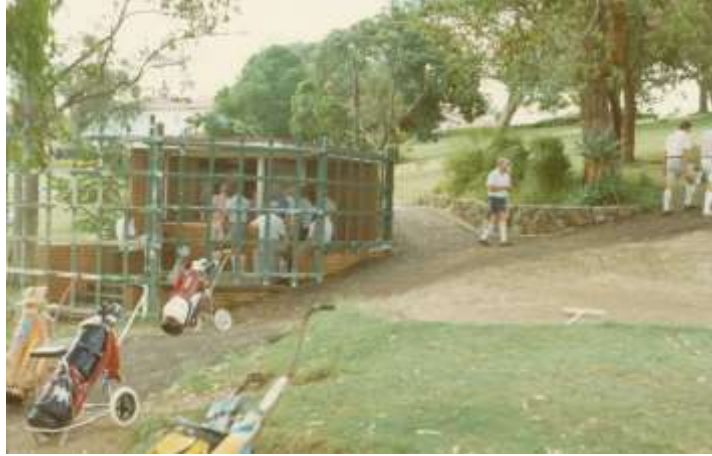
Half-way house at St Lucia – a welcome stop for refreshments