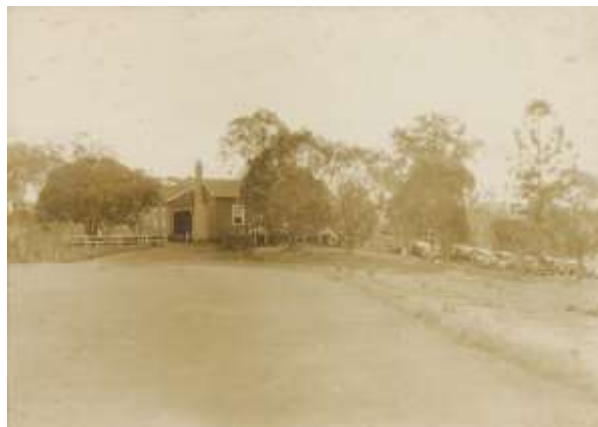
The first clubhouse and car park

On Saturday 3 July 1926 the first nine holes were opened by the Premier of Queensland, the Hon. W McCormick. Celebrations continued well into the night, with members bringing their own gas lamps to light up the clubhouse after dark.