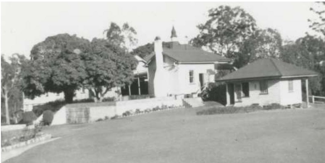
The St Lucia clubhouse and pro shop as it was in the 1930's