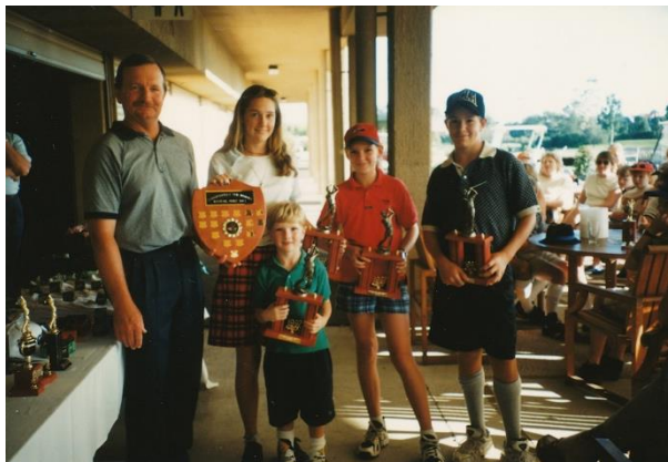
1998 Indooroopilly juniors Xmas break-up: