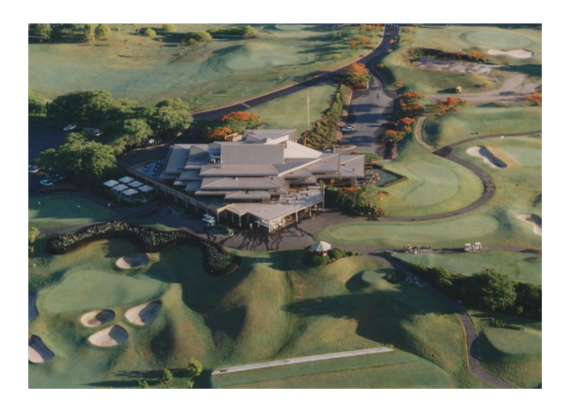
Aerial view of the clubhouse early morning December 1994

It is interesting to note in the photograph on the right that it shows two features no longer visible on the landscape – the starter's box and the Tennyson power station.