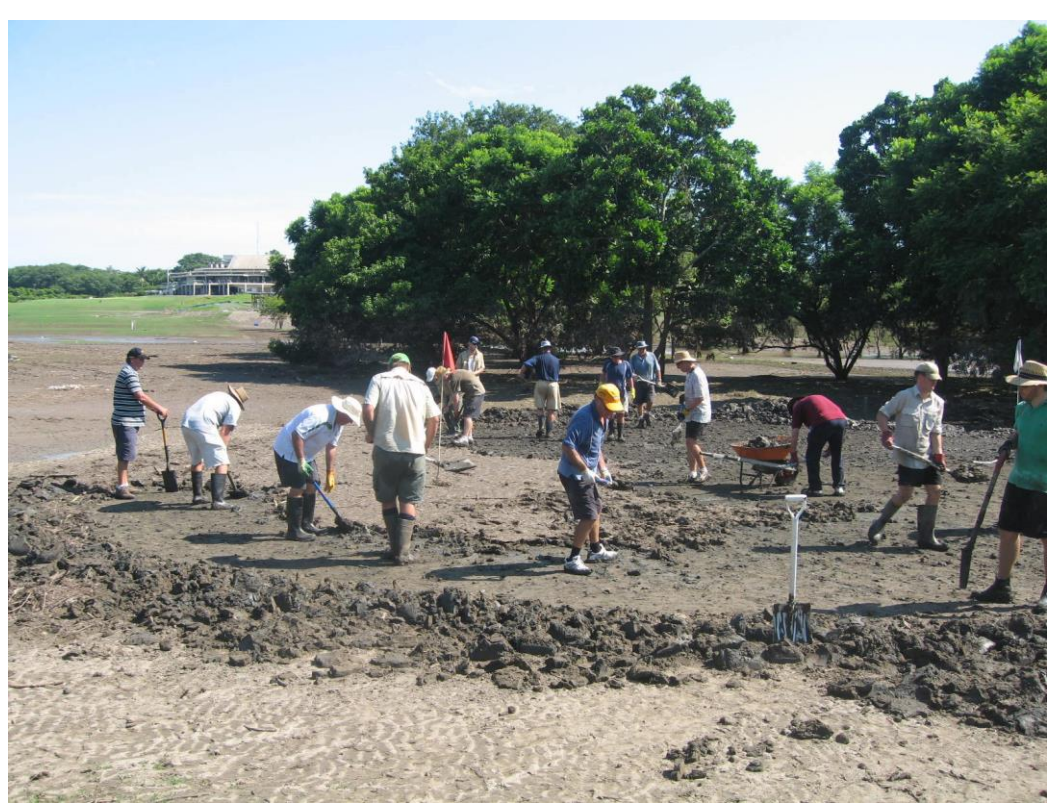
Some of the Mud Army of member volunteers clearing mud from practice green