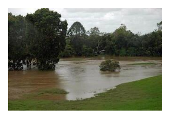
Red 5 with the flag just showing

As flood waters receded 10 cm of clay-based silt was left, spread over the vast majority of the courses. More than 200 members joined staff in working bees to save the grass on tees and greens by removing the mud. This was achieved in eight days and all 36 holes were back in play within two months.