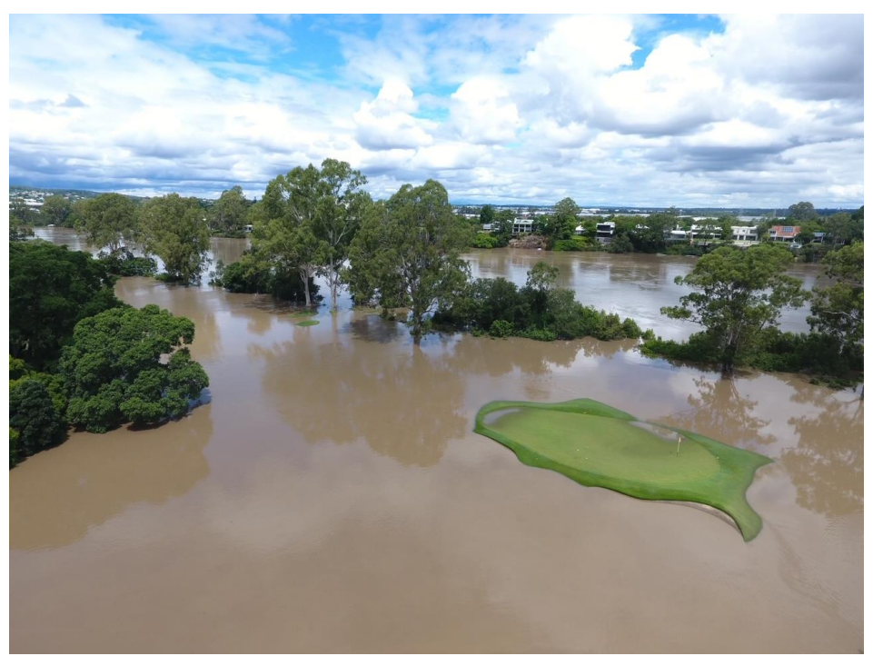
The Brisbane River inundated Gold #3