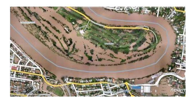
Aerial view showing extent of floodwaters

In January 2011 the Brisbane flood wreaked havoc on both courses. Eight and a half metres of floodwater resulted in a damages bill in excess of $1 million. Sixty percent of the East and West courses were inundated including seventeen greens on the West course.