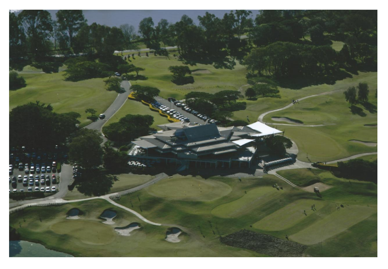
Clubhouse & surrounds June 2008

In accordance with the course master plan major changes to the West Course commenced in September 2006. A major benefit of this redesign was an increase from 25 megalitres to 75 megalitres in our water storage capacity.