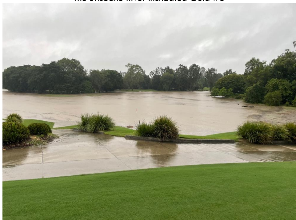
Standing at the top of cart path from Gold #9 looking towards Red #9