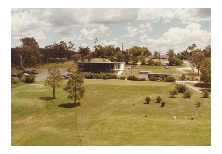
The original Long Pocket clubhouse in the late 1960's

The new course allowed a considerable number of new members from the waiting list to be absorbed and the Club could also comfortably handle the Council tender provision, which provided for the public to play there eight hours a week. It also allowed a Business Girls Group to obtain a block of Saturday morning tee times.