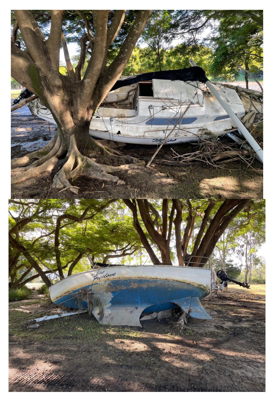
The 10 metre sailing boat "Miss Freelove" came to rest near the green of Blue #2.