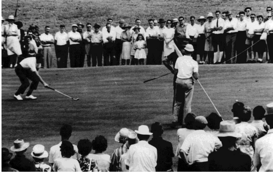
Bruce Devlin lines up a putt during the 1963 Queensland Open