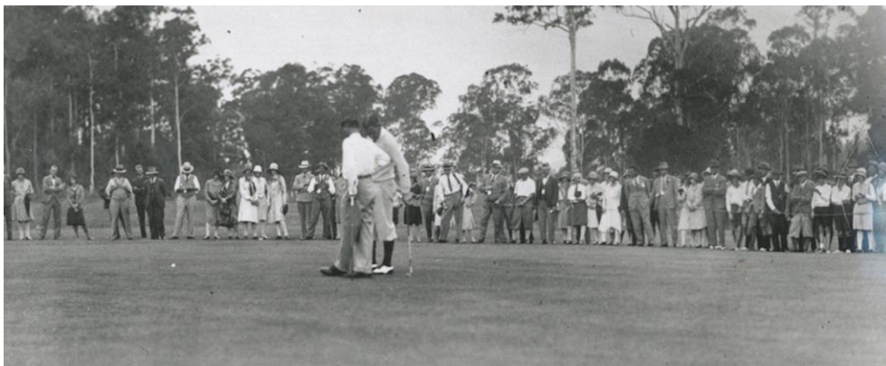
The gallery watch the Hagen and Kirkwood match