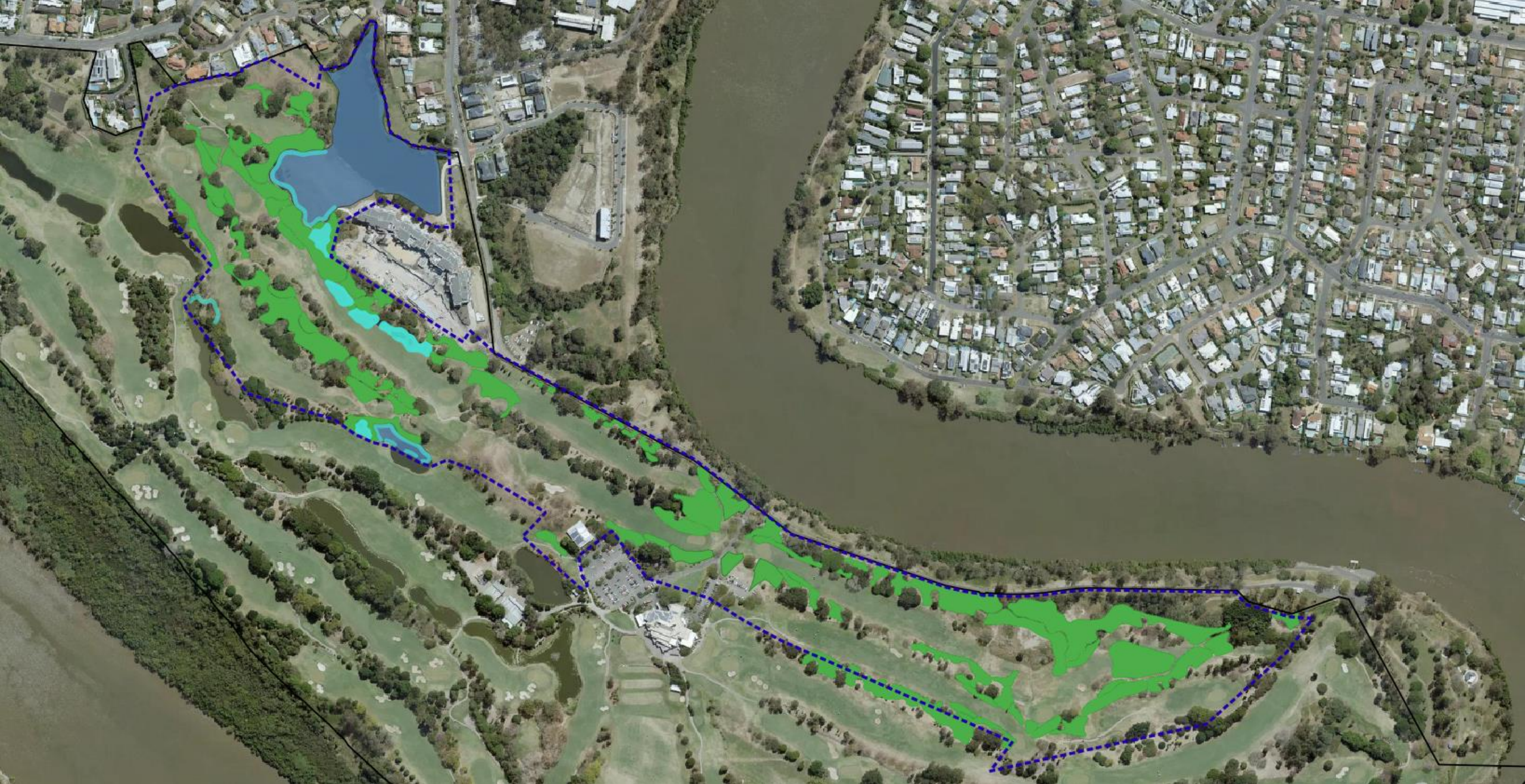
Green Loop Landscape Works 2930 new trees