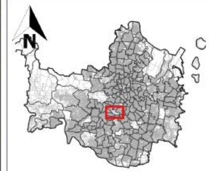
Location of the site within the Brisbane City LGA