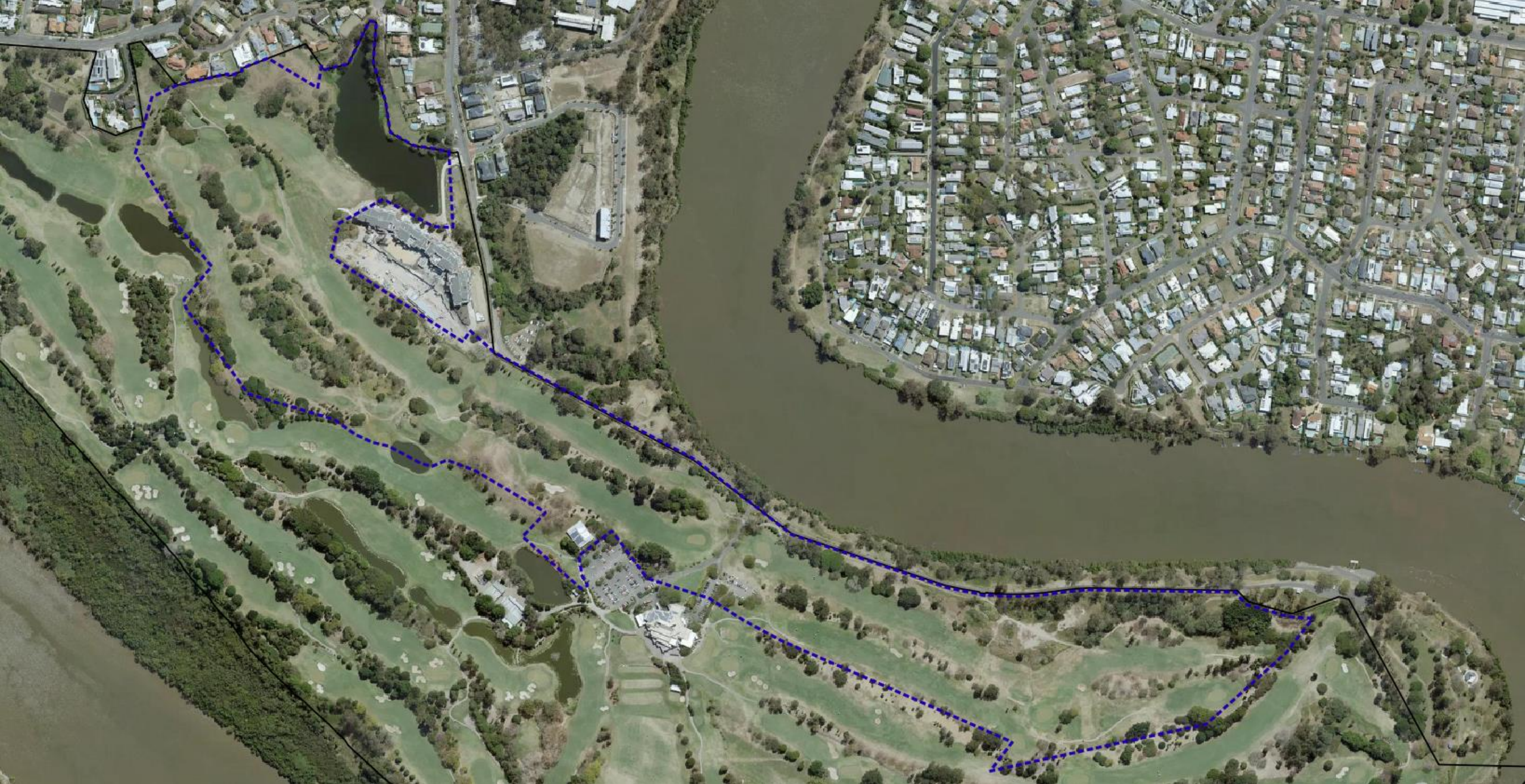
Current Tree Cover 2022