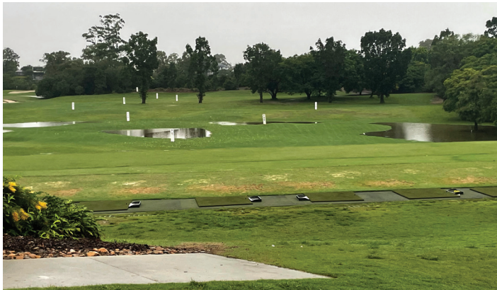
● Above: Flooded existing driving range.

In response to Member concerns about the relocated driving range and shade structure obscuring views from the Poinciana Bar terrace towards the East, our clubhouse architects, Ellivo, have provided a sketch of the indicative view line. The drawing shows the foreground view of the new putting green and retention of longer views over the driving range due to the much lower existing ground level at the driving range hitting bay location.