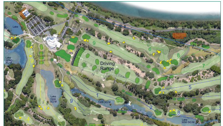
● Above: August 2021 Driving Range and Practice facilities plan.

The current driving range land shifts to water storage, stormwater mitigation, a new feature hole to start the Gold Loop and grand vista from the clubhouse towards the south. The relocated driving range occupies the former tip site land, a location better suited to lighting without impacting on residents across the river. Lighting allows convenient access to all Members, especially the growing number of working Members and students.