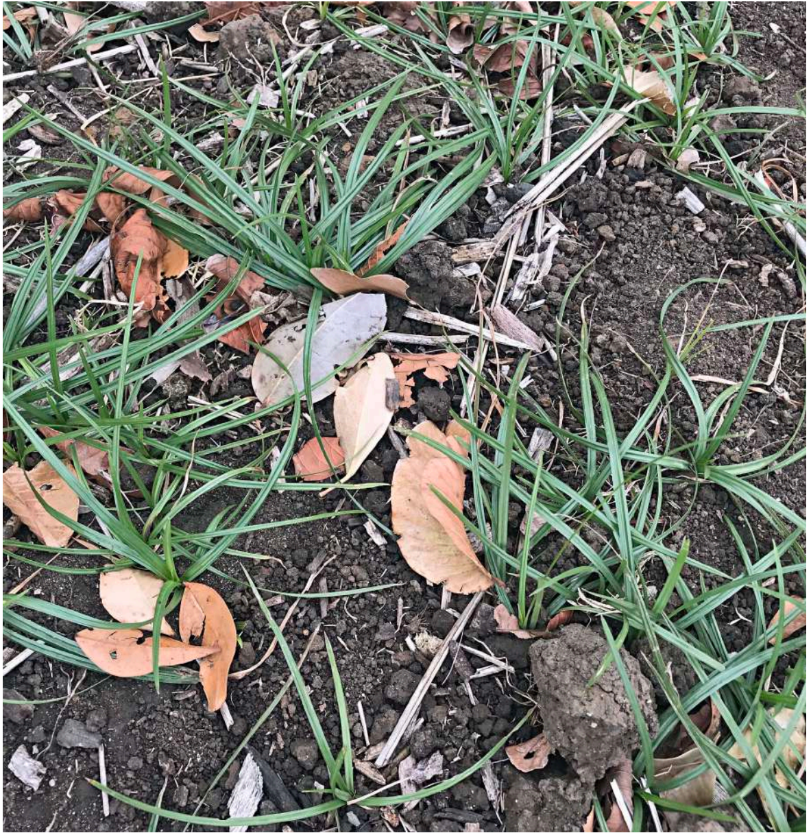
Nutgrass ( Cyperus rotundus ) This African weed is abundant in gardens and turf areas.