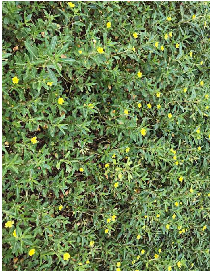
Water Primrose ( Ludwigia peploides ) This attractive South American aquatic weed can nevertheless choke waterways and displace native species. A flower close-up is provided below.