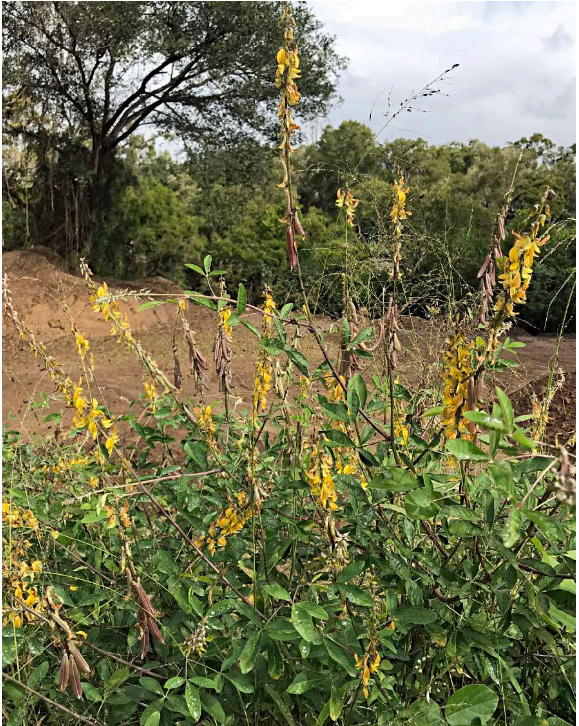
Rattlepod ( Crotalaria lanceolata ) This Southern African small shrub was observed growing along the riverbank on the LHS of Red 5.