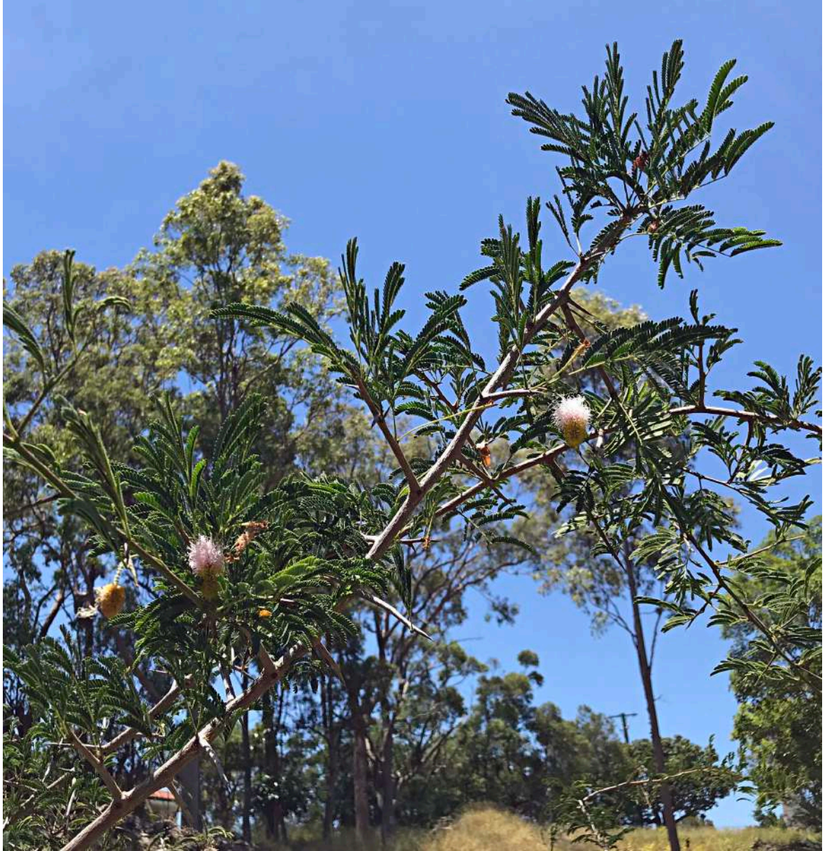
Prickly Acacia ( Vachellia nilotica ) This tall African shrub has only been observed in the Meiers Road car park.