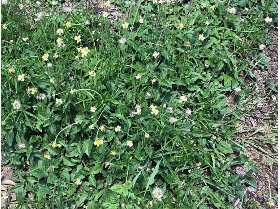
Tridax Daisy ( Tridax procumbens ) This herbaceous weed with white/cream daisy flowers was observed among some Grevillea shrubs on the LHS of Gold 4 fairway.