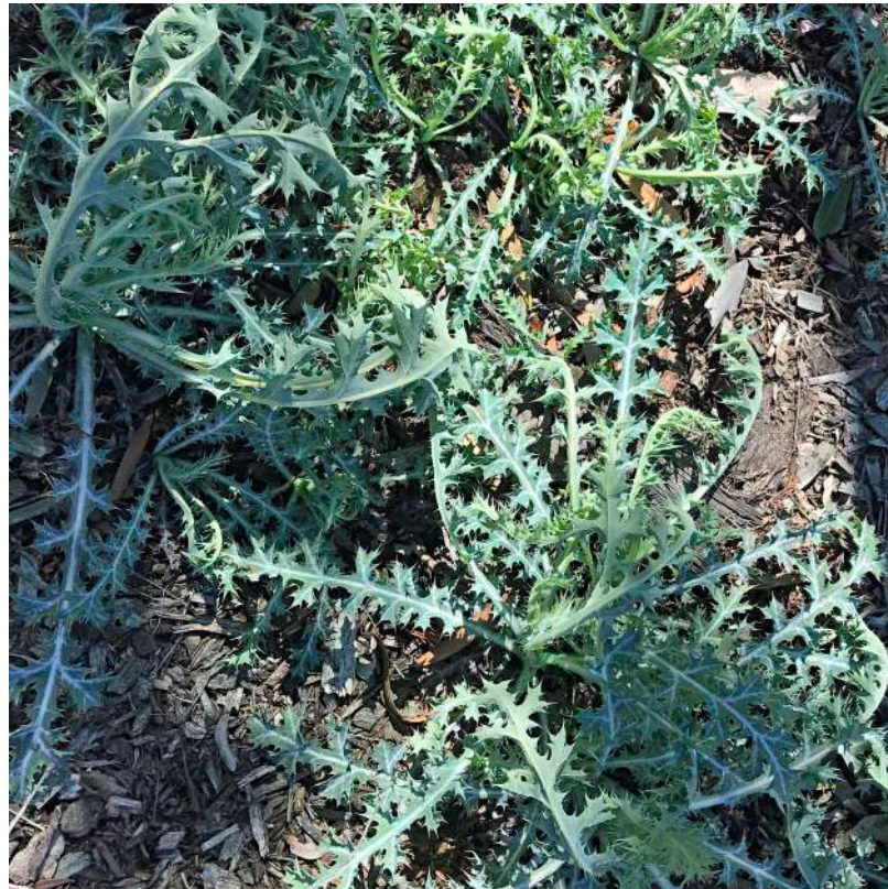
Spear Thistle ( Cirsium vulgare ) This widespread herbaceous weed was observed as a group of young plants on the RHS of Blue 2 along the drain, and flowering (below) on the RHS of the Red 7 men's tee-block.