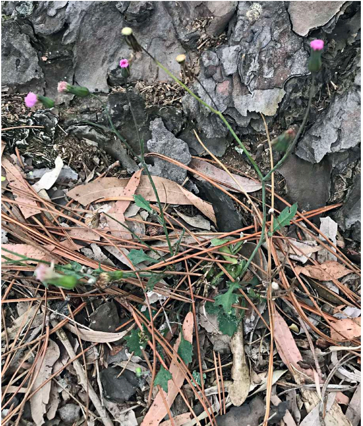
Tasselflower ( Emilia sonchifolia ) This Asian herb was observed at the base of a Slash Pine on Red 5.