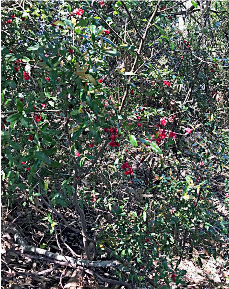
Ochna ( Ochna serrulata ) This introduced Southern African shrub is a potentially noxious weed and was recently observed along the Riverbank on LHS Gold 3 tee-blocks. A flower close-up is provided below.