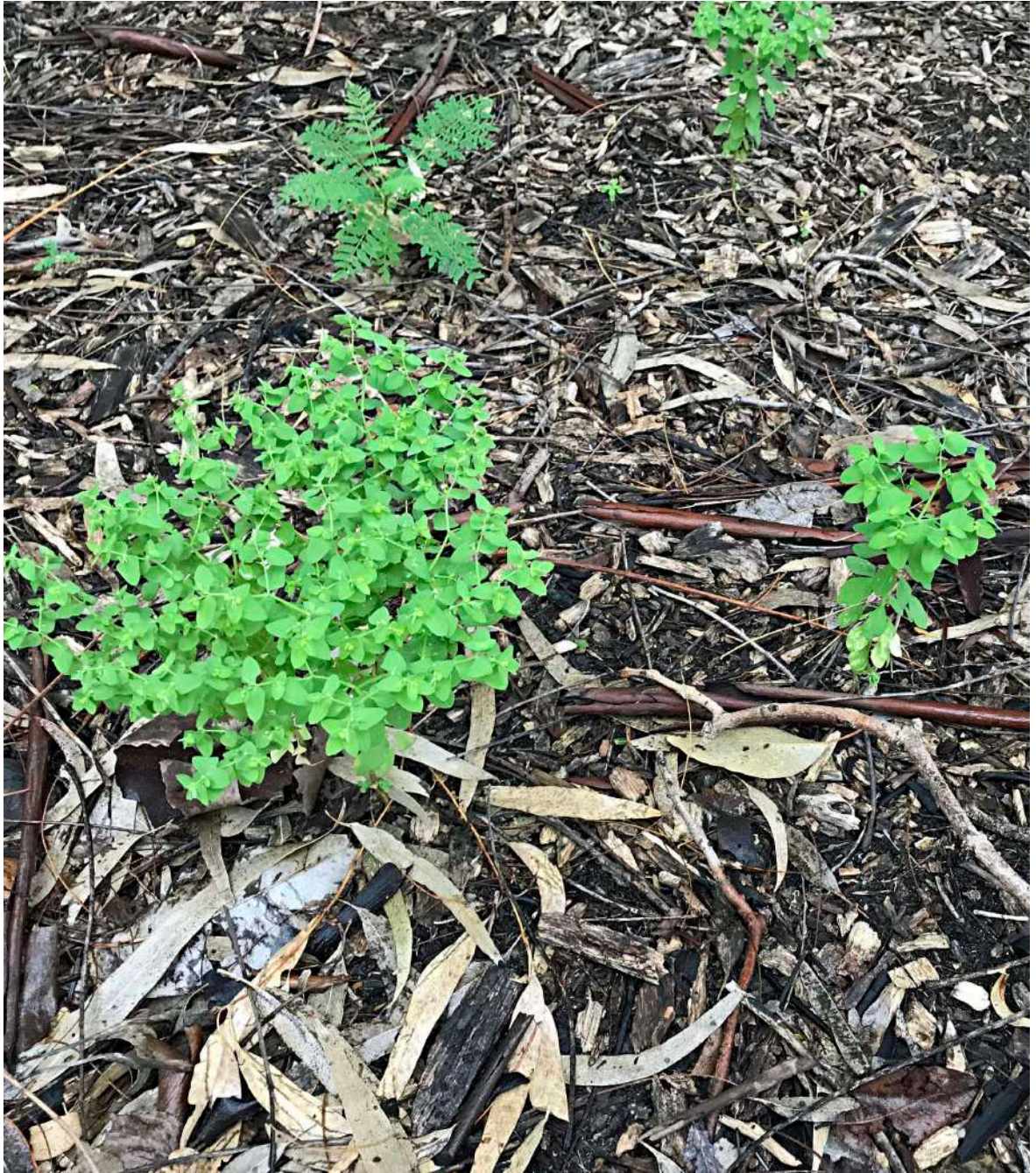
Petty Spurge ( Euphorbia peplus ) This small European annual herbaceous weed is only observed in the garden to the LHS of the Blue 3 tee-blocks during winter-spring. An extract from this species has been used in removing skin cancers.