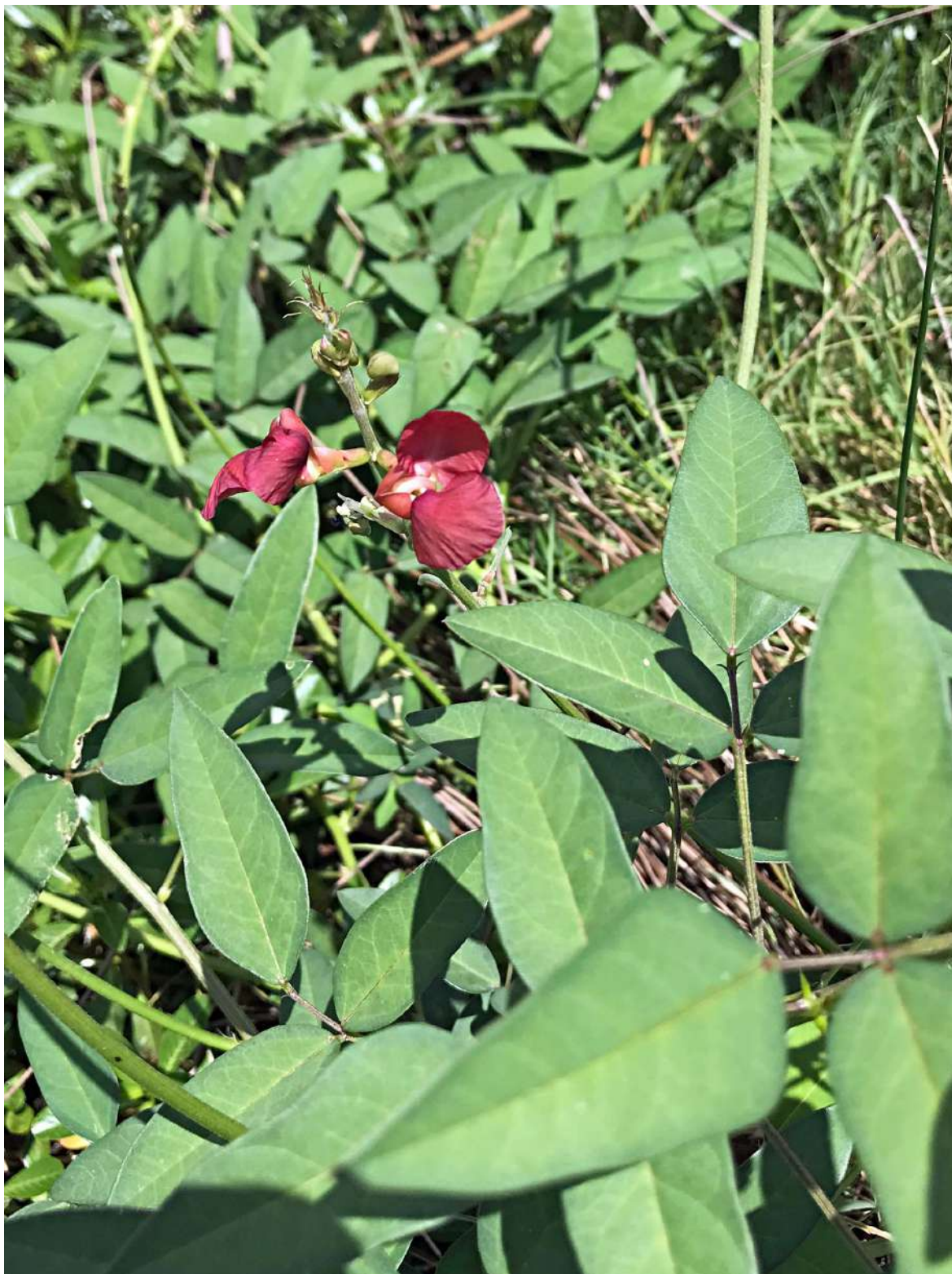
Phasey Bean ( Macrotium lathyroides ) This Central American herbaceous weed is a legume introduced for fodder but widely naturalised. This specimen was recorded next to the pond on LHS Red 7 fairway.