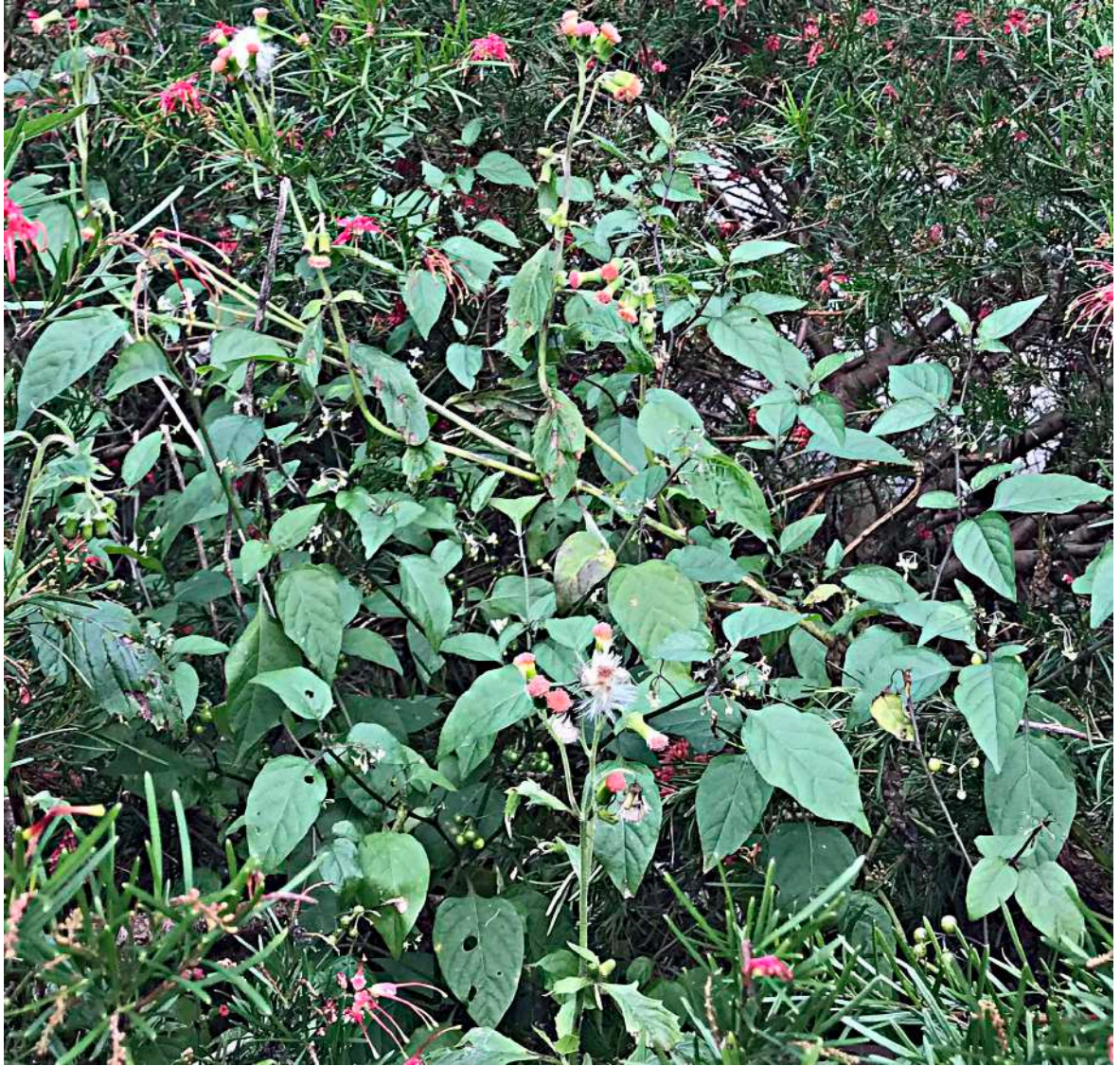
Thickhead ( Crassocephalum crepidioides ) This herbaceous weed with pink daisy flowers was observed among some Grevillea shrubs on the RHS of Red 2 men's tee-block.