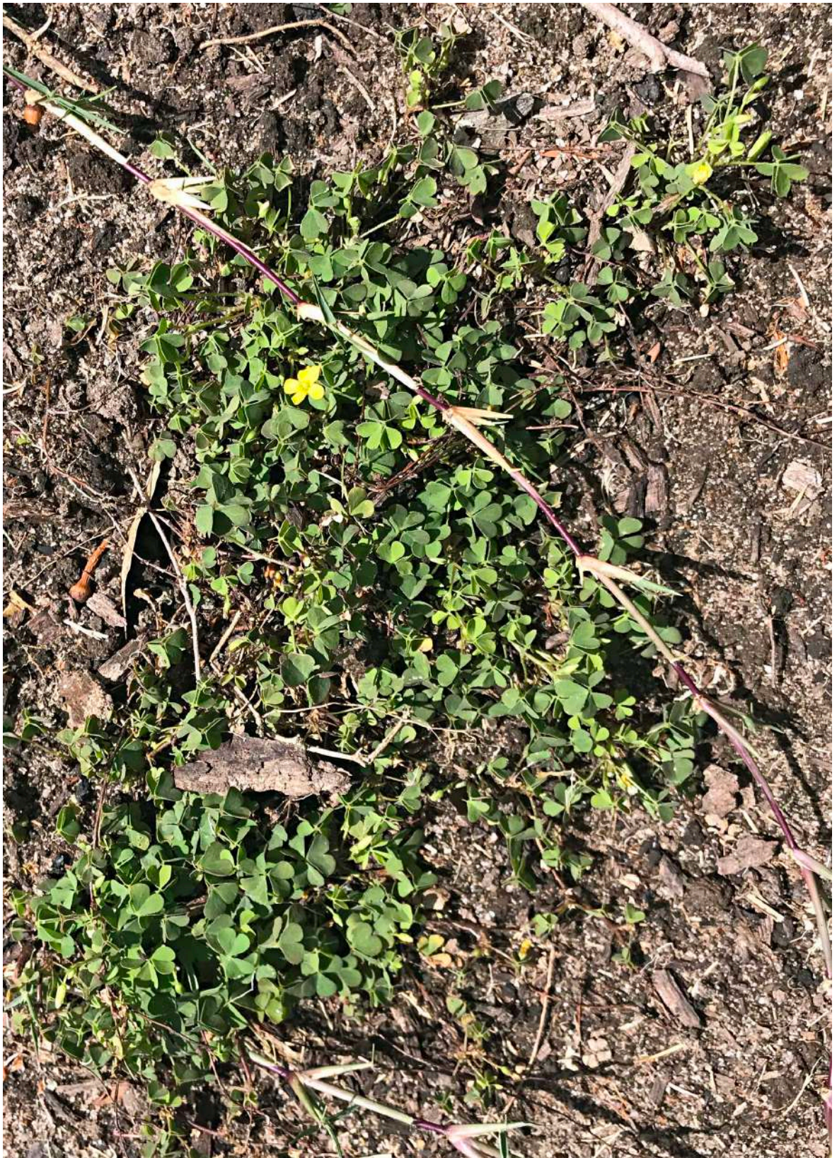
Soursob ( Oxalis pes-caprae ) This South African herb was observed in garden beds on the Gold mine.