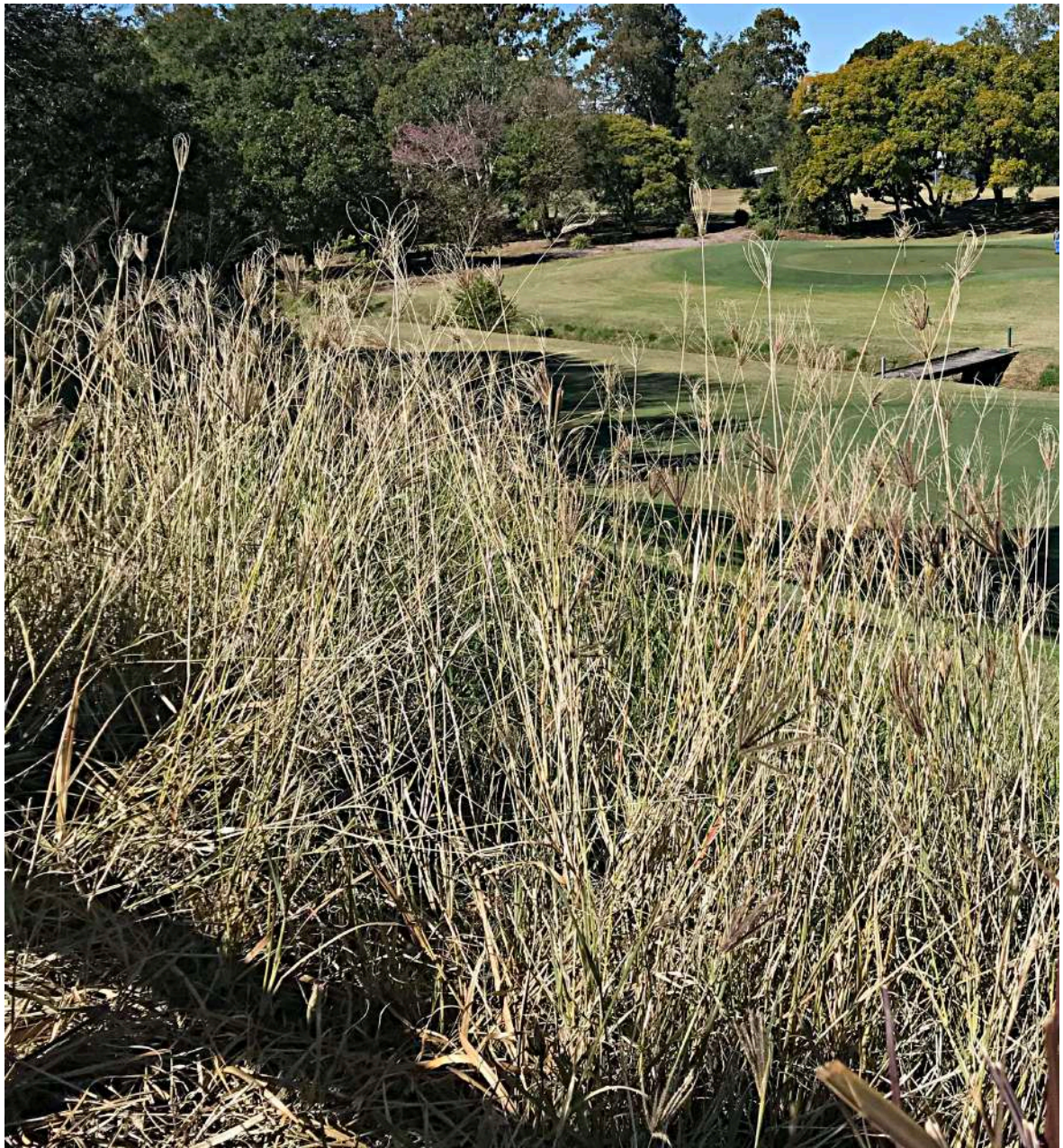
Rhodes Grass ( Chloris gayana ) This clumping Southern African grass was observed on the RHS of the Blue 6 men's tee-block, above the Blue 5 green.