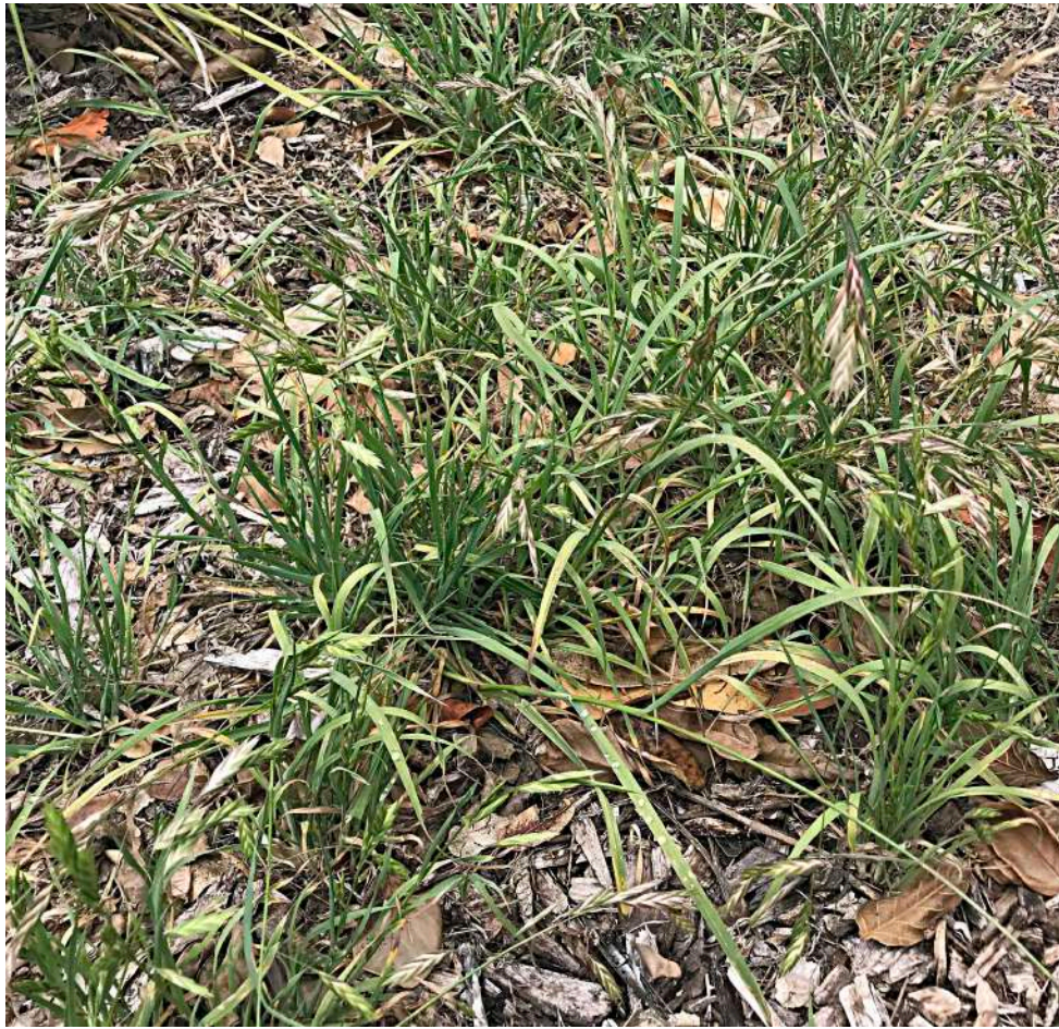
Prairie Grass ( Bromus catharticus ) This low South American grass has only been observed in the Gold nine garden areas.