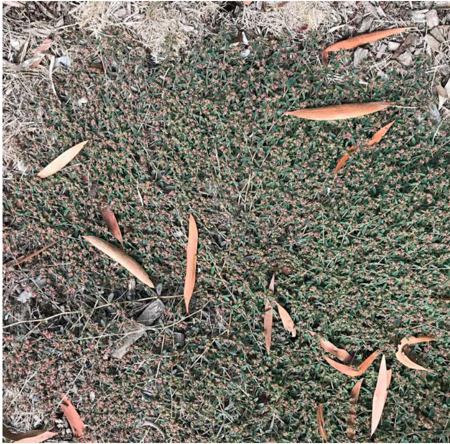
Red Caustic Weed ( Chamaesyce prostrata ) This prostrate Mediterranean herb (with close-up below) occurs in some garden areas and has a toxic milky sap.