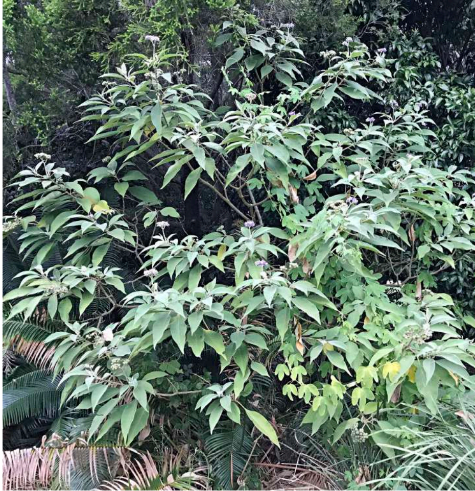
Wild Tobacco ( Solanum mauritianum ) This shrubby weed was observed on the LHS of Gold 8 men's tee-block, with flower close-up below .