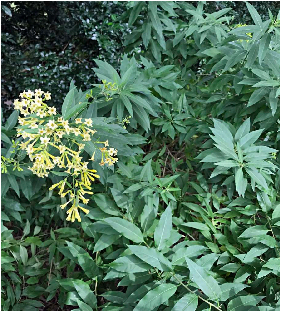
Green Cestrum ( Cestrum parqui ) This introduced Tropical American shrub is an occasional weed growing in garden areas near Gold 9 tee-block.