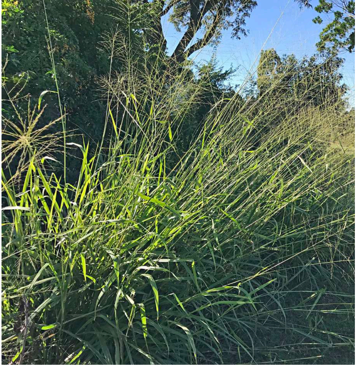
Guinea Grass or Green Panic ( Megathyrsus maximus ) This introduced tall African grass is an occasional weed growing in garden areas near Red 6 and 7.