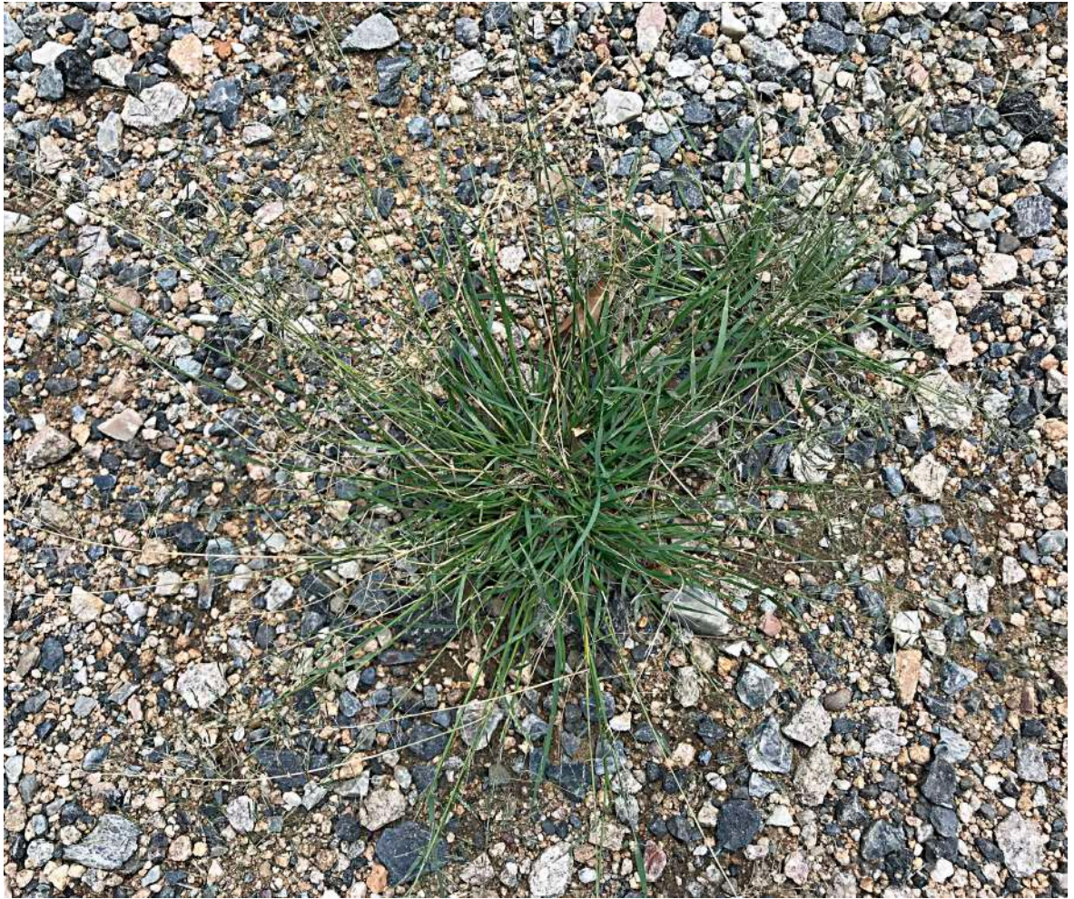
Elastic Grass ( Eragrostis tenuifolia ) This introduced African grass weed is low-growing and occasional along pathways and in turf areas.