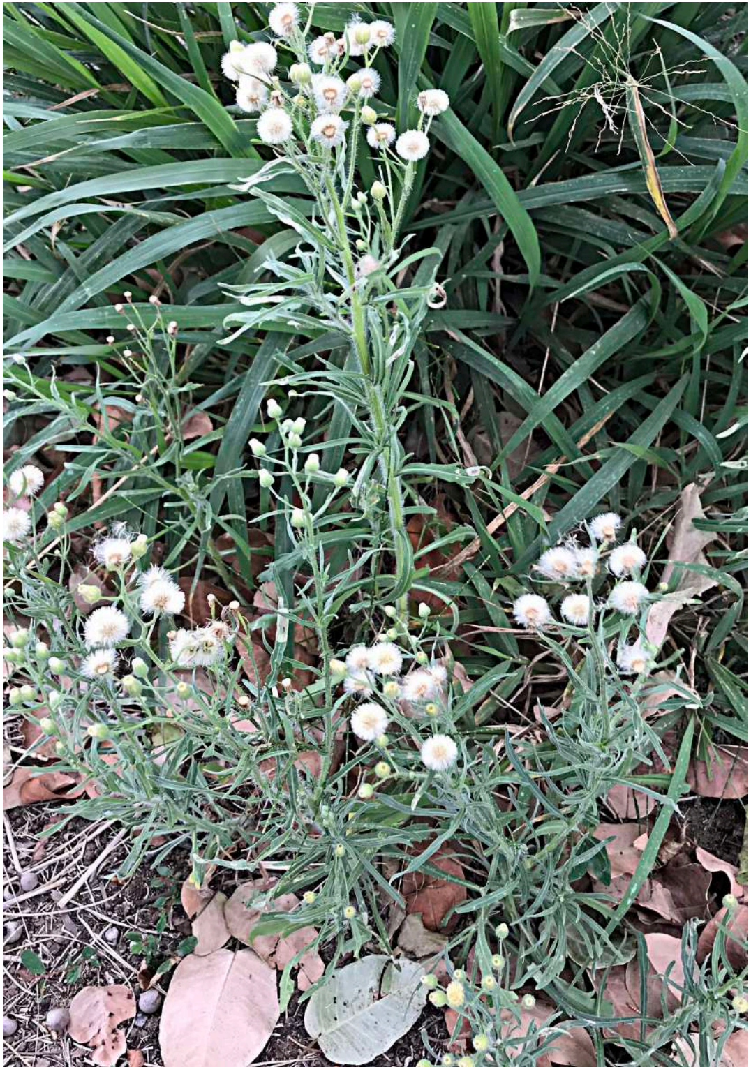
Flaxleaf Fleabane ( Conyza bonariensis ) This pan-tropical herb produces many seeds that are wind-dispersed and is widespread across our site.