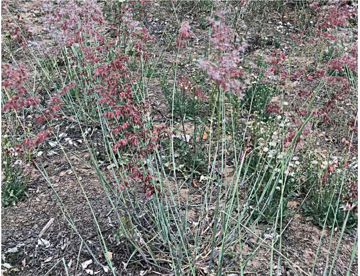
Molasses Grass ( Melinis minutiflora ) This medium African grass was observed on the LHS of Gold 4, with a characteristic pink flower head.