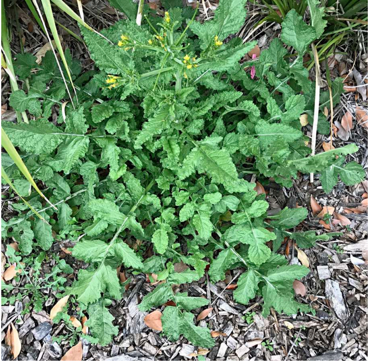
Indian Mustard ( Brassica x juncea ) This aromatic herb was observed in garden beds on the Red nine.