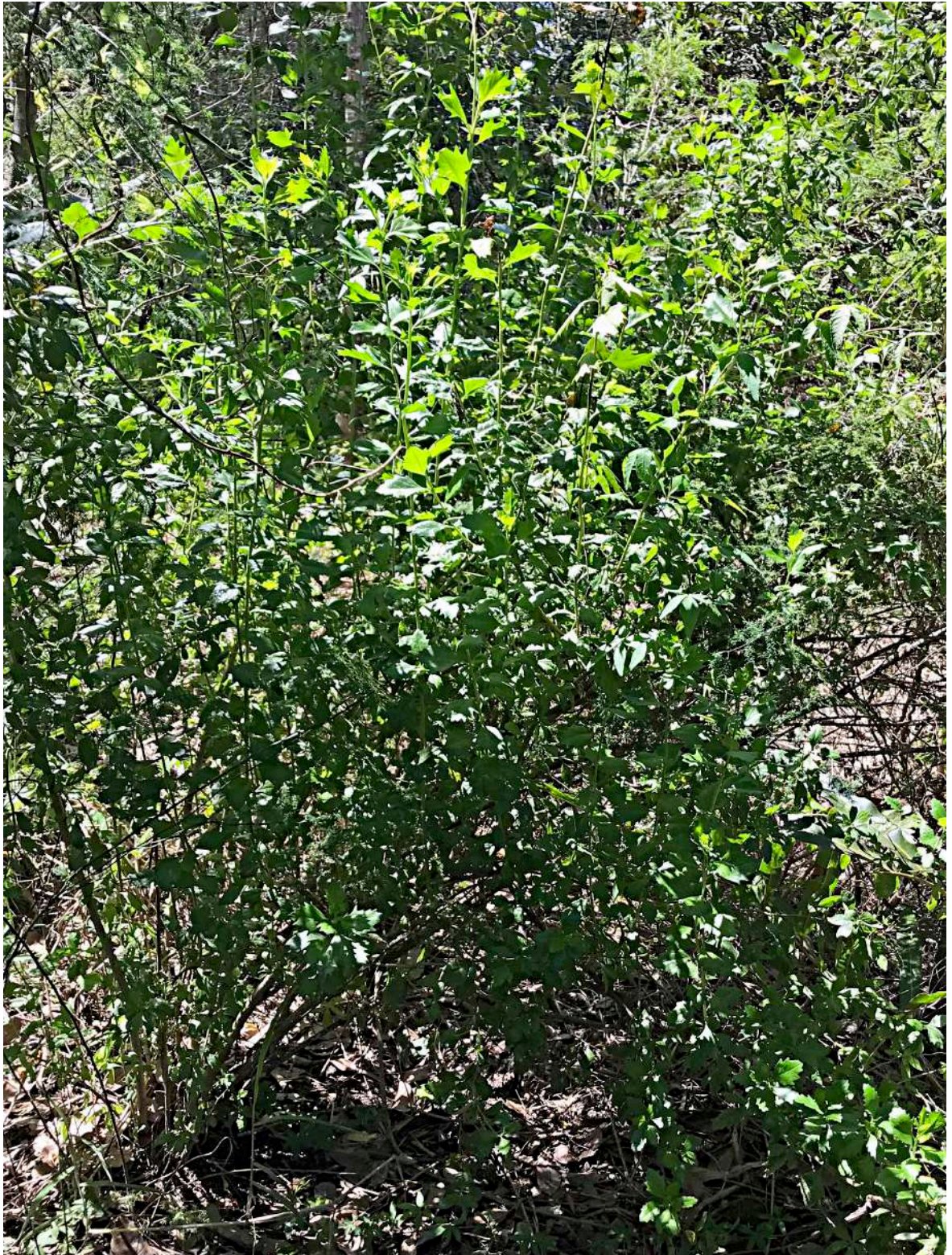
Groundsel Bush ( Baccharis halimifolia ) This introduced American shrub was removed (extirpated) from the RHS of Green 8 fairway but recently observed along the Riverbank.