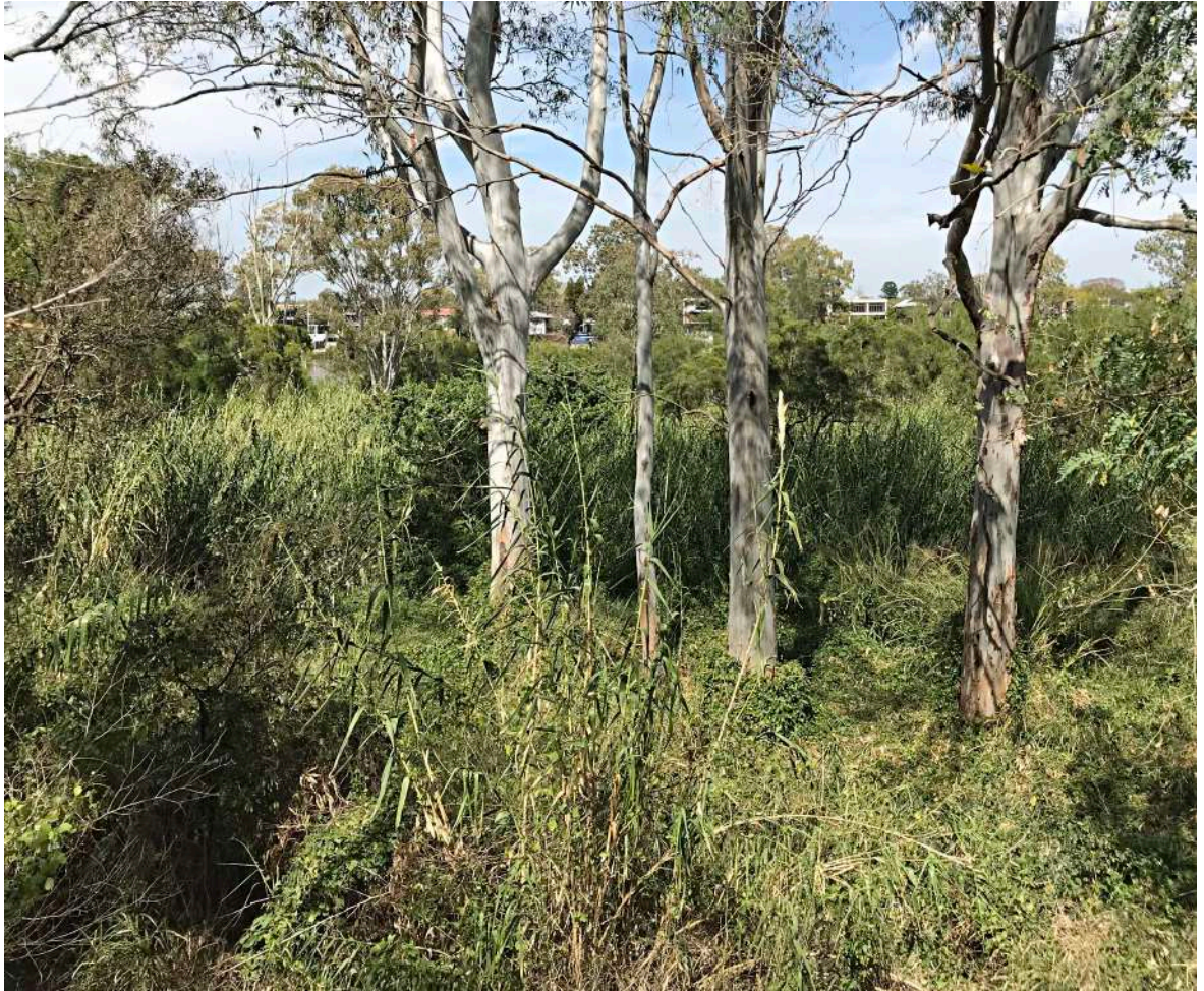
Giant Reed ( Arundo donax ) This very tall grass is a prominent weed along the banks of the Brisbane River, including Indooroopilly Island, with close-up of leaves below.