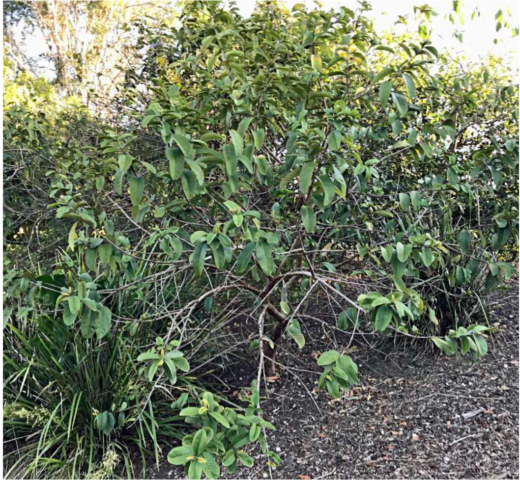
Guava ( Psidium guajava ) This introduced Asian shrub or small tree can be observed in various garden areas including on the LHS Red 9 tee-blocks. A close-up of leaves & flowers (Summer) is provided below.