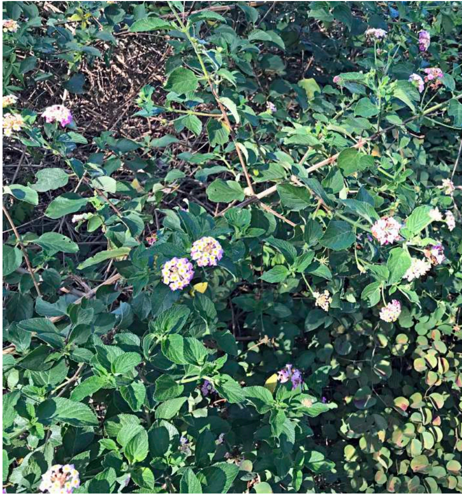
Lantana ( Lantana camara ) This pan-tropical shrubby weed was observed among other shrubs in the Maintenance Facility screening, with flower close-up below.