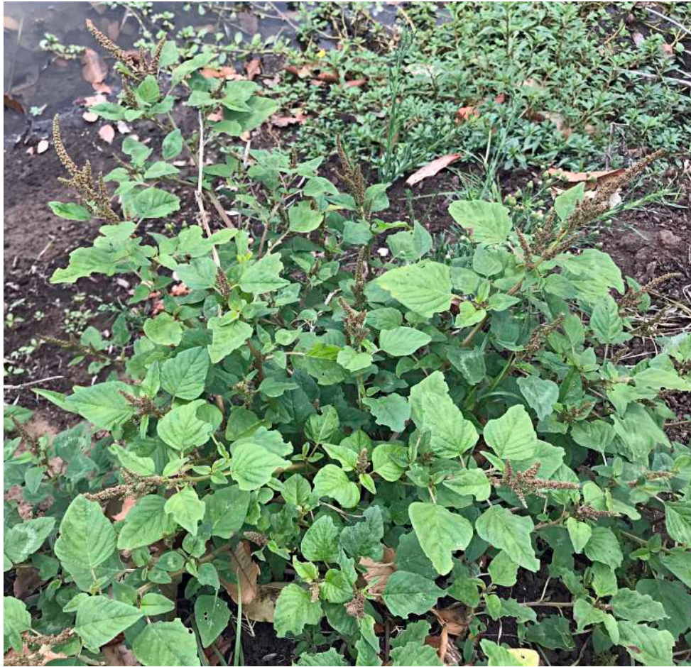
Green Amaranth ( Amaranthus viridis ) This Central American weed is often seen near ponds, with flower close-up below.