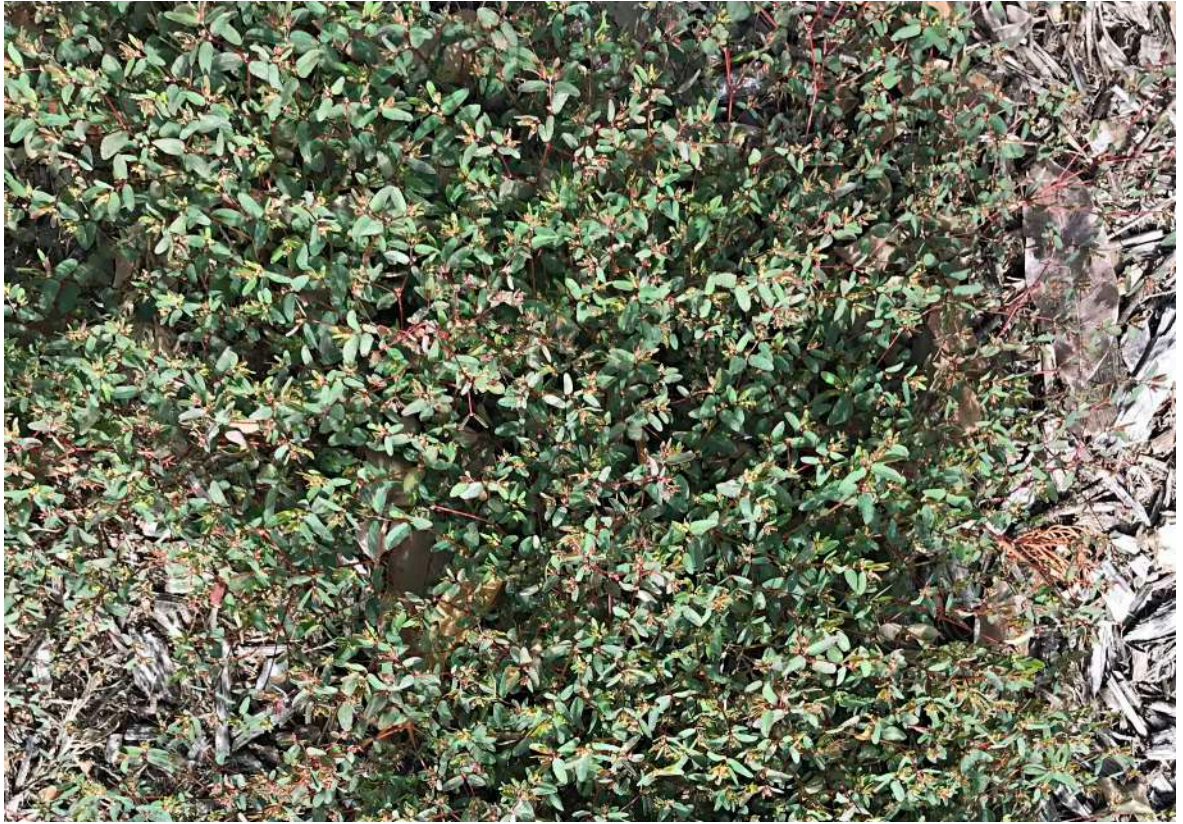
Hyssop Spurge ( Chamaesyce hyssopifolia ) This low-growing Mediterranean herb is an occasional weed growing in garden areas, with close-up below.