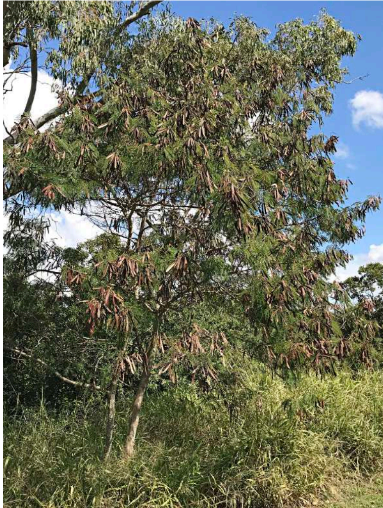
Leucaena ( Leucaena leucocephala ) This tall Central American shrub is an agricultural escape (cattle feed species) growing along the Riverbanks near Gold 3.