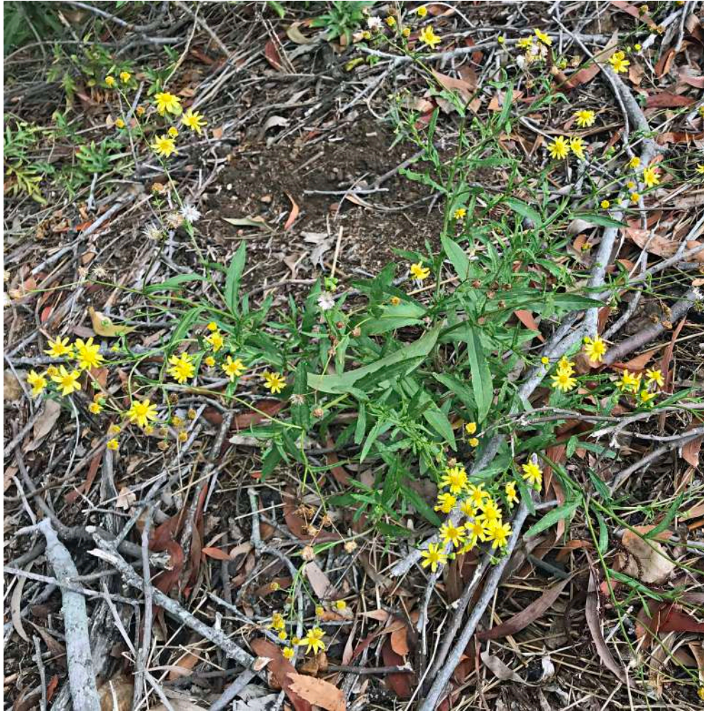
Fireweed ( Senecio madagascariensis ) A garden escape, the Madagascan Fireweeds can be seen in garden areas, with flower close-up below.