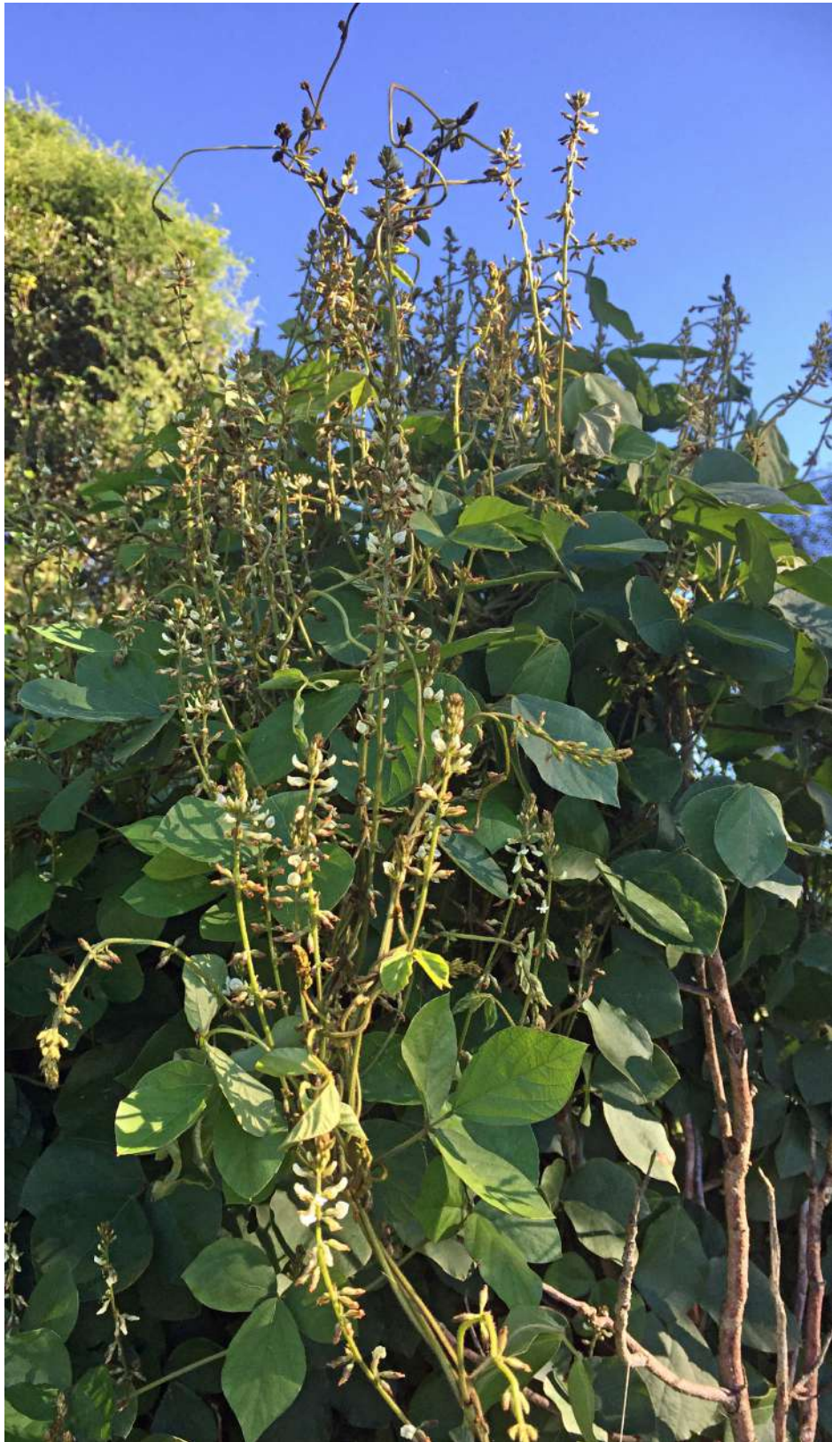
Glycine ( Neonotonia wightii ) This introduced Asian vine is a prominent weed growing on shrubs and small trees along the banks of the Brisbane River.