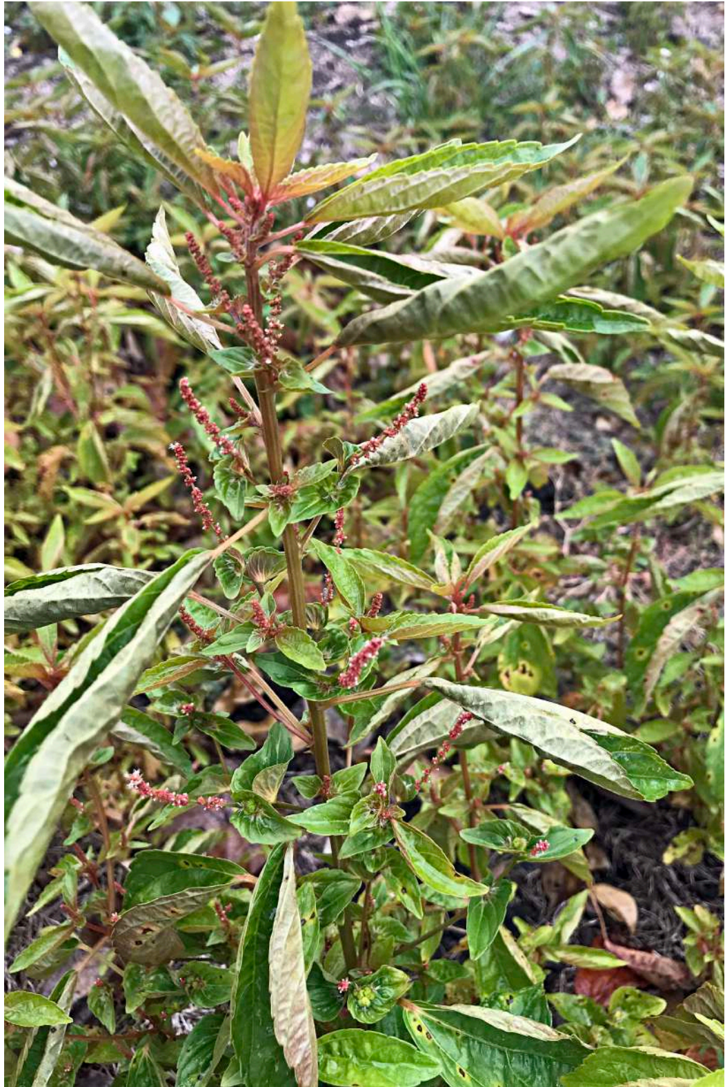
Inkweed ( Phytolacca octandra ) This toxic Central american herb was observed in garden beds on the Gold nine.