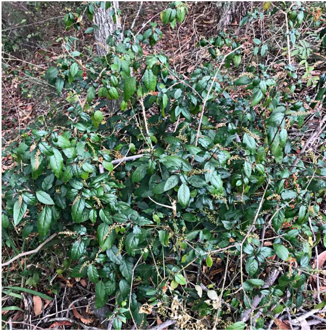
Coral Berry ( Rivina humilis ) This herbaceous weed is a common herbaceous weed in shaded areas.