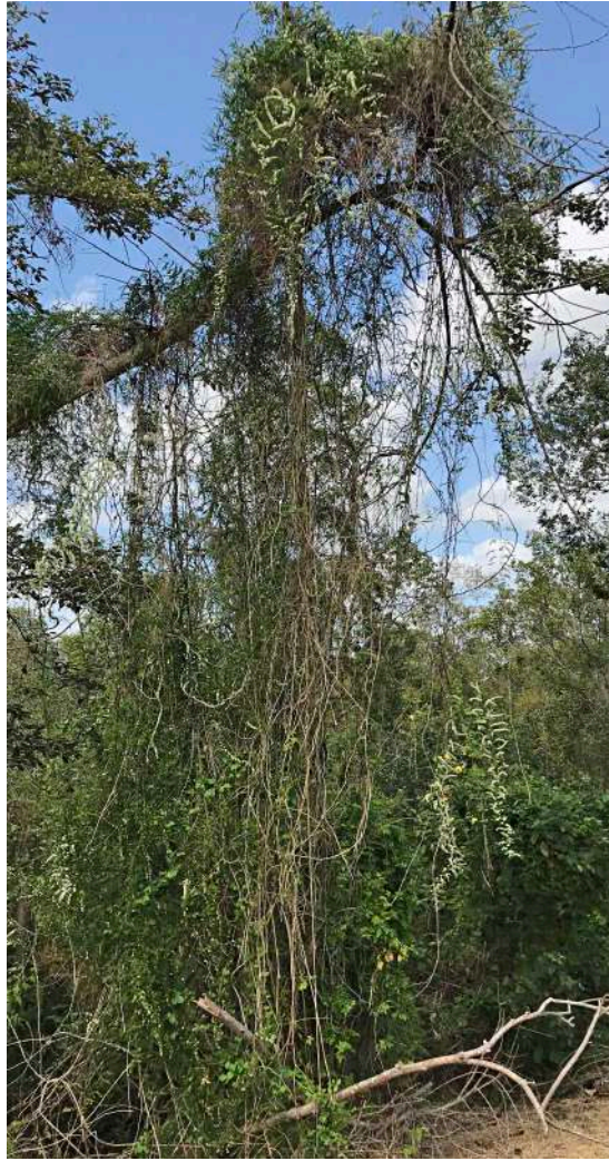
Asparagus Vine ( Asparagus plumosus ) This scrambling vine is very common along the River and other untended places, with flower close-up below.