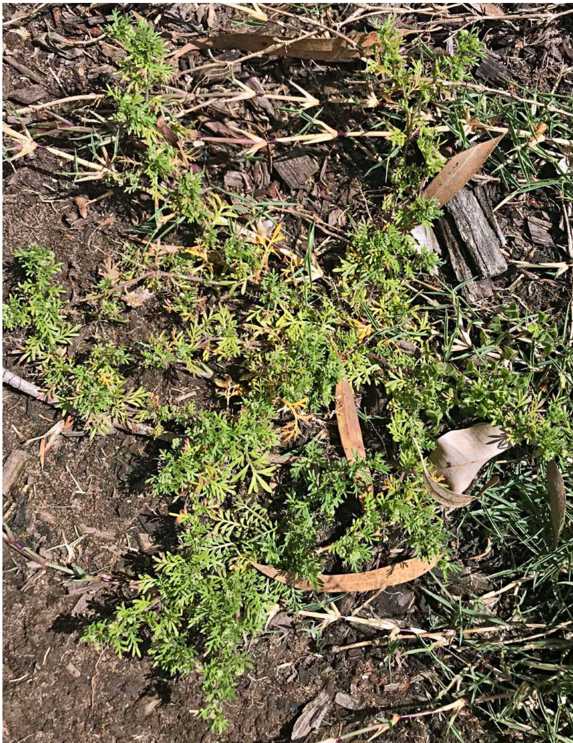
Bittercress ( Lepidium didymum ) This widespread herbaceous weed can be observed widely in shady garden areas, including the LHS of Gold 5 tee-block.