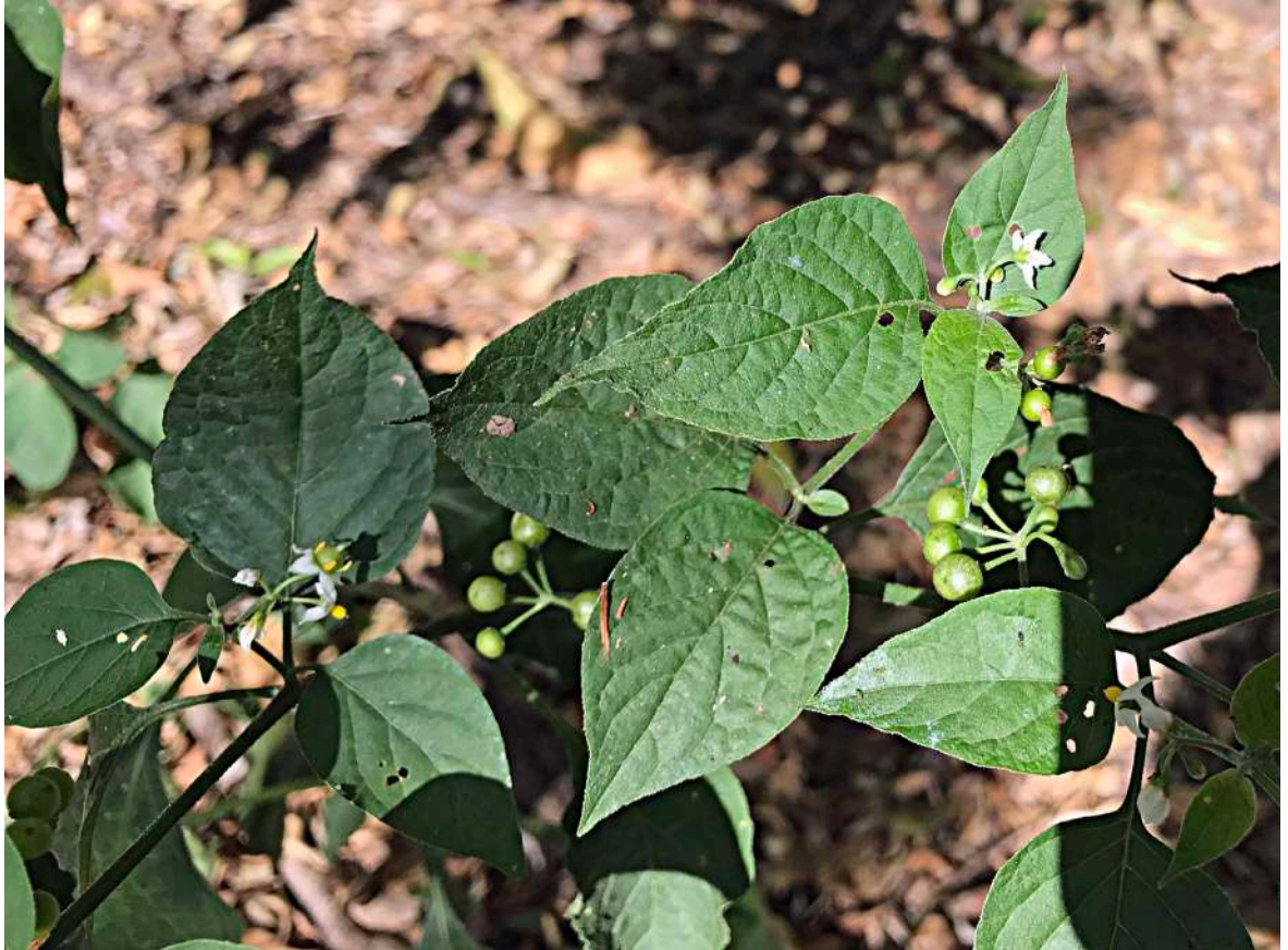
Blackberry Nightshade ( Solanum nigrum ) This pan-tropical herbaceous weed can be observed widely in shady garden areas including around the pathway between Red 3 and 4. The green berries seen in this photo will turn black on maturity.