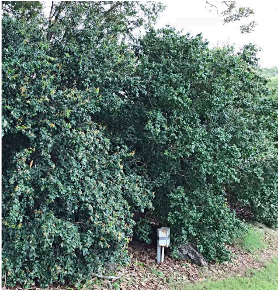
Brazilian Cherry ( Eugenia uniflora ) This South American relative of our Lillypillies is an invader of bushland and is found in the Meiers Road Carpark. A flower close-up is provided below.