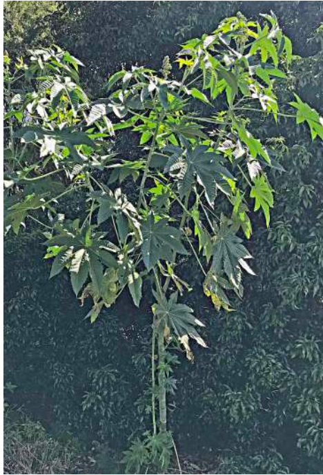
Castor Oil Plant ( Ricinus communis ) A garden escape, the Castor Oil shrubs can also be seen along the River banks, where seeds are spread by birds. See fruits below.