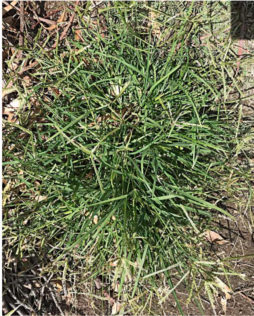
Crowsfoot Grass ( Eleusine indica ) This introduced African grass weed is low-growing and occasional in garden areas.