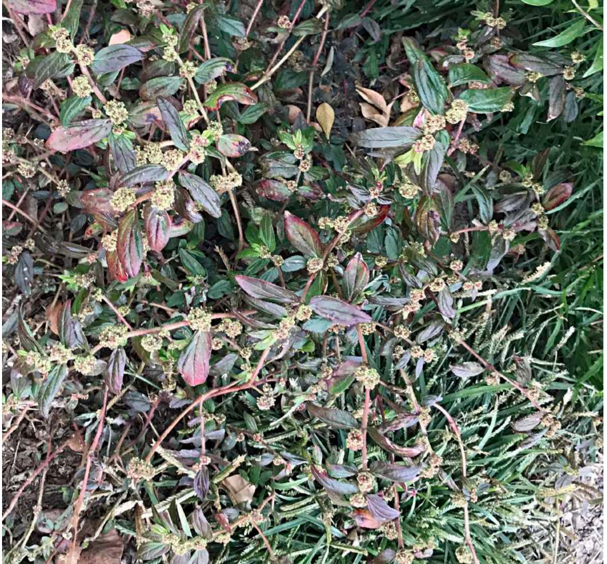
Asthma Plant ( Chamaesyce hirta ) This prostrate weedy herb is not suspected of causing asthma; but a hot concoction has been used in traditional herbal medicine to relieve that condition.