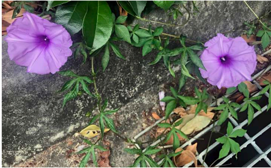
Coastal Morning Glory ( Ipomoea cairica ) This twining vine with conspicuous tubular purple flowers is commonly seen around the edges of landscape areas. A rare white-coloured form (below) grows along the Riverbank on Blue 3.