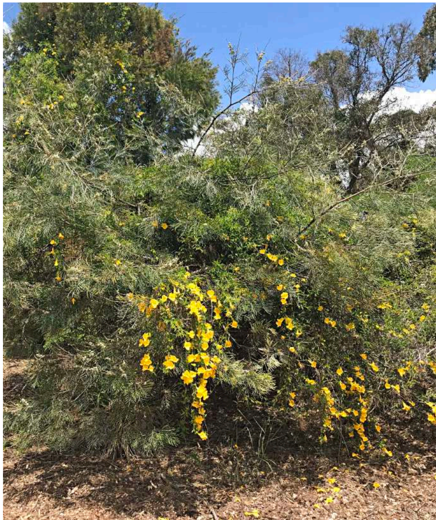
Cat's Claw Creeper ( Dolichandra unguis-cati ) This weedy vine with spectacular flowers is a serious pest of the Riverbanks, with underground tubers that make their control very difficult.