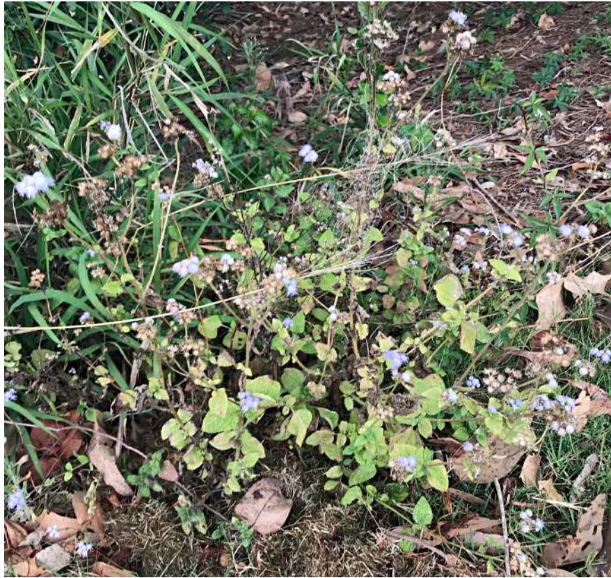
Blue Billygoat Weed ( Ageratum houstonianum ) This Tropical American weed can be observed commonly in garden areas, with a close-up below.