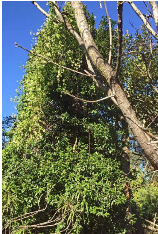
Balloon Vine ( Cardiospermum grandiflorum ) This South American vine can easily smother trees and shrubs and is very commonly seen along the river, with flower close-up below.