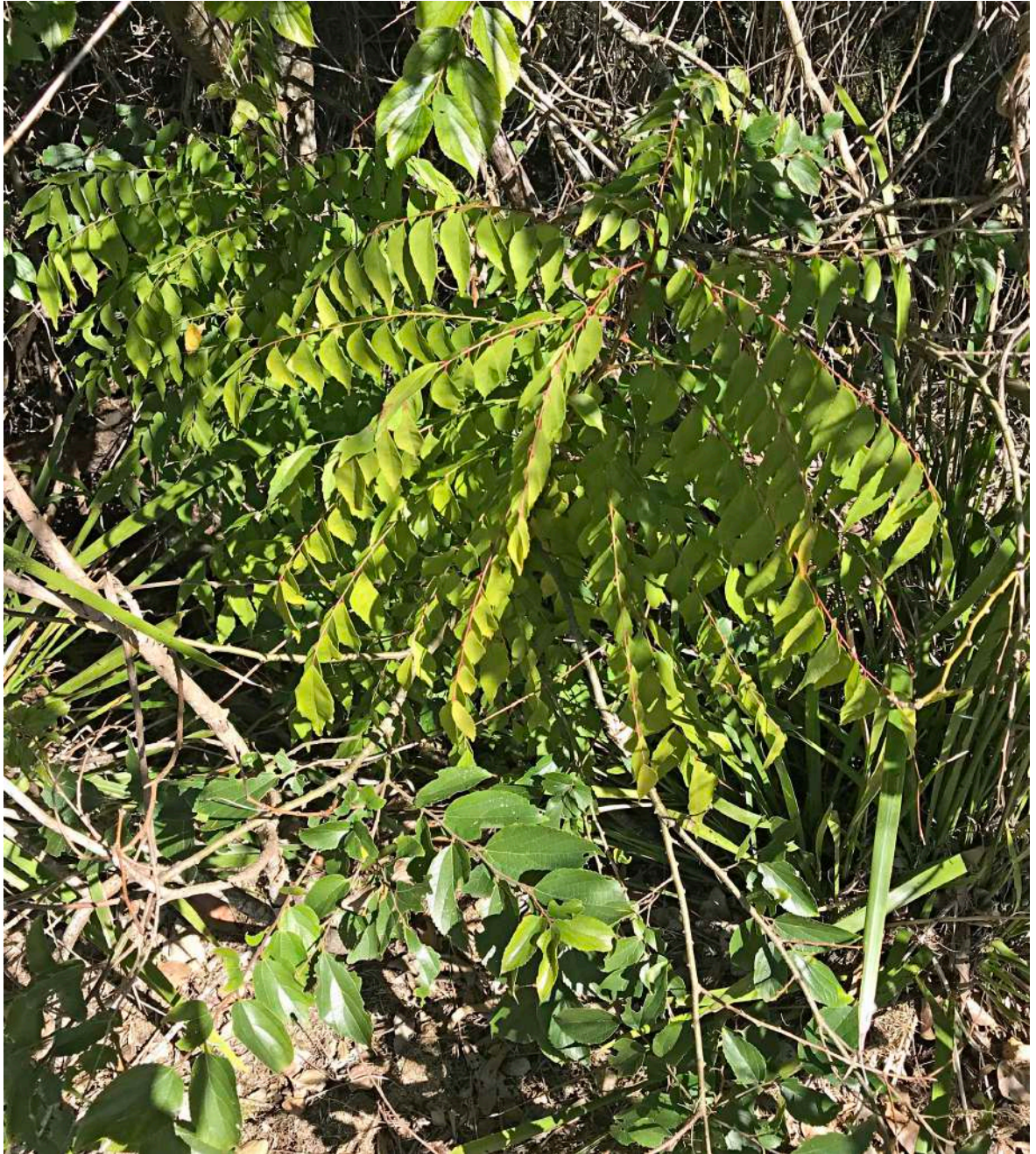
Curry Leaves ( Murraya koenigii ) This shrub is a recent volunteer along the Riverbank on Red 4, where it's has recently been dropped by a bird. This is an interesting example of the ongoing arrival of weed seeds on our site.