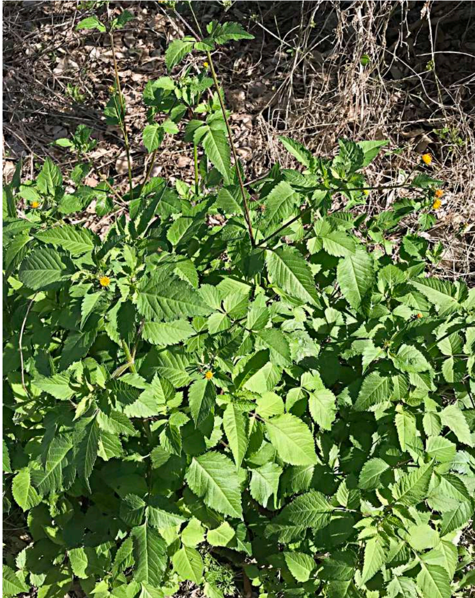
Cobbler's Peg ( Bidens pilosa ) This herbaceous weed is an annoying plant whose hooked seeds (see below) attach themselves to anyone or anything that brushes past them!