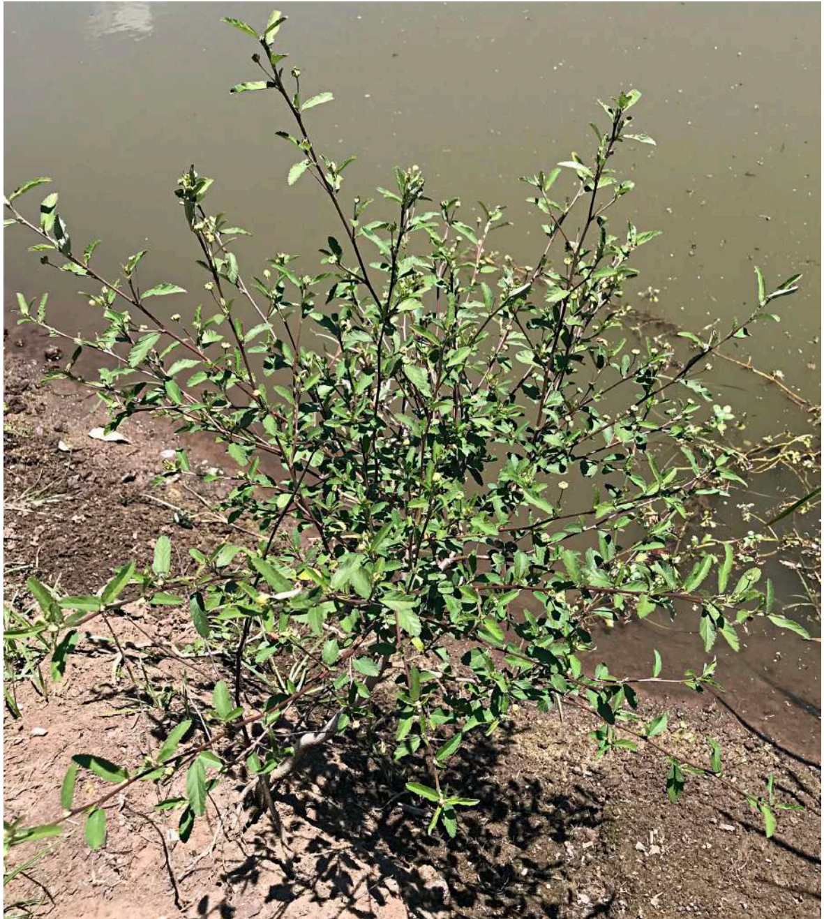
Common Sida ( Sida rhombifolia ) This American shrubby weed is widespread and can be observed near the pond on the LHS of the Red 9 tee-blocks.