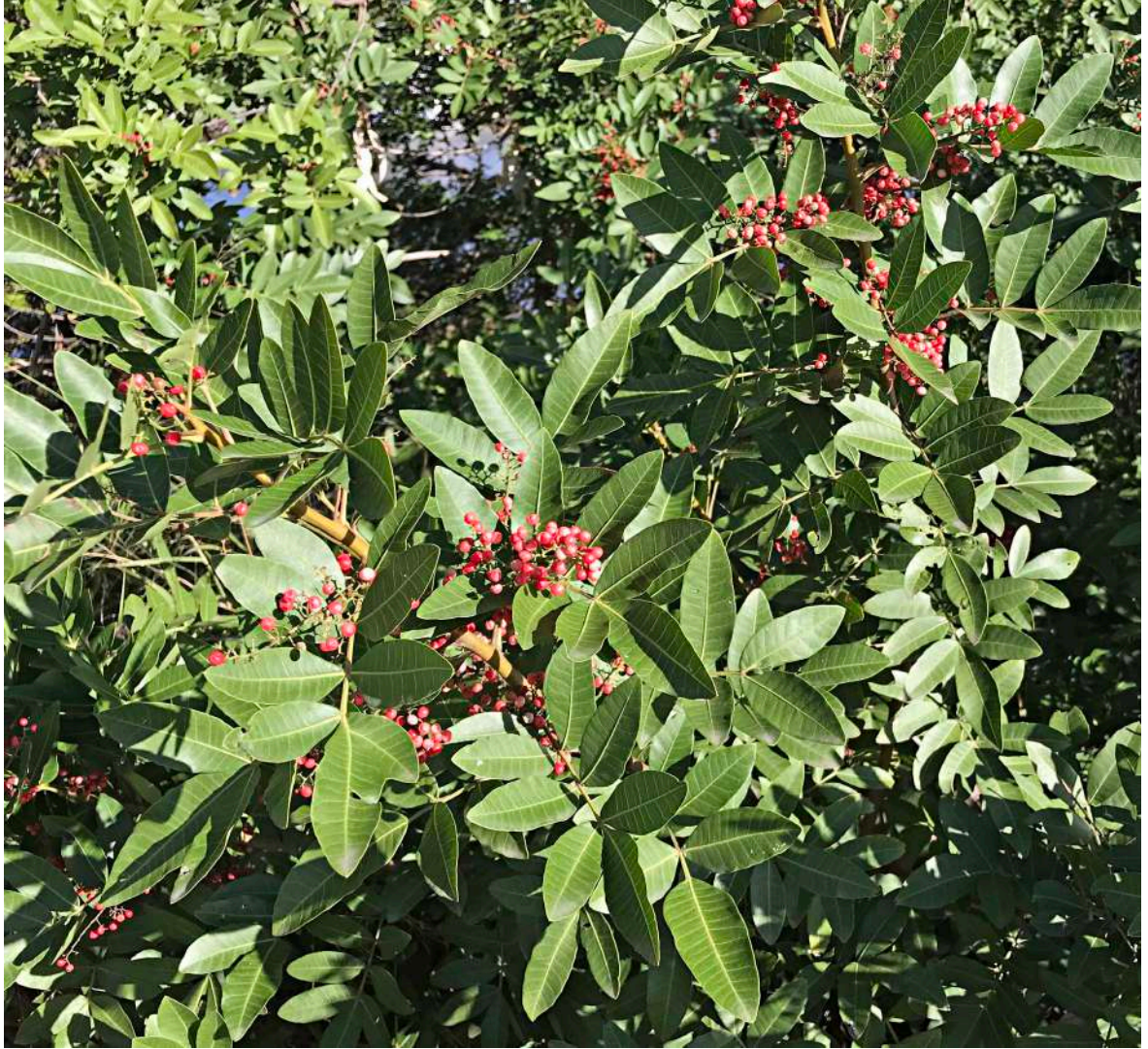
Broad-leaved Pepper ( Schinus terebinthifolius ) This South American introduced shrub is a common weed of the river banks and can be observed on the LHS of the Gold 3 men's tee-block. Again, this species produces many seeds that are spread by birds.