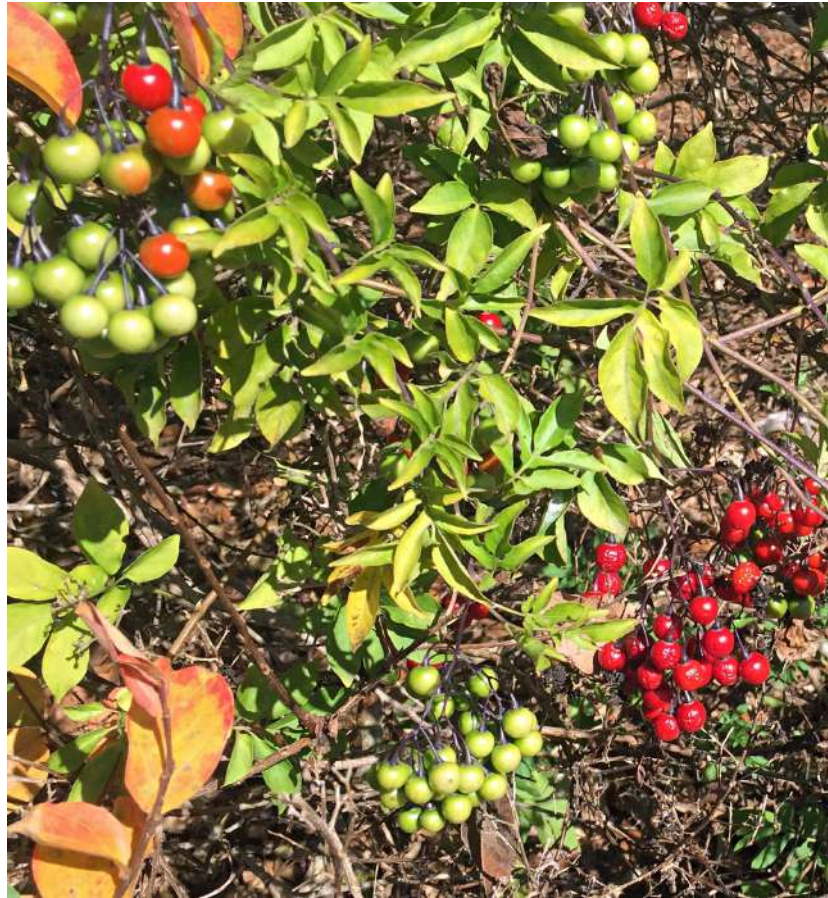
Brazilian Nightshade ( Solanum seaforthianum ) This South American weedy vine commonly grows over shrubs and trees along the River, producing many flowers and fruits that can be spread by local birdlife.