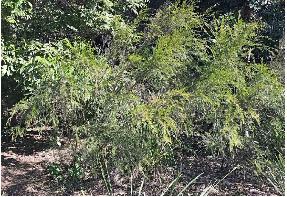
May Bush - Sannantha similis - Medium shrub planted (pJW) in various garden areas, with close-up below.