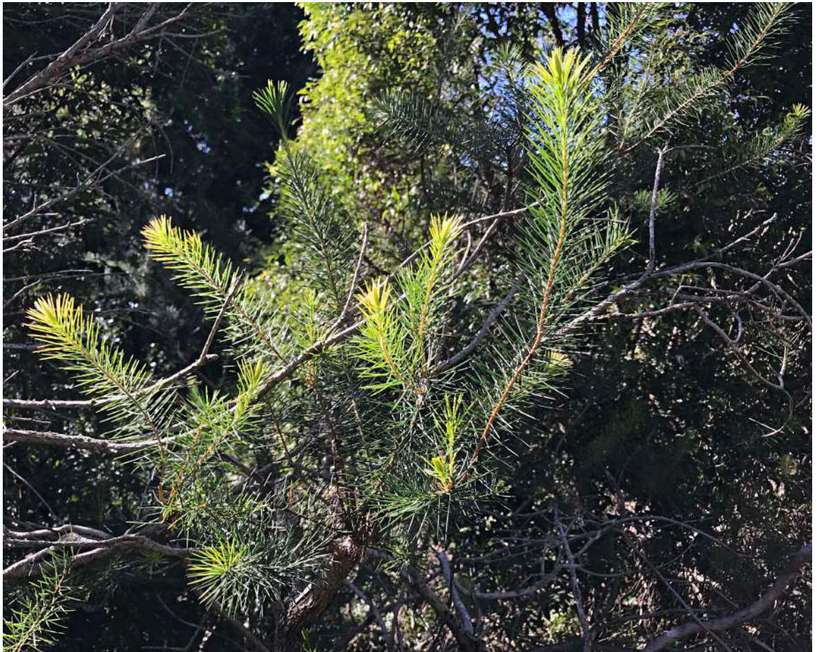
One-sided Bottlebrush - Calothamnus quadrifidus - Medium Western Australian shrub planted (pJW) behind the Red 9 tee-block.