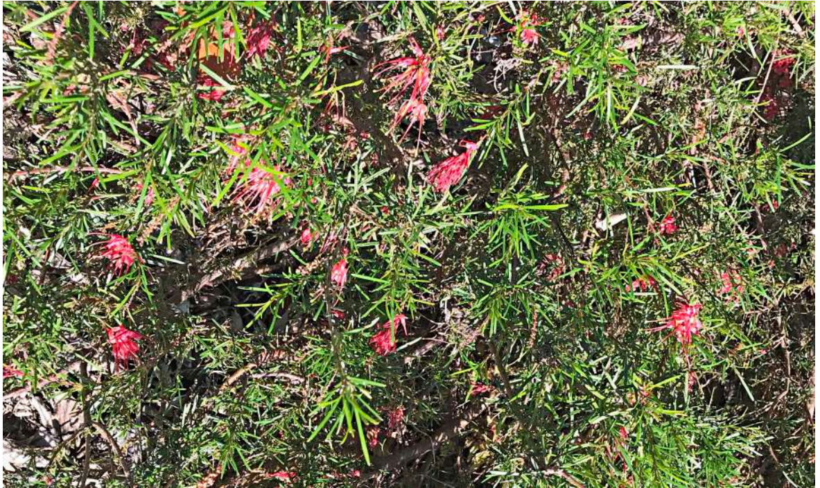
Pinaster Grevillea - Grevillea pinaster cv 'Red Form' - planted (pJW) on LHS path between Red 1 & 2, with close-up provided below. A popular shrub for nectar-feeders.