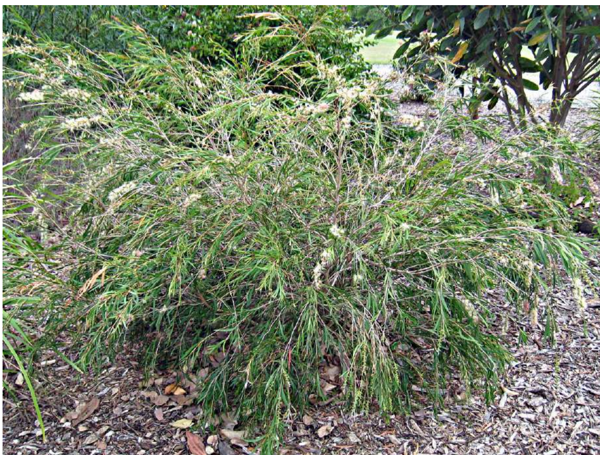
Oakey Bottlebrush - Melaleuca quercina - Medium Darling Downs shrub planted (pJW) on the LHS Red 9 fairway.