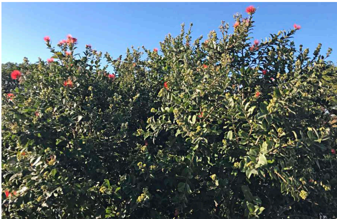
New Zealand Christmas Bush - Metrosideros thomasi - a tall bush planted in the clubhouse surrounds, with a close-up of flowers provided below.