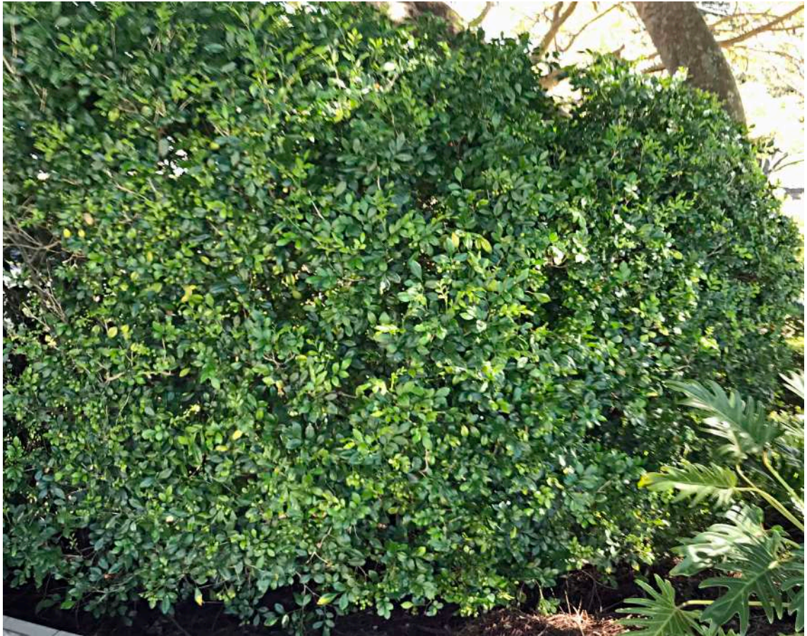
Mock Orange - Murraya paniculata - Tall shrub planted in the clubhouse gardens, with close-up of flowers provided below.