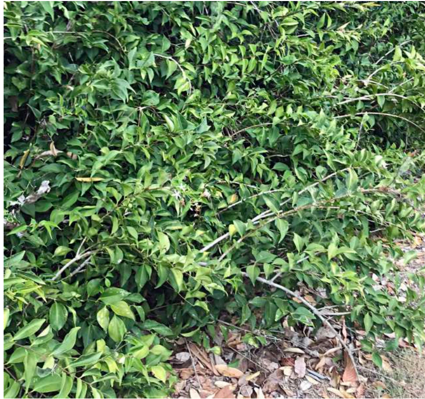
Native Jasmine - Jasminium simplicifolium subspecies australiense - A climbing shrub on the LHS Gold 6 tee-blocks, with flower close-up below.