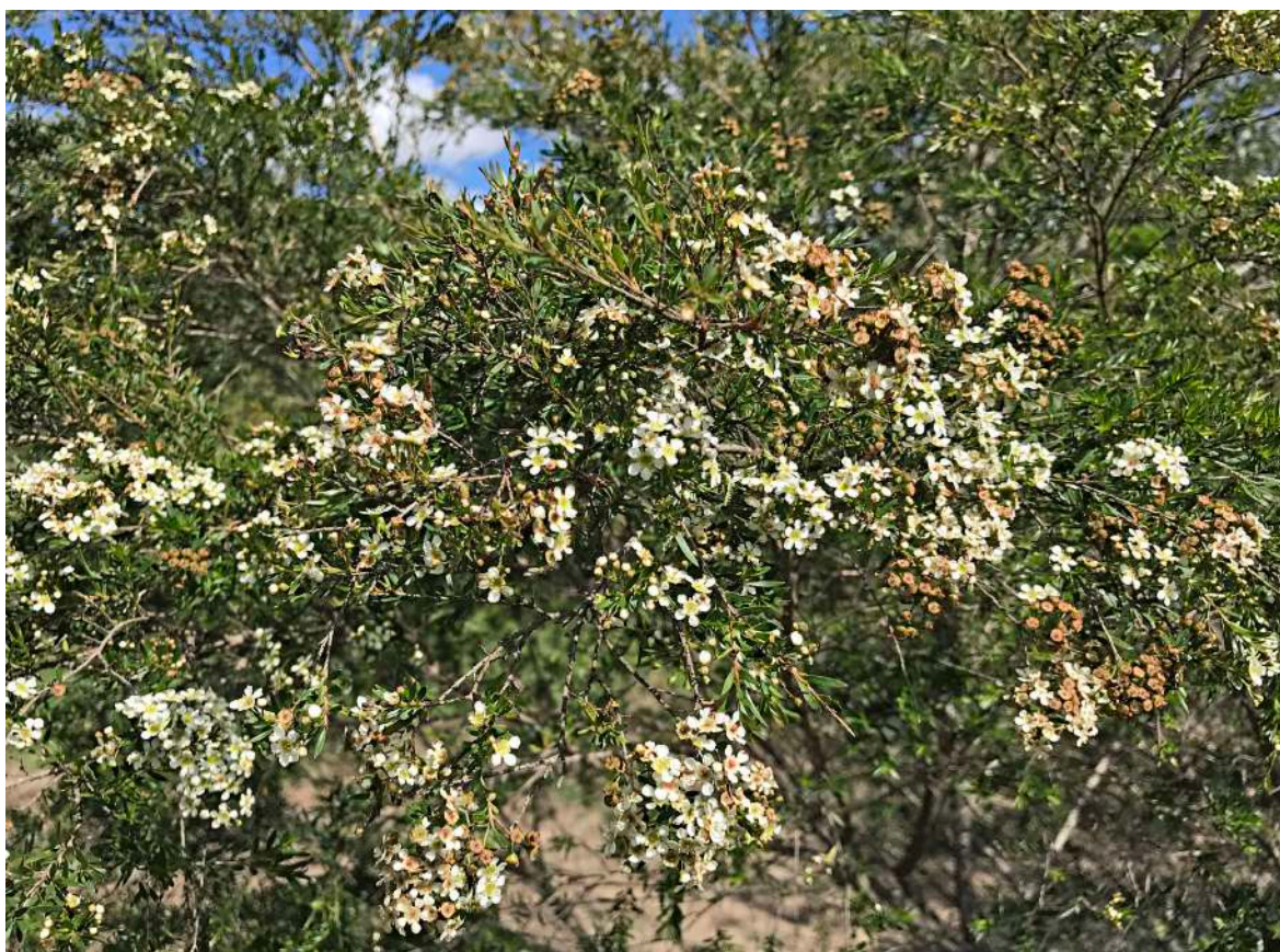
Lemon-scented Tea-tree - Leptospermum petersonii - Medium shrub planted (pJW) on LHS Gold 7 fairway.