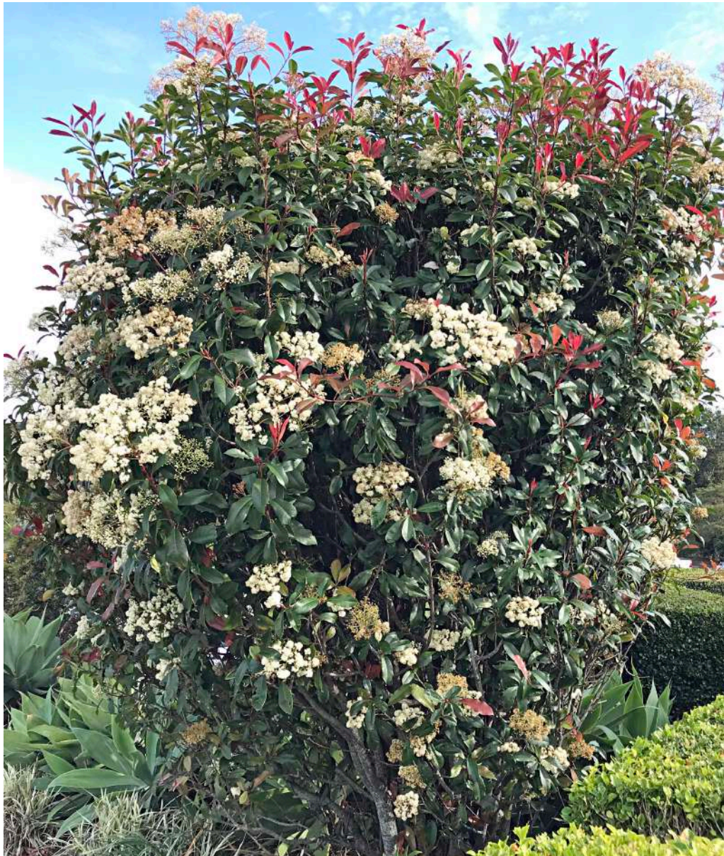
Lauristinus - Viburnum tinus - Tall shrubs planted in the clubhouse surrounds, with close-up of leaves and flowers below.