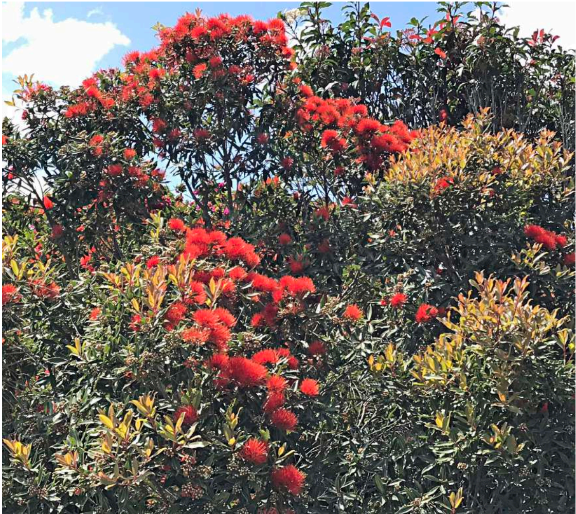
New Zealand Christmas Tree - Metrosideros excelsa - a tall bush/small tree planted in the clubhouse surrounds, with a close-up of spring flowers provided below.