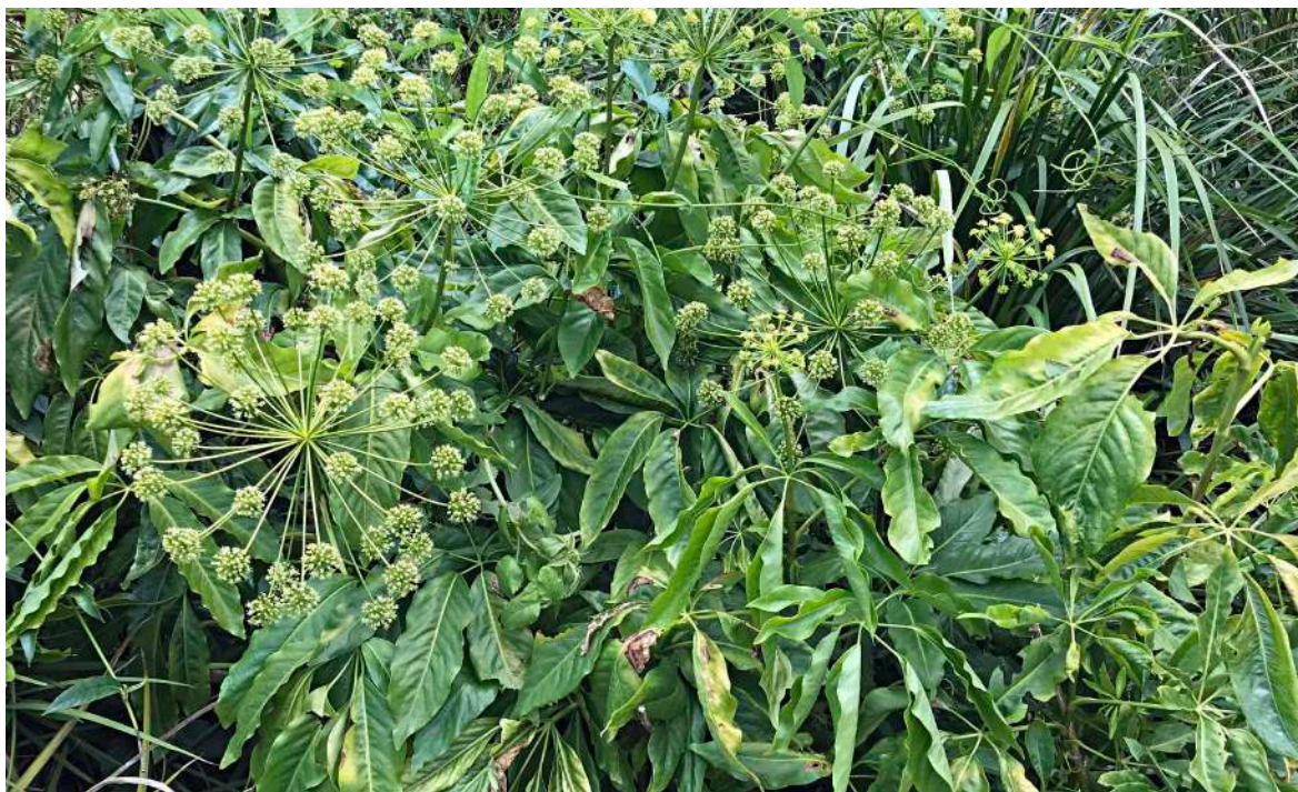
Mackinlaya - Mackinlaya macrosciadea - A North Queensland shrub planted (pJW) on LHS of Gold 9 men's tee-block, with close-ups of flowers and fruit provided below.