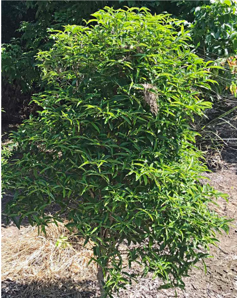
Narrow-leaved Gardenia - Attractocarpus chartaceus - medium Rainforest shrub planted (pJW) RHS Gold 8 men's tee-block, with close-up of leaves and bird's nest provided below.