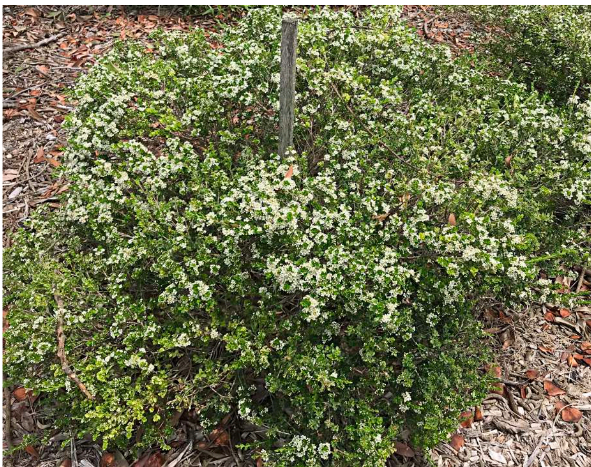
Mt Tozer May Bush - Sannantha tozerensis - A small shrub from Cape York planted (pJW) on LHS Blue 3 men's tee-block.