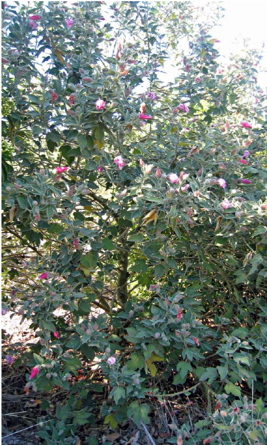
Pink Cottonwood - Hibiscus splendens - tall shrub planted (pJW) on RHS Red 4 fairway.