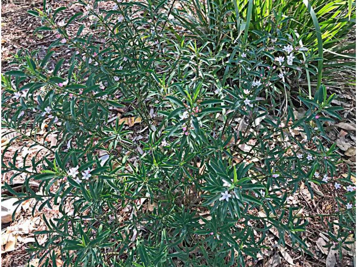
Philotheca Winter Rouge - Philotheca myoporoides - Low native shrub planted on LHS Blue 3 men's tee-block under Jacarandas, with close-up provided below.