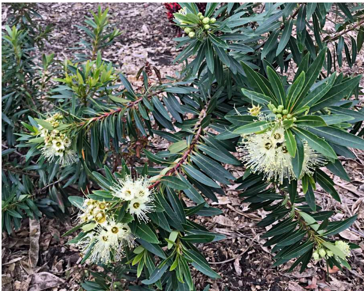
Little Penda - Xanthostemon verticillatus - Small shrub from North Queensland planted on LHS Gold 1 green.