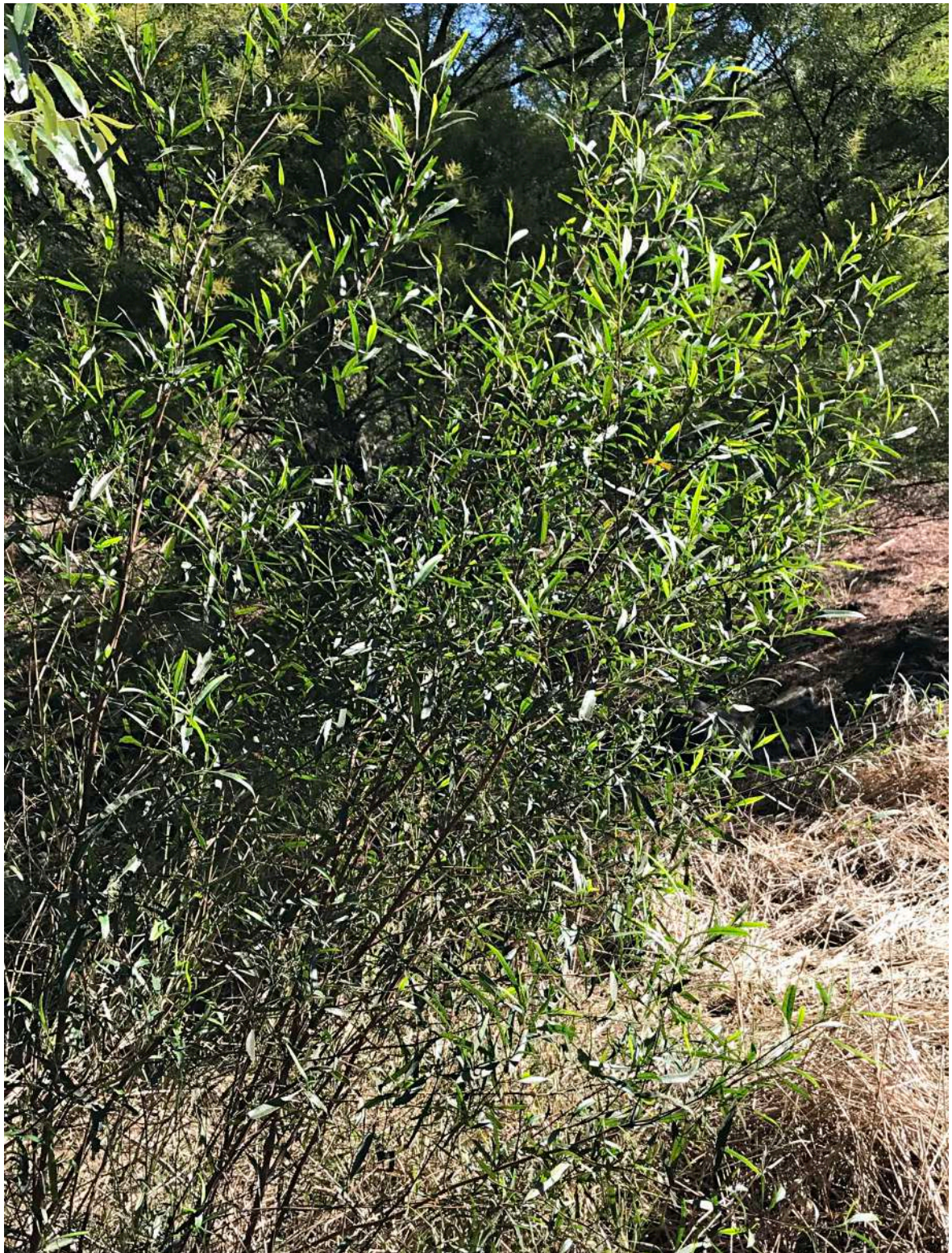
Narrow-leaved Hop Bush - Dodonaea viscosa subspecies angustifolia - Medium shrub planted (pJW) on RHS Red 6 fairway.