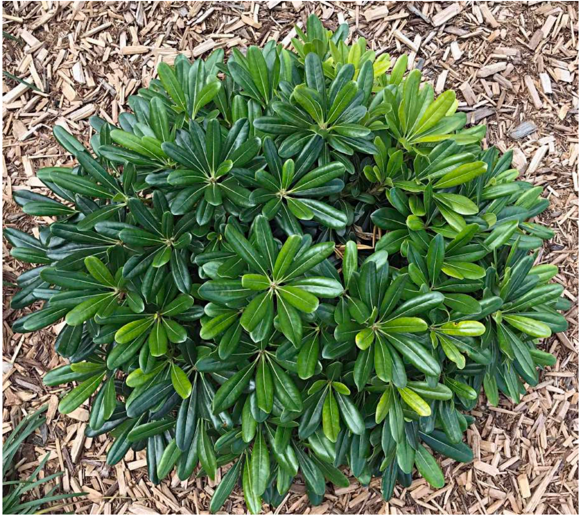
Miss Muffet - Pittosporum tobira - Dwarf introduced shrub planted in Poinciana Bar garden.