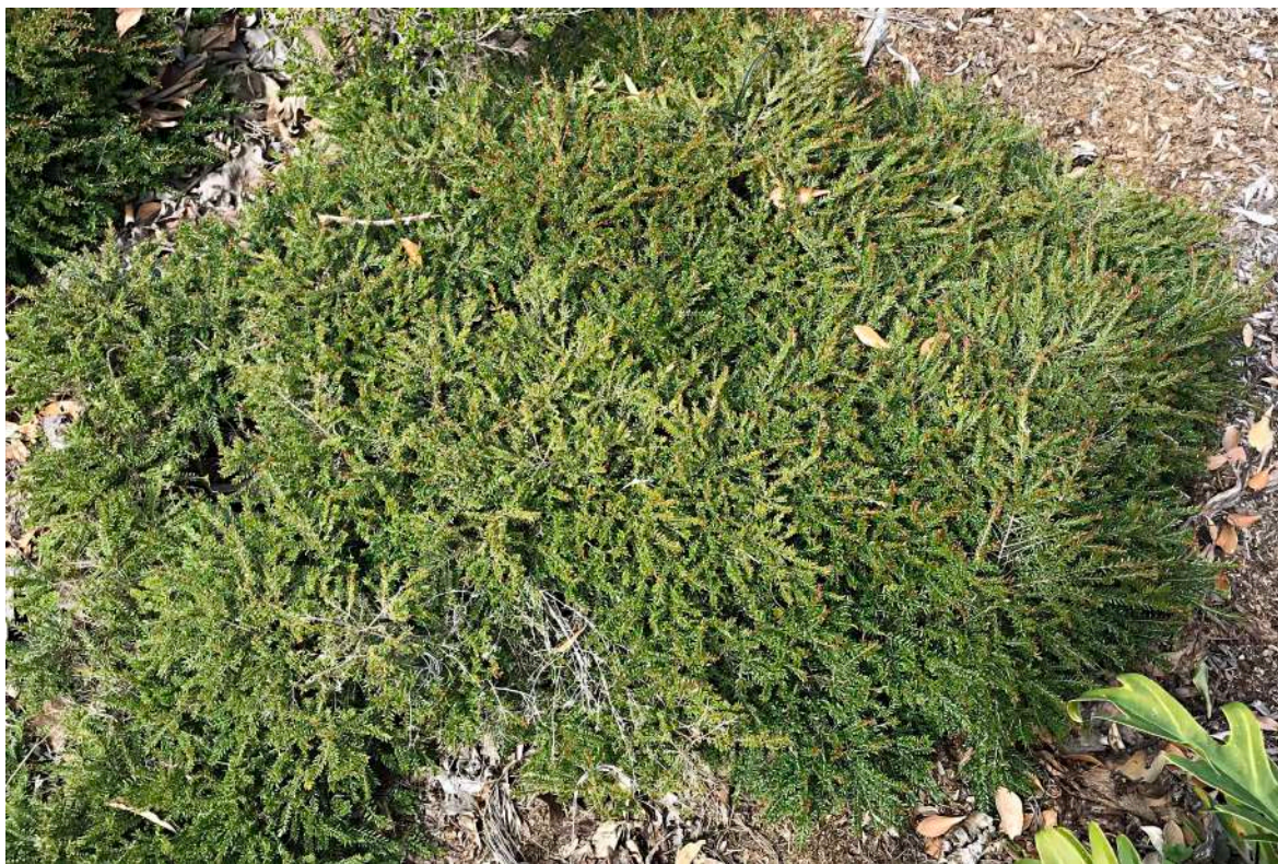
May Bush La Petite - Sannantha similis cv ' La Petite ' - Dwarf cultivar planted (pJW) in the clubhouse surrounds, with close-up provided below.