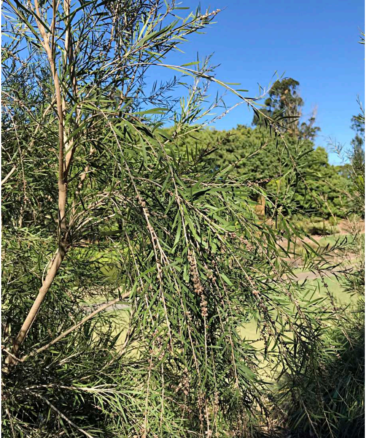
Lemon Bottlebrush - Melaleuca pallida - A medium shrub from montane areas planted (pJW) LHS Red 9 dropzone.