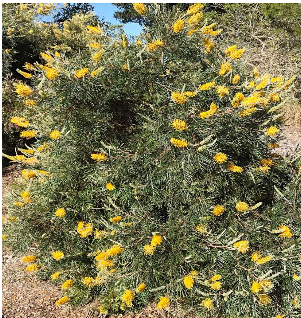
Grevillea Bush Lemons - Grevillea cv ' Bush Lemons ' - planted (pJW) occasional between fairways, with close-up below.