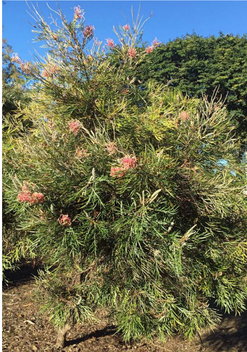
Grevillea Flamingo - Grevillea cv ' Flamingo ' - planted (pJW) LHS Gold 1 green, with close-up below.