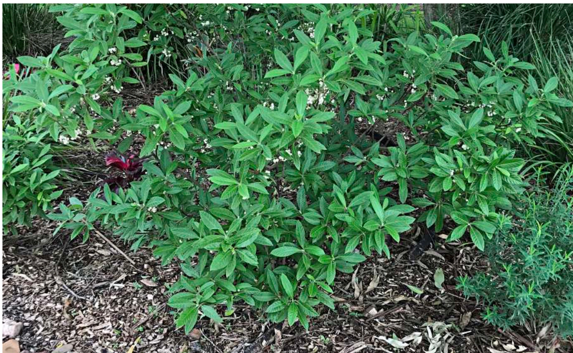
Hairy Psychotria - Psychotria loniceroides - Rainforest shrub planted (pJW) on LHS Blue 3 men's tee-block with close-up provided below.