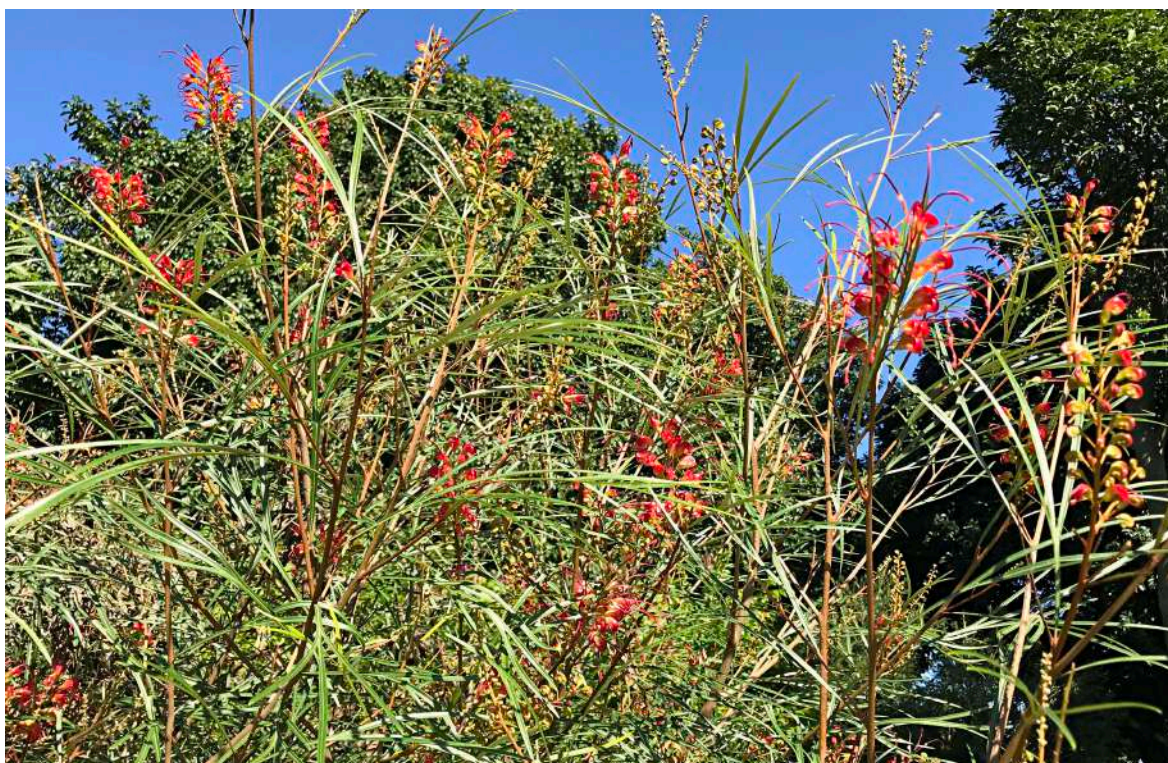
Grevillea Firesprite - Grevillea cv ' Firesprite ' - planted (pJW) behind Red 8 green, with close-up below, favoured by honeyeaters.