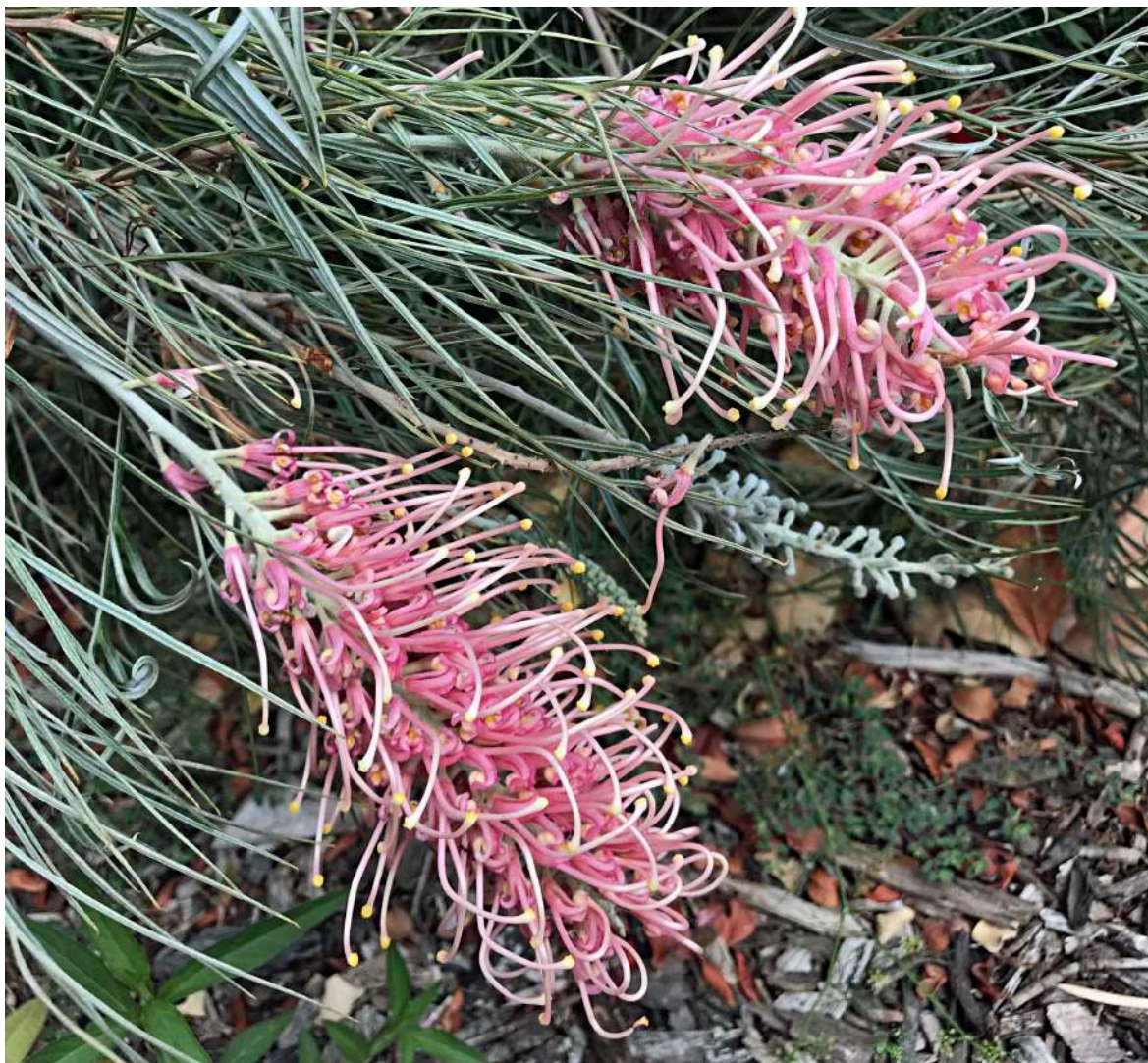
Grevillea Misty Pink - Grevillea cv 'Misty Pink' - planted (pJW) in fairway gardens.