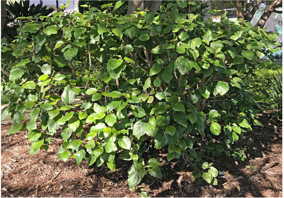
Hibiscus cultivar - Hibiscus rosa-sinensis cultivars' - planted in the clubhouse surrounds gardens, with flower close-up below.