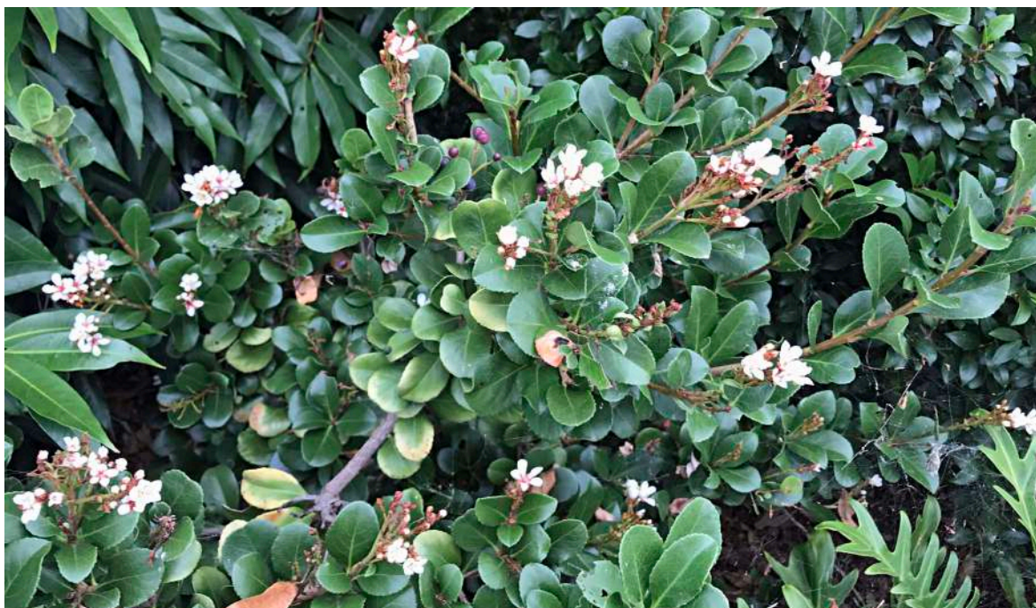
Indian Hawthorn - Raphiolepis indica cv 'Arctic White' - planted between range & clubhouse, with close-up provided below.