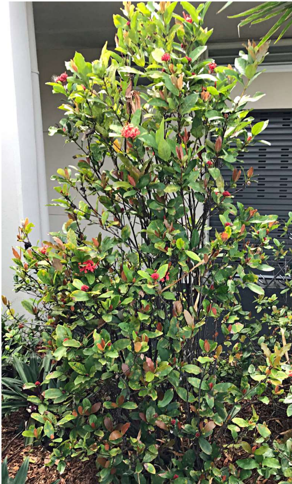
Ixora Prince of Orange - Ixora cv ' Prince of Orange ' - a tall cultivar planted in the clubhouse surrounds, behind the Ixora Dwarf Red.