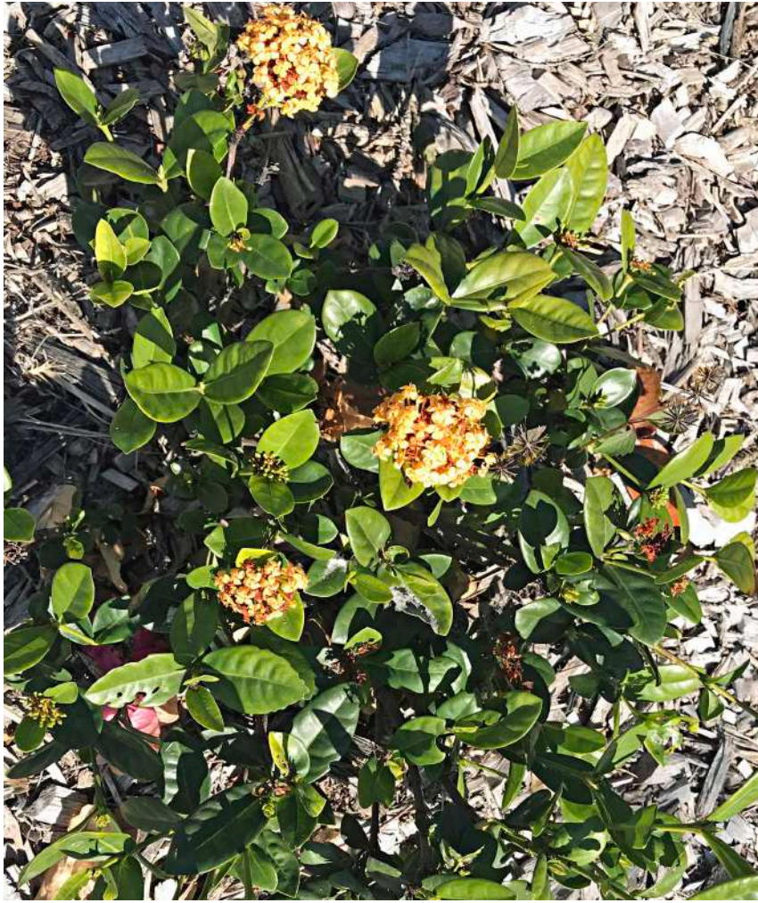
Ixora Dwarf Yellow - Ixora cv ' Dwarf Yellow ' - Planted on LHS of Red 6 men's tee-block, with flowers close-up provided below.