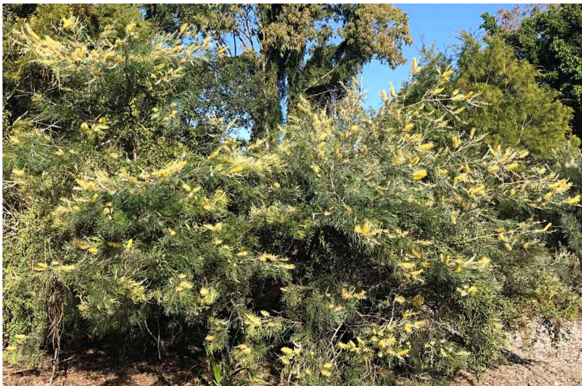
Grevillea Sandra Gordon - Grevillea cv ' Sandra Gordon ' - Spreading shrub planted (pJW) on LHS Gold 4 fairway, with close-up below.