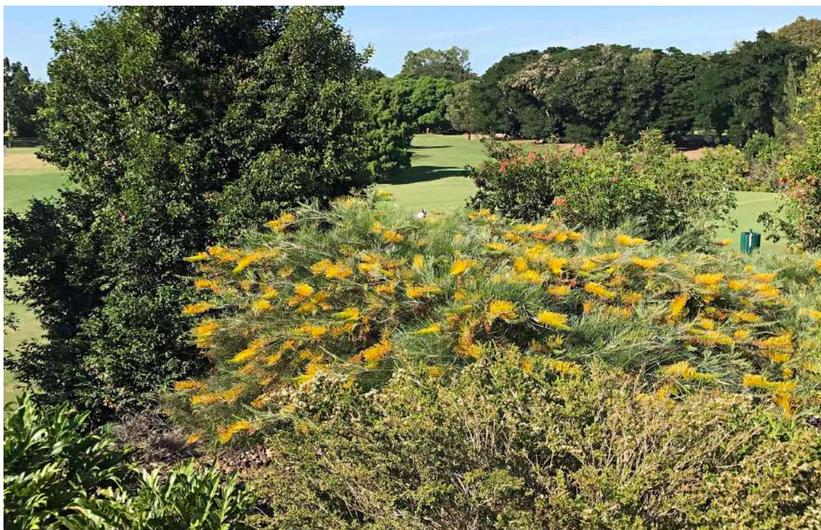
Grevillea Cooroora Cascade - Grevillea cv ' Cooroora cascade ' - planted above range, with close-up below.