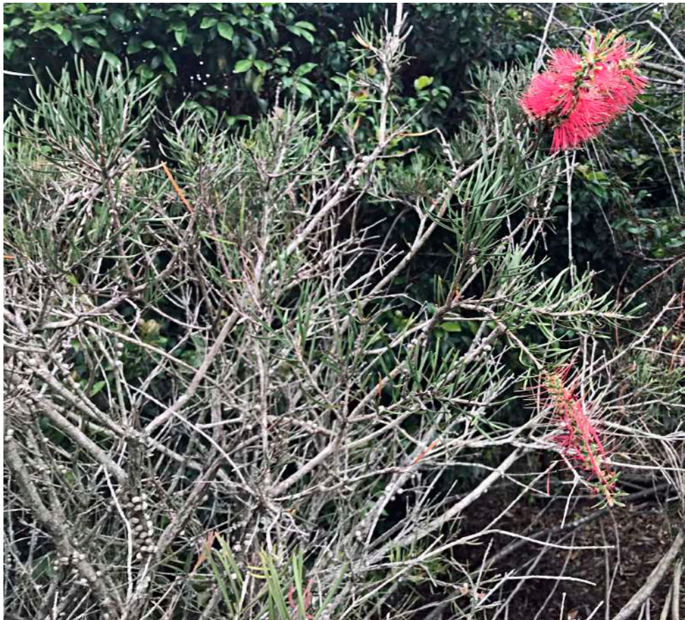
Hillock Bush - Melaleuca hypericifolia - planted (pJW) on LHS Red 9 fairway, with flower close-up below.