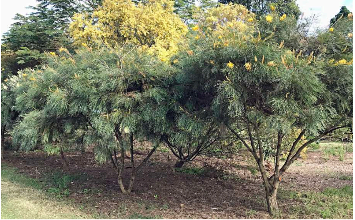
Grevillea Yamba Sunshine - Grevillea cv ' Yamba Sunshine ' - Planted (pJW) on RHS Blue 8 fairway, with close-up below.