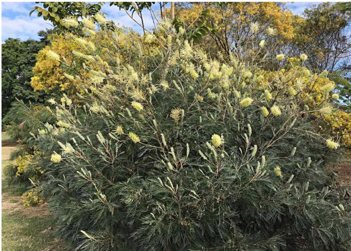
Grevillea Moonlight - Grevillea cv ' Moonlight ' - planted (pJW) on RHS Blue 8 fairway, with close-up below.