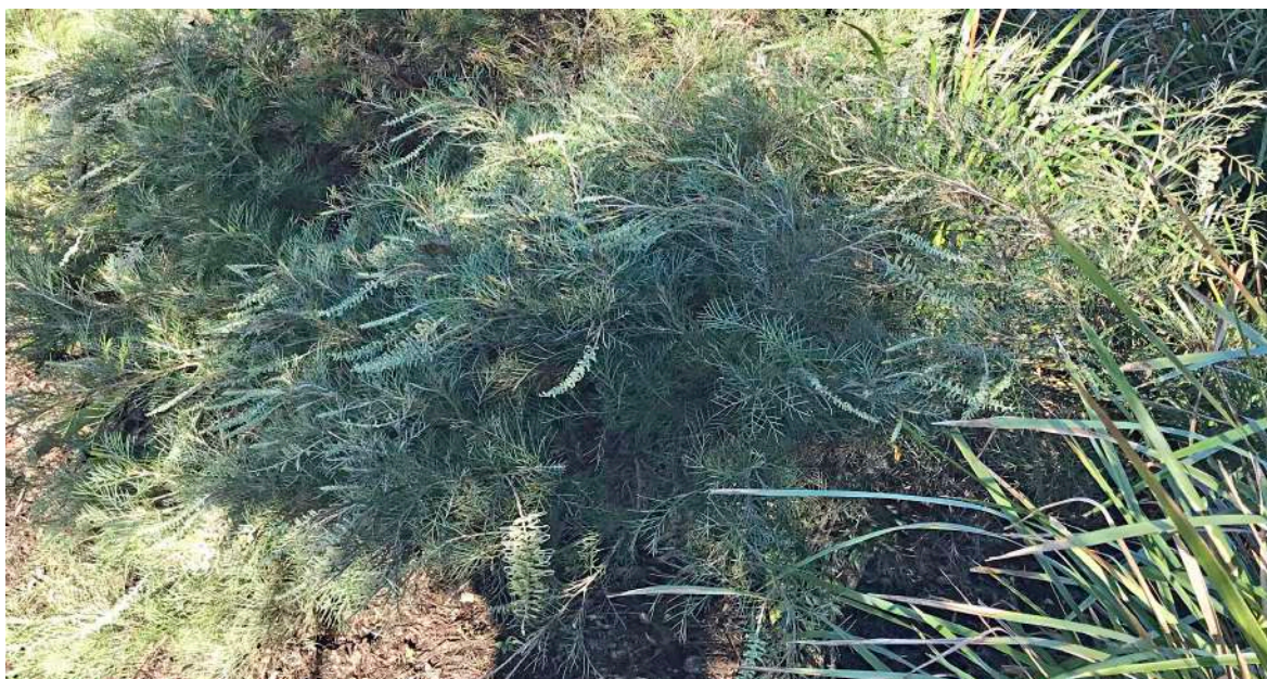
Grevillea Ivory Whip - Grevillea cv ' Ivory Whip ' - spreading shrub planted (pJW) along the path from Red 9 green past the maintenance compound, with close-up below.