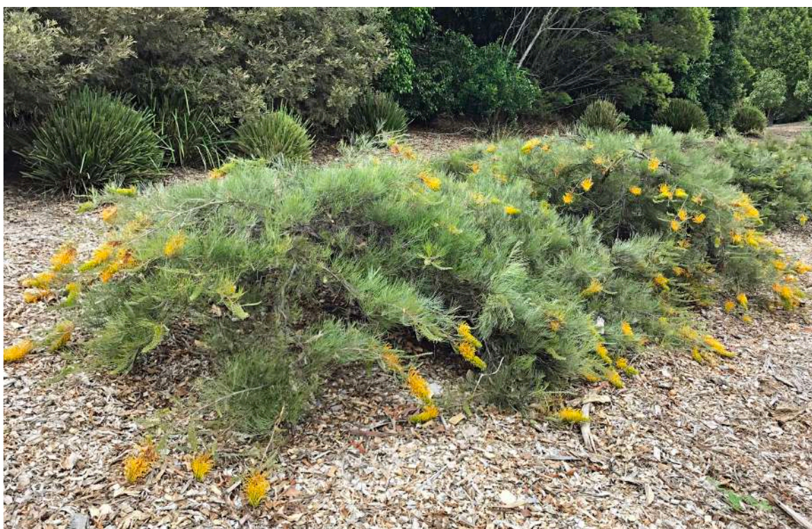
Grevillea Golden Lyre - Grevillea cv ' Golden Lyre - sprawling shrub planted (pJW) on LHS Gold 4 fairway.