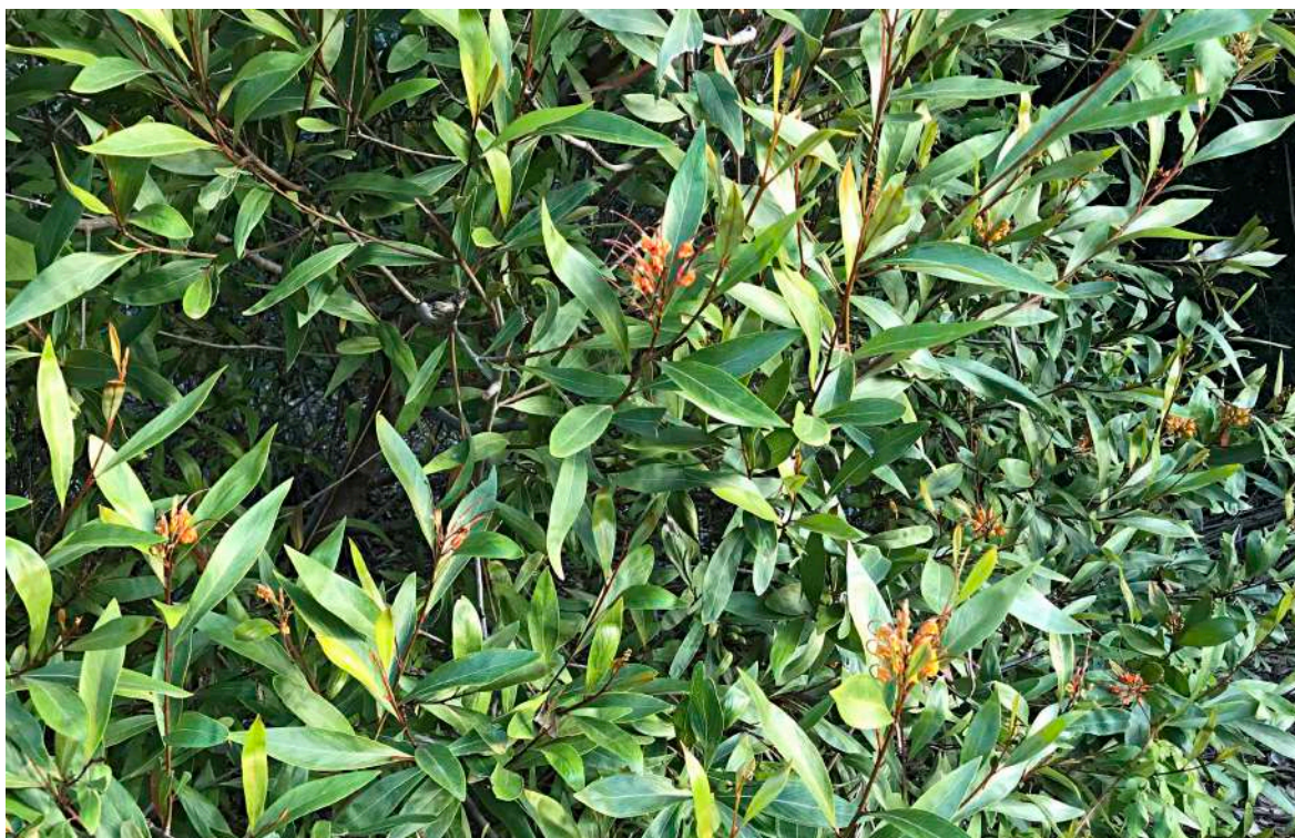
Grevillea Orange Marmalade - Grevillea cv ' Orange Marmalade ' - Tall screening shrub planted (pJW) on LHS Blue 7 men's tee-block, with close-up below.