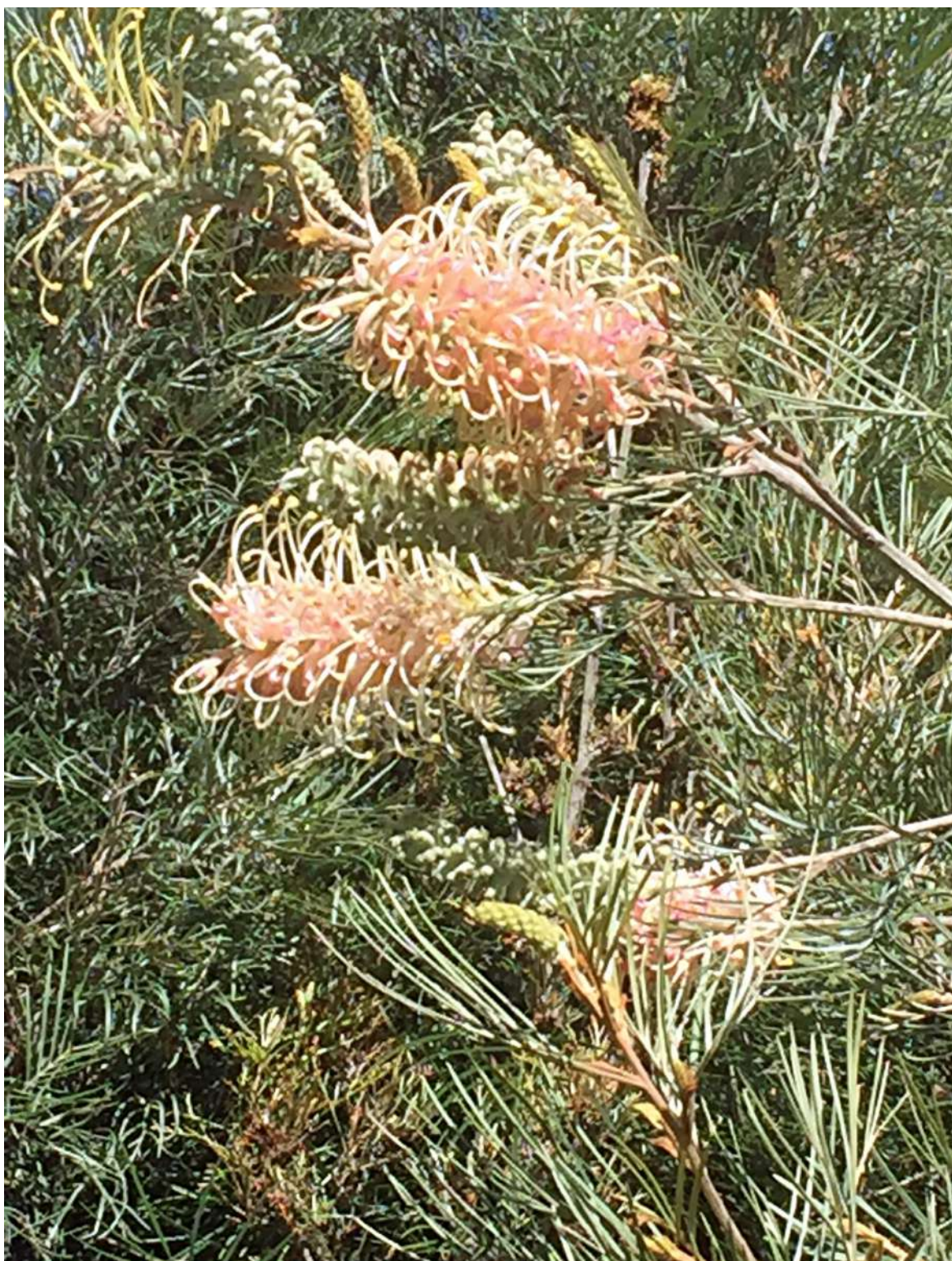
Grevillea Caloundra Gem - Grevillea cv ' Caloundra Gem ' - planted (pJW) behind Red 3 green.