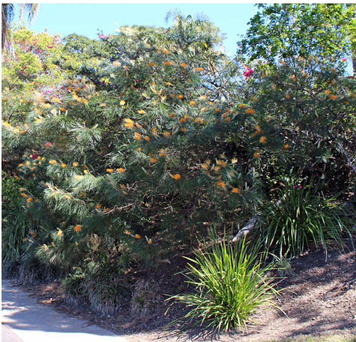
Grevillea Honey Gem - Grevillea cv ' Honey Gem ' - medium shrub planted (pJW) on LHS Red 6 tee-block.