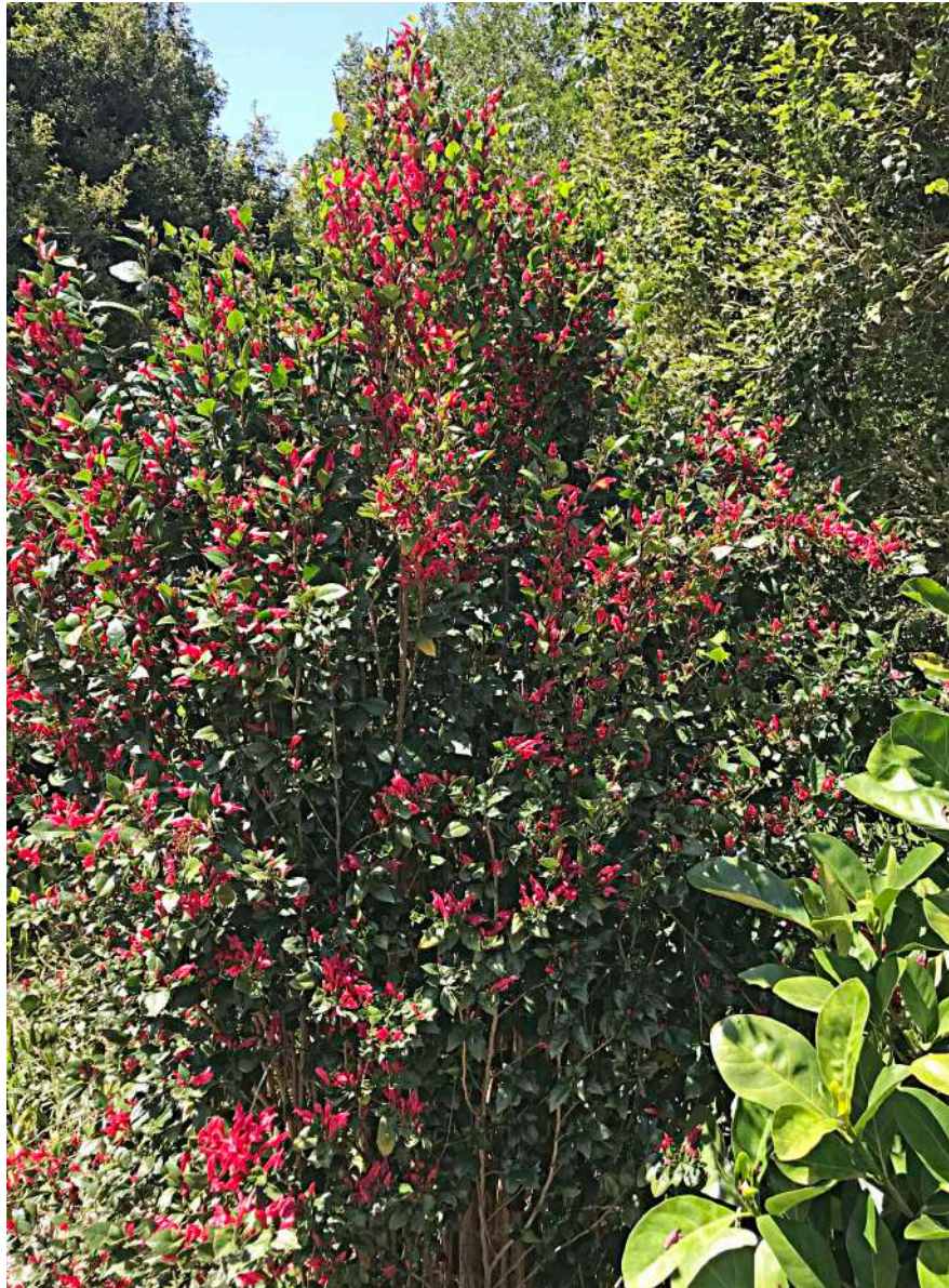
Holly Fuschia - Graptophyllum ilicifolium - Rainforest shrub planted (pJW) on RHS Red 4 men's tee-block, with close-up below.