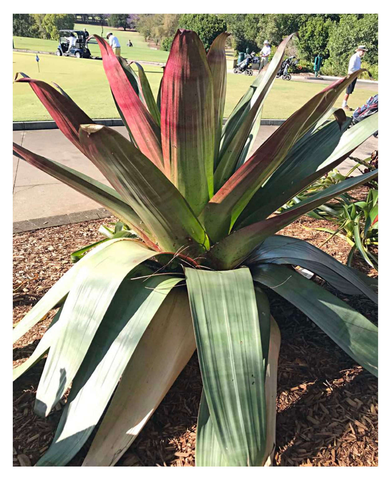
Imperial Bromeliad ( Alcantarea imperialis var. rubra ) A large green and purple bromeliad planted in the Poinciana Bar gardens.