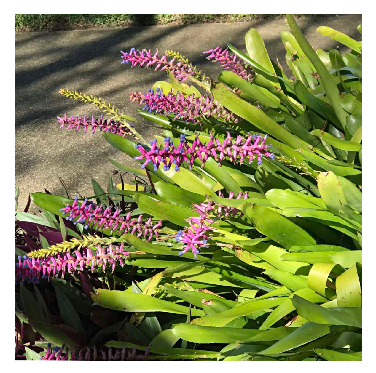
Matchstick Plant ( Aechmea gamosepala ) A Brazilian bromeliad planted in the western clubhouse surrounds.