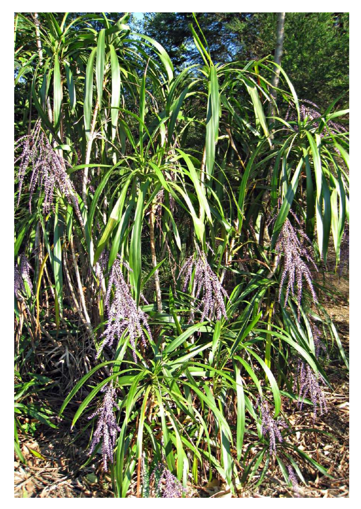
Slender Palm Lily ( Cordyline stricta ) An SEQ Palm Lily planted behind the Gold 5 green.