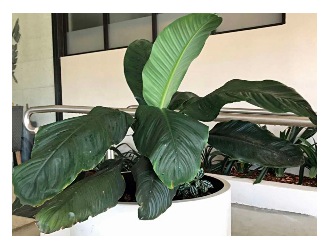
Giant Peace Lily ( Spathiphyllum wallisii cv. 'Sensation' ) A cultivar planted in a decorative pot near the Clubhouse entry.