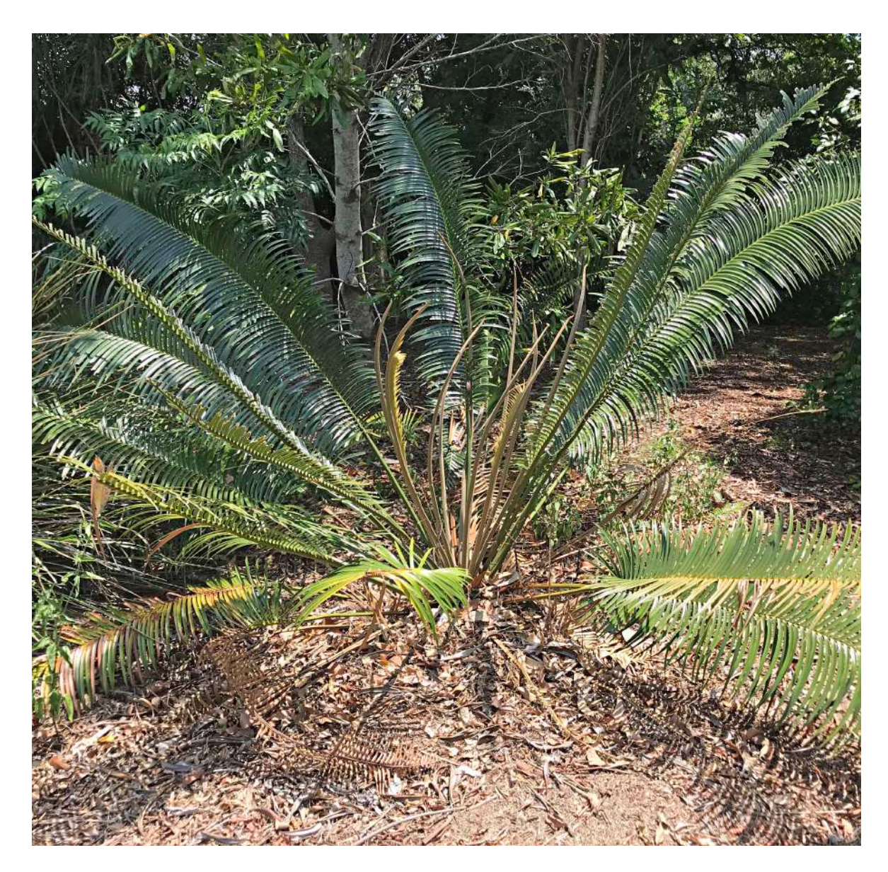
Pineapple Cycad ( Lepidozamia peroffskyana ) SEQ cycad planted on the LHS of Gold 5 tee-blocks.