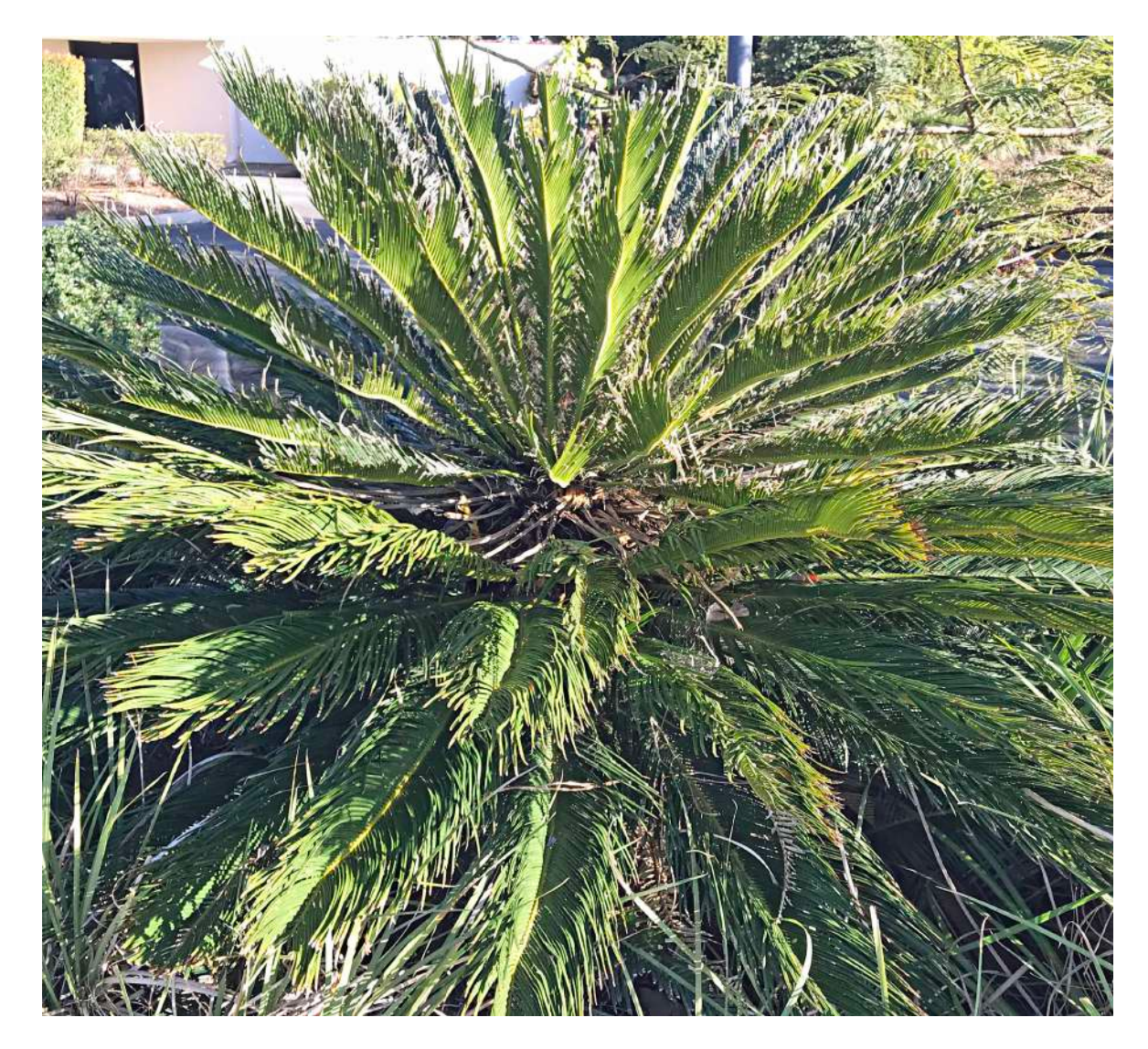
Sago Cycad (Cycas revoluta) A Japanese cycad planted in the Clubhouse surrounds.