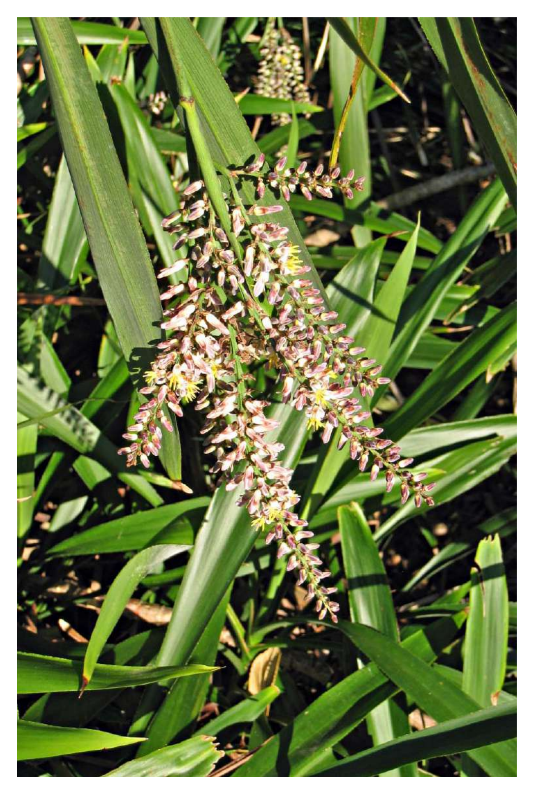
Narrow-leaved Palm Lily ( Cordyline excelsa ) An SEQ palm Lily planted by JW behind the Gold 5 green.