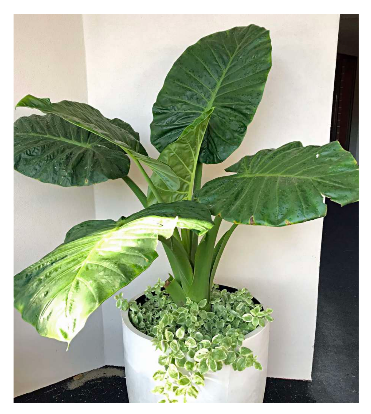
Giant Taro ( Alocasia macrorrhiza ) A n attractive tropical planted in a decorative pot at the Clubhouse entry.