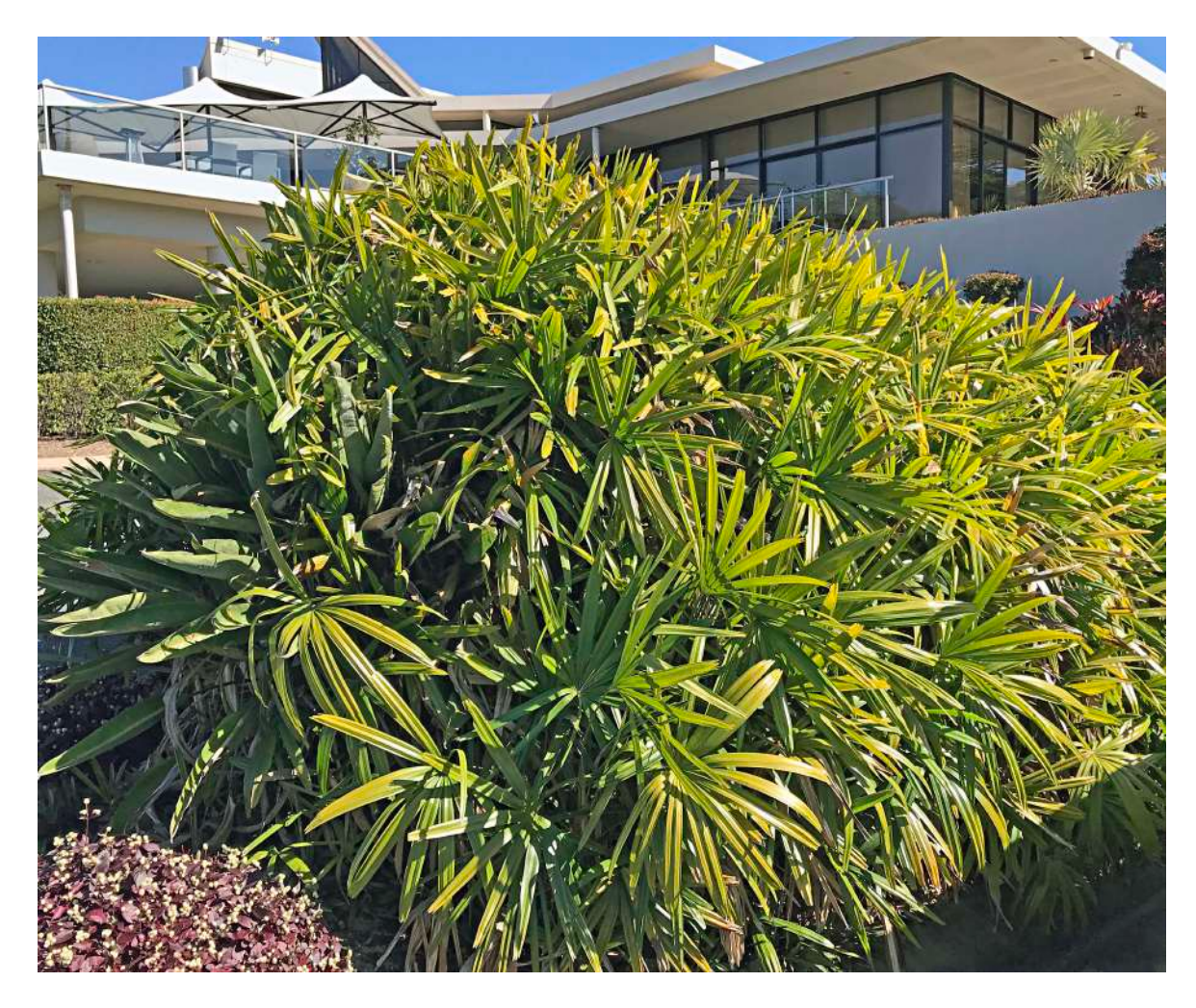
Lady Palm ( Rhapis excelsa ) A small clumping palm from Asia planted in the car park near the Clubhouse entry.