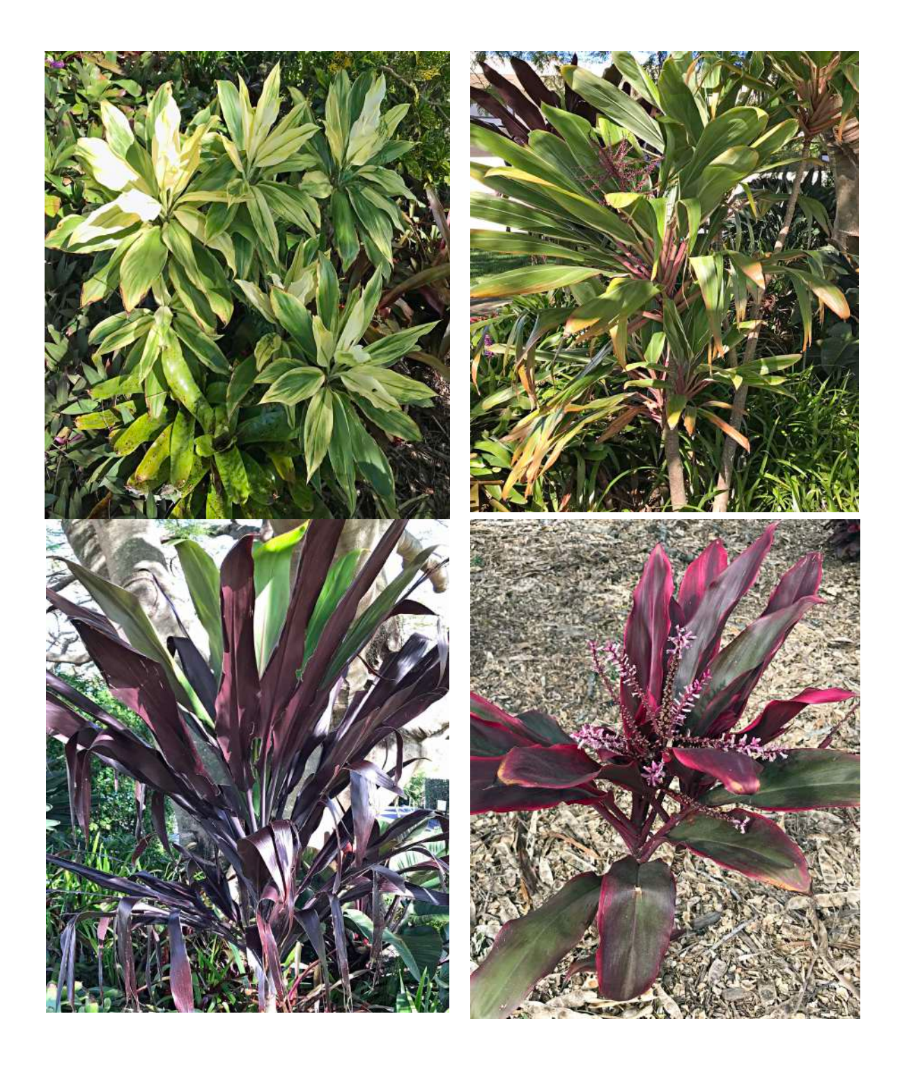
Palm Lily Cultivars ( Cordyline fruticosa ) Four different Palm Lily cultivars planted near the Gold 2 tee-blocks and the Clubhouse surrounds, showing the colour variations.