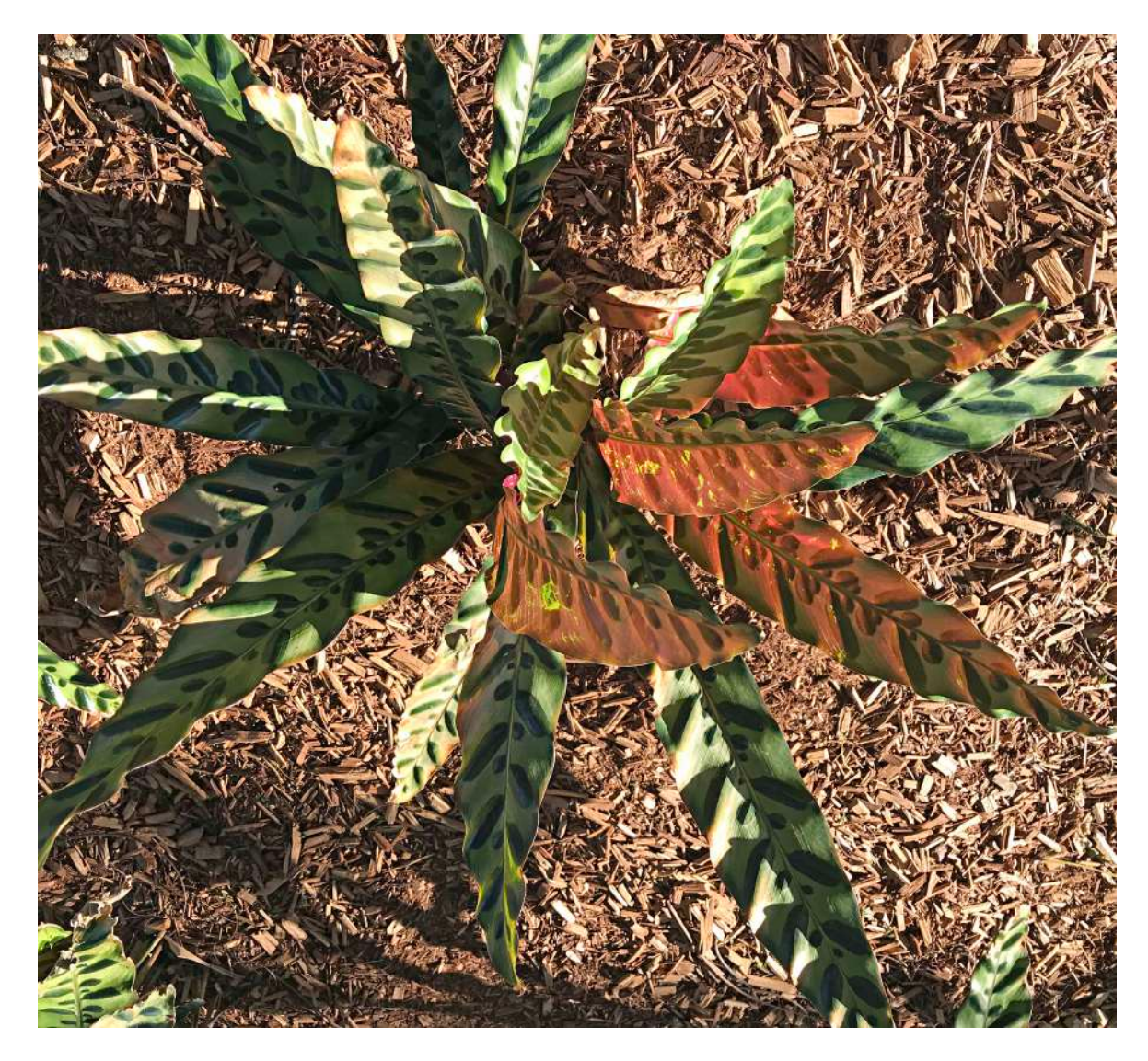
Rattlesnake Plant ( Calathea lancifolia ) Brazilian coloured foliage plant under the tree at the Poinciana Bar.