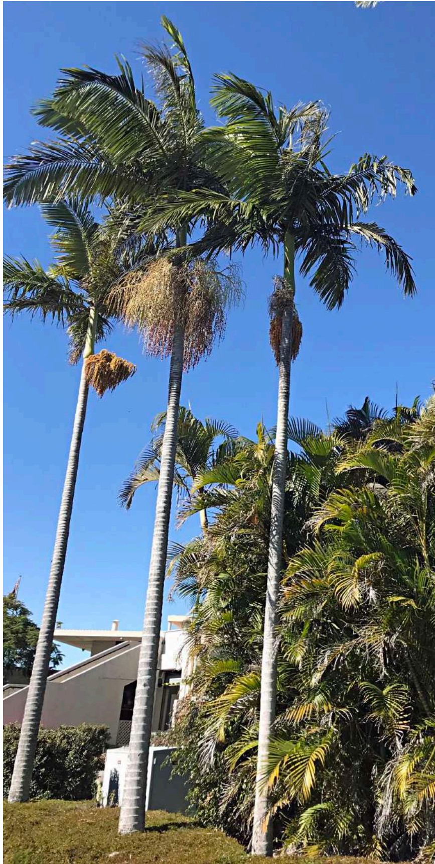
Bangalow Palm ( Archontophoenix cunninghamiana ) A small group of tall slender SEQ palms on the Western side of the Clubhouse surrounds.