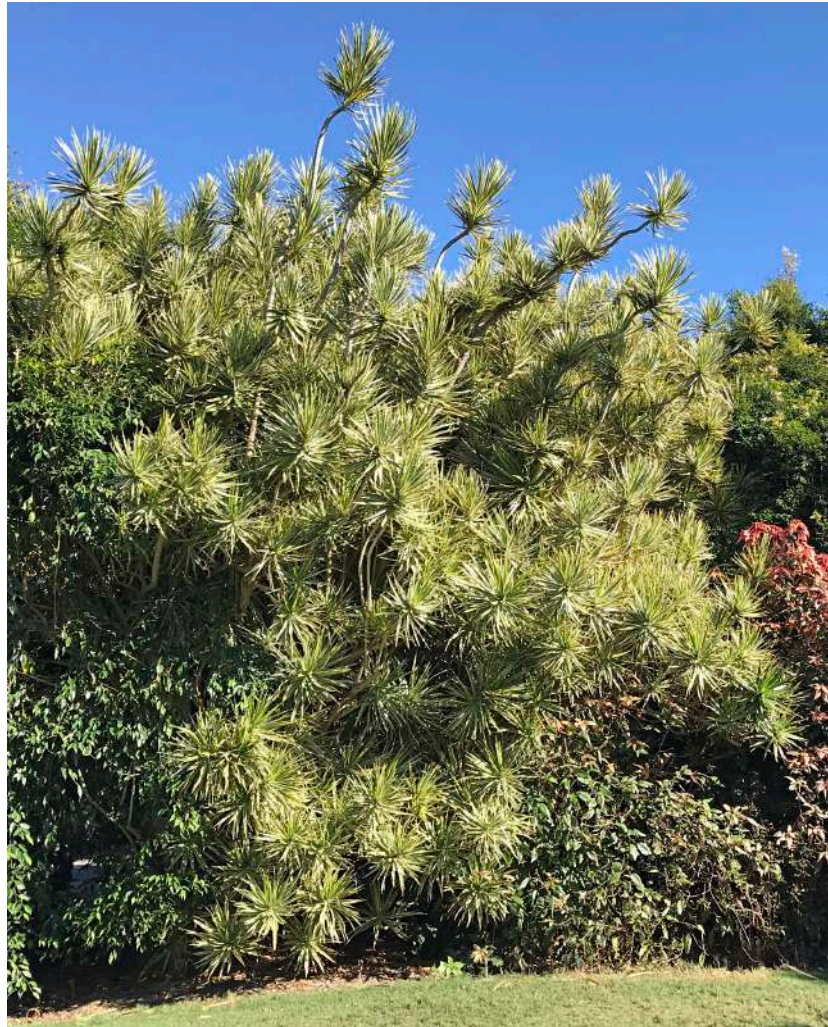
Dragon Tree ( Draceana marginata ) A Madagascan tropical shrub planted on the RHS of the Gold 7 tee-block, with flower close-up below tee-block.