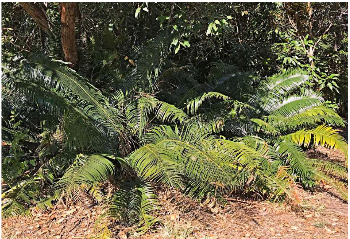
Burrawang ( Macrozamia communis ) A small clump of SEQ cycads planted on LHS Gold 7 fairway.