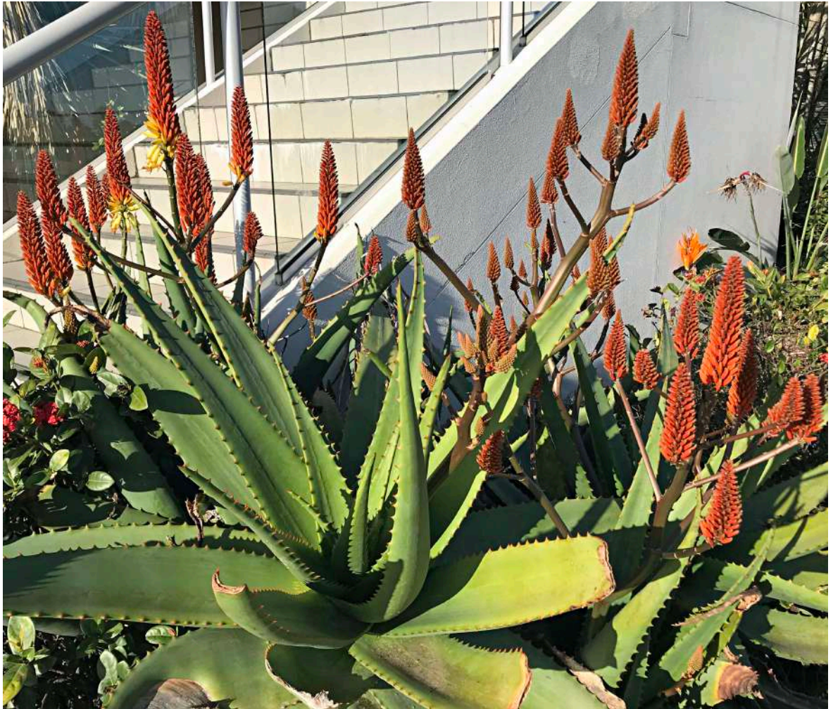
Candelabra Aloe ( Aloe arborescens ) A South African succulent with sharp spines (!), planted on the Southern side of the Clubhouse surrounds.