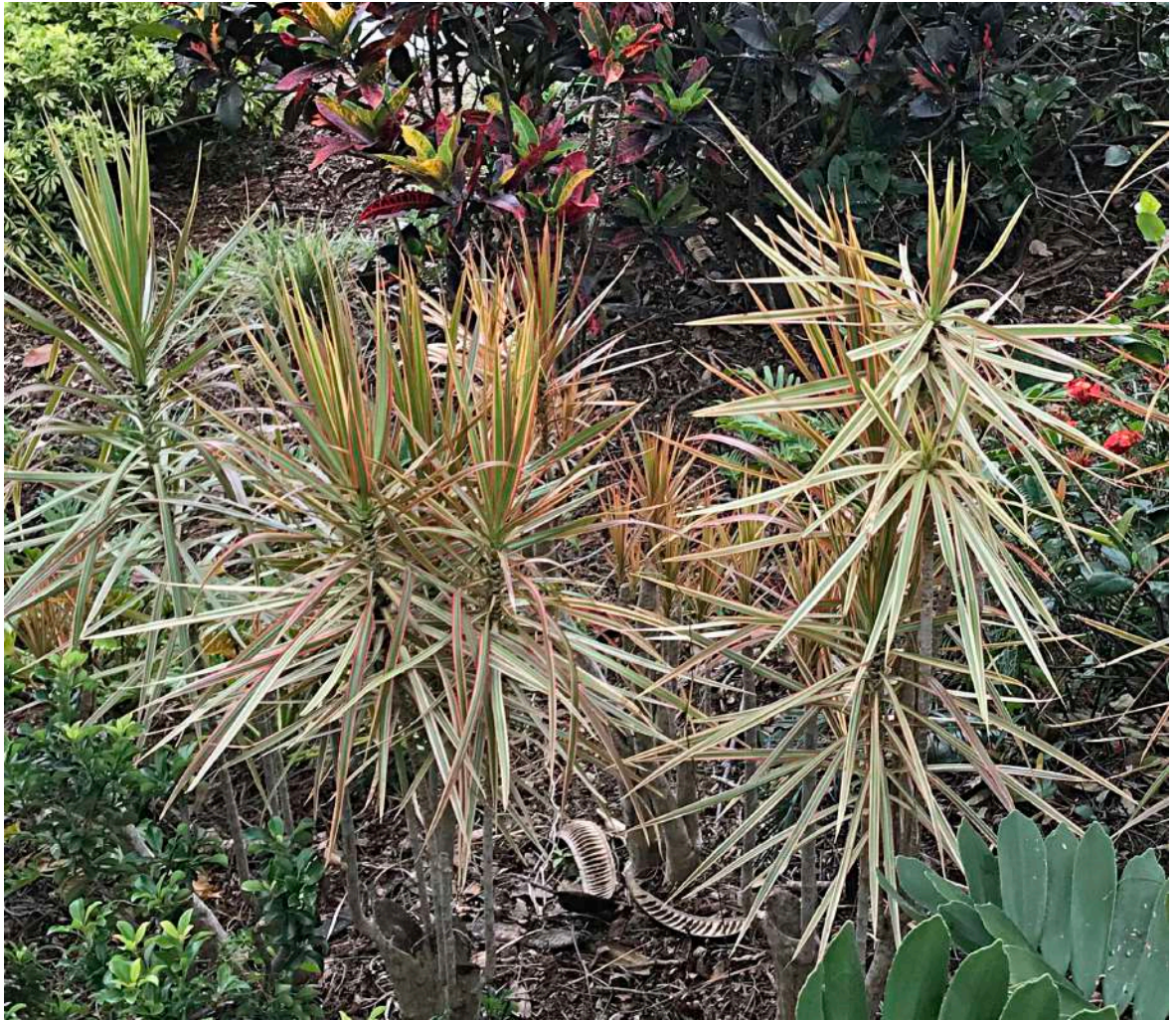
Dragon Tree Tricolor ( Draceana marginata cv. 'Tricolor') A cultivar of a Madagascan tropical shrub planted in the Clubhouse surrounds.