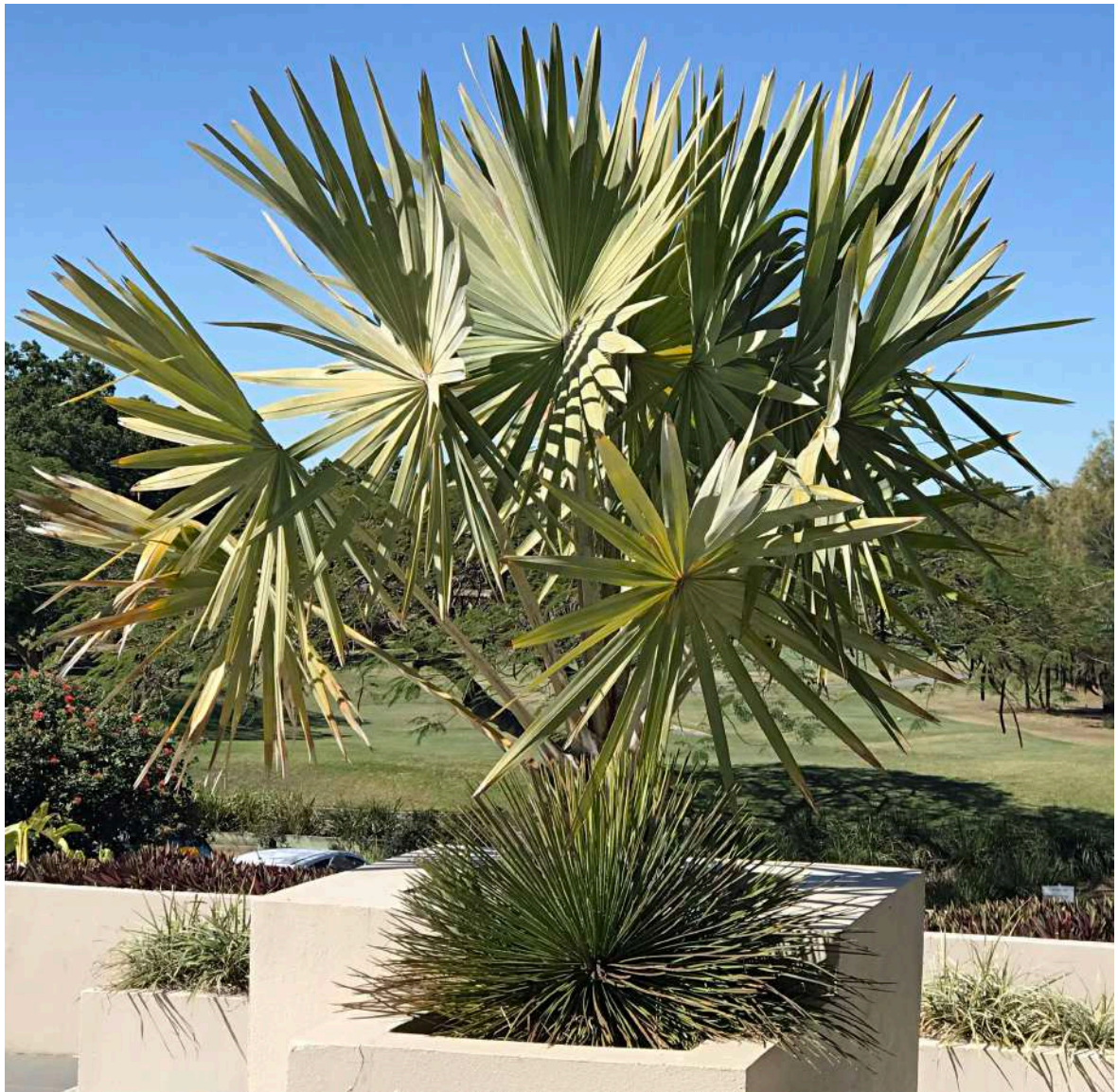
Bismarck Palm ( Bismarckia nobilis ) A small group of Madagascan palms in planters on the Northern side of the Clubhouse surrounds.