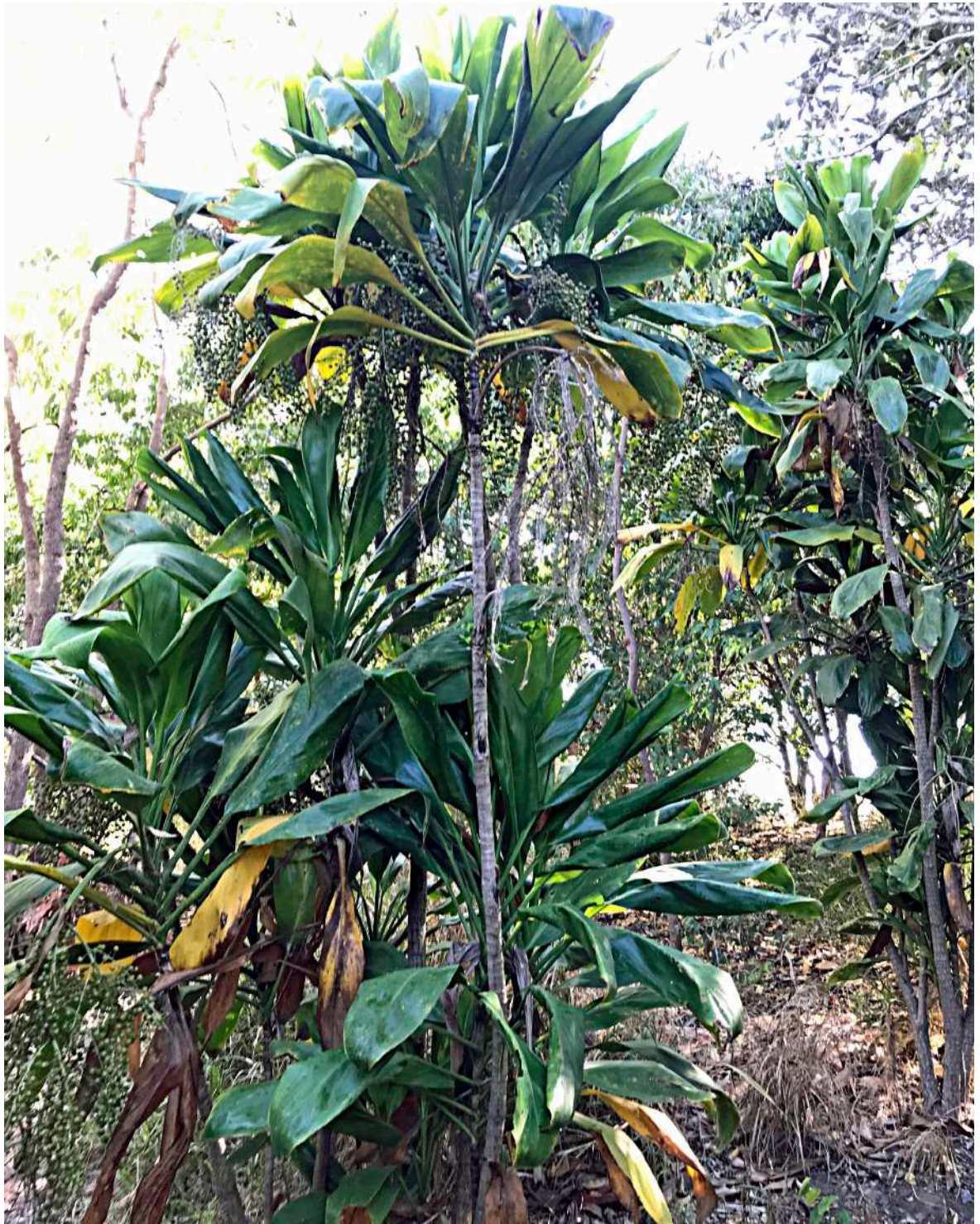
Broad-leaved Palm Lily ( Cordyline manners-suttoniae ) An SEQ native planted on RHS path from Red 3 to Red 4.