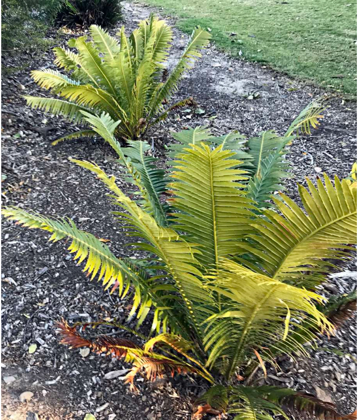
Cardboard Cycad ( Zamia furfuracea ) A Mexican cycad, planted on the KHS of the Gold 6 tee-box.