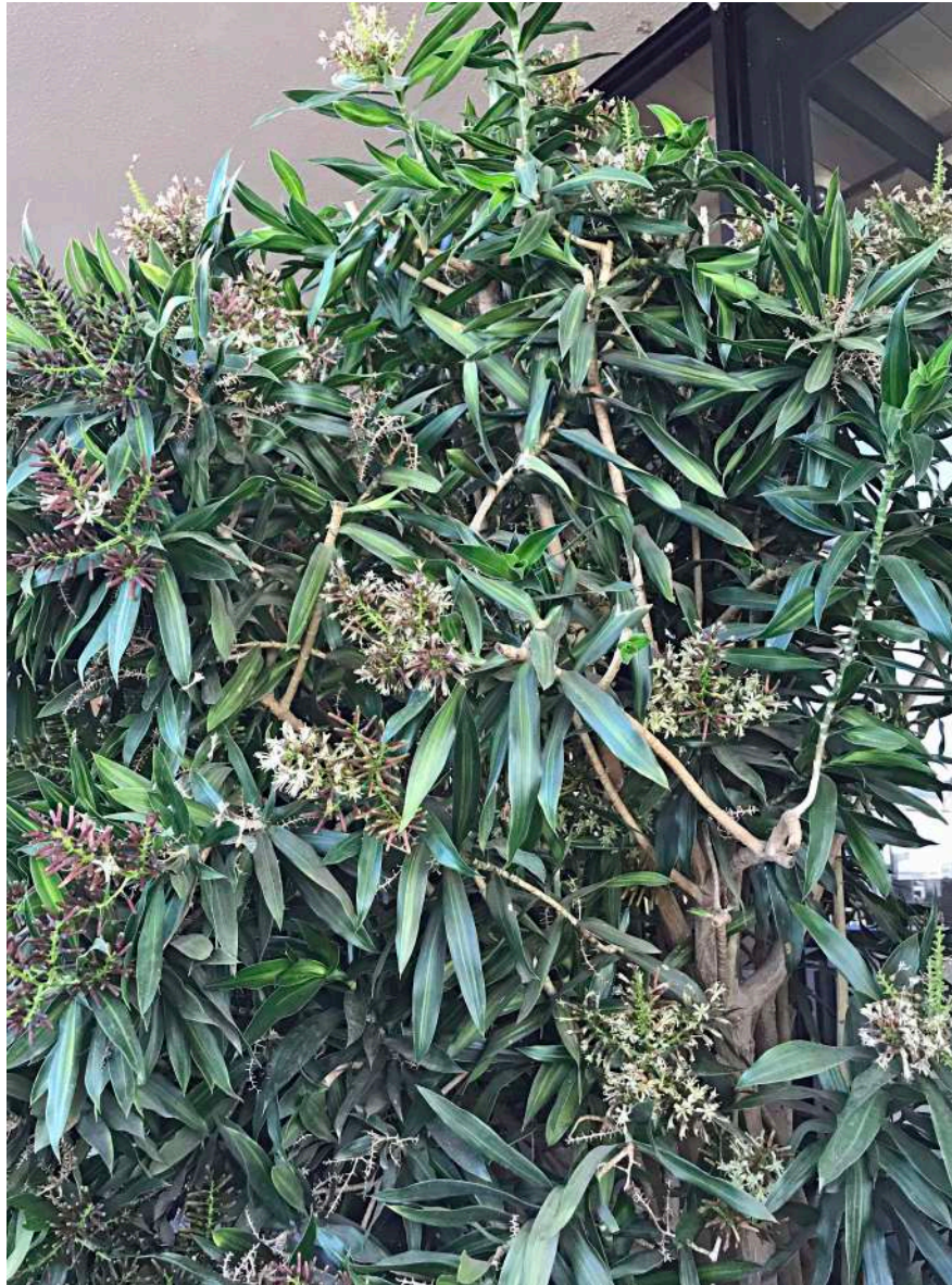
Fragrant Draceana ( Draceana fragrans ) A West African tropical planted in the Clubhouse surrounds, with flower close-up below.