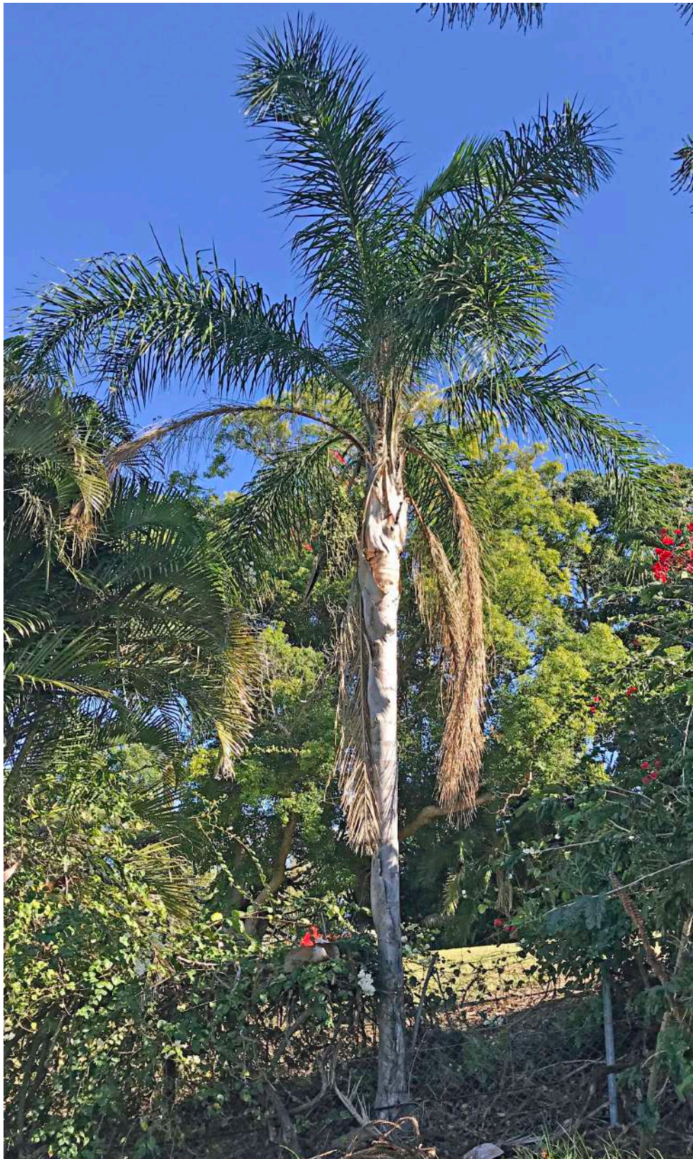
Cocos Palm ( Syagrus romanzoffianum ) A garden-escape Cocos Island Palm growing along the river and on the LHS Red 6 tee-block.