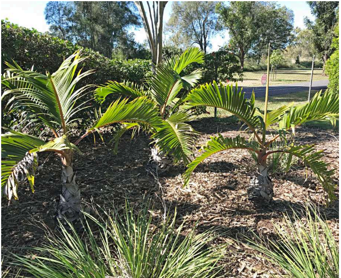
Bottle Palm ( Hyophorbe lagenicaulis ) A small clump of palms from Mauritius in the garden on the LHS of the entry driveway.