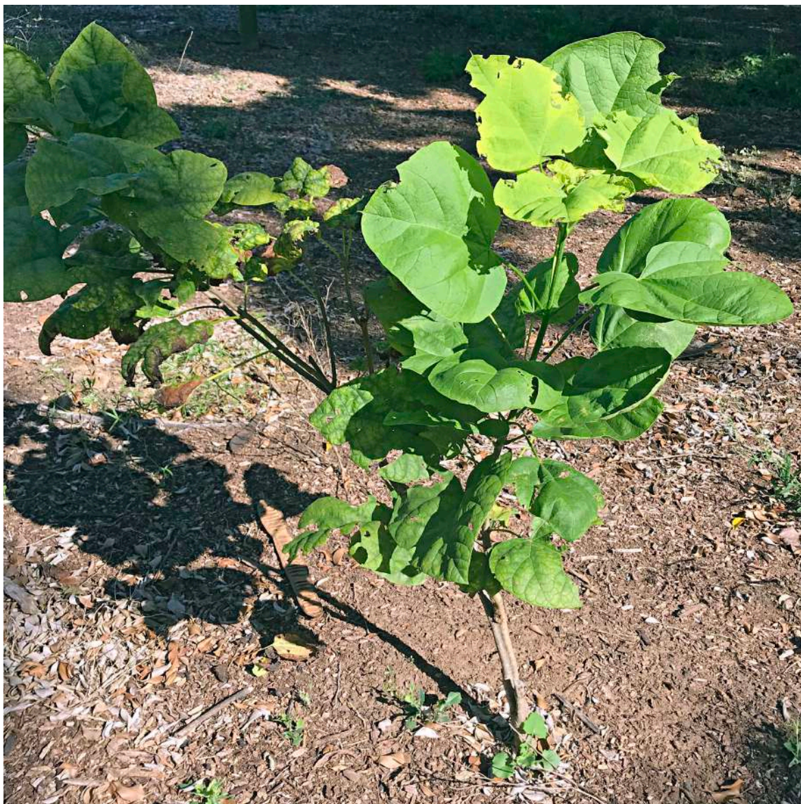
Empress Tree ( Paulownia tomentosa ) A young tree planted on the RHS Green 9, near the green in the shade of the Weeping Figs.