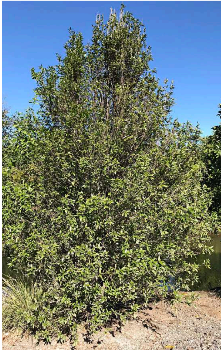
Deep Yellowwood ( Rhodosphaera rhodanthema ) A single tree planted on the LHS Red 1 fairway near the pond, with leaves close-up below.