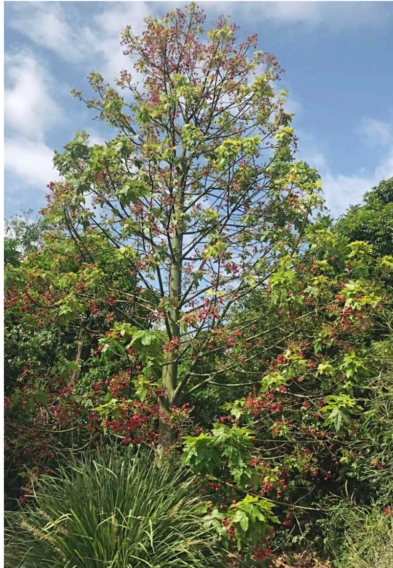
Griffith Pink Kurrajong ( Brachychiton populneus x B. discolor ) A young hybrid tree planted on the RHS Red 8 pathway to the Red 9 tee-block, with flower close-up below.