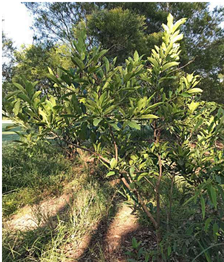
Koda ( Ehretia acuminata ) Above is a young tree planted along the RHS Green 5 fairway, with a flower close-up from an older tree behind the Gold 5 green below.