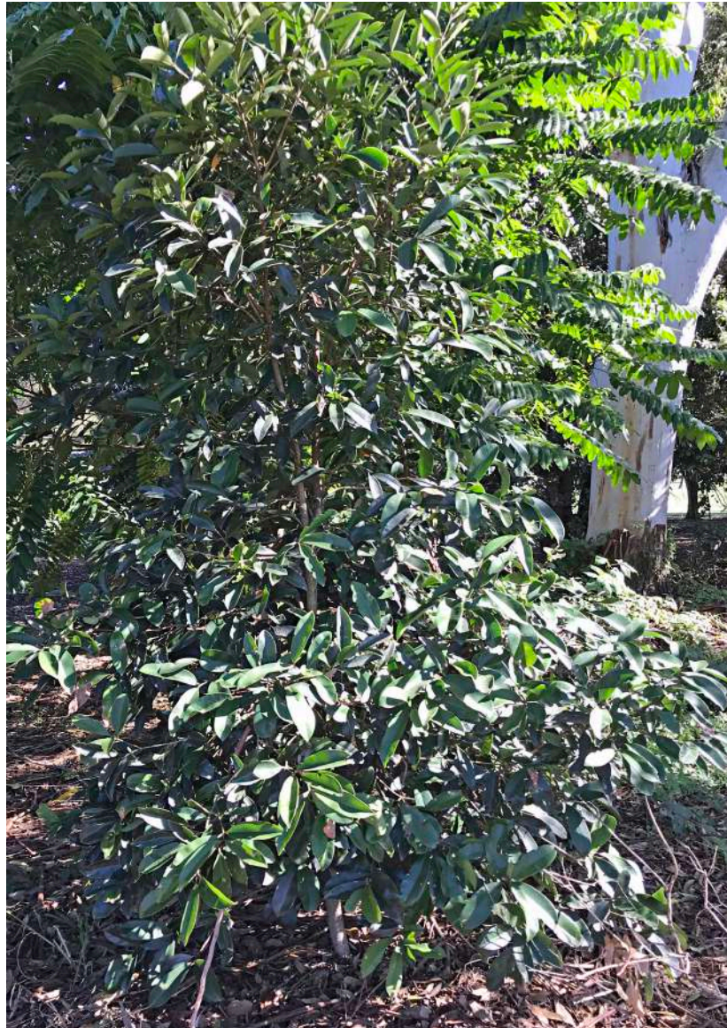
Durobby ( Syzygium moorei ) A young tree planted on the RHS Red 8 fairway, with close-up of leaves below.