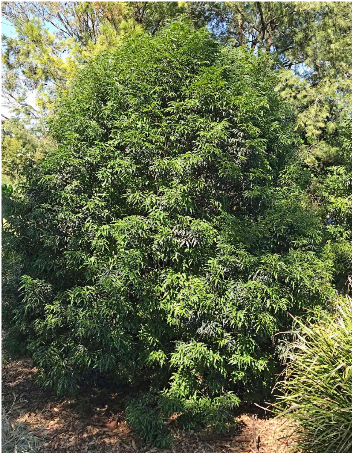
Fine-leaved Tuckeroo ( Lepiderema pulchella ) A prominent row of trees with attractive new foliage on the LHS of Red 5 men's tee-block.