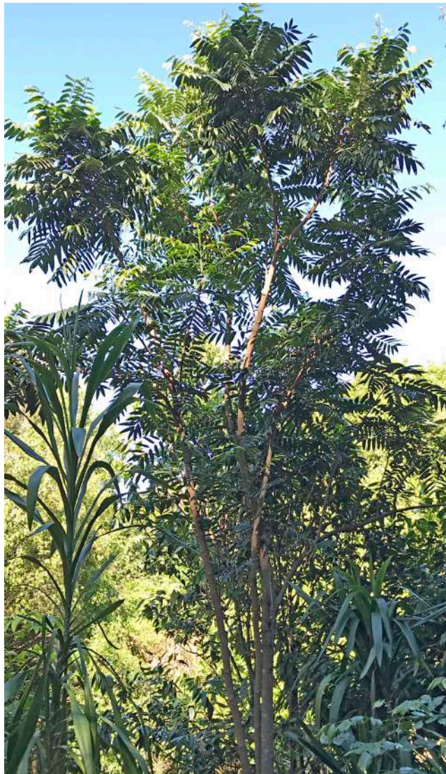
Hairy Rosewood ( Dysoxylum rufum ) A young tree planted between Red 3 & 4, with leaves & flower close-up below.