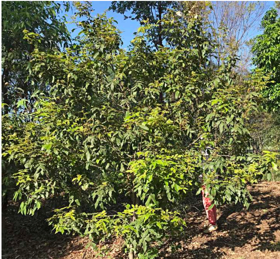
Hairy Alectryon ( Alectryon tomentosus ) A young tree planted on the LHS Green 5 fairway, with leaves & flower close-up below.