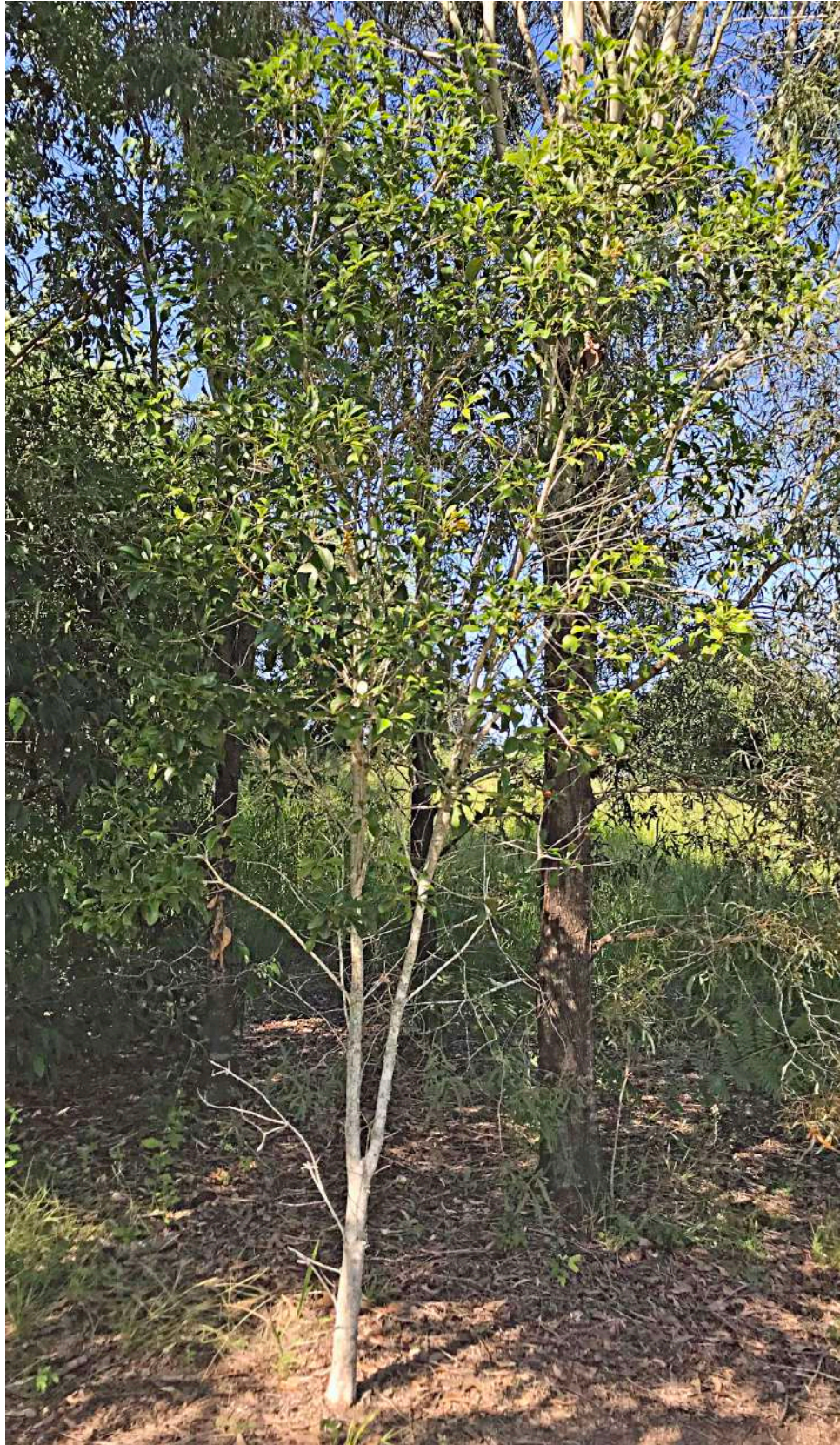
Diamond Pittosporum ( Auranticarpa rhombifolia ) A young tree planted on the RHS Green 8 fairway.