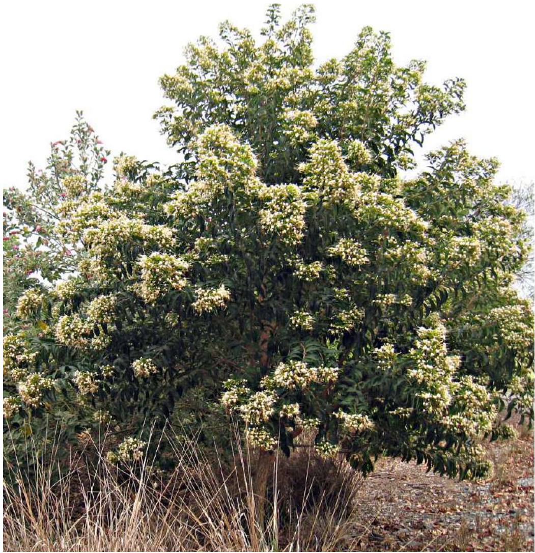
Hairy-leaved Lollybush ( Clerodendron tomentosum ) A young tree planted along the LHS Red 1 fairway.