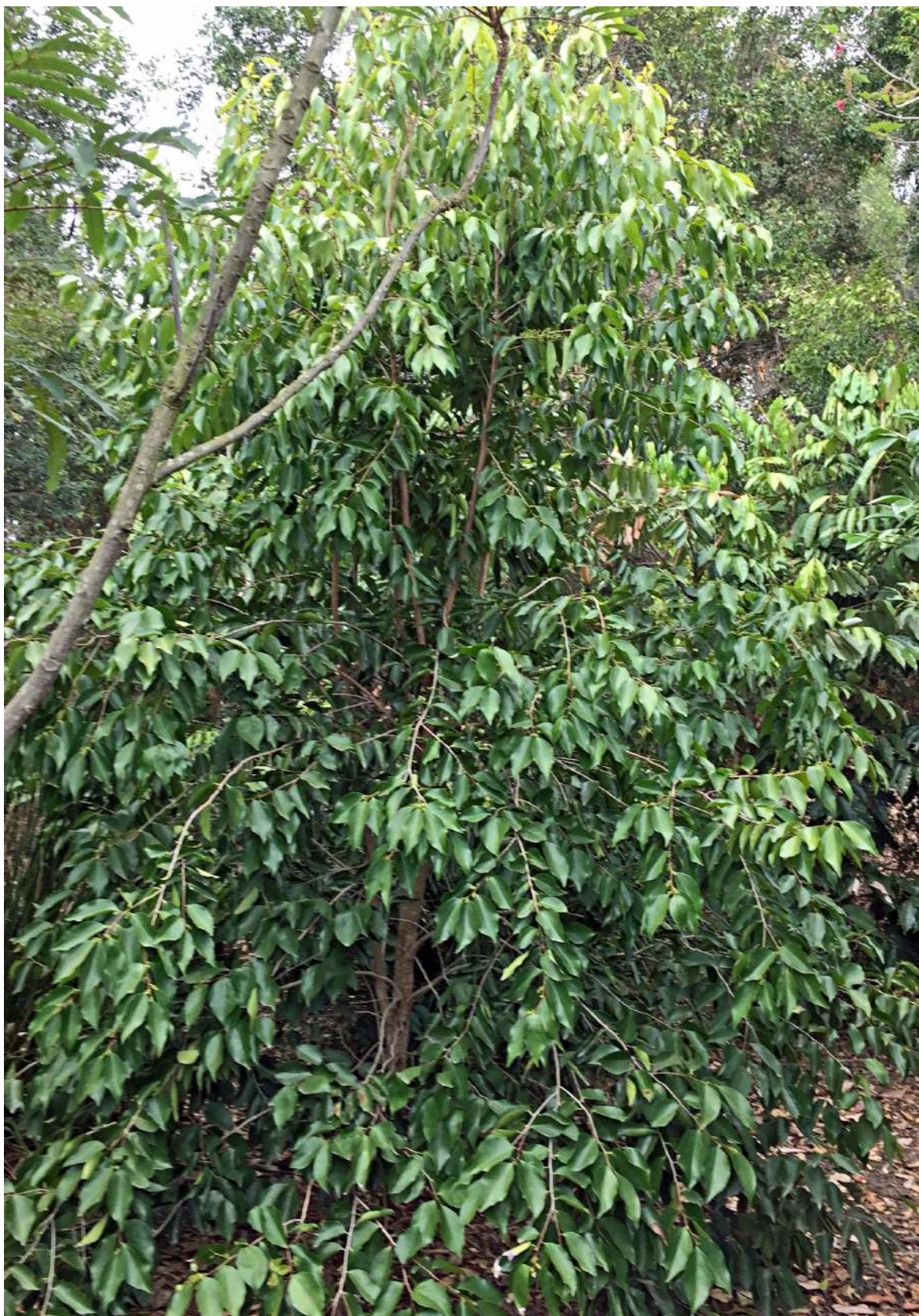
Flintwood ( Scolopia braunii ) A local rainforest tree planted (pJW) on the LHS of Red 4 men's tee-block.