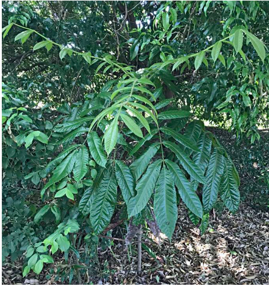
Davidson's Plum ( Davidsonia pruriens ) A young tree planted on the RHS Red 4 in front of tee-block, with leaf close-up below.