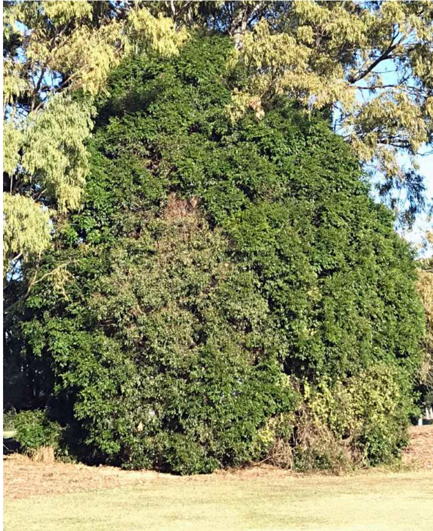
Giant Water Gum ( Syzygium francisii ) A young tree on the RHS Gold 2 women's tee, with close-up of leaves & fruit below.