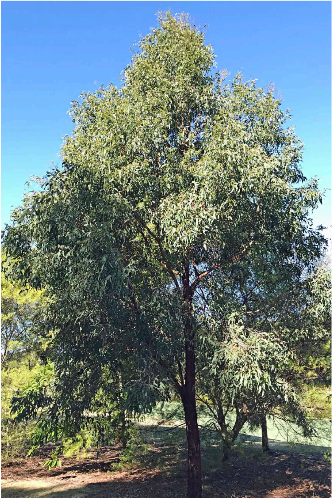
Grey Ironbark ( Eucalyptus siderophloia ) A young sapling planted on the LHS Red 6 fairway.