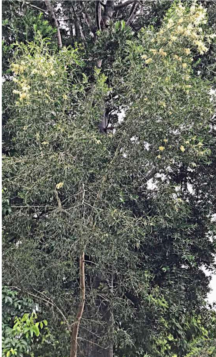
Hickory Wattle ( Acacia disparrima ) A young tree planted along the RHS Gold 6 fairway, with flower close-up below.