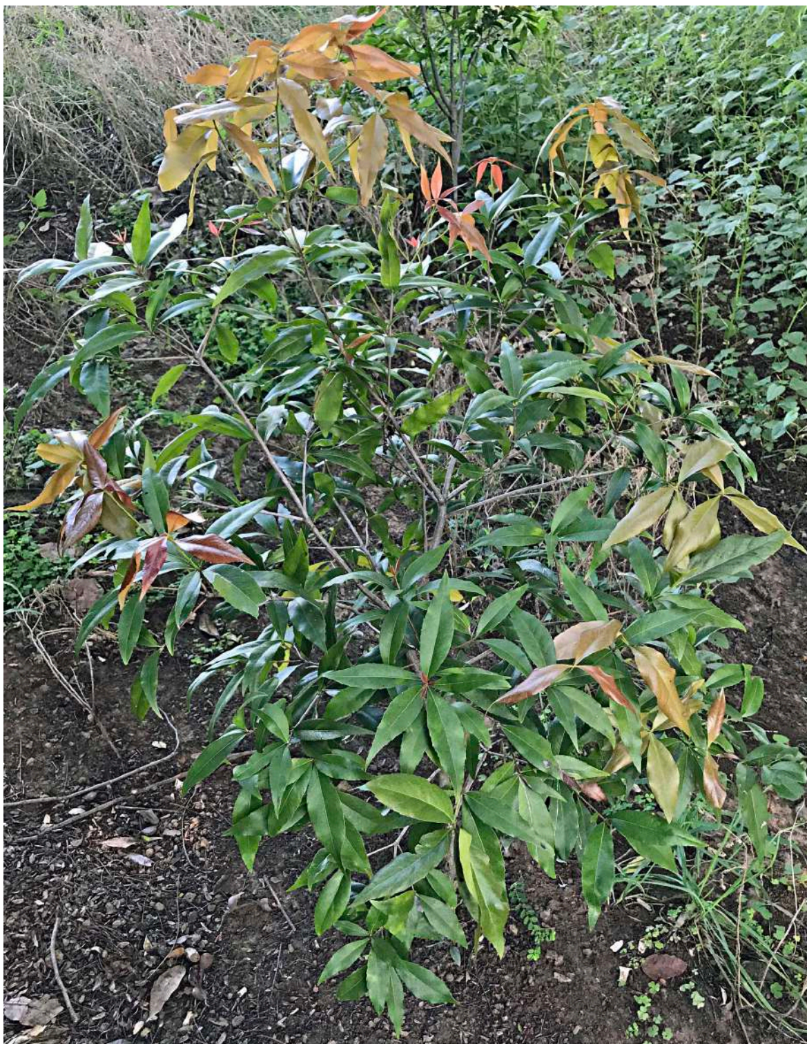
Denhamia ( Denhamia celastroides ) A young tree planted on the LHS Green 5 fairway.