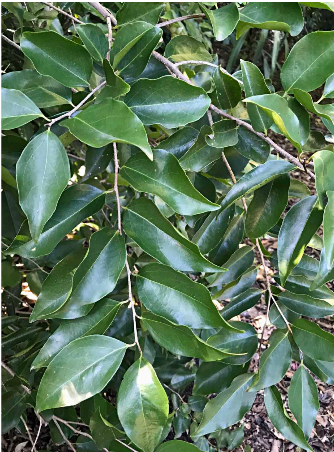
Glossy Laurel ( Cryptocarya laevigata ) A young tree on the RHS Red 4 men's tee.