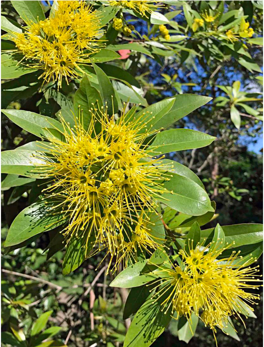
Golden Penda ( Xanthostemon chrysanthus ) A number of trees with bright yellow flowers in Autumn are planted widely across the Blue and Green nines.