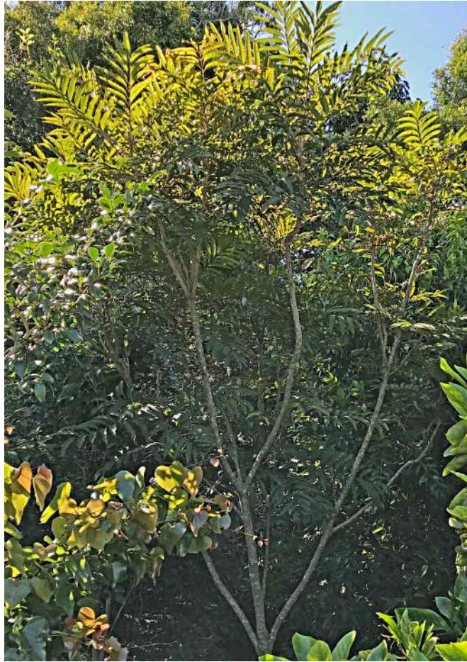
Corduroy Tamarind ( Mischarytera lautereriana ) A young tree planted on the RHS of Red 4 tee-block, with new leaves & fruit close-ups below.