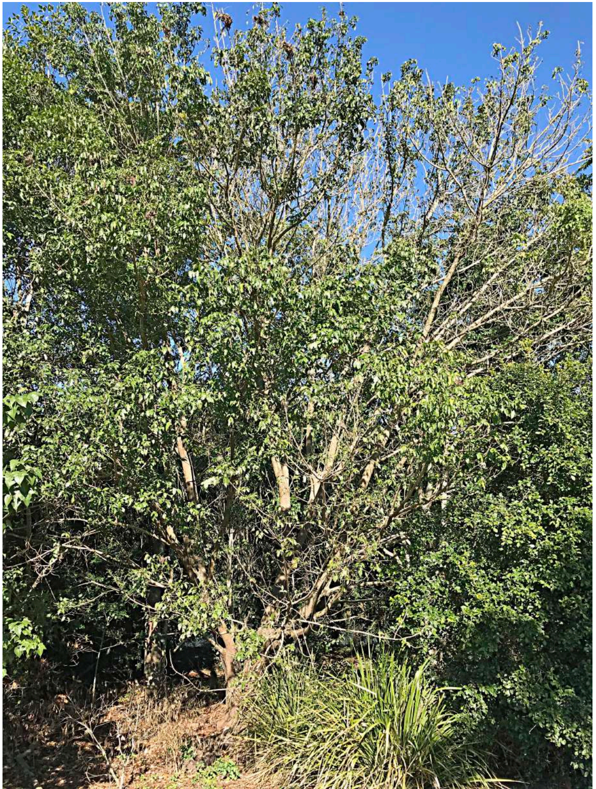
Coogera ( Arytera divaricata ) A young tree planted on the LHS of Red 1 fairway, near the approach to the green.