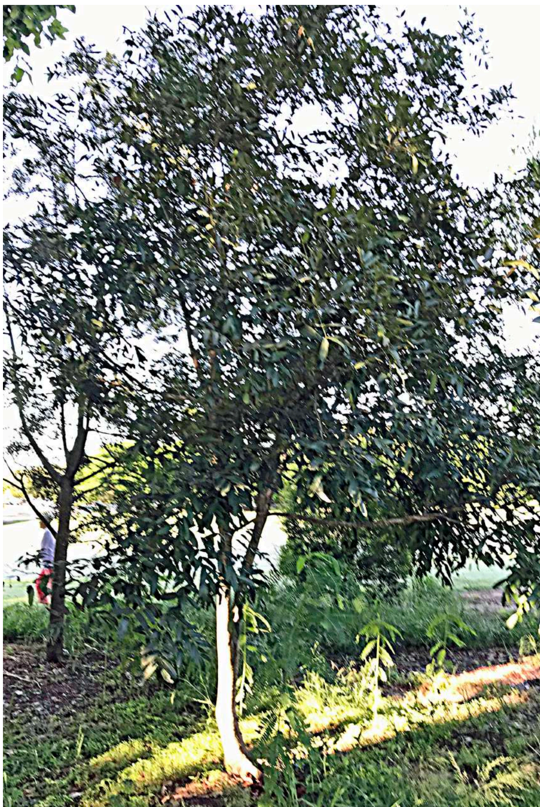
Hairy Walnut ( Endiandra pubens ) A young tree planted along the LHS Green 5 fairway.