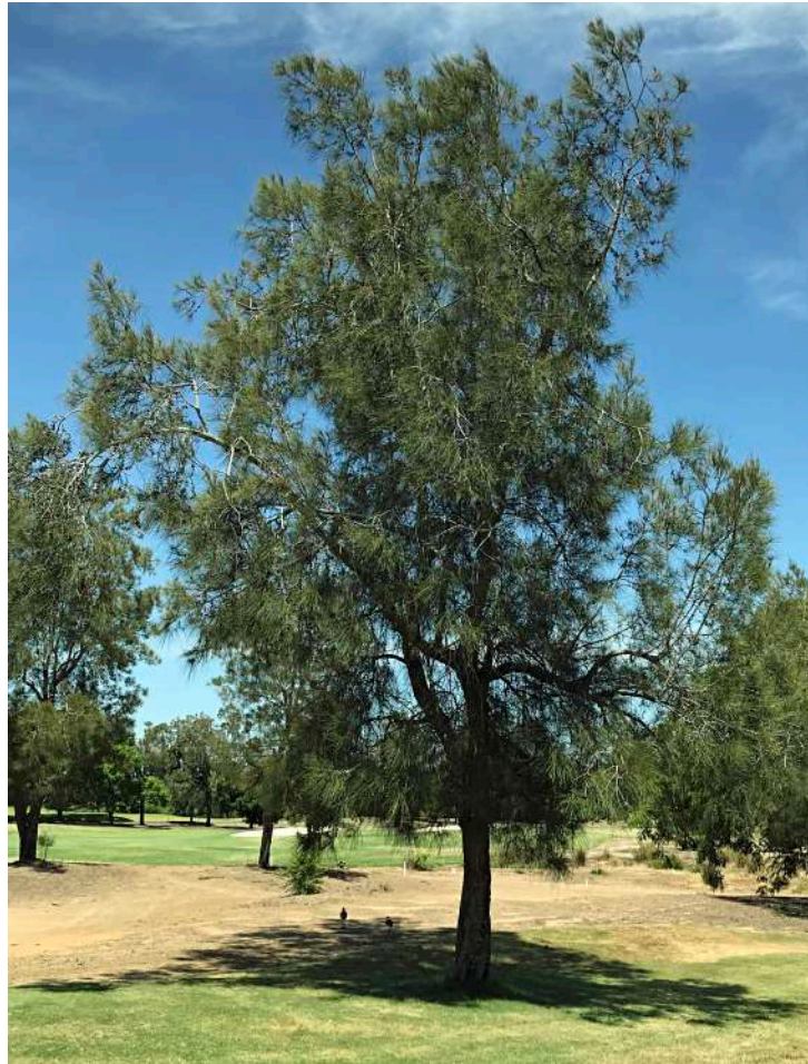
Forest She-oak ( Allocasuarina torulosa ) A group of trees planted on the LHS Blue 4, with a close-up of cones below.