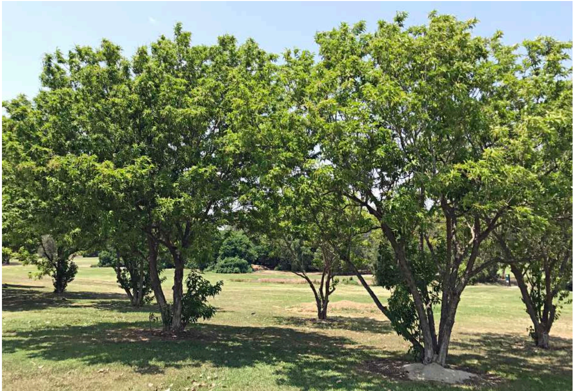
Fiddlewood ( Citharexylum spinosum ) A small group of trees planted on the RHS Blue 1, with close-up of leaves & flower buds below.