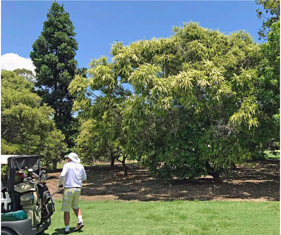
Ivory Curl flower ( Buckinghamia calssissima ) A tree planted on the RHS of Gold 7 fairways, with a close-up of flowers below.