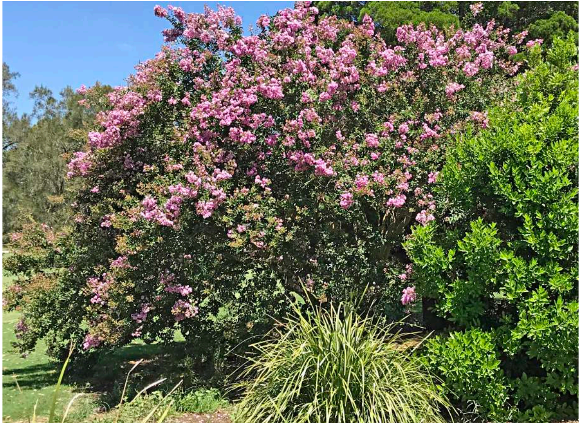
Crape Myrtle Pink ( Lagerstroemia indica ) A prominent row of trees defining the LHS Gold 8 between tee-block and green.