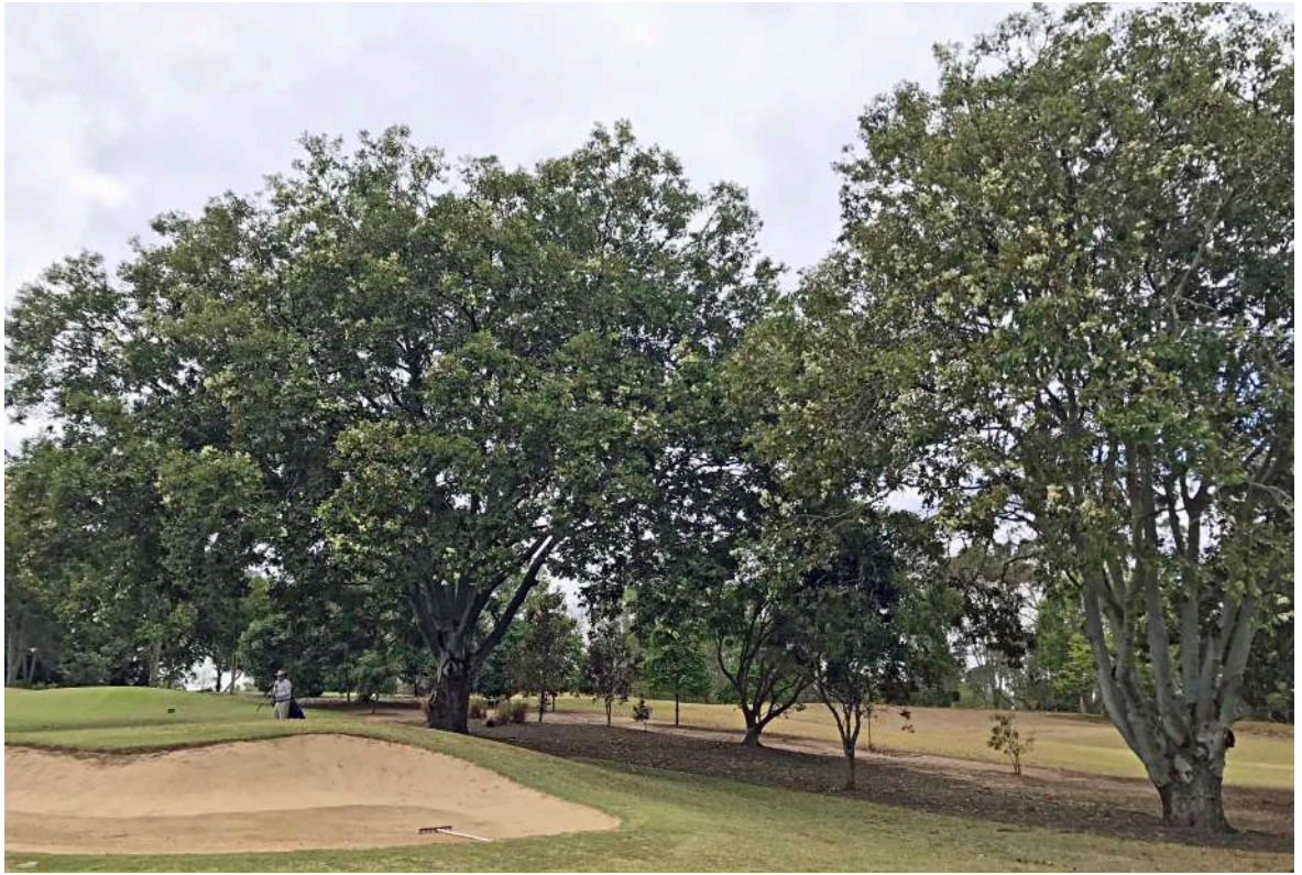
Cadaghi ( Corymbia torelliana ) A small group of trees on RHS Green 1 fairway, with flowers close-up below.