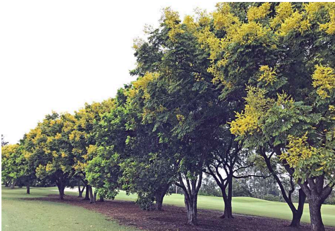
Golden Rain Tree ( Koelreuteria elegans ) A row of trees planted between Gold 2 and 3 fairways, with a close-up of flowers below.