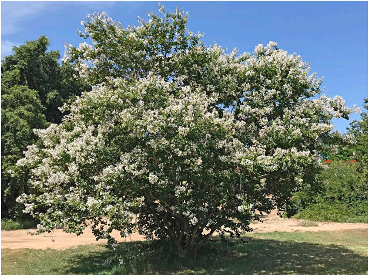
Crape Myrtle White ( Lagerstroemia cv acoma ) A prominent flowering tree on the LHS Gold 8 between tee-block and green.