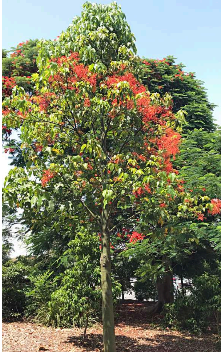
Flame Tree ( Brachychiton acerifolius ) A January-flowering tree planted on the LHS Blue 9, with a close-up of flowers below.