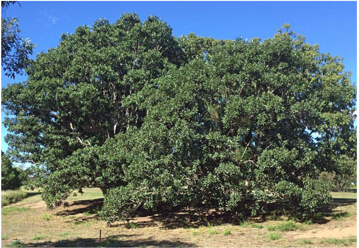
Broad-leaved Fig ( Ficus platypoda ) A small group of trees on RHS Green 4 fairway, with fruit and leaves close-up below.