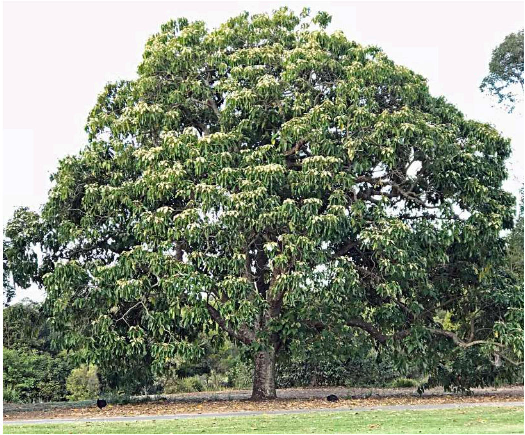
Candlenut Tree ( Aleurites moluccanus ) A small group of three trees on LHS Gold 7 fairway, with flowers and young fruits close-up below.