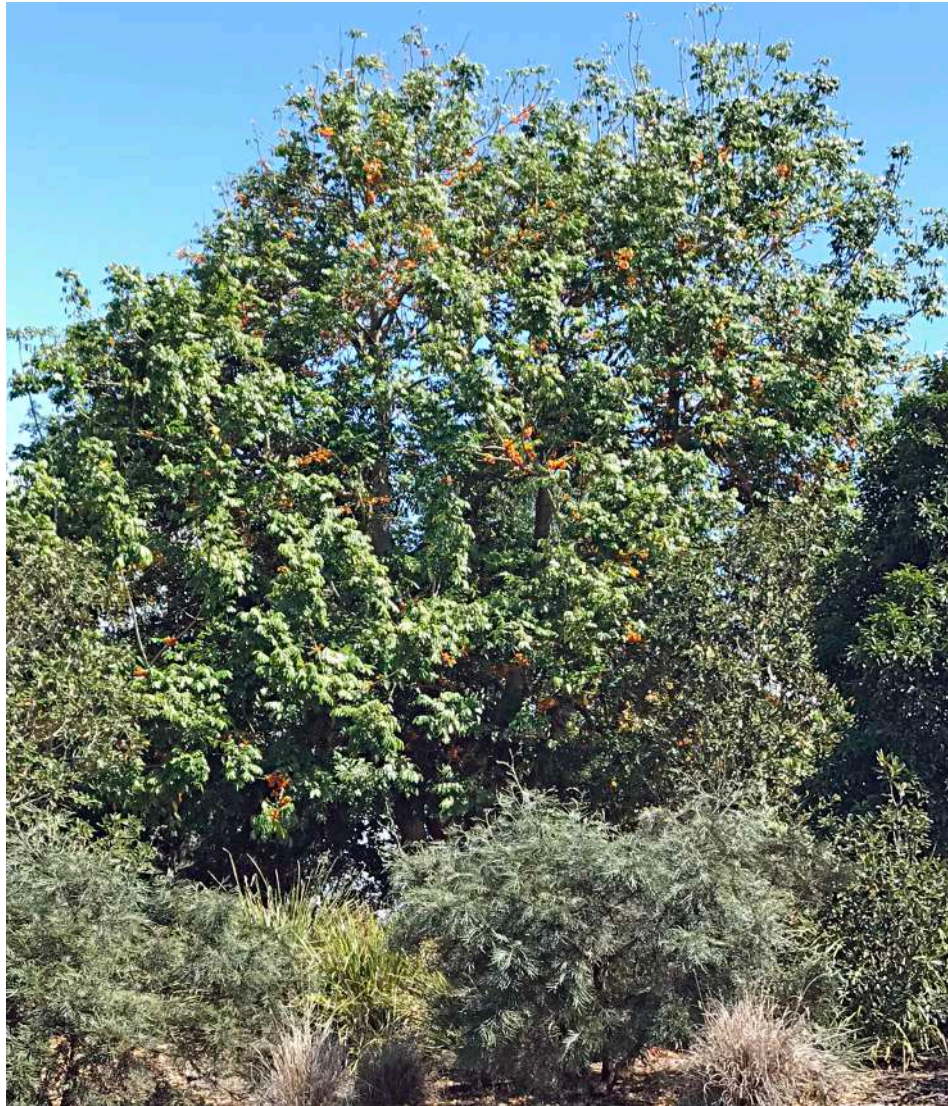
Black Bean ( Castanospermum australe ) A small group of trees behind the Red 3 green, with flower close-up below.