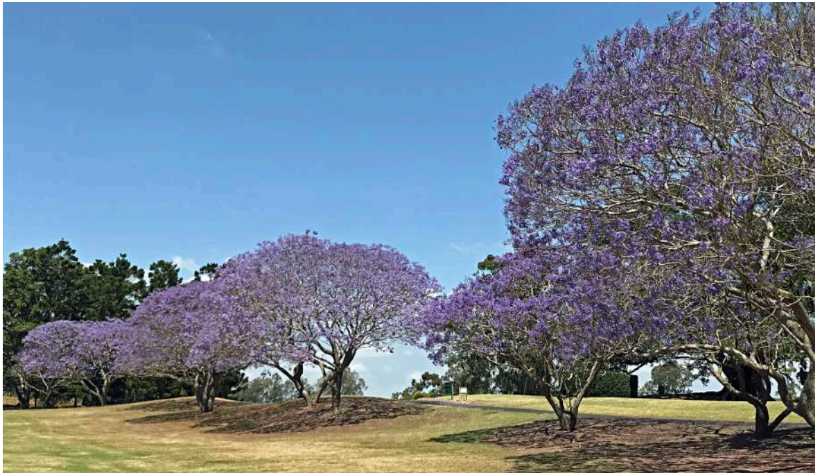
Jacaranda ( Jacaranda mimosiifolia ) A row of several trees between Blue 1 and 9 fairways, with a close-up of flowers below.