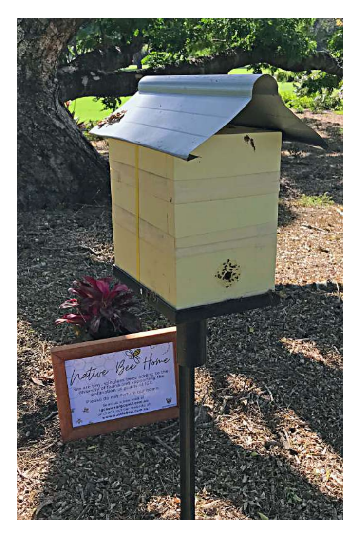
Sugarbag Stingless Bee ( Trigona carbonaria ) Two hives have been recently introduced to IGC via Adrian Levido, one of which is located on the RHS Gold 2 mens tee-block, under the Sirrus tree (above), with close-up of bees below.