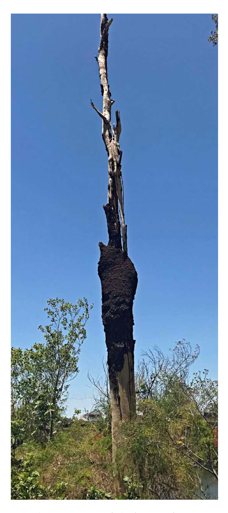
Trunk-gallery Termite ( Nasutitermes species) These termites construct an arboreal nest and maintain contact with the ground by external galleries running down the trunks of trees. This example is on the LHS of Gold 2 fairway, along the Brisbane River bank. Others can be seen on RHS of Red 9 fairway approaching the green.