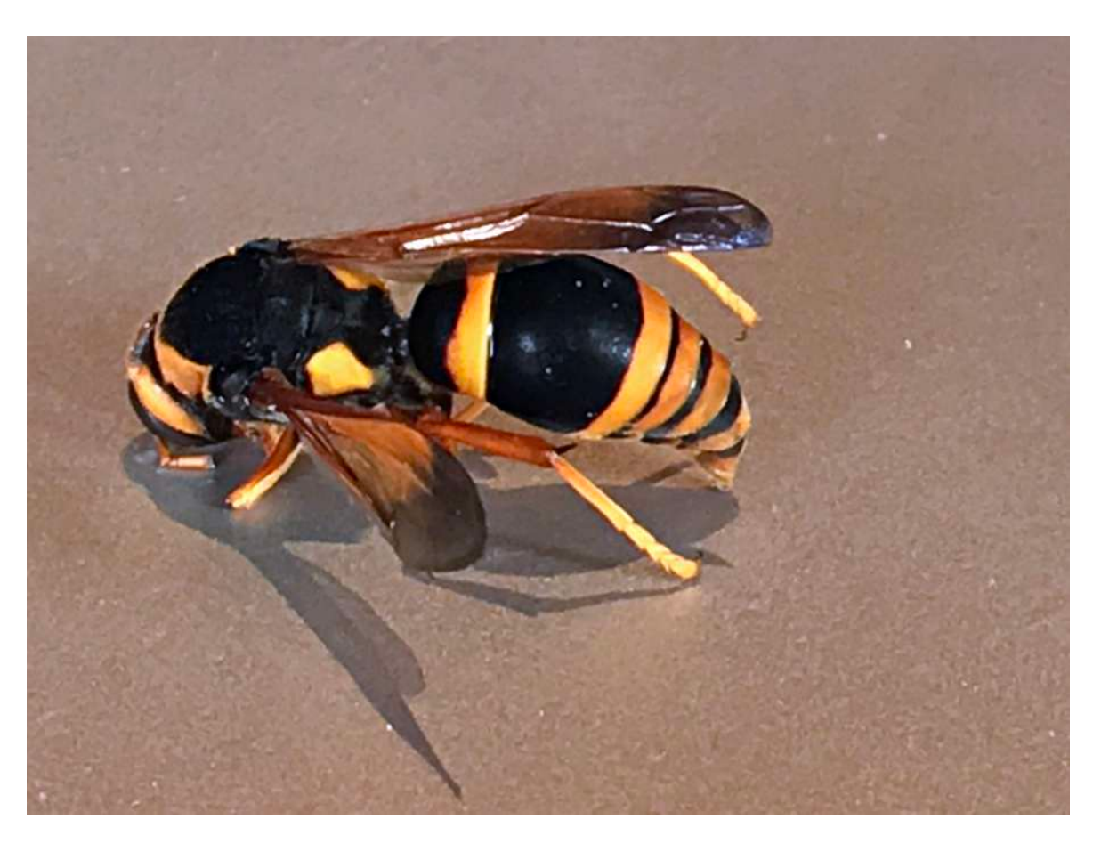
Potter Wasp (Abispa ephippium) This Potter Wasp was seen on the Red 1 fairway surrounds.