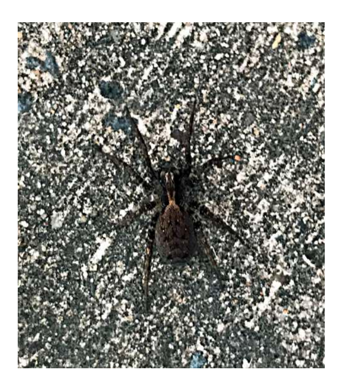
Wolf Spider ( Lycosidae species) The Wolf Spider above was observed crossing a concrete path near the Clubhouse. The one below was killed by an unknown hornet and being taken to it's nest near the tee-block on Red 8.