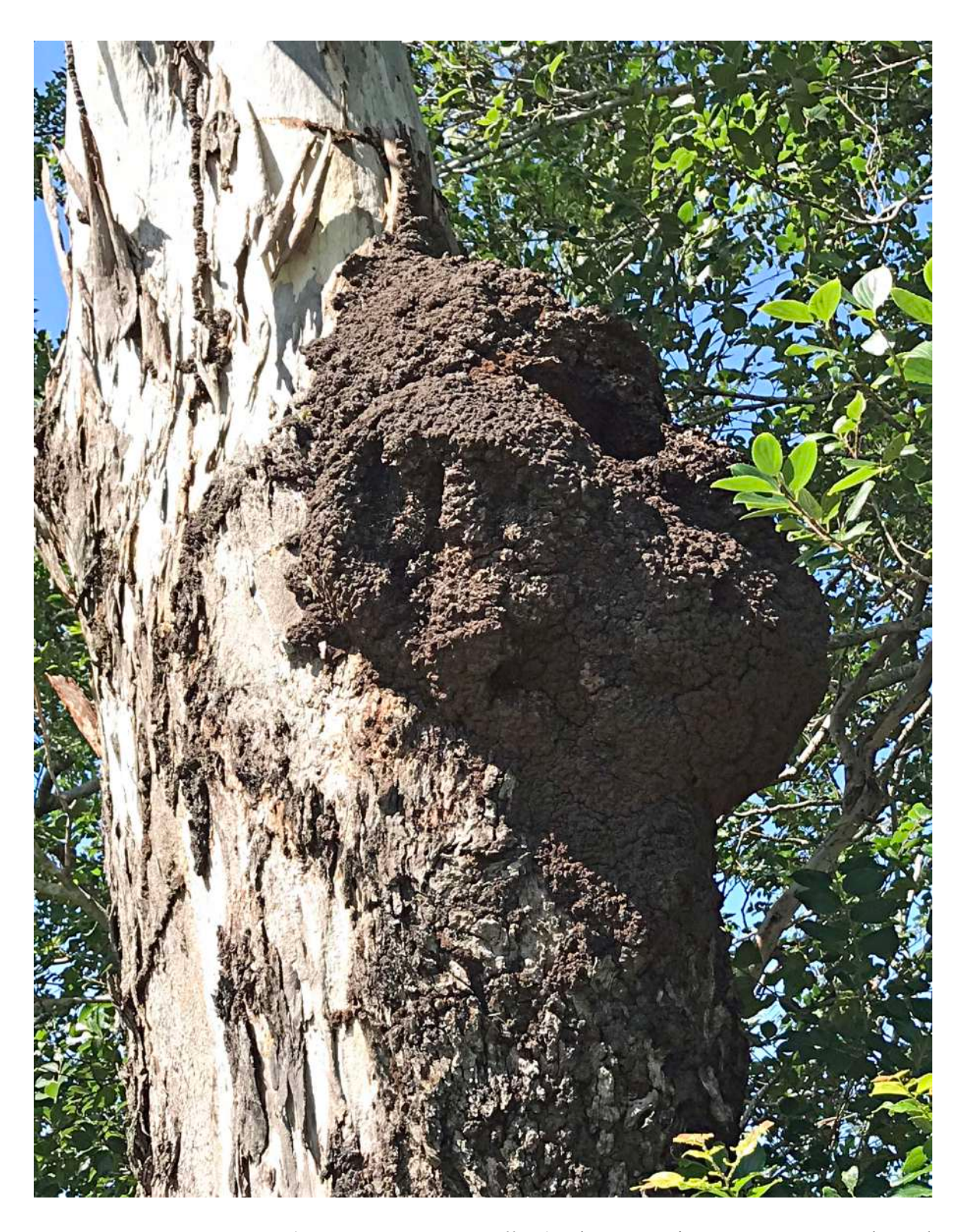
Trunk-nesting Termite ( Microceretermes walkeri ) These termites construct an arboreal nest on the trunks of living or dead trees with galleries running down to maintain ground contact. This example is on the LHS of Gold 3 fairway, along the Brisbane River bank, where a Sacred Kingfisher has made a nest in this termite nest.