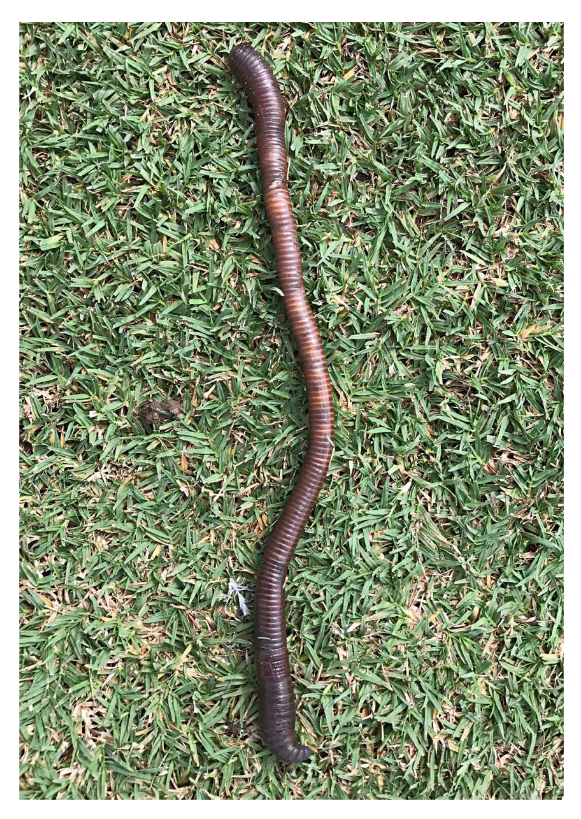
Giant Earthworm ( Heteroporodilus tryoni ) Giant Earthworms, growing up to 50cm long (this fine specimen was about 30cm) are also seen crossing fairways after rain. It is amazing that, so far, they have avoided the notice of the birds!