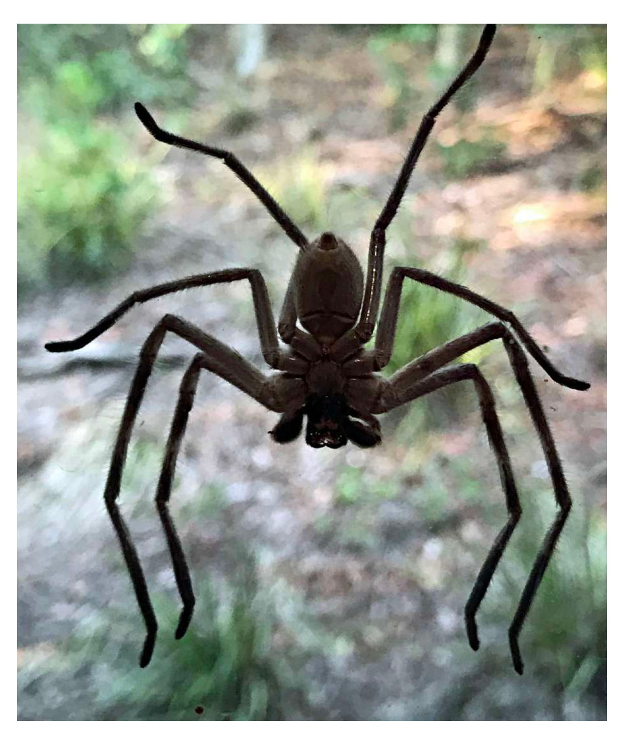
Brown Huntsman Spider ( Heteropoda jugulans ) This Spider was observed near the sand locker on RHS Gold 5 tee-block.