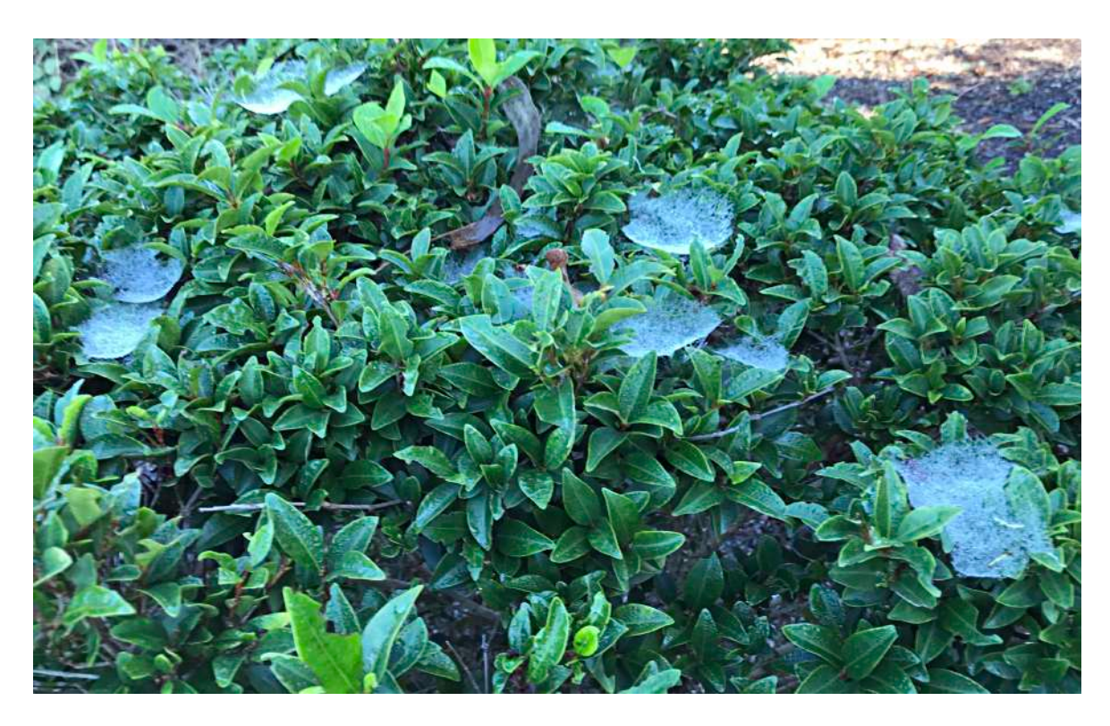
Morning Jewels ( Venonia micarioides ) The webs of the spiders known as Morning Jewels are often seen over shrub canopies when dew has occurred in the early morning, usually in Summer. This image was recorded on the LHS of the path from Red 9 green back to the clubhouse.