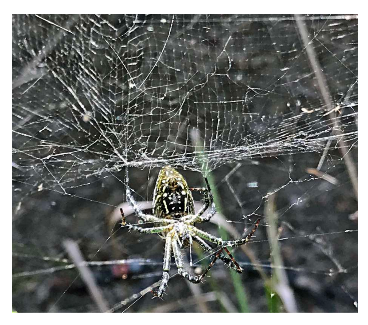
Dome-web Spider ( Cyrtophora moluccensis ) This Spider is commonly observed among shrubs in garden areas.