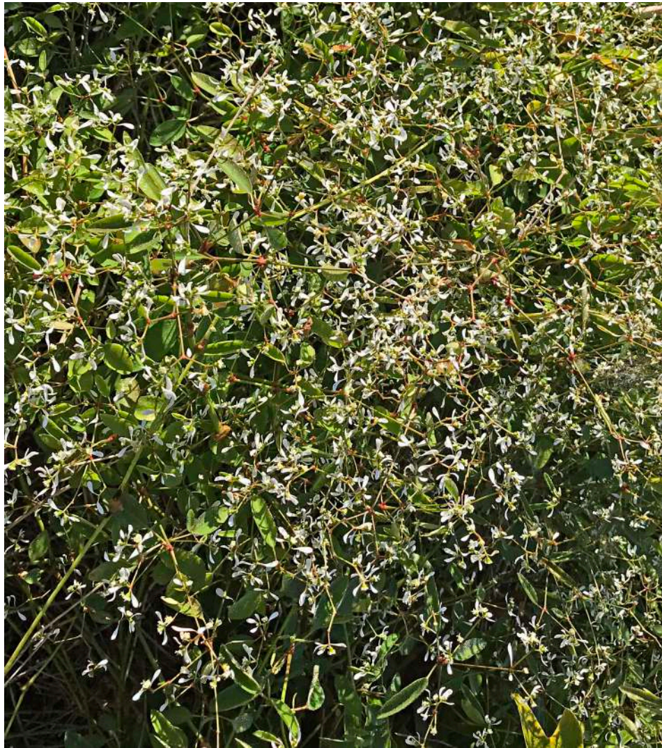
Diamond Frost ( Euphorbia hypericifolia cultivar) This Central American herb is planted in the Remembrance Garden near the Clubhouse entry, with close-up below.