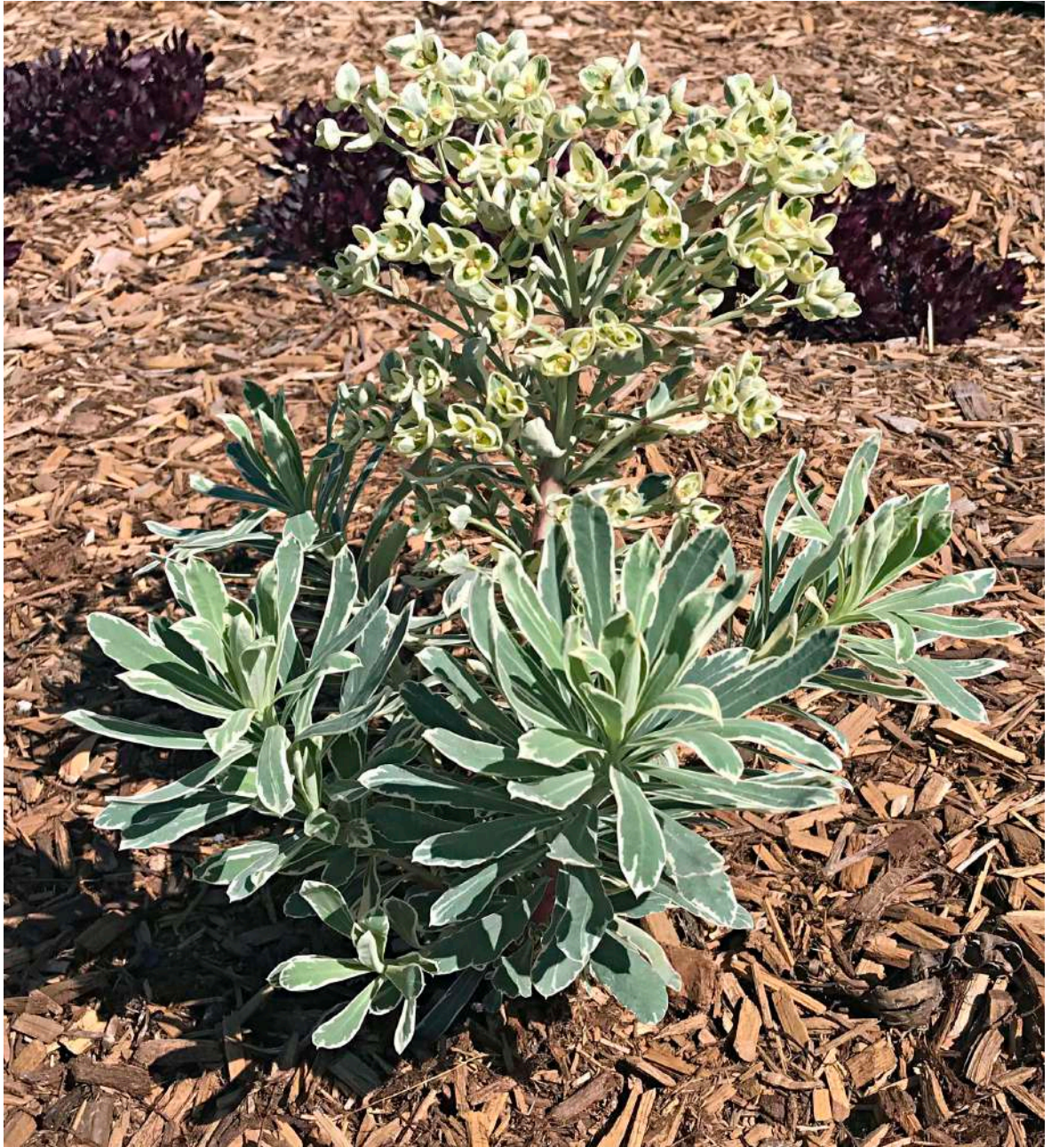
Silver Spurge ( Euphorbia cultivar) This Mediterranean herb is planted in the Poinciana Bar gardens.