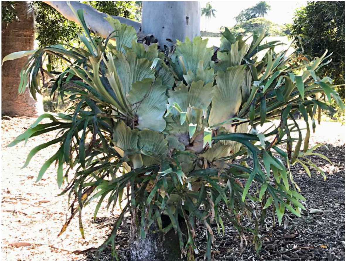
Elkhorn ( Platycterium bifurcatum ) This SEQ native fern is growing as an epiphyte on the trunk of a Moreton Bay Ash on the RHS of the approach to the Red 5 green.