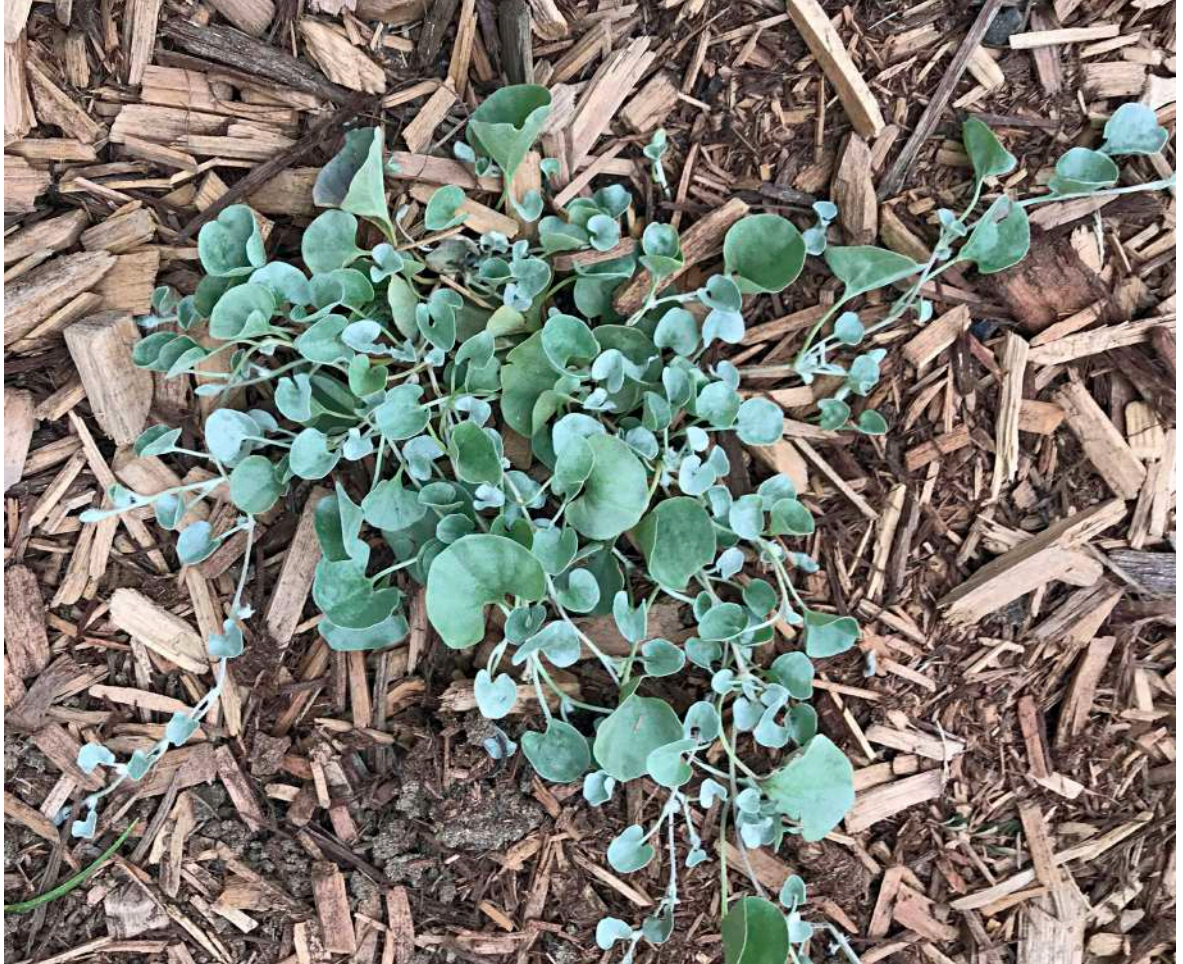
Silver Falls ( Dichondra argentea cultivar) This Central American cascading herb is planted in the new Poinciana Bar gardens.