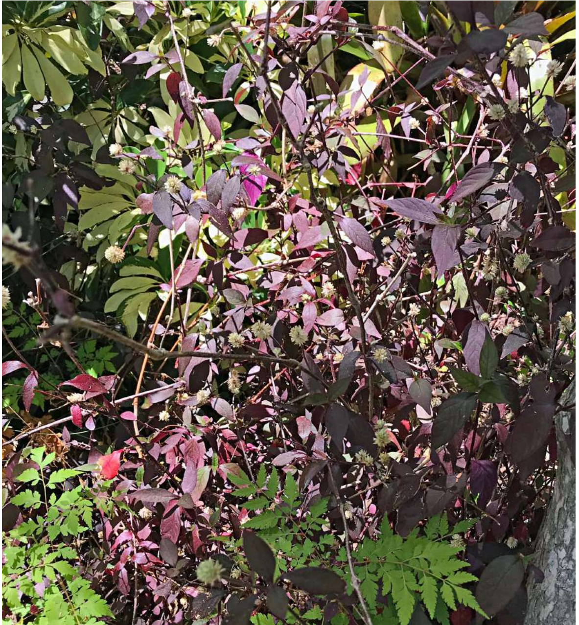
Purple Knight ( Alternanthera dentata cultivar) This colourful groundcover grows in the clubhouse surrounds gardens.