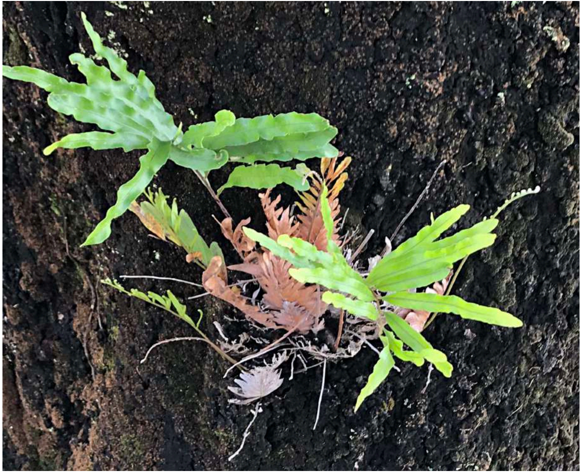
Basket Nest Fern ( Drynaria rigidula ) This SEQ native fern is growing as an epiphyte on the trunk of a Narrow-leaved Ironbark behind the Green 7 men's tee-block.