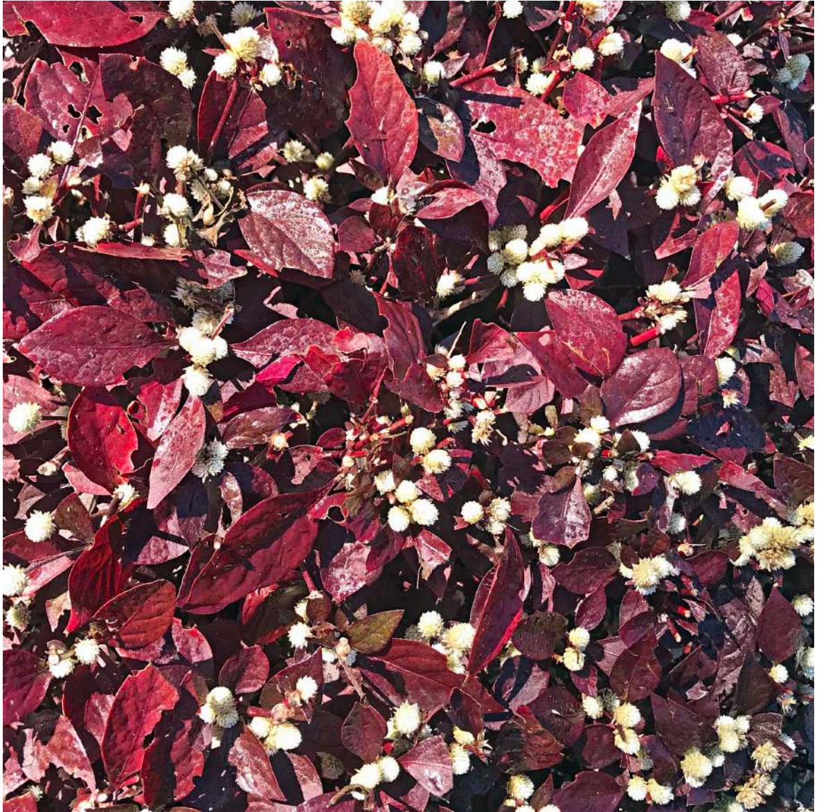
Little Ruby ( Alternanthera dantata cultivar) This Brazilian herb is planted in the Remembrance Garden near the Clubhouse entry.