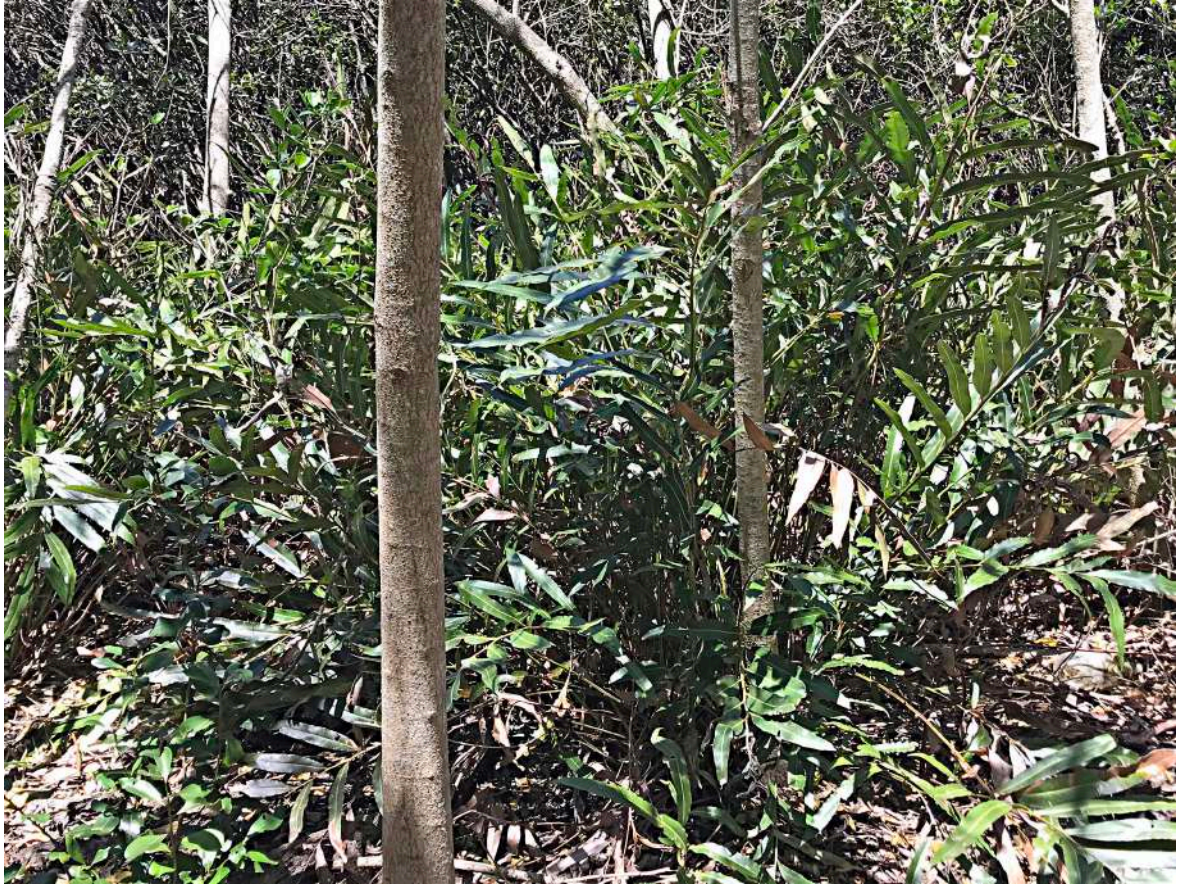
Golden Mangrove Fern ( Acrostichum aureum ) This SEQ terrestrial native fern commonly grows behind the mangroves along the River and has also been planted along the edge of the maintenance dam.