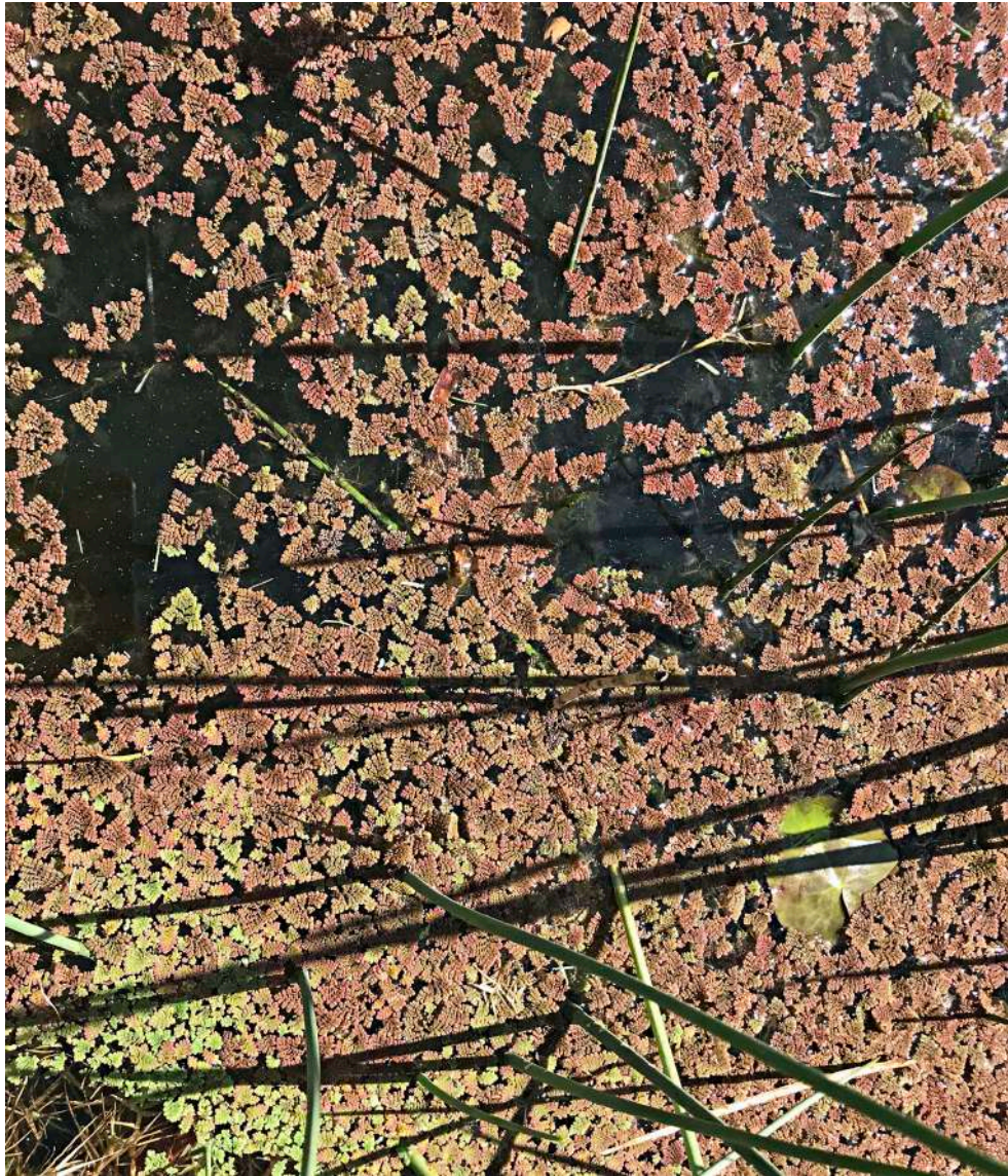
Red Azolla ( Azolla filiculoides ) This SEQ native fern is a floating aquatic species that often blooms in the spring-summer, especially in the Red 9 ponds.