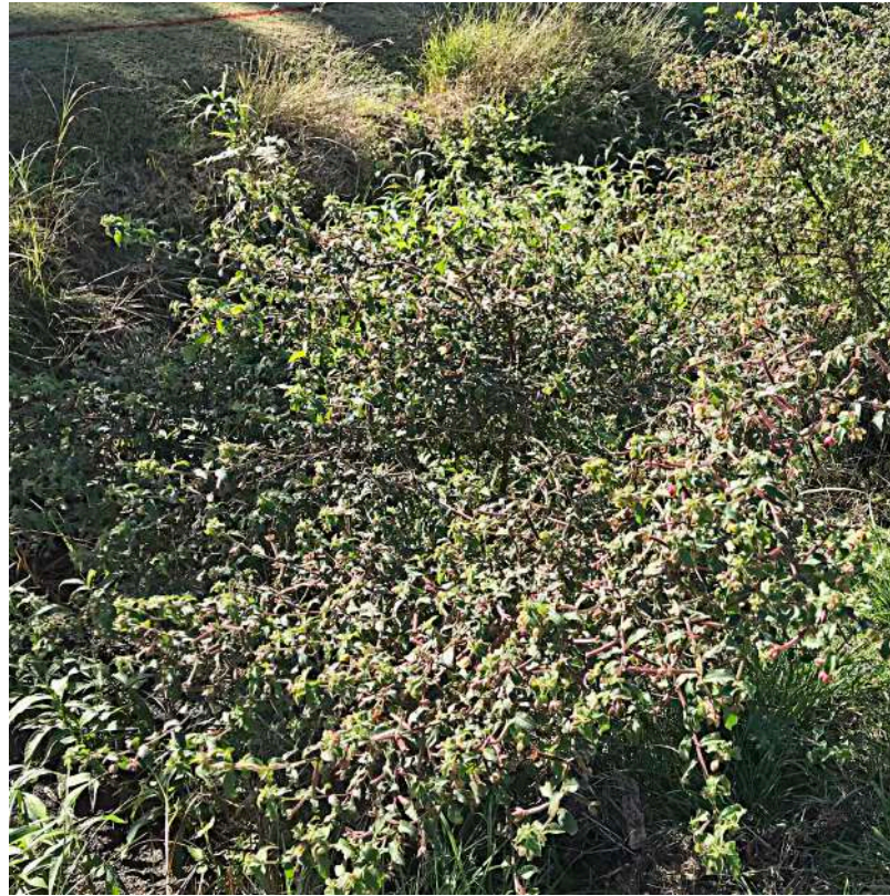
Native Willow Primrose ( Ludwigia octovalvis ) This attractive red-stemmed SEQ native species can be observed in the waterway on the LHS of Blue 2 green, with flower close-up below.