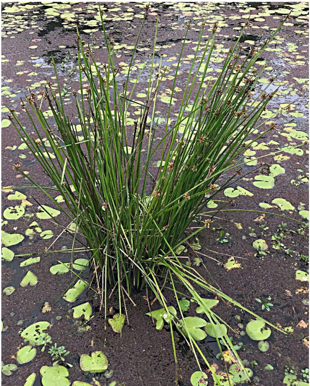
Triangular Clubrush ( Schoenoplectus mucronatus ) This SEQ native Clubrush has been planted (pJW) around the edges of the Red 9 ponds.