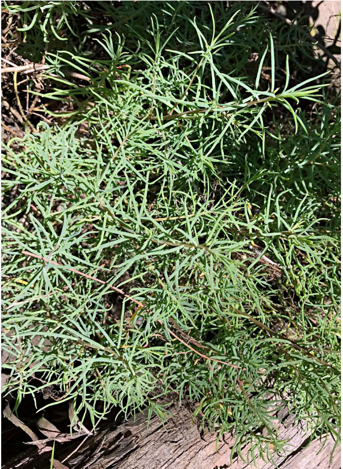
Ruby Saltbush ( Enchylaena tomentosa ) This SEQ spreading tidal shrub grows along the riverside next to Blue 3. Red fruits are edible.