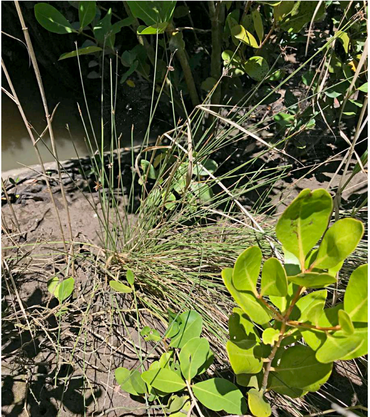
Sea Rush ( Juncus kraussii ) This SEQ clumping tidal species grows along the riverside next to Blue 3.