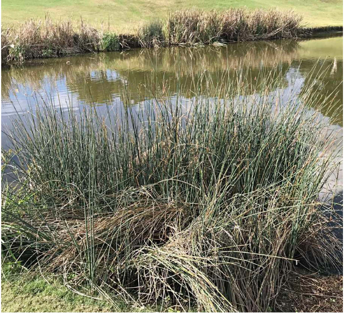
Grey Rush ( Lepironia articulata ) This SEQ native species has been planted around pond edges (pJW) and will grow in water up to 1.5m deep.