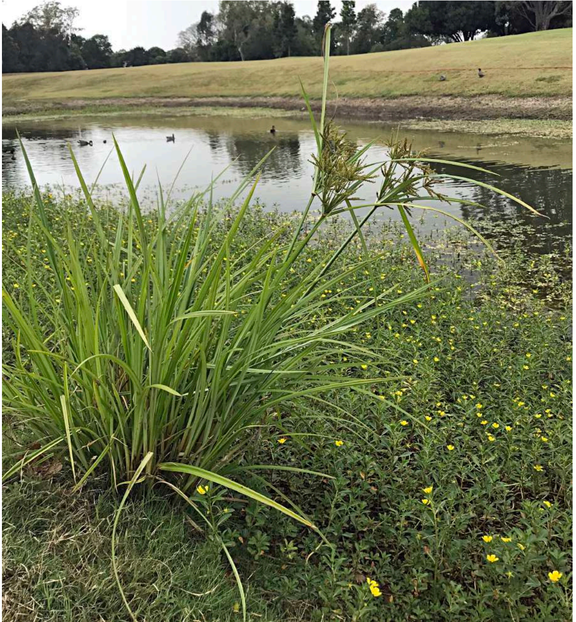
Giant Sedge ( Cyperus exaltatus ) This SEQ native species occurs occasionally around the edges of ponds and along drains.