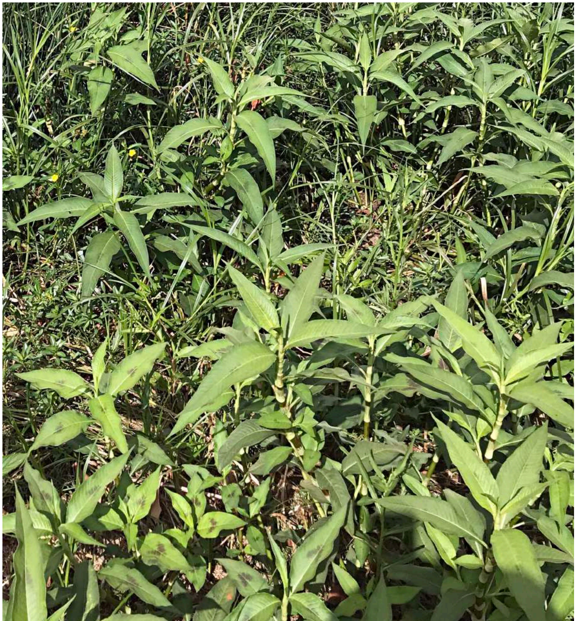
Smartweed ( Persicaria attenuata ) This SEQ native aquatic can be observed in the pond on the RHS of the Red 1 fairway near the green.