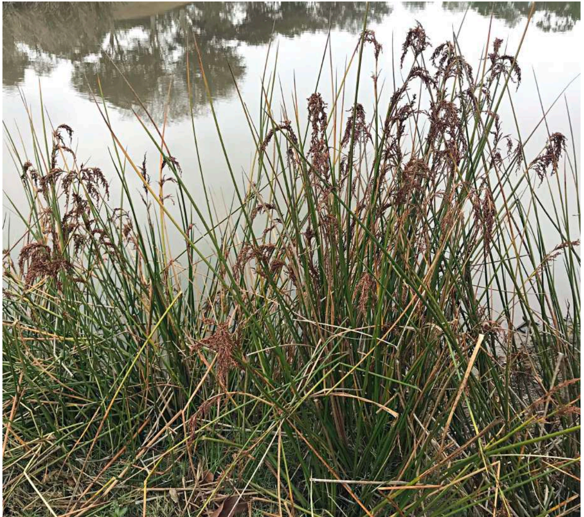
Jointed Twig-rush ( Baumea articulata ) This SEQ native Club-rush has been planted (pJW) around the edges of the Red 9 ponds.