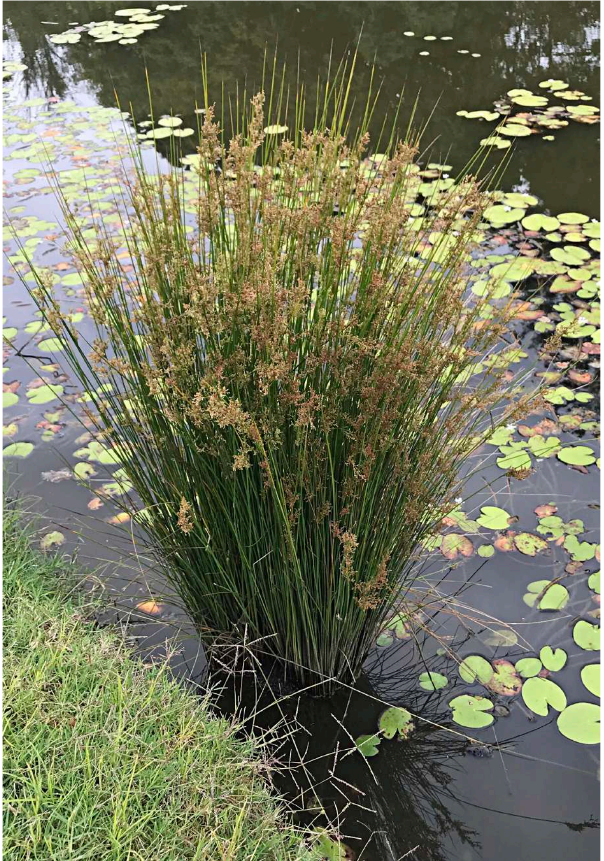
Common Rush ( Juncus usitatus ) This SEQ native species has been planted widely (pJW) around the edges of our ponds.