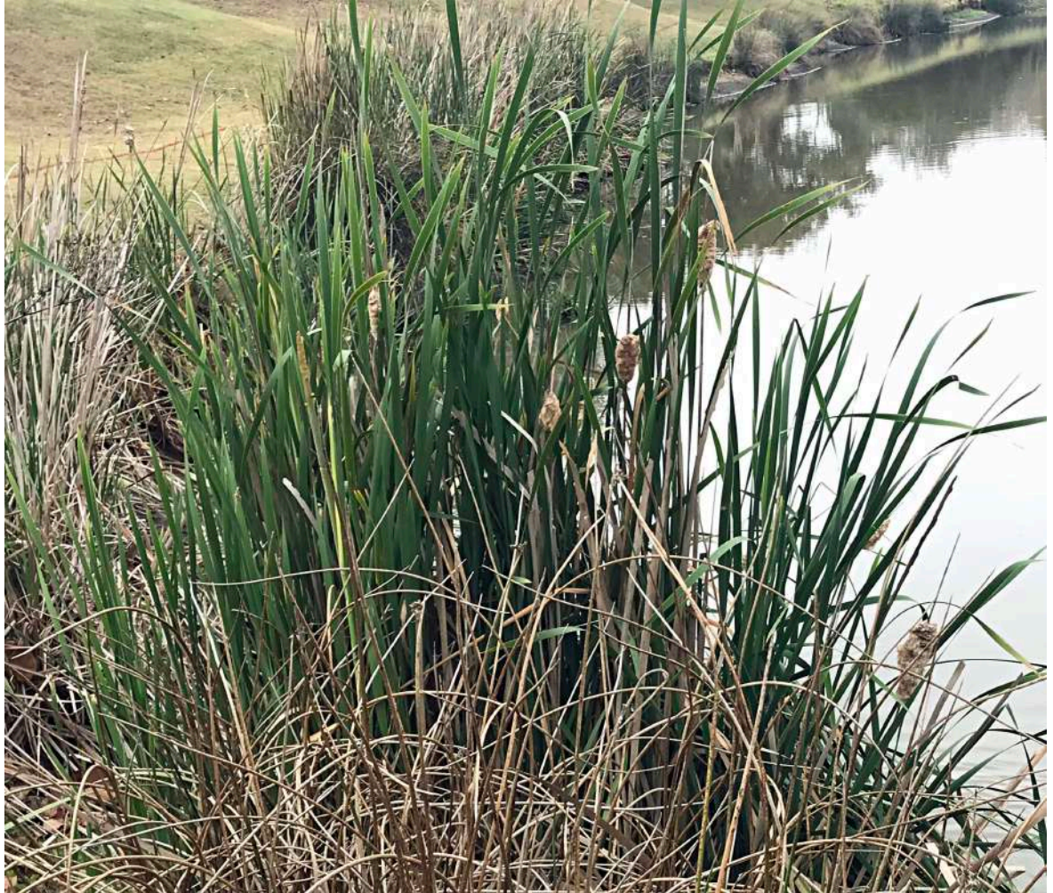
Cumbungi ( Typha orientalis ) This SEQ native sedge can be observed in the ponds approaching the Red 7 green.