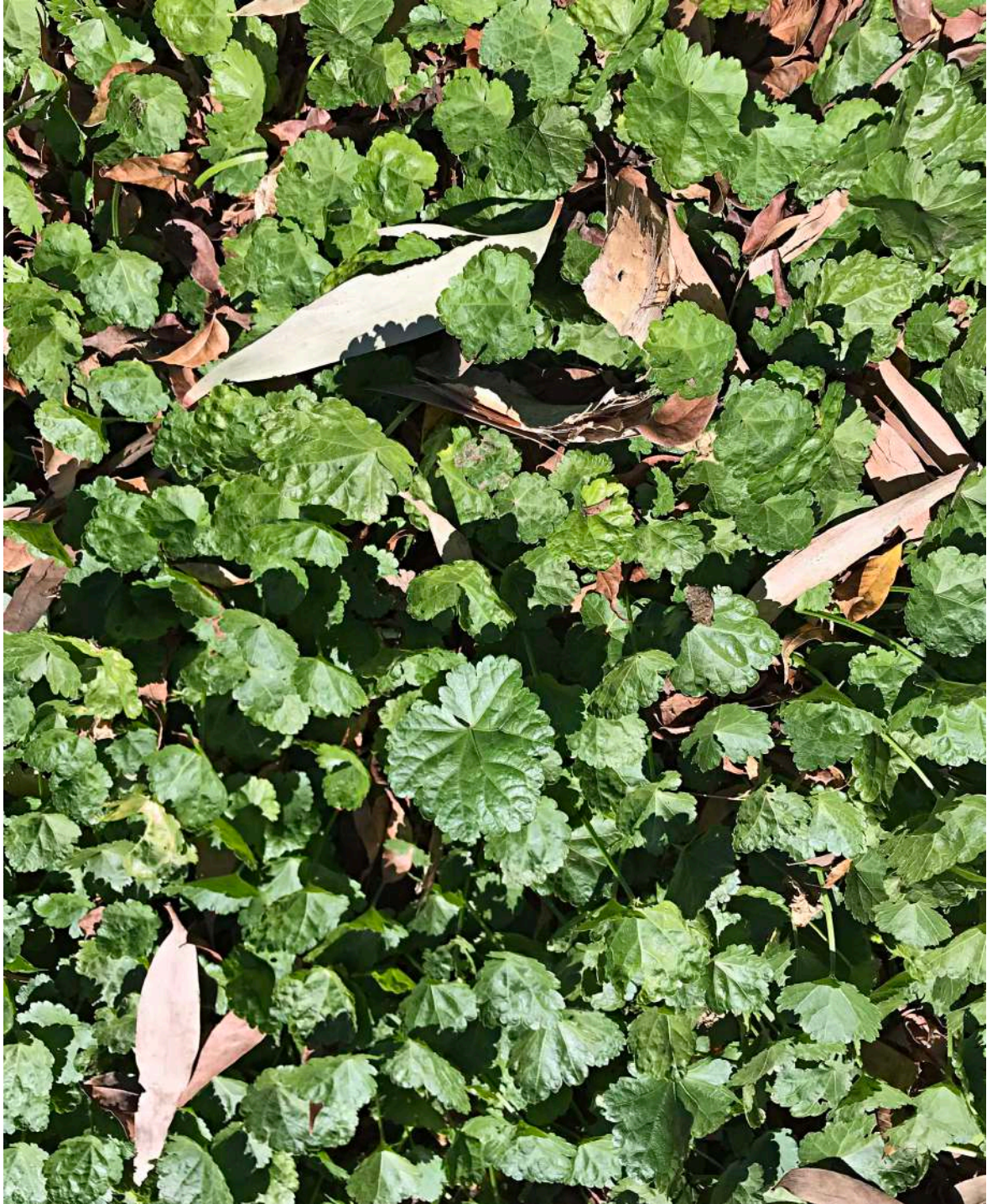
Pennywort ( Centella asiatica ) This SEQ native groundcover species can be observed in the waterway on the RHS of the Blue 2 fairway.