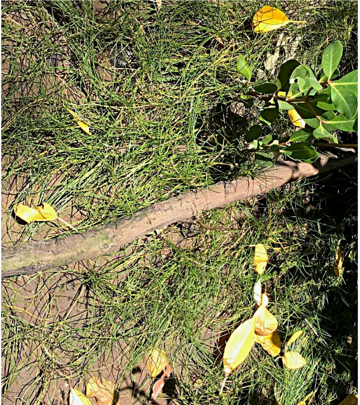
Brisbane Water Lawn ( Lilaeopsis brisbanica ) This SEQ (Brisbane) native lawn-like species occurs in one small tidal riverside area next to Blue 3.