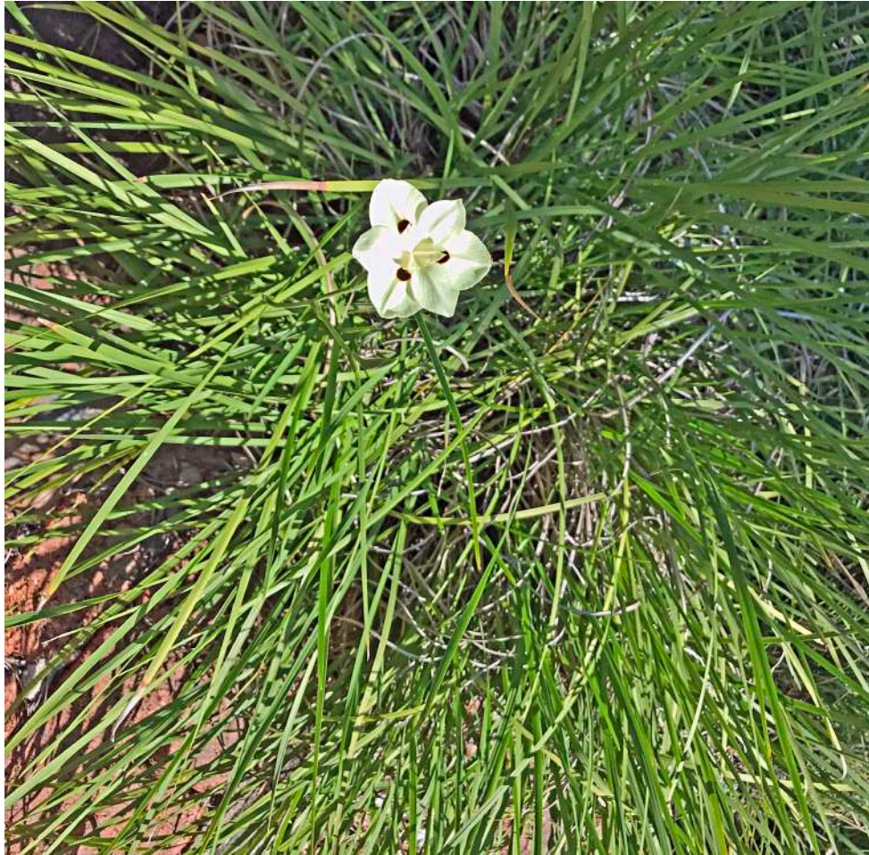
Yellow Iris ( Dietes bicolor ) This attractive clumping South African Iris is widely planted in garden beds, with a flower close-up provided below.