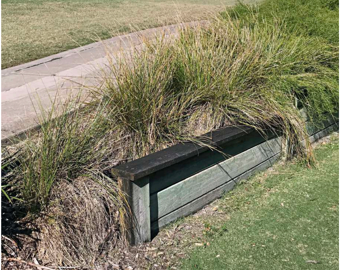
Tussock Grass ( Poa labillardieri ) This attractive SEQ native clumping grass was planted (pJW) behind the Blue 7 men's tee-block.