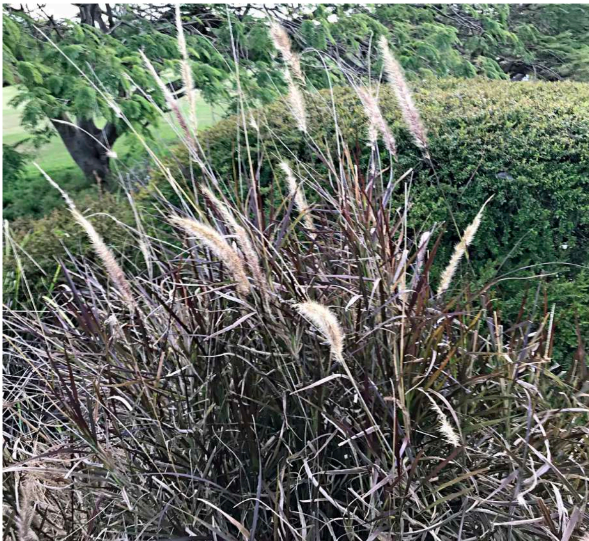
Swamp Foxtail ( Cenchrus purpurascens ) This attractive clumping grass was widely planted around sand bunkers but this specimen is in a garden in front of the Golf 7 men's tee-block.