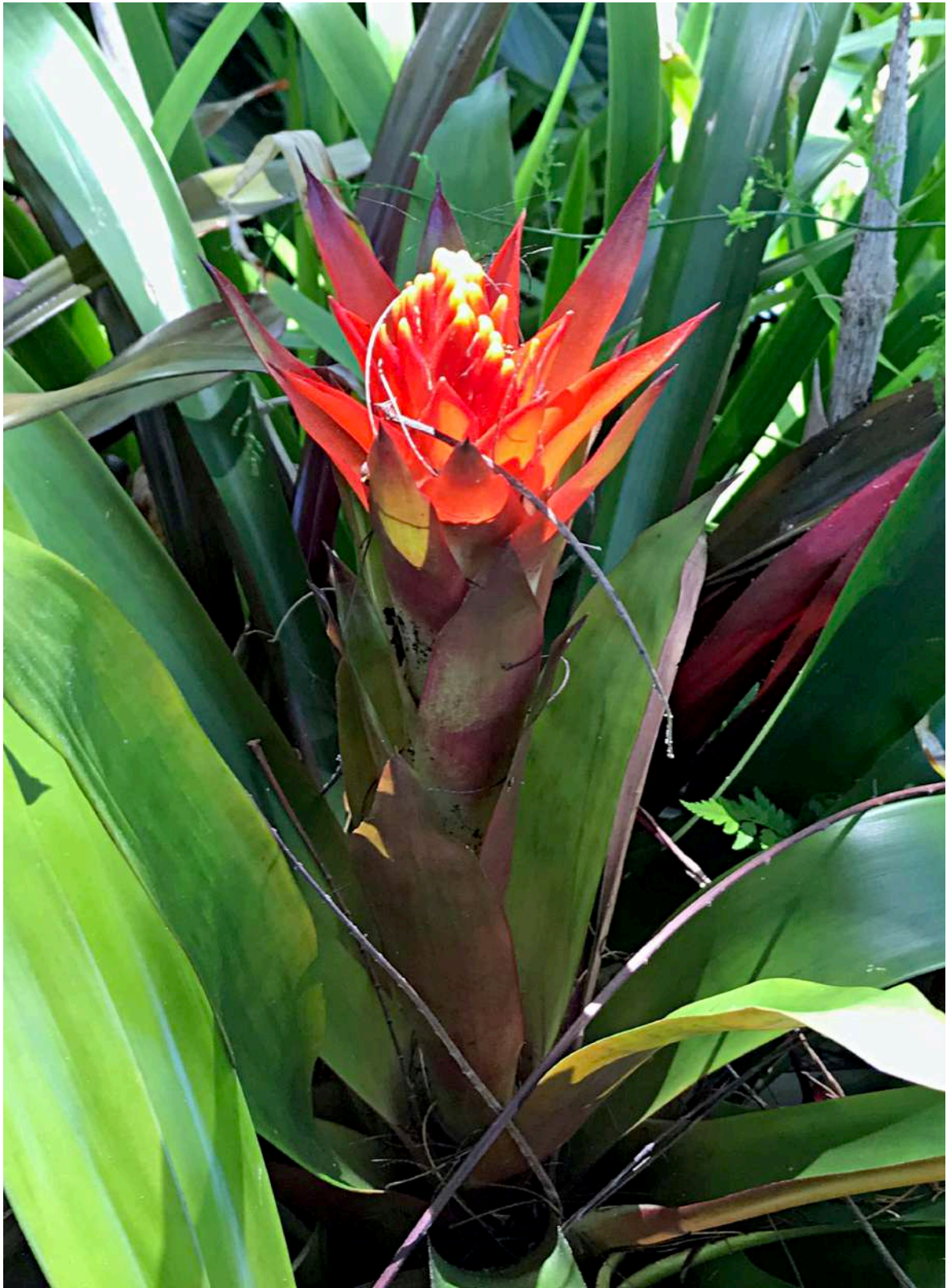
Torch Guzmania ( Guzmania hybrid cultivar) This striking hybrid cultivar Bromeliad is growing in the Western gardens of the clubhouse.