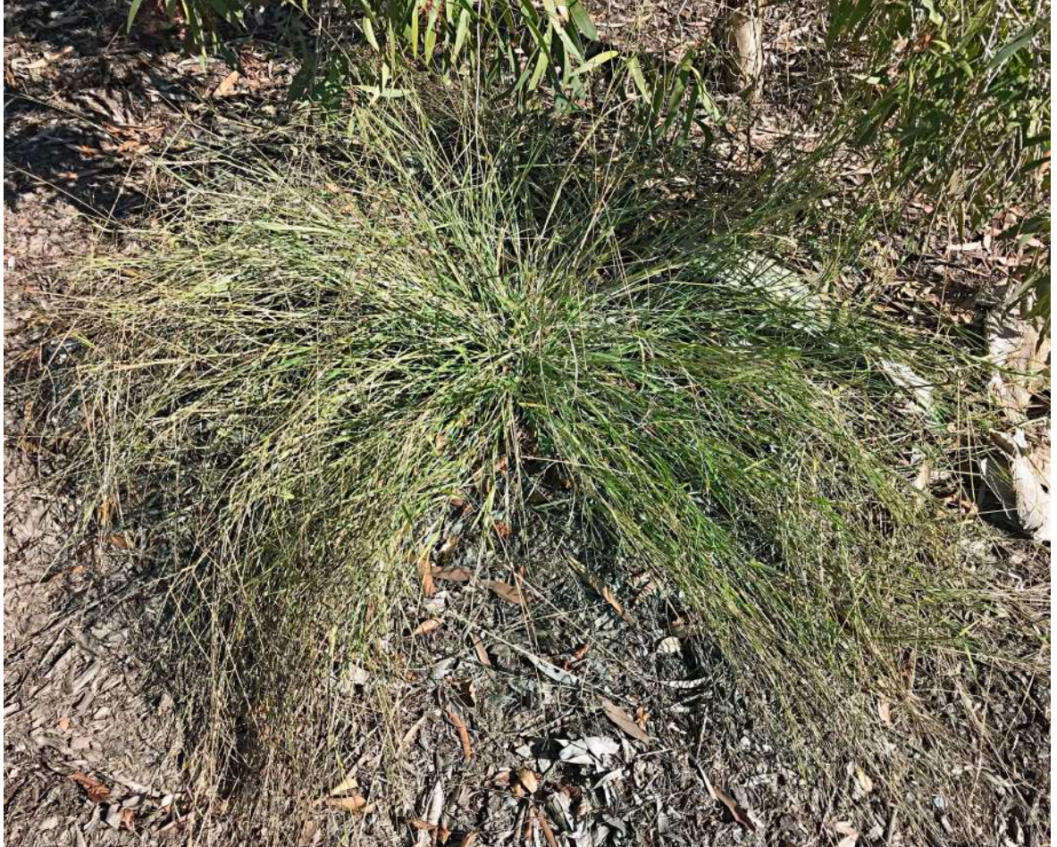
Slender Rat's Tail Grass ( Sporobolus creber ) This native grass grows naturally along the RHS of the drain on Blue 2 fairway.