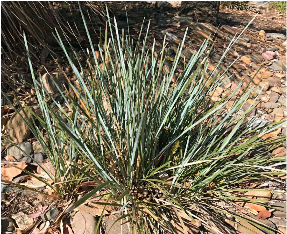
Pale Matrush ( Lomandra glauca ) A NSW native clumping groundcover with a glaucous appearance planted in the RHS garden at the driveway entrance.