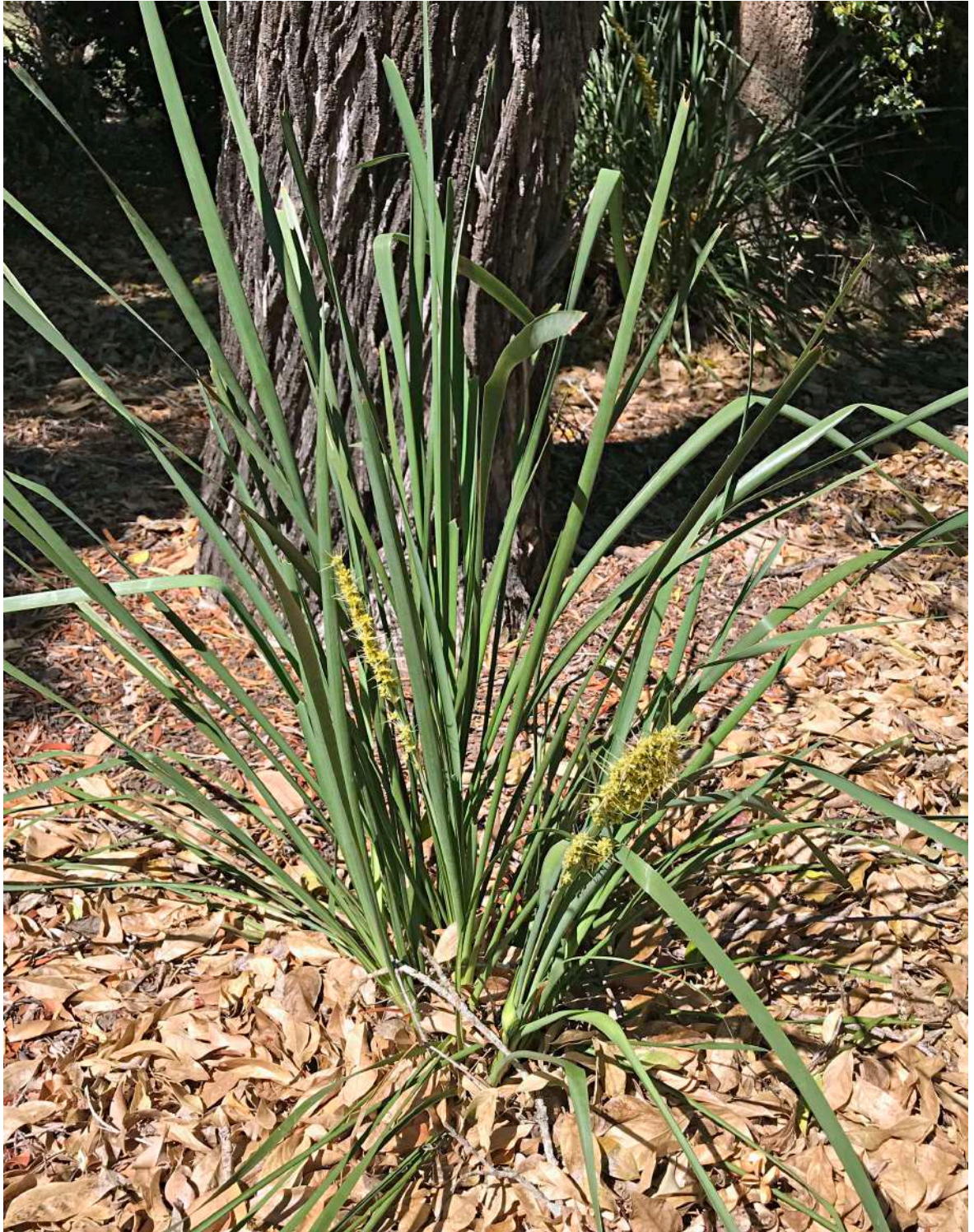
Spiny Matrush ( Lomandra longifolia ) This close relative of the Creek Matrush is widely planted in garden areas, distinguished by its un-branched flower head.