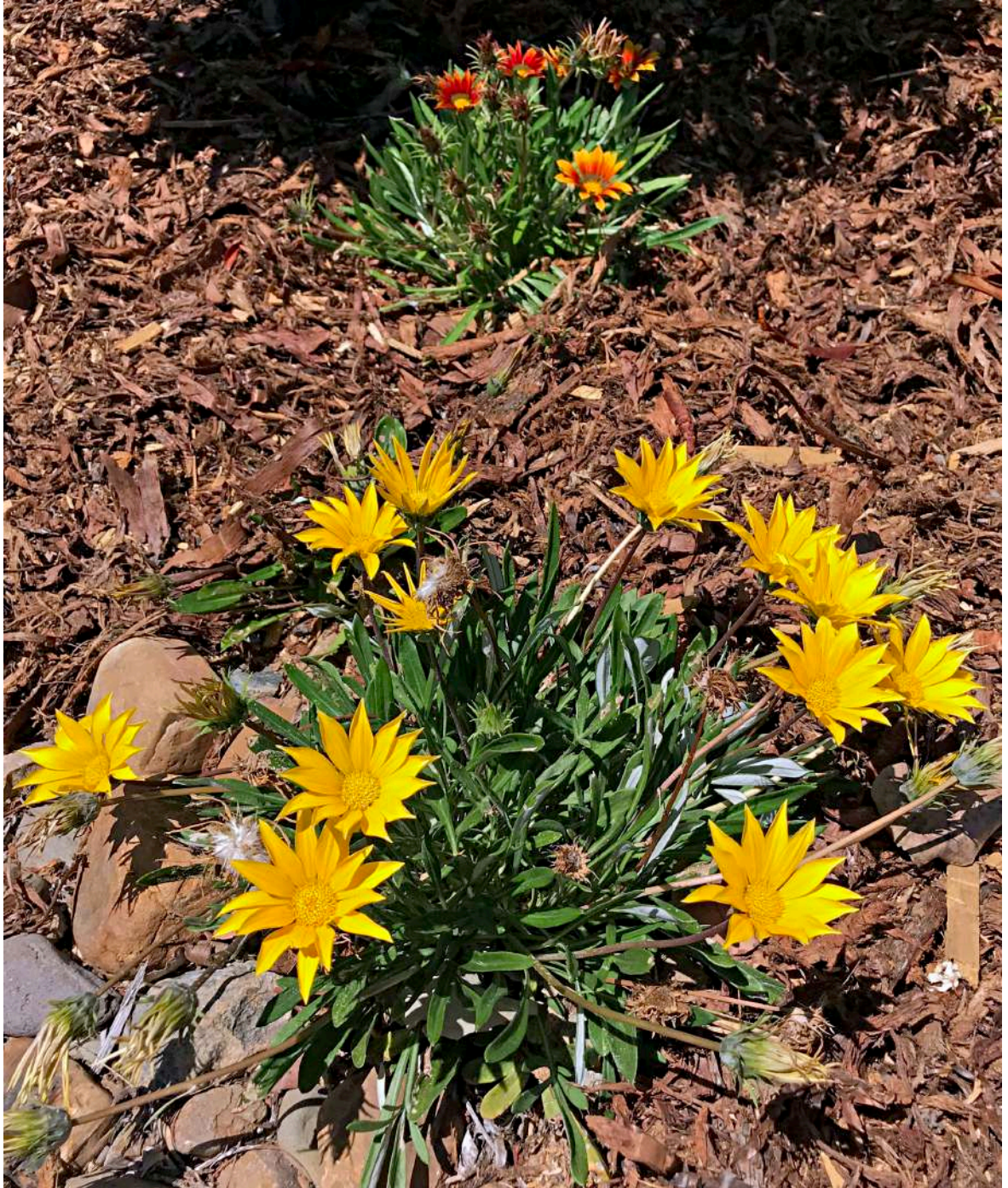
Treasure Flower ( Gazania rigens cultivars) These attractive Southern African clumping groundcovers are planted in the entry garden to the clubhouse.