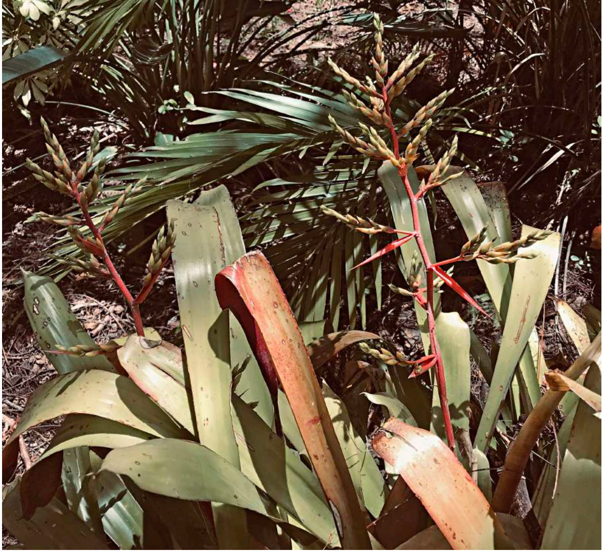
Wandering Vriesia ( Vriesia vagans ) This Brazilian clumping Bromeliad was planted in the clubhouse surrounds Western gardens.