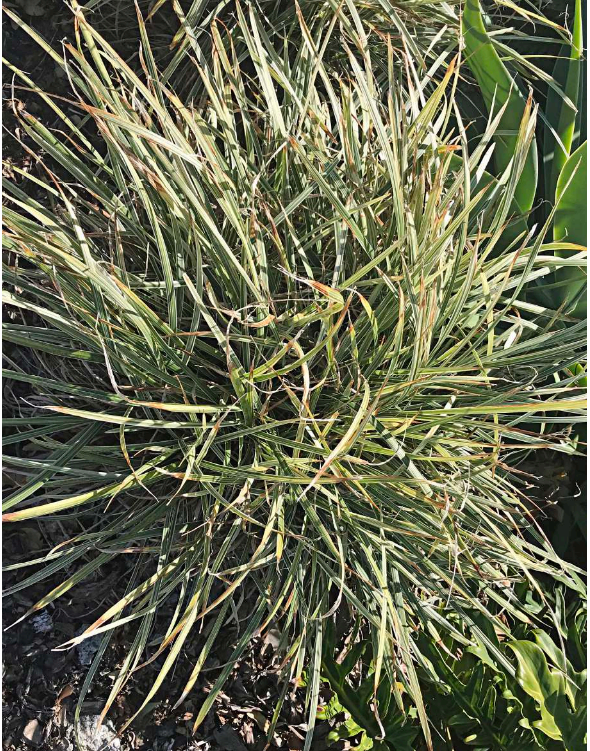
Spider Plant ( Chlorophytum comosum ) An African groundcover, this variegated clumping plant is growing in the gardens around the Clubhouse.