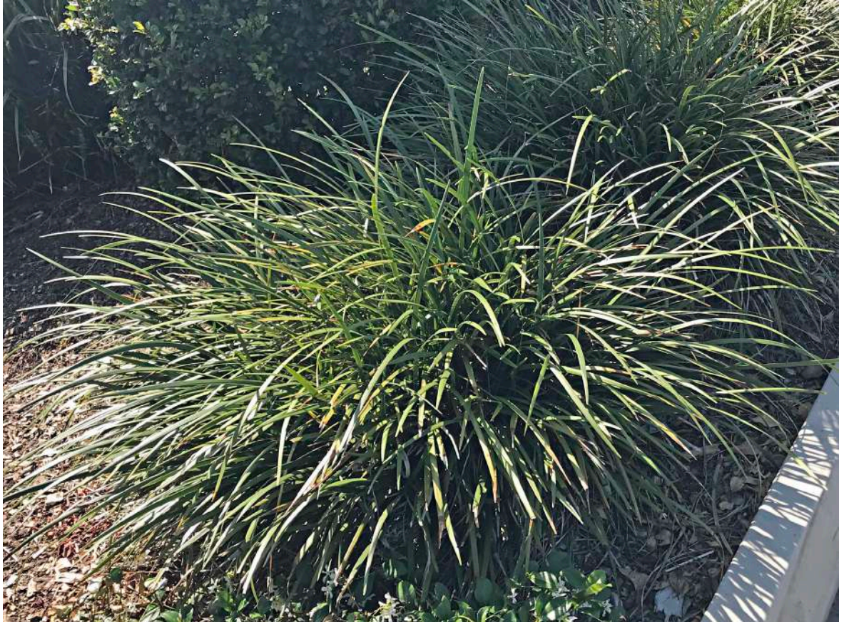
Tall Liriope ( Liriope cv. 'Evergreen Giant' ) This clumping cultivar was planted in the Clubhouse surrounds gardens.