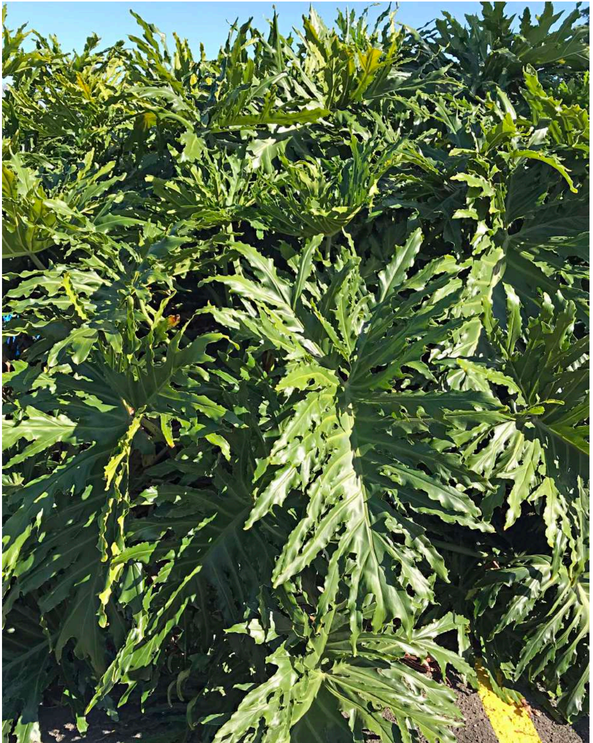
Selloum ( Philodendron selloum ) This clumping introduced species is planted on the western side of the clubhouse surrounds.