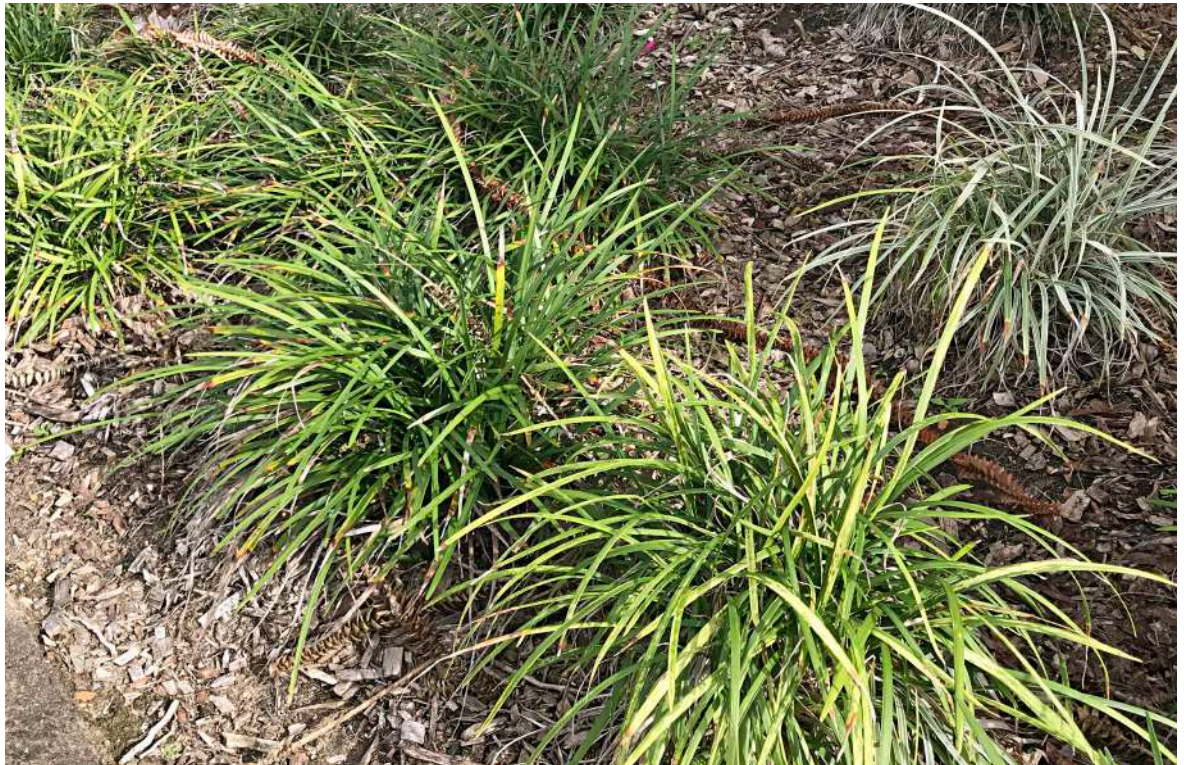
Variegated Liriope ( Liriope cv ' muscaria ') This clumping cultivar was planted (pJW) on the LHS of the Red 6 men's tee-block.