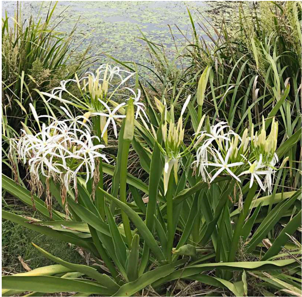
River Lily ( Crinum pedunculatum ) This clumping lily grows naturally along coastal waterways and is planted here on the path from the Red 9 green, with flower close-up below.