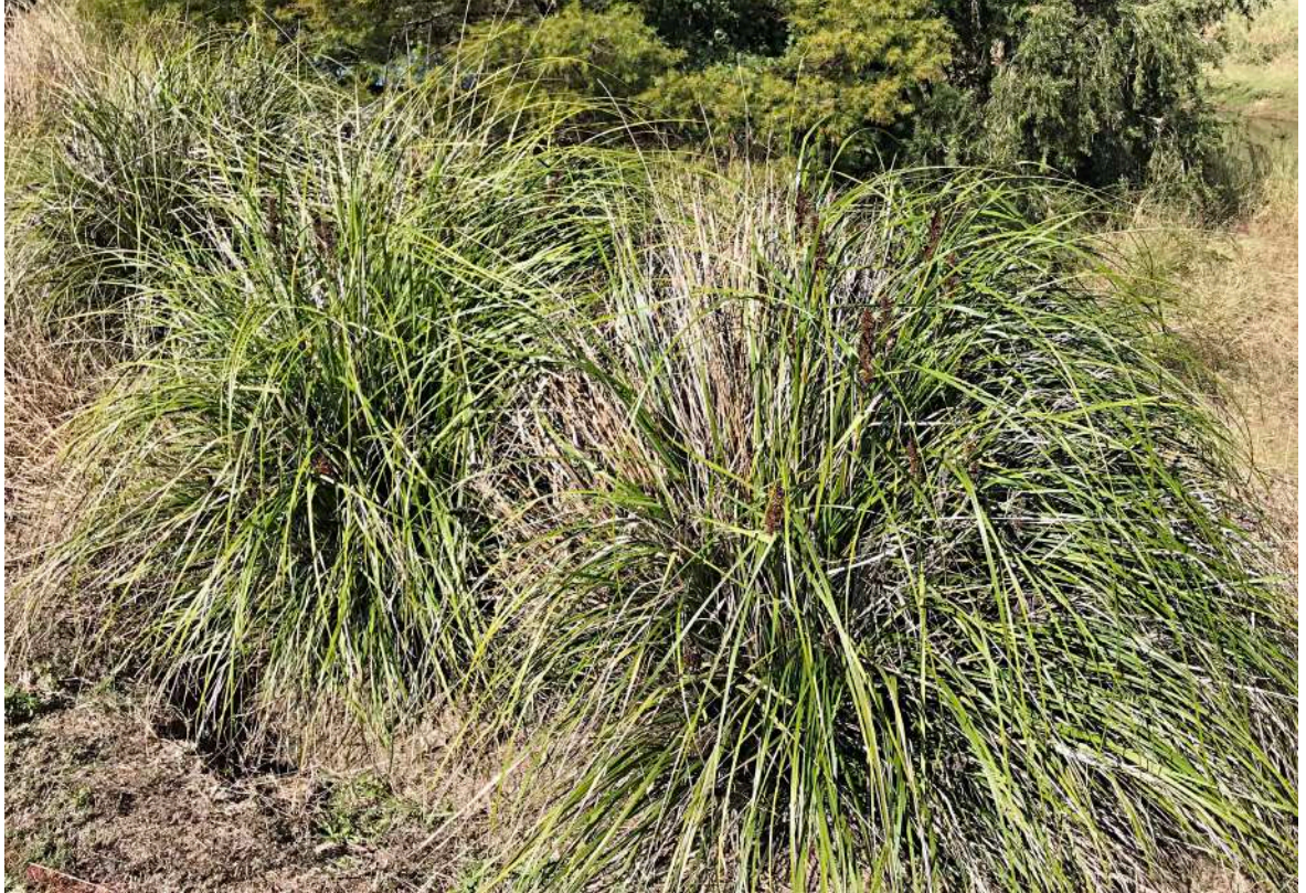
Swordsedge ( Gahnia sieberiana ) This clumping sedge has very sharp edge of leaves and is planted (pJW) in the landscape area on the RHS of Red 6 fairway with a close-up of fruits below.