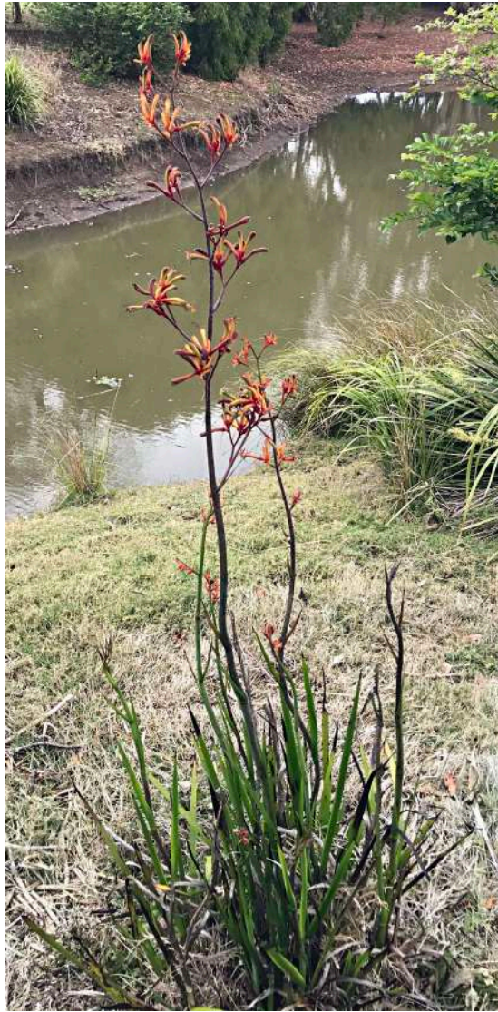
Rampaging Roy ( Anigozanthos xhybrid) Western Australian Kangaroo Paw cultivars have been developed to grow well in Eastern Australia. This examples grows on the LHS of Red 8 tee-block, with flower close-up below.