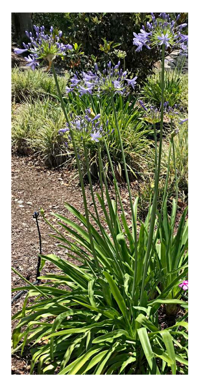
Big Blue ( Agapanthus africanus ) A South African clumping tropical in the Western side of the Clubhouse surrounds.