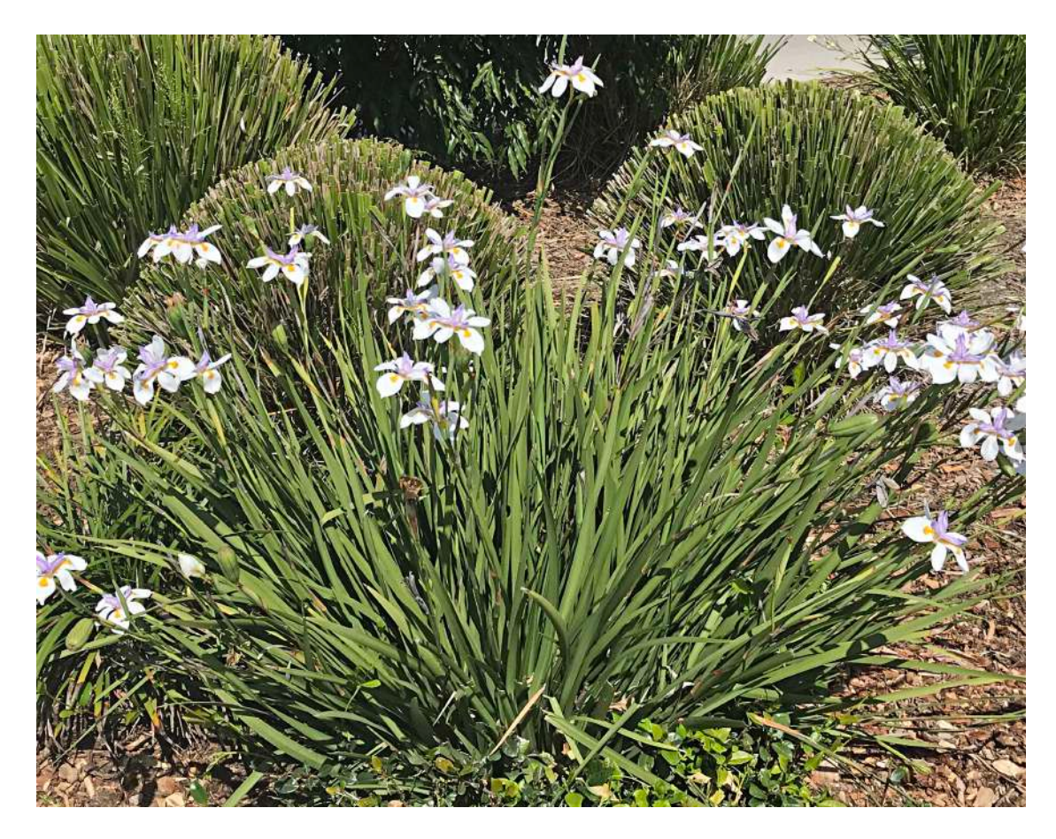
Fairy Iris ( Dietes grandiflora ) A South African clumping groundcover and flower closeup below, from the approach to the Red 1 tee-block.