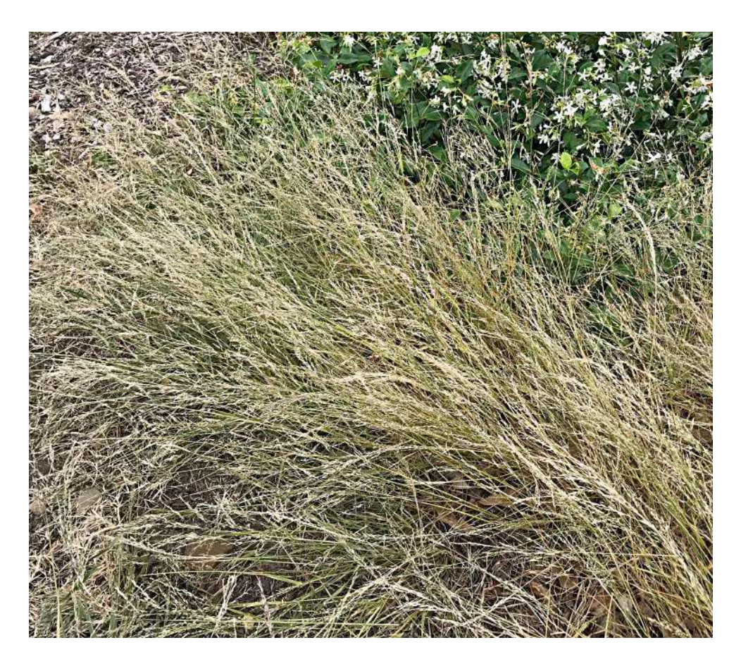
Bordered Panic Grass ( Entolasia marginata ) An SEQ native clumping groundcover with abundant seed-heads, with a close-up below.