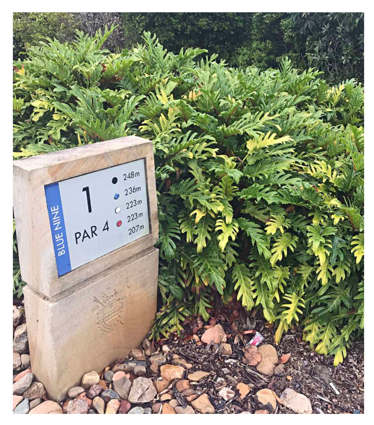
Dwarf Philodendron ( Philodendron cv. Xanadu) This clumping cultivar is widely planted in the Clubhouse surrounds and behind tee-blocks.