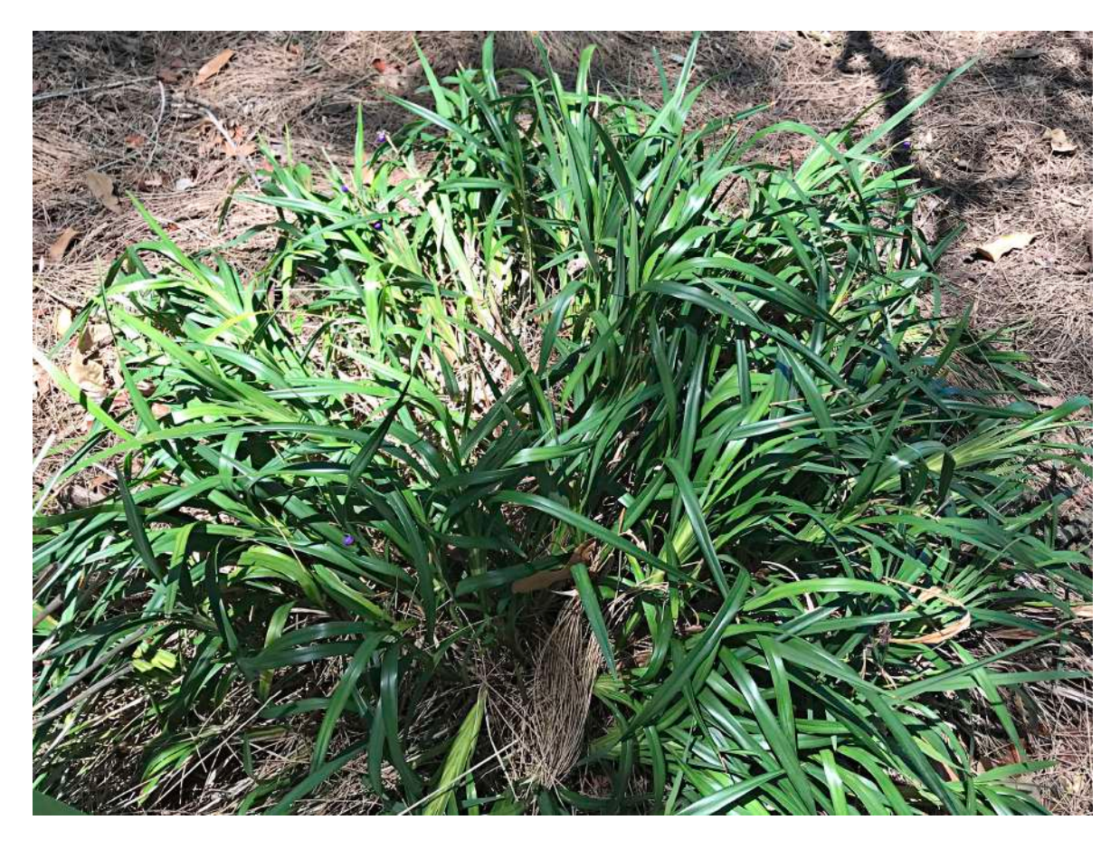
Blue Flax Lily ( Dianella brevipedunculata ) An SEQ native clumping groundcover also growing on the RHS of the Red 5 men's tee-block, with flower close-up below. Differs from D caerulea by its flower & fruiting stems shorter than the leaves.