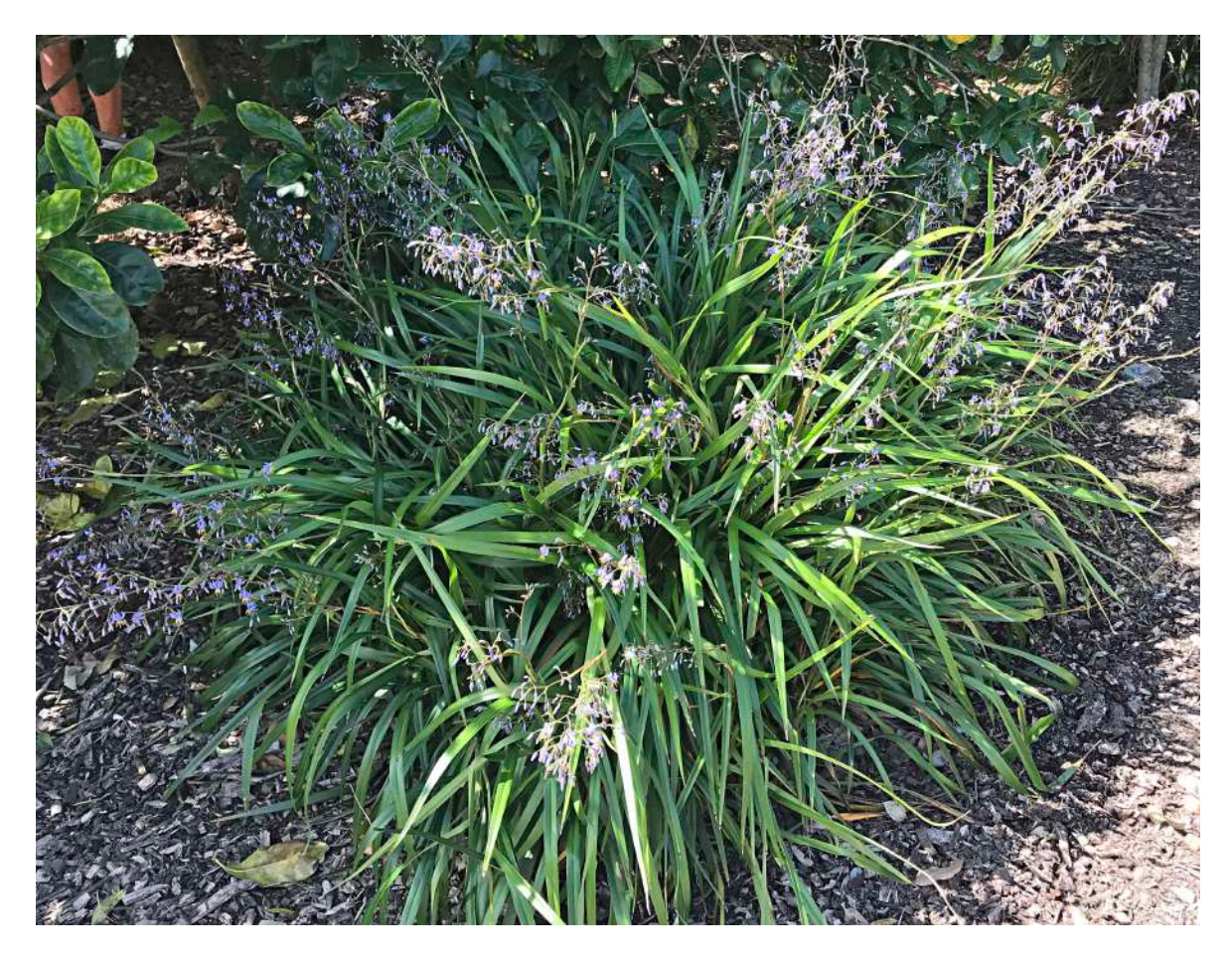
Blueberry Lily ( Dianella caerulea ) An SEQ native clumping groundcover growing on the RHS of the Red 5 men's tee-block, with flower close-up below.