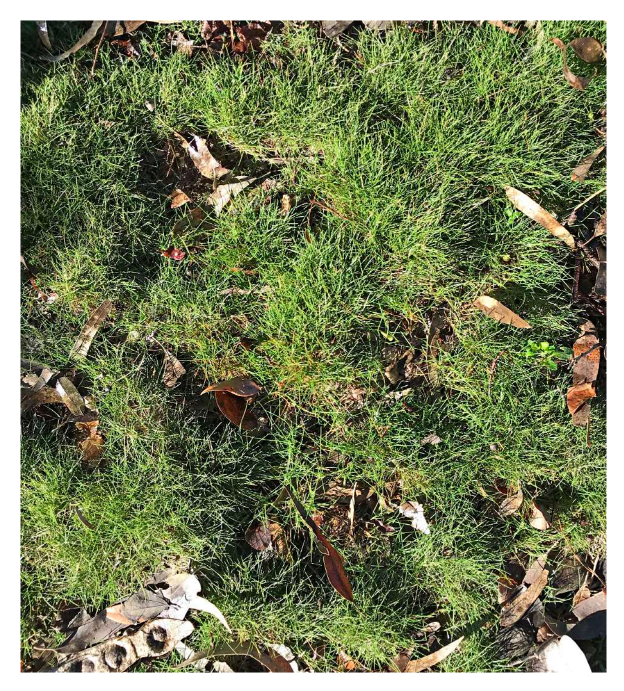
No-mow Grass ( Zoysia tenuiflora ) This prostrate groundcover can be seen in the 'Wedding Garden' in front of the Clubhouse, deriving its descriptive name from the fact that it is naturally prostrate and doesn't require mowing.