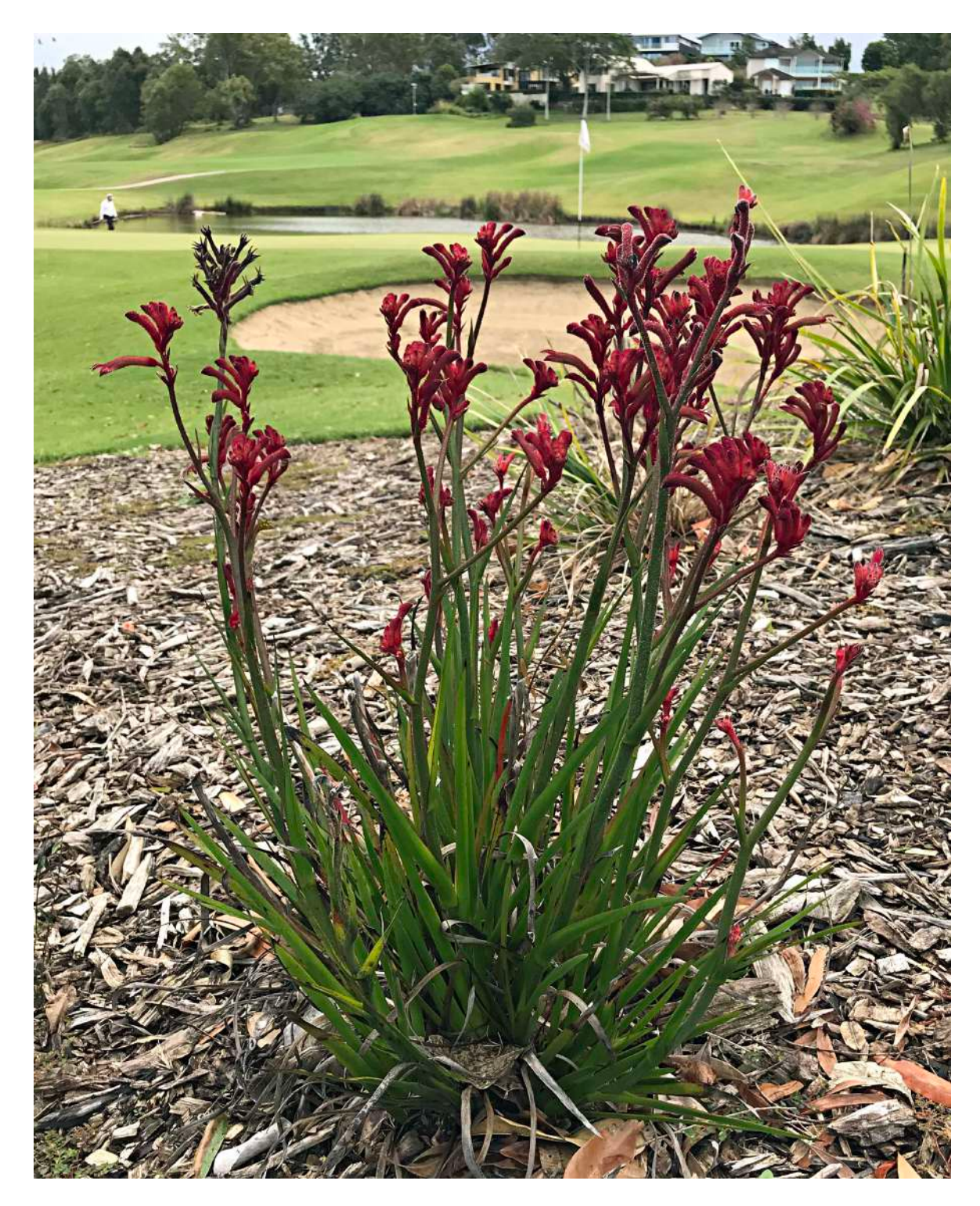
Kangaroo Paw PBR hybrids ( Anigozanthos x hybrid ' Bush Elegance' ) Western Australian hybrids have also been developed to grow well in Eastern Australia, including this example behind the Red 7 green. The term 'PBR' means the propagation of this hybrid is protected under Australia's 'Plant Breeders Rights' legislation.