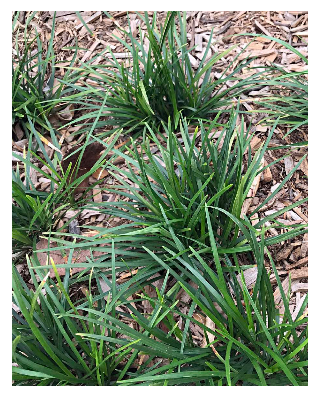
Liriope Elmarco ( Liriope cv 'Elmarco' ) This clumping cultivar was planted (pJW) in the new Poinciana Bar gardens.