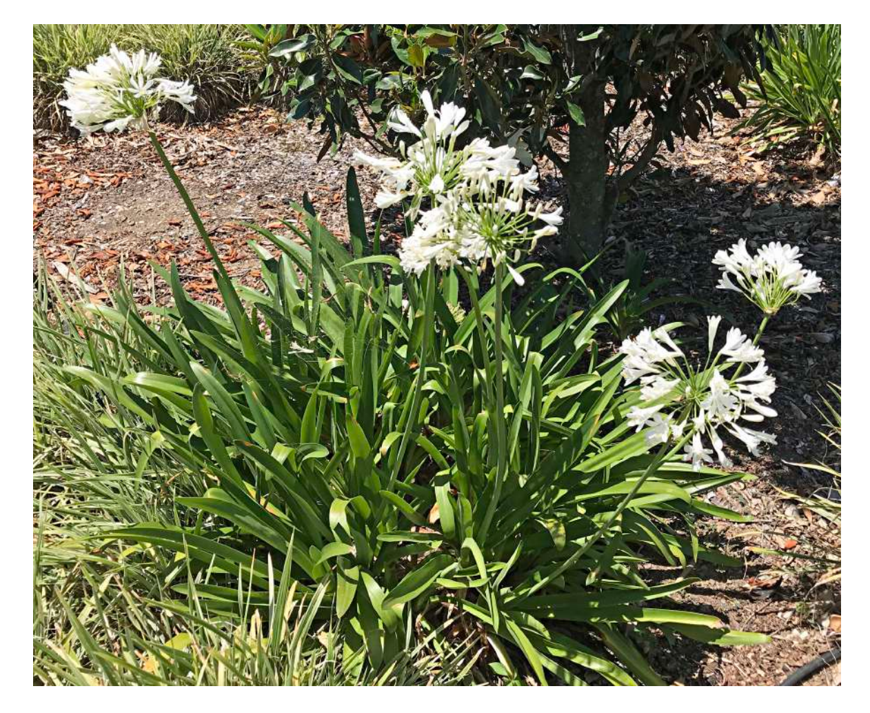
Big White Orb ( Agapanthus africanus cultivar) A South African clumping tropical in the Western side of the Clubhouse surrounds.