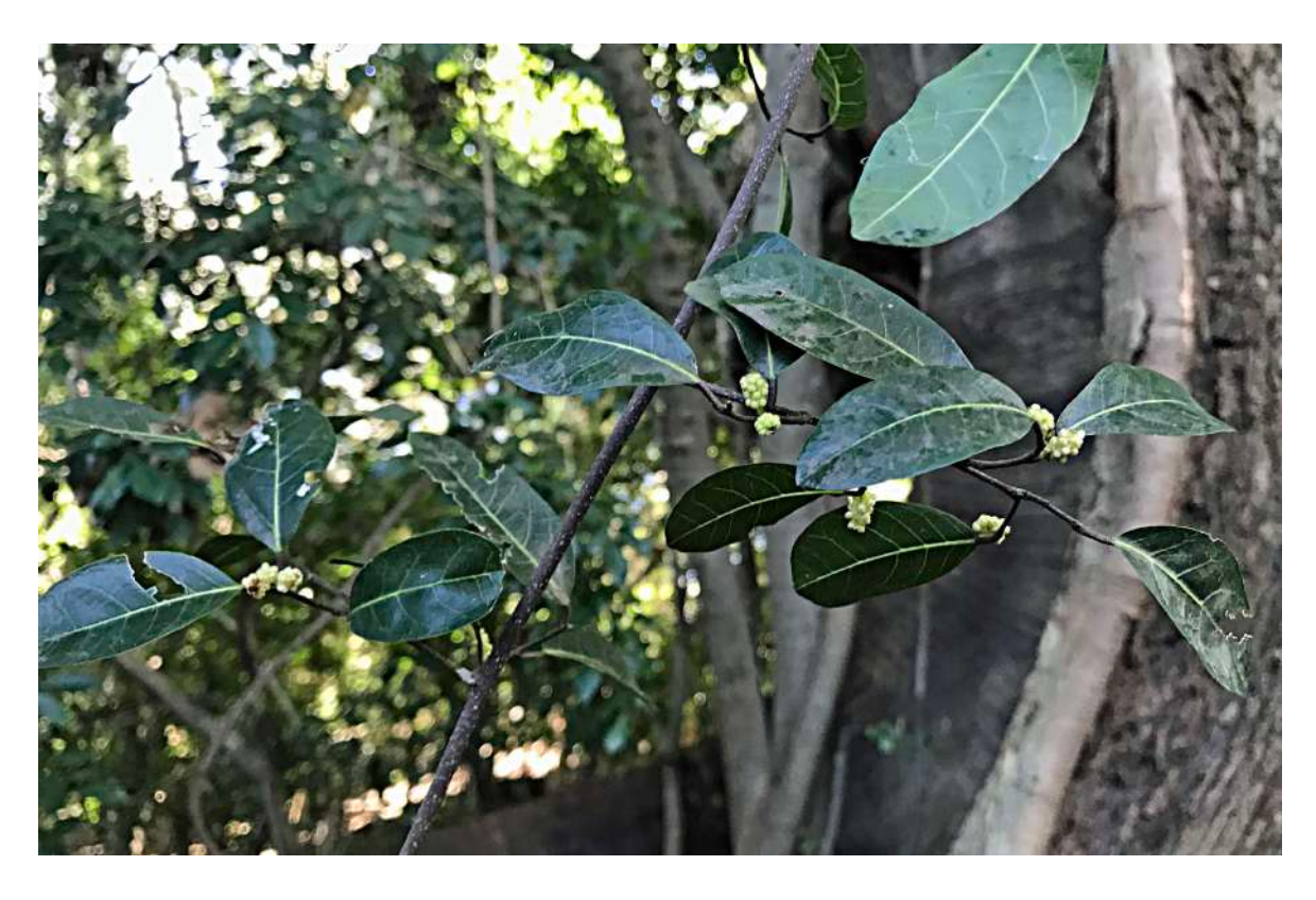
Burny Vine ( Trophis scandens subsp scandens ) This flowering vine is growing on a large fig tree on the LHS of Gold 5, near the River.