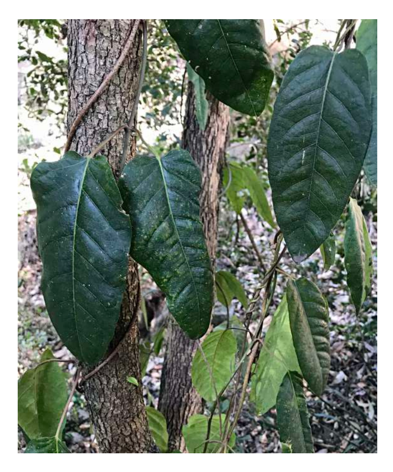
Monkey Pod Vine ( Parsonsia straminea ) This self-sown SEQ native climber has windborne seed that result in a widespread distribution. The fruit pods are illustrated below.