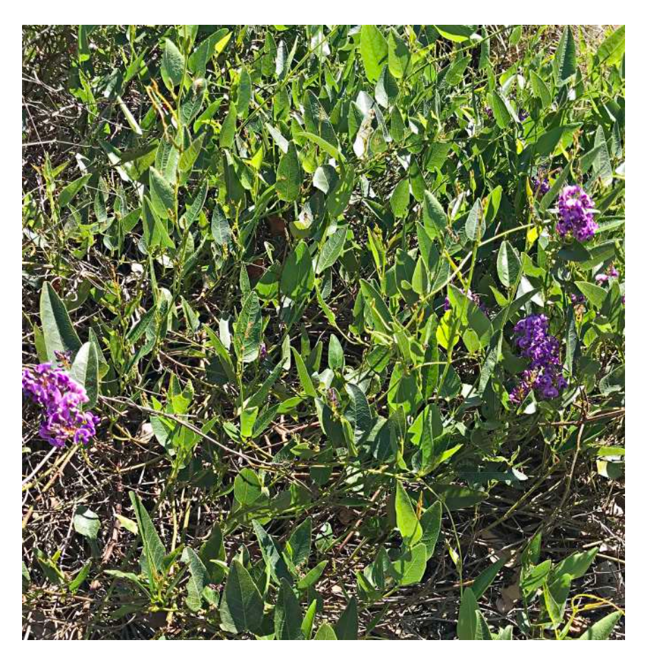
Native Sarsparilla ( Hardenbergia violacea ) This SEQ native twiner was planted around the Red 9 men's tee-block, with flower close-up below.