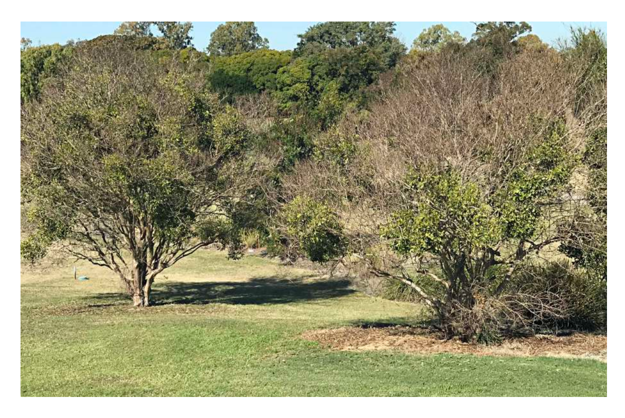
Alphitonia Mistletoe ( Amyema conspicua ) This aerial parasite can easily be observed from the Blue 1 fairway when its host trees, the Crape Myrtles, lose their leaves in the Winter. A close-up of the leaves & flowers is provided below.