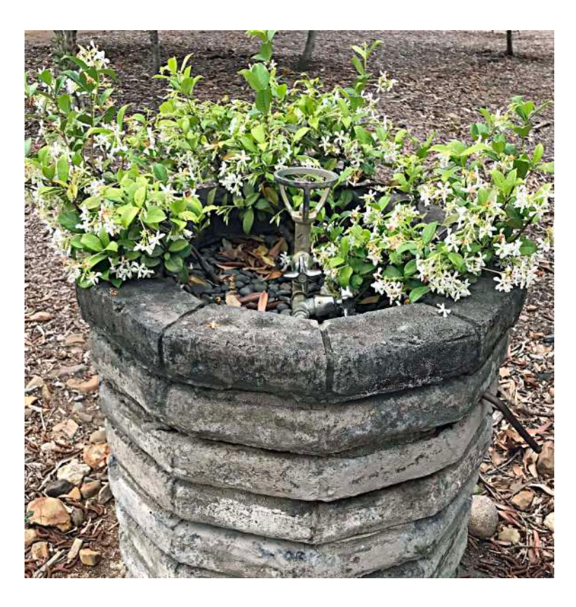
Star Jasmine ( Trachelospermum jasminoides ) This scrambling climber was planted in the drinking fountains to beautify them and use spare water. It also forms a hedge with Yellow Iris and Golden Duranta between the wedding lawn and car park.