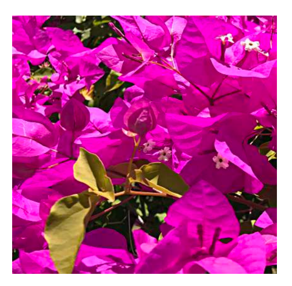
Bougainvillea ( Bougainvillea cultivars) This iconic South American climbing shrub has been planted all along our road boundary fence and in adjacent gardens. A selection of colours presented here is only a small example of the range!