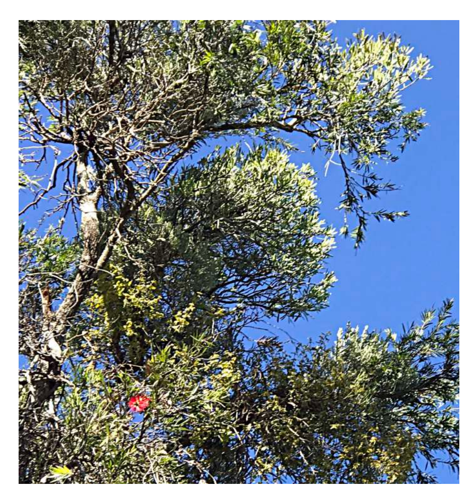
Grey Mistletoe ( Notothixos incanus ) Small, dense aerial mistletoes with a silver grey colour can be seen on the Weeping Bottlebrushes on the LHS of Gold 7 tee-block with closer image below.