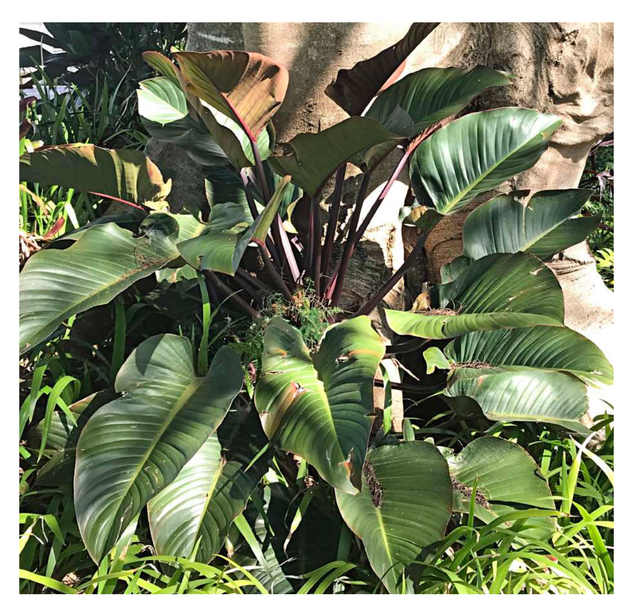
Red Philodendron ( Philodendron cv. 'Rojo Congo') This cultivar climber was planted in the Clubhouse surrounds.