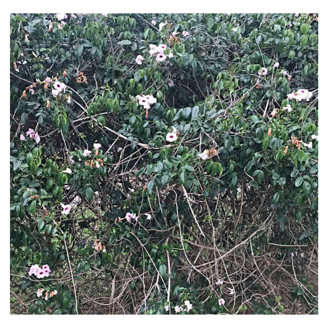
Bower Vine ( Pandorea jasminoides ) This flowering vine was planted (pJW) on the boundary fence behind the Red 5 green, with flowers close-up below.