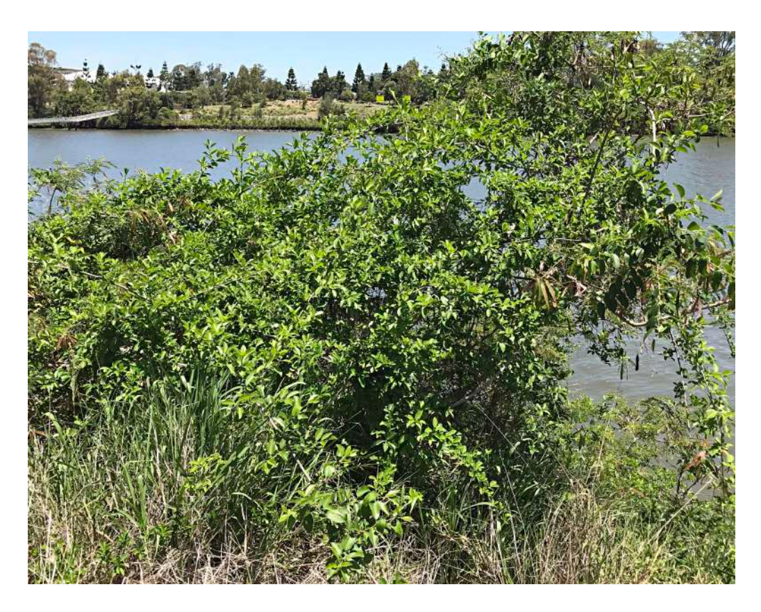
Cockspur Thorn ( Maclura cochinchinensis ) This thorny native flowering vine grows on the Riverbank on the RHS of Blue 3, with thorn, leaves & young flowers close-up below.