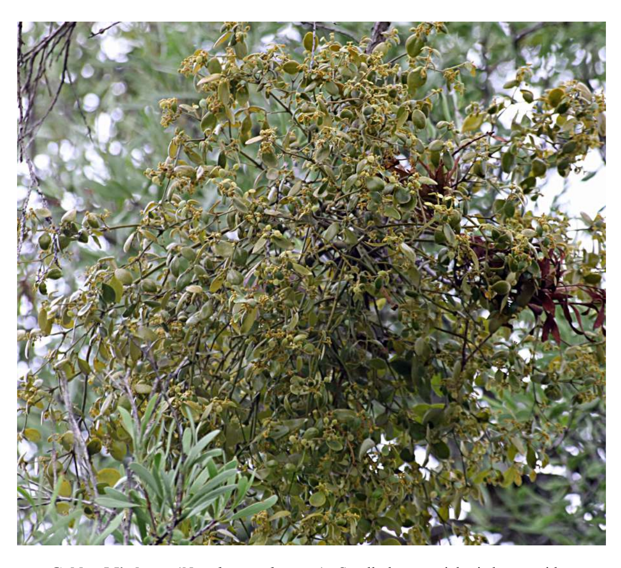
Golden Mistletoe ( Notothixos subaureus ) Small, dense aerial mistletoes with a yellowish-green colour can be seen on the old Weeping Bottlebrush on the LHS of Gold 7 tee-block.