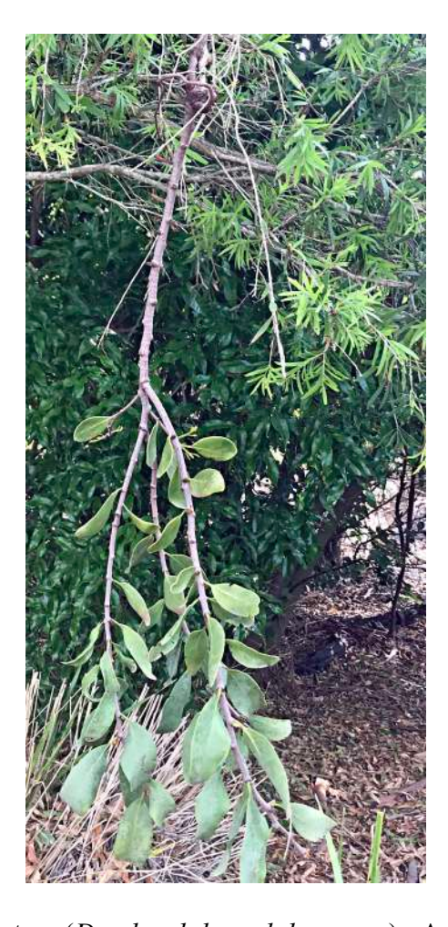
Orange-flowered Mistletoe ( Dendrophthoe glabrescens ) A low-growing example of this mistletoe can be seen on the Weeping Bottlebrush behind the Gold 4 men's tee-block, with flowers below.