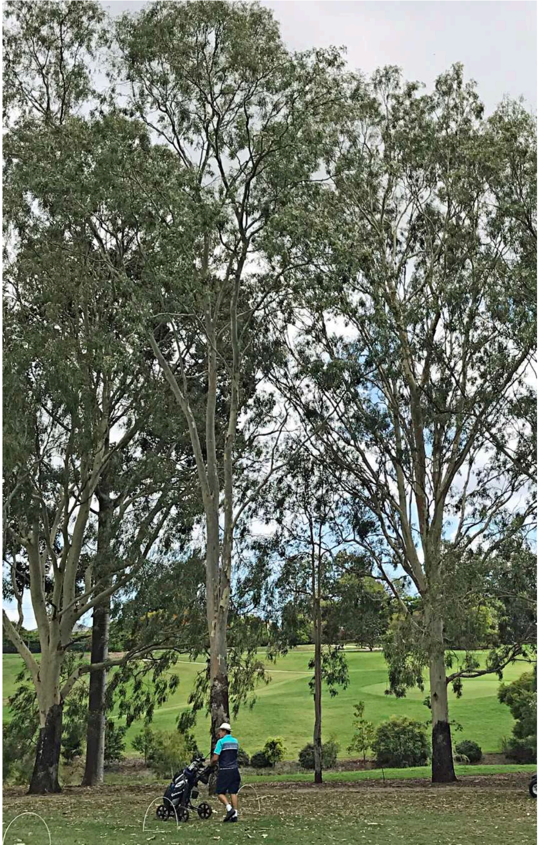
Moreton Bay Ash ( Corymbia tessellaris ) A group of mature specimens grows on the RHS of the Red 5 green.