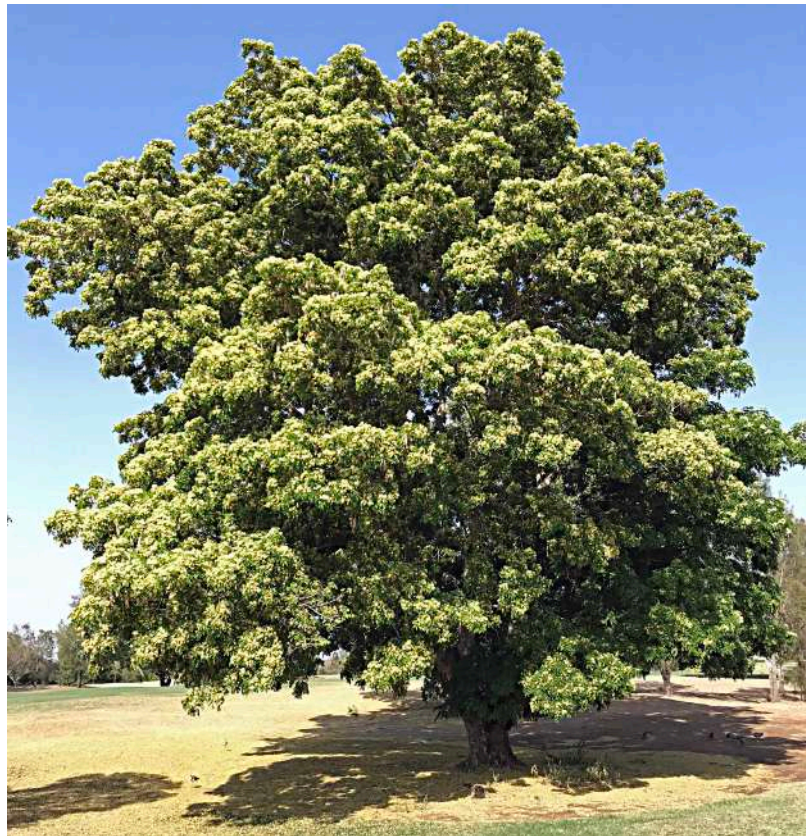
Siris Tree ( Albizzia lebbek ) An iconic flowering specimen stands on the RHS of Gold 2 men's tee-block, with flower & seed pod close-ups below.