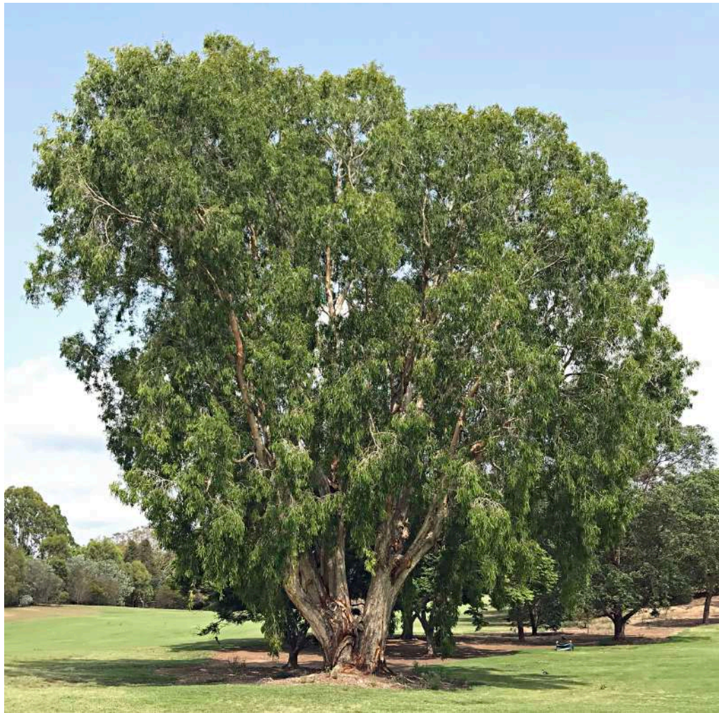
Weeping Paperbark ( Melaleuca leucodendra ) A mature specimen on the LHS Green 5 temporary green, with close-ups of bark below.