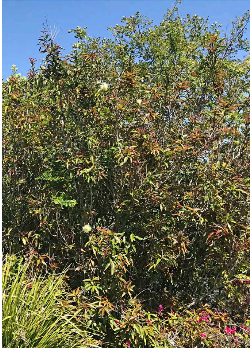
Rose Apple ( Eugenia jambos ) A small clump of trees grows on the LHS of the Red 1 men's tee-block, with flower close-up below.