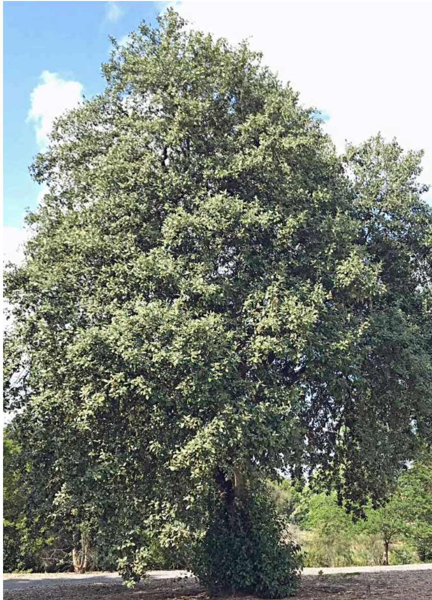
Norfolk Island Hibiscus ( Lagunaria patersonii ) This specimens grows on the RHS of the Red 7 fairway, with flower close-up below.