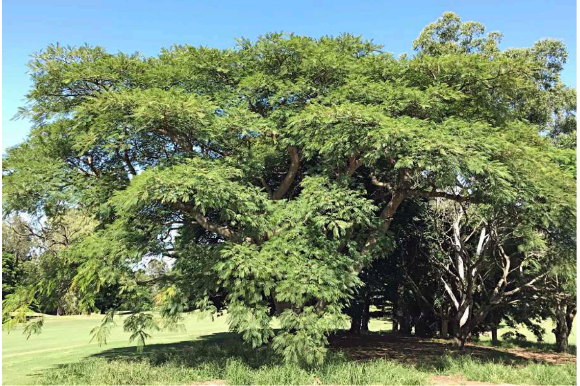
Mackay Cedar ( Falcataria toona ) A small group of large spreading trees between Blue 6 and 8 fairways, with close-ups of flowers and fruit pods below.