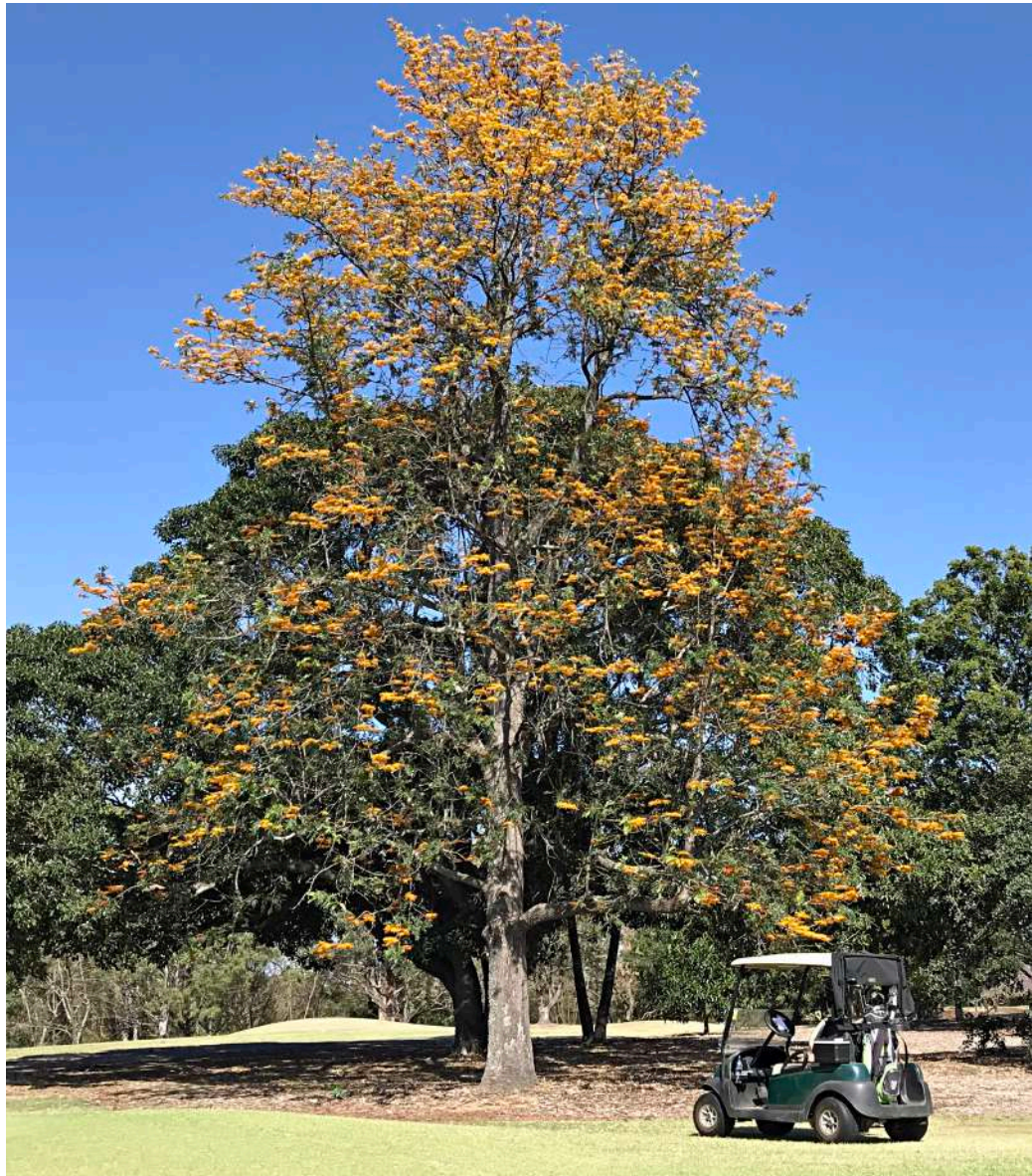
Silky Oak ( Grevillea robusta ) An iconic December-flowering specimen stands proud behind the Blue 8 green, with flower close-up below.