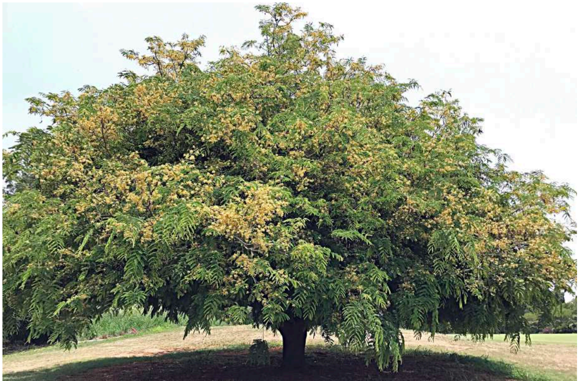
Tamarind Tree ( Tamarindus indica ) A mature specimen guards the LHS of Blue 7 green, with close-up of flowers below.