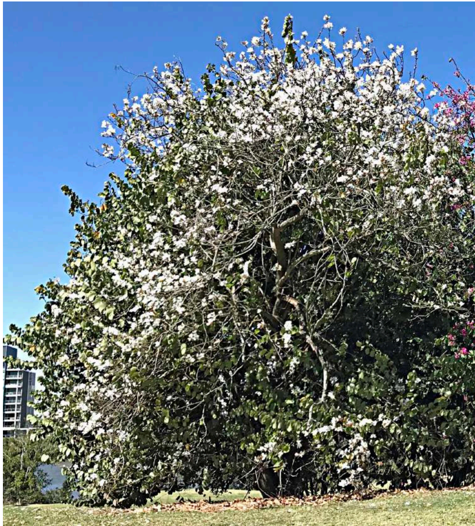
White Orchid Tree ( Bauhinia variegata candida ) A mature specimen on the RHS Blue 4, with close-up of flower below.