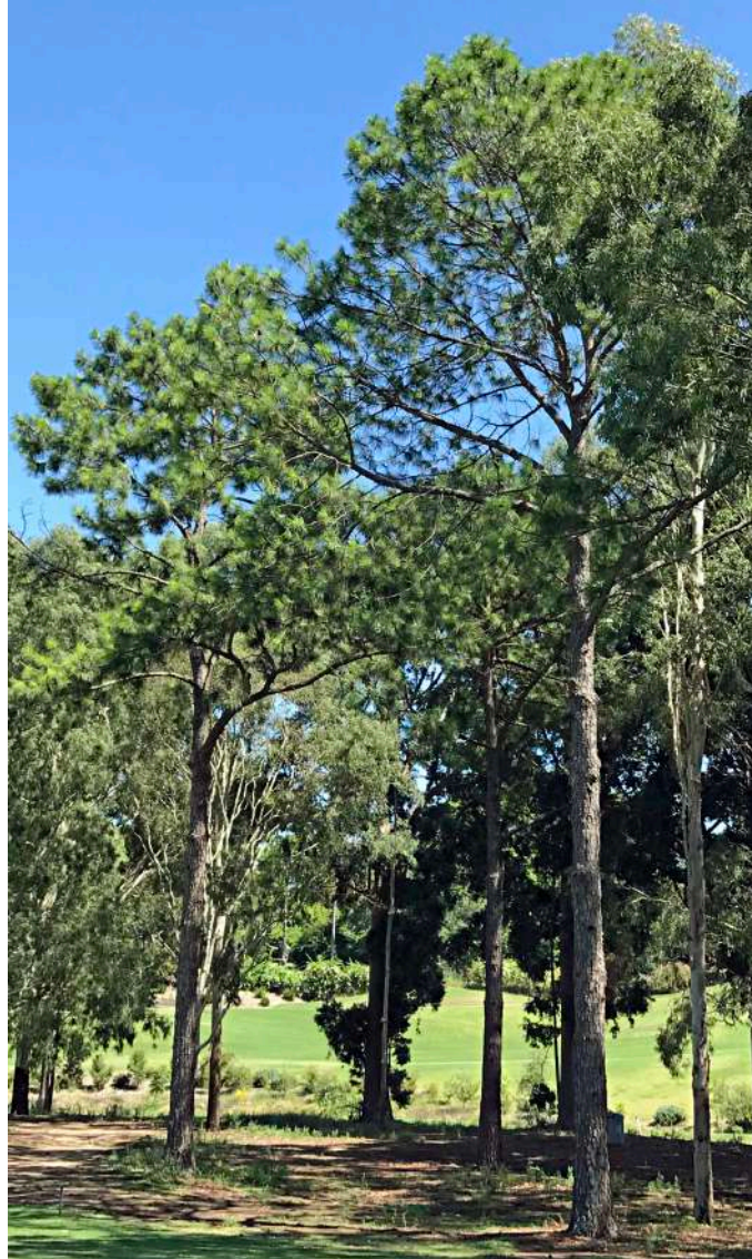
Slash Pine ( Pinus elliottii ) A small group of mature trees planted on the RHS of Red 5 fairway, near approach to green, with close-up of bark (with lichens) below.