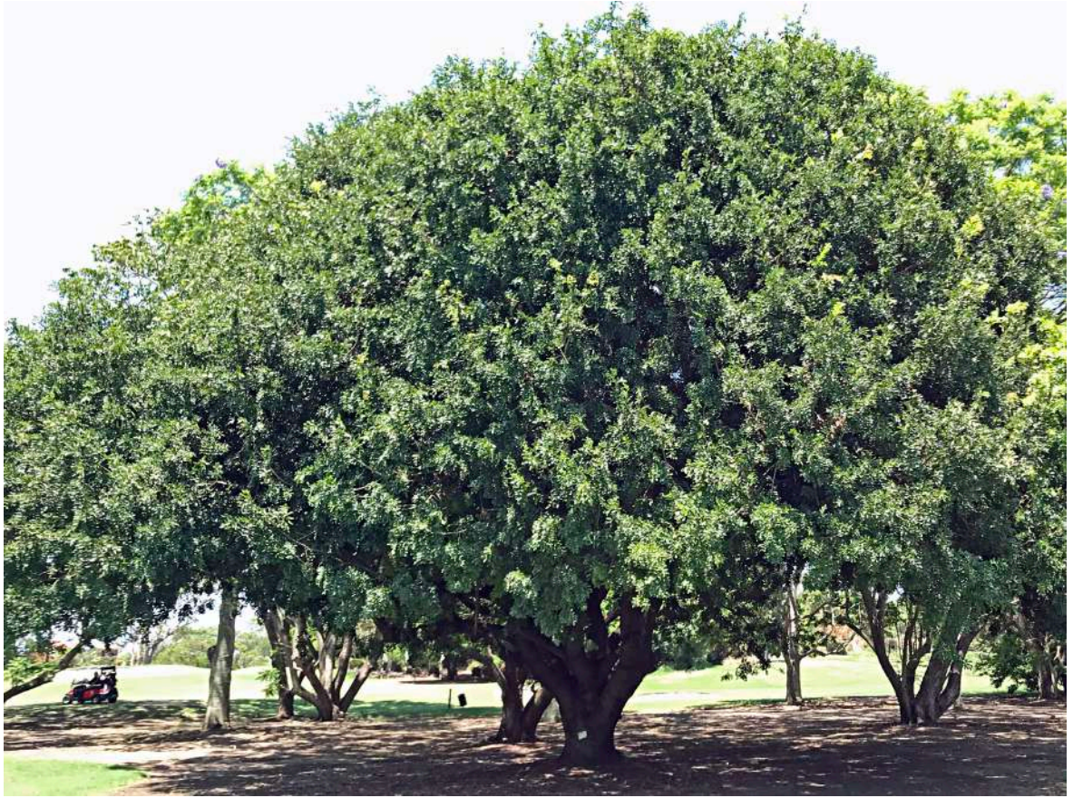
Weeping Boer Bean ( Schotia brachypetala ) A mature specimen defines the turning point on the RHS of Gold 1 fairway, with close-up of flower buds below.