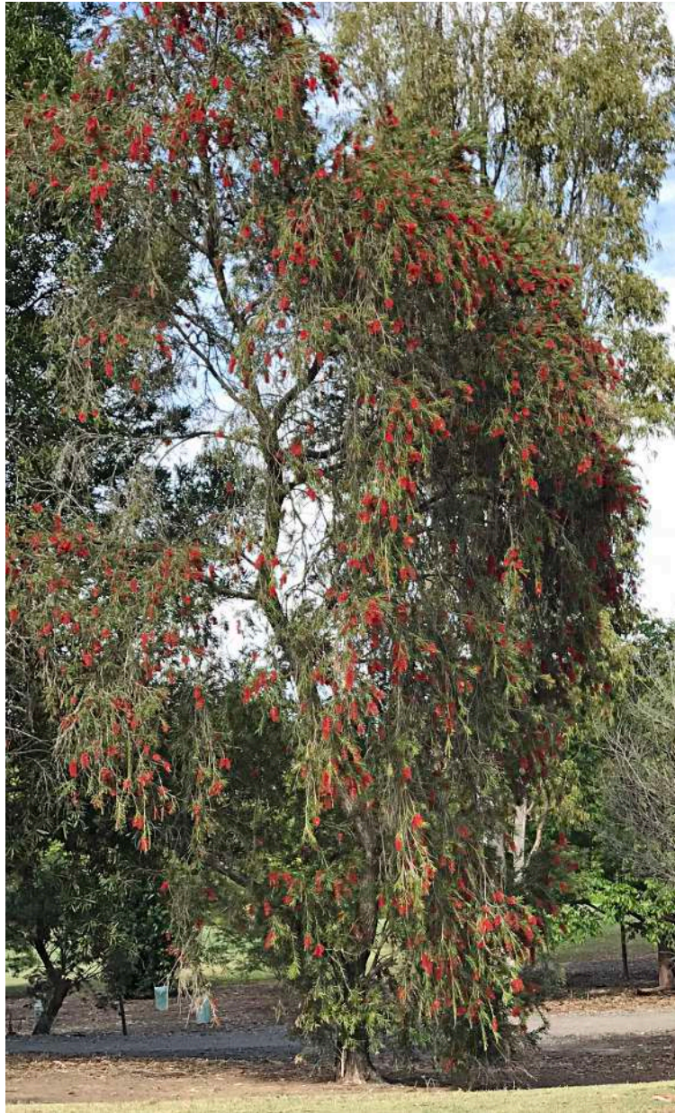
Weeping Bottlebrush ( Melaleuca viminalis ) A mature specimen on the LHS Red 1 fairway, near first bunker on left, with close-up of flowers below.