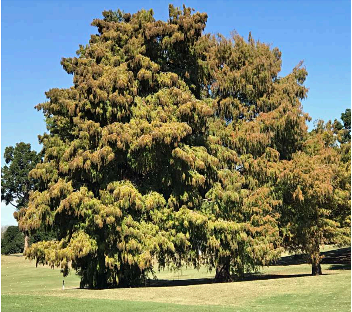
Swamp Cypress ( Taxodium distichum ) A small group of mature trees grows on the RHS of the Gold 1 fairway, with female (L) & male (R) cone close-ups below.