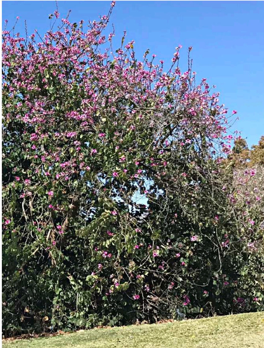
Pink Orchid Tree ( Bauhinia variegata var. purpurea ) This specimen grows on the LHS of the Blue 4 fairway, with flower close-up below.