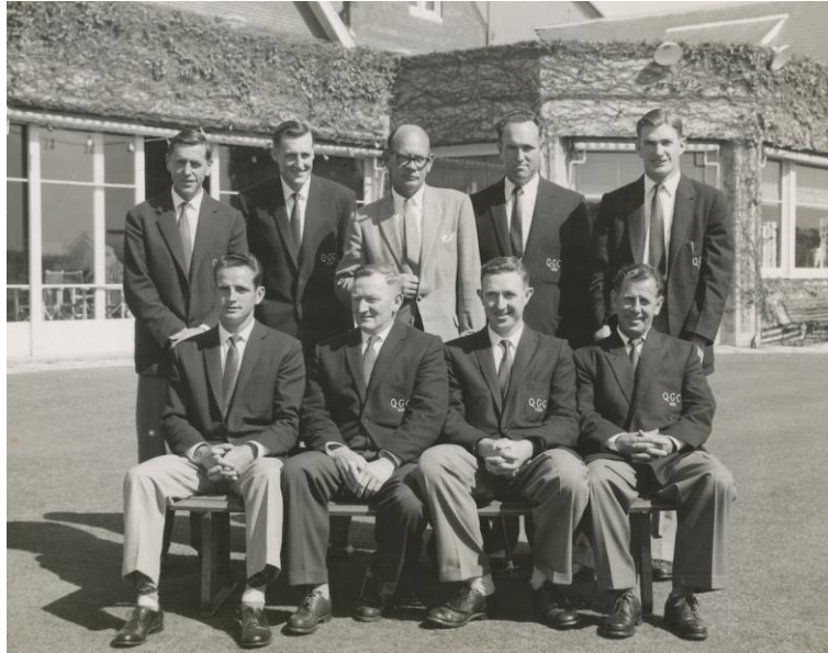
1959 Queensland team