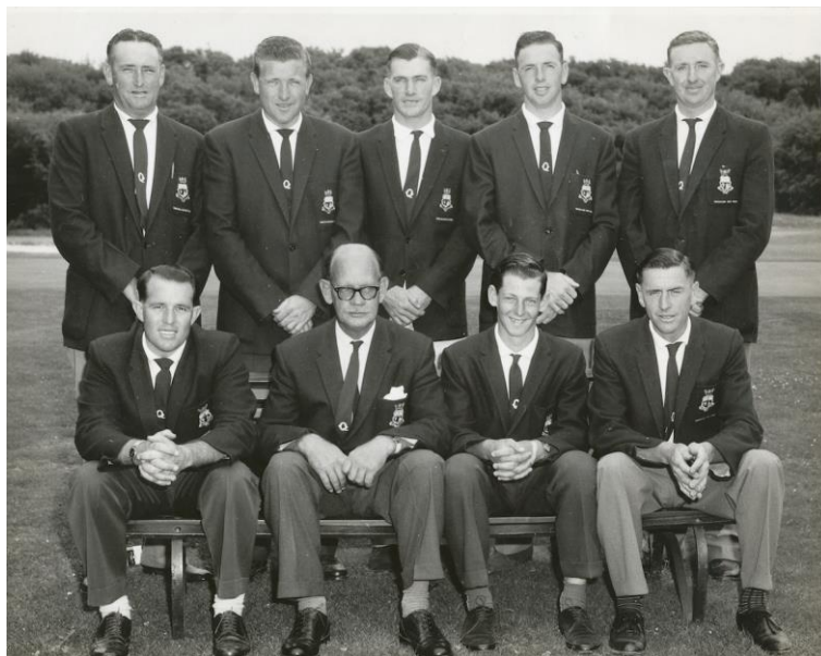
1961 Queensland team