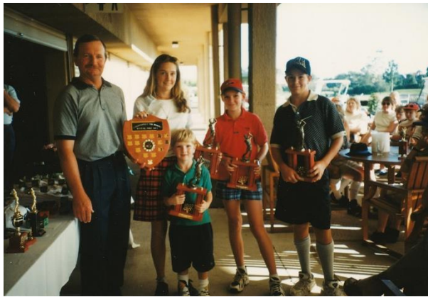
1998 Indooroopilly juniors Xmas break-up: