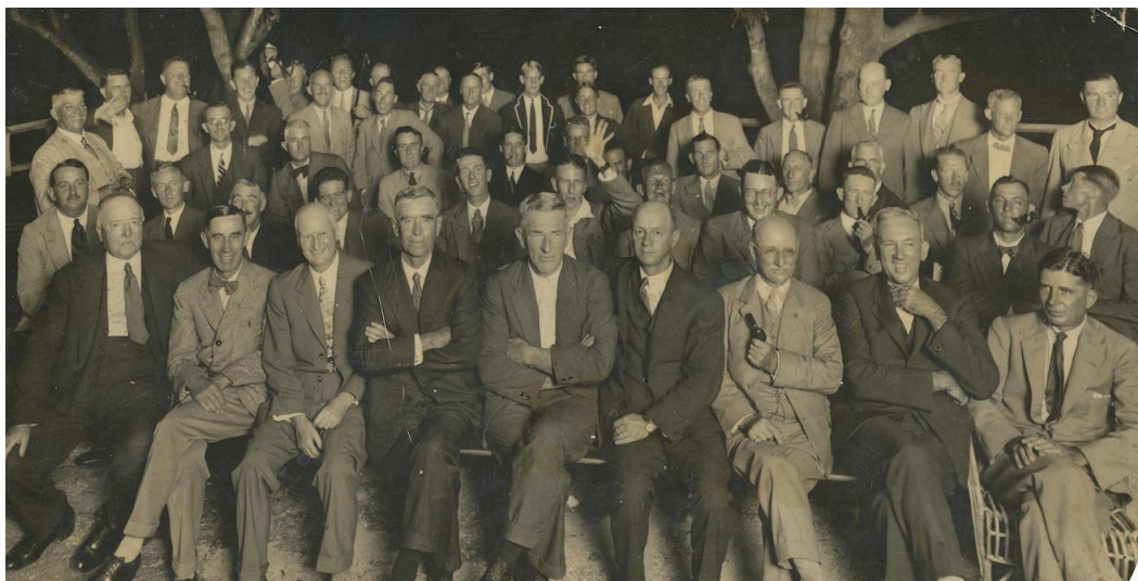
A formidable gathering of members at an early AGM – as viewed from the committee table