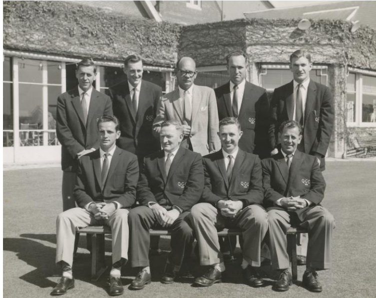
1959 Queensland team