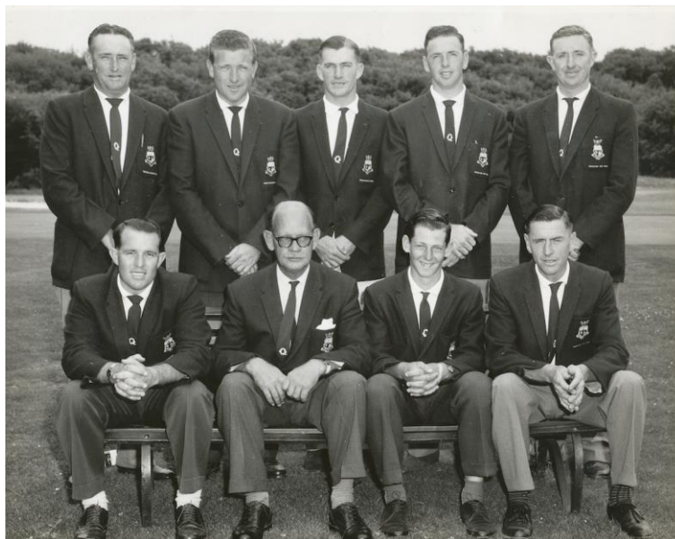
1961 Queensland team