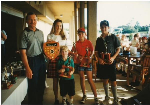
1988 Indooroopilly juniors Xmas break-up: