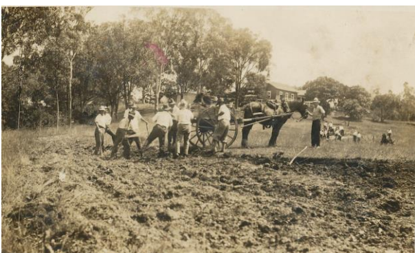
A Club working bee in their Sunday best -1926

An interesting aside is the fact that at the end of the first year the 319 members comprised 175 women and 146 men.