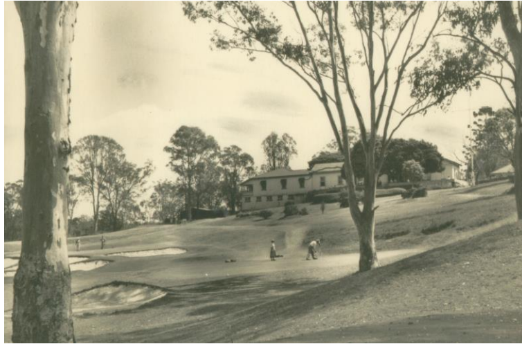
1960's photograph of the St Lucia clubhouse taken from the 10 th tee.

Plans for Moggill were shelved in 1962 when the Brisbane City Council called tenders for the lease of an area of Sir John Chandler Park at Long Pocket – only three quarters of a mile from the St Lucia clubhouse – to be developed as a sporting and recreation area. Because of its proximity the Club submitted a tender and obtained a twenty one year lease of about 180 acres.