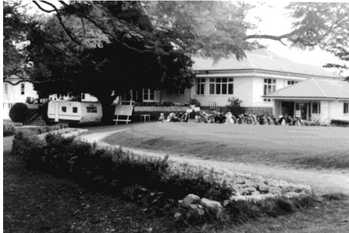
The St Lucia clubhouse and pro shop as it appeared in the 1970's

Fears that the Council was planning to resume part of the St Lucia course for road development led to members agreeing in 1973 to exchange that course and clubhouse for 200 acres of freehold land adjoining the existing Long Pocket layout. St Lucia was to become a public course under Council control and the Club would build another 18 holes at Long Pocket with a new clubhouse. It would be twelve years before the transition was made (Refer Long Pocket – The Move section).