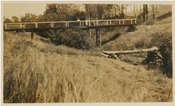
A new bridge over the third was constructed in the post war period

Ninety eight members and associates saw service during World War II with fourteen paying the supreme sacrifice. A memorial terrace to honour these people was dedicated at a moving service in December 1947.