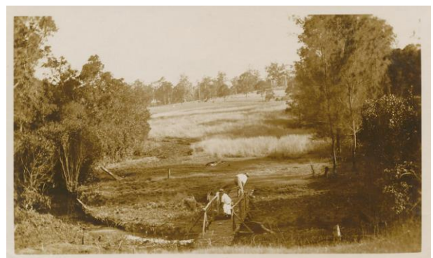
1920's working bee building bridge on the 8 th .