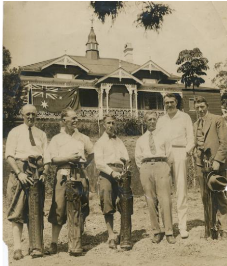
The founding fathers in front of old Morrow home