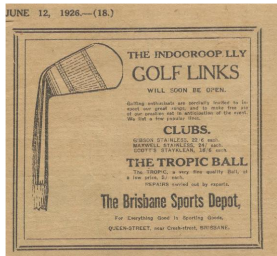
A cutting from early newspaper announcing the opening of the Indooroopilly Golf Links

On Saturday 3 July 1926 the first nine holes were opened by the Premier of Queensland, the Hon. W McCormick. Celebrations continued well into the night, with members bringing their own gas lamps to light up the clubhouse after dark.