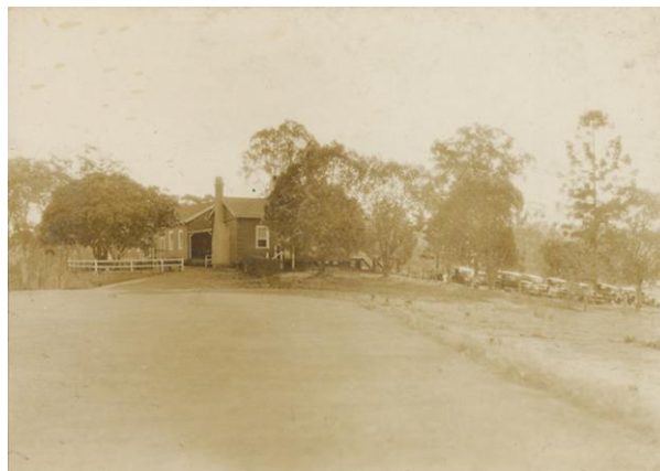
The first clubhouse and car park

On Saturday 3 July 1926 the first nine holes were opened by the Premier of Queensland, the Hon. W McCormick. Celebrations continued well into the night, with members bringing their own gas lamps to light up the clubhouse after dark.