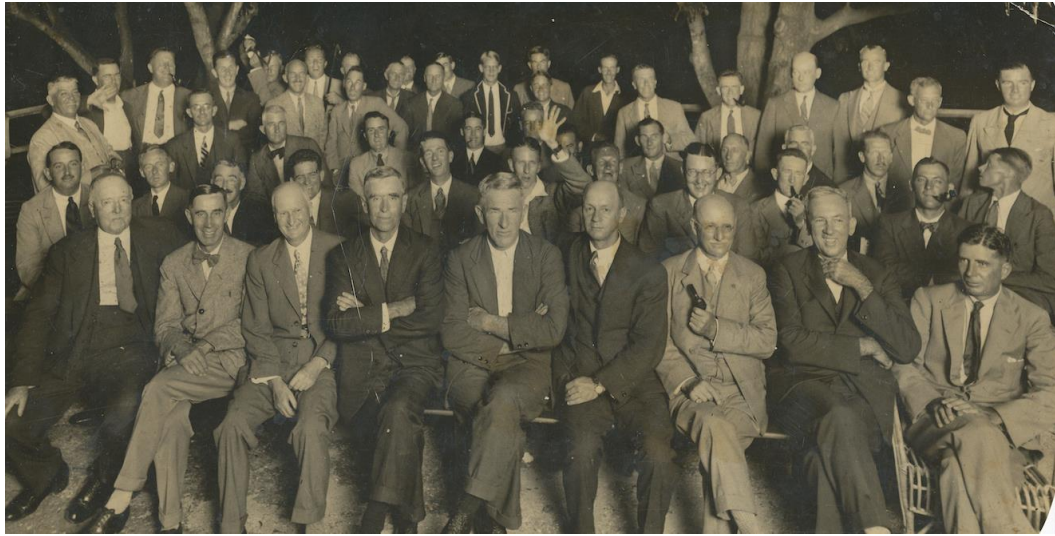
A formidable gathering of members at an early AGM – as viewed from the committee table