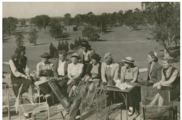
Another meeting of players and delegates at the same tournament