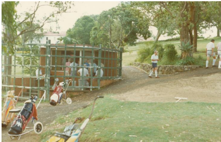
Half-way house at St Lucia – a welcome stop for refreshments