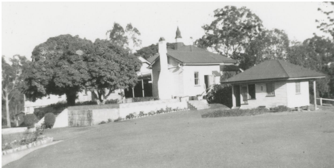
The St Lucia clubhouse and pro shop as it was in the 1930's