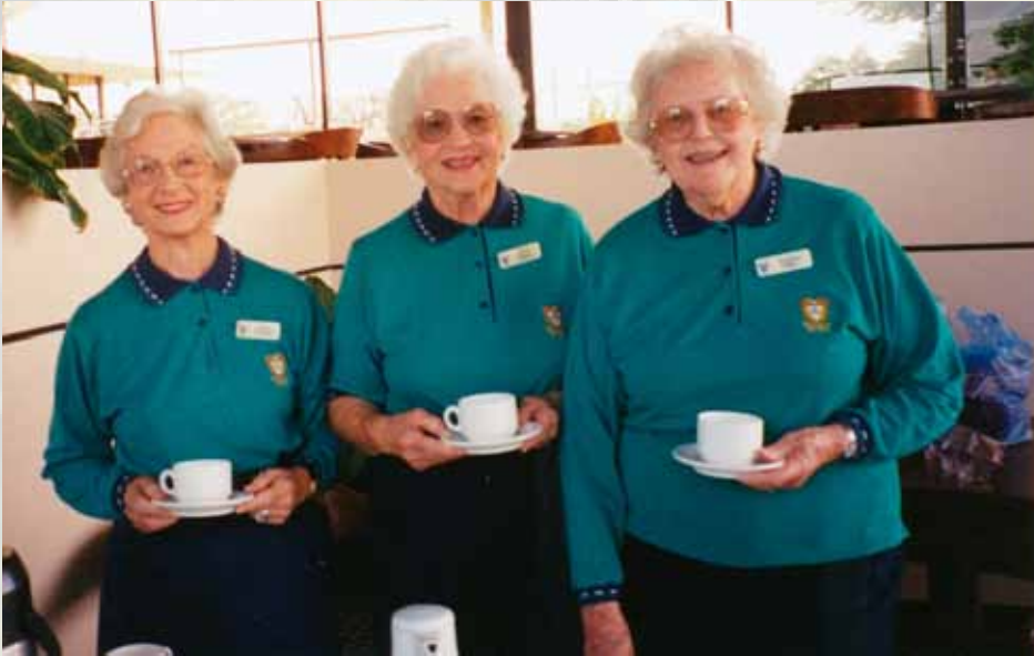
Tea ladies in 2003 -

Our morning tea hostesses have dispensed tea with a warm welcome to visitors on ladies invitation and pennant days for many years.