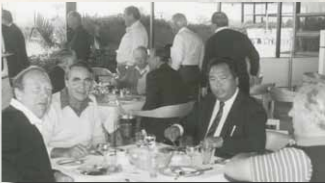
1987 Pymble visit to Indooroopilly

One of our oldest reciprocal clubs, Pymble Golf Club in Sydney, has had bonds with Indooroopilly back as far as 1951. Since 1979 the two clubs have exchanged visits and many members have enjoyed the camaraderie of these annual get-togethers.