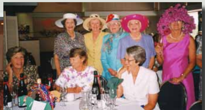
1998 Melbourne Cup lunch.