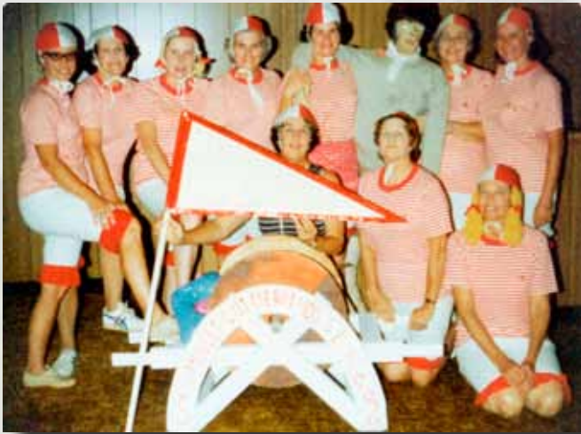
1970s concert - The Mullet Gut Mermaids

The ladies' concerts are legendary and a selection appears below: