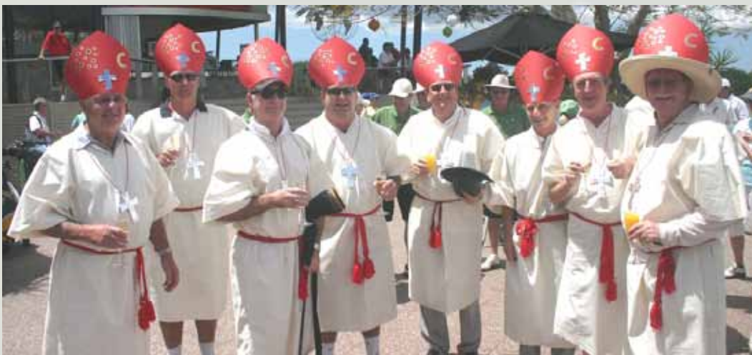
The "Holy See" team believes it has a divine right to win.

The inaugural Presidents Cup was held in 2009. 256 players in 32 teams represented their country or State of origin in medley competition.