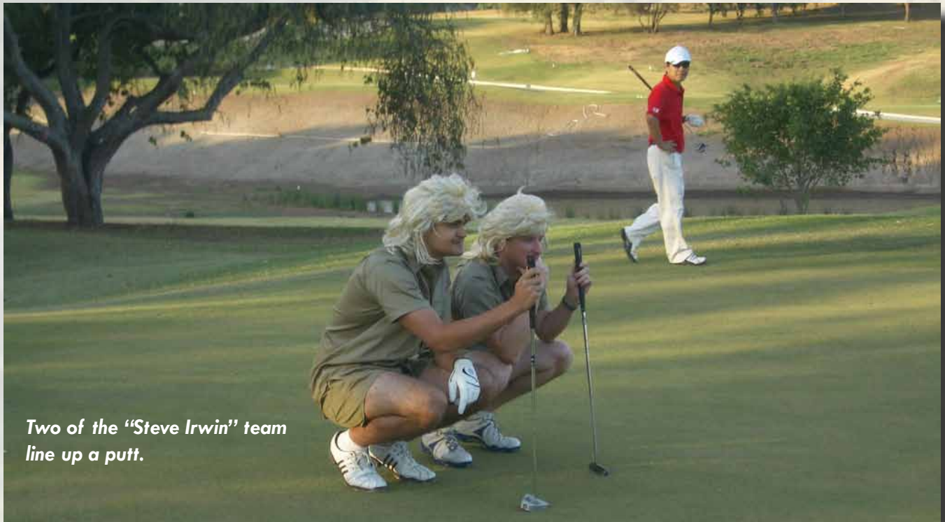
Two of the "Steve Irwin" team line up a putt.