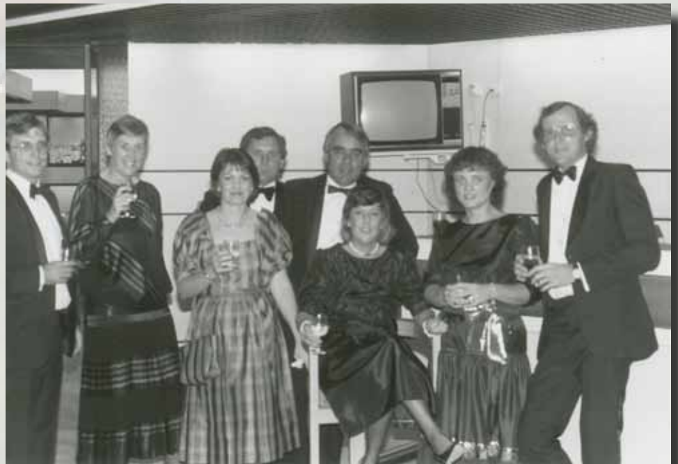
Guests enjoy a pre-dinner drink