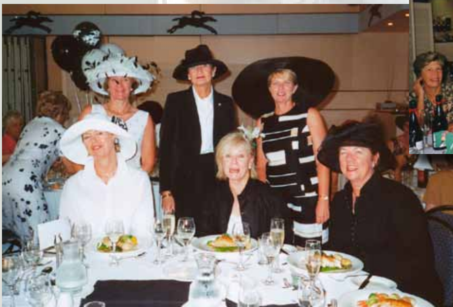
Social Committee – 2002 Melbourne Cup lunch.

The ladies Social Committee were responsible for wonderful Melbourne Cup parties at the Club for many years.