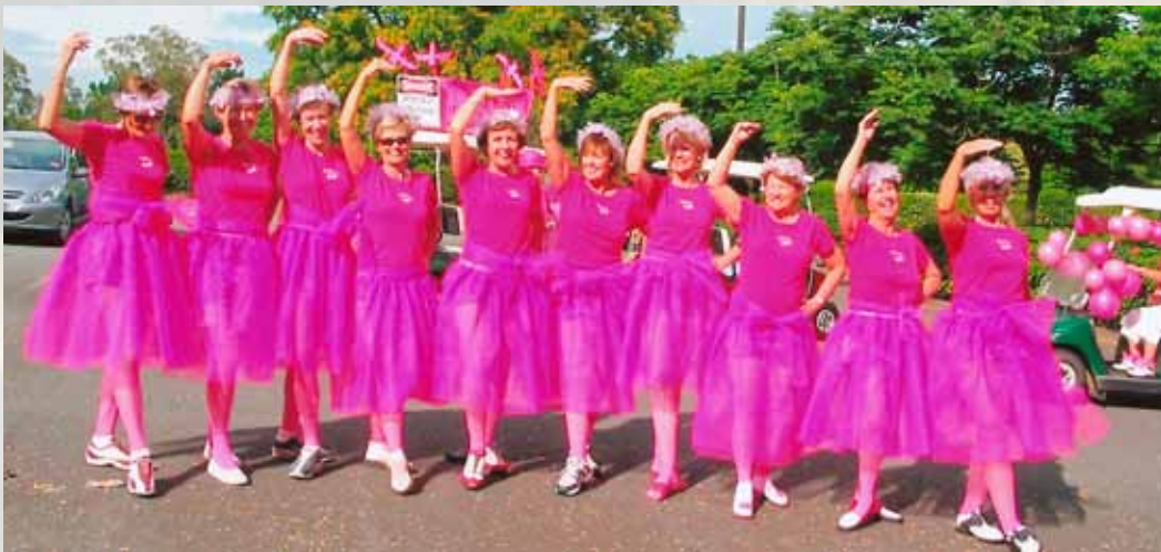
2005 Fun Day "In the Pink" theme - Corps de Ballet (Social Committee).