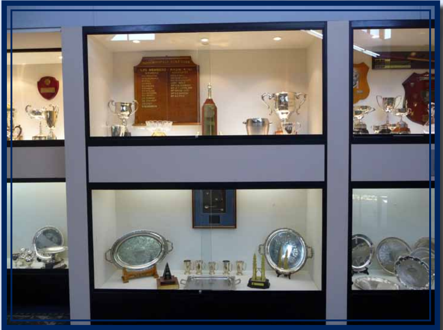
Indooroopilly Golf Club trophy cabinet

The trophy cabinet houses a wonderful array of silverware.