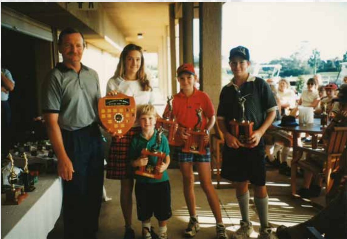
1998 Indooroopilly juniors Xmas break-up: