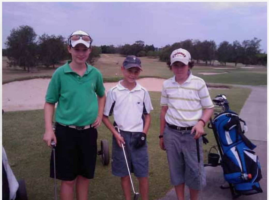
Sunday morning junior competition at Indooroopilly in 2009